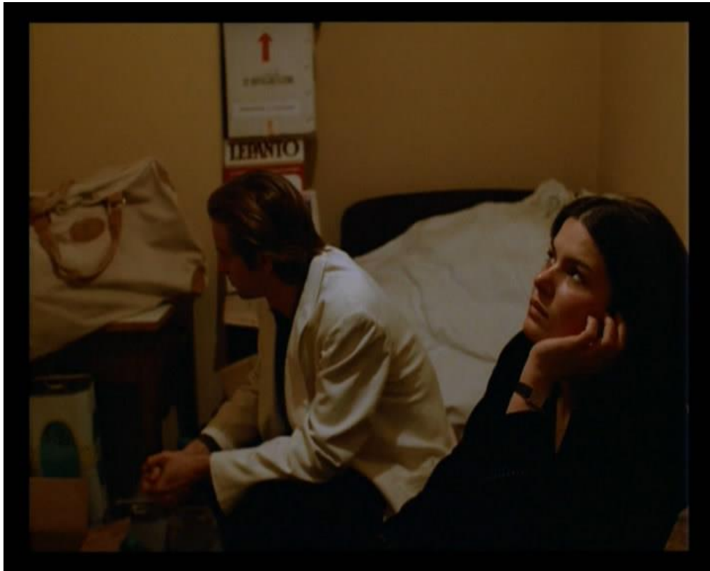
Figure 92: Schmidt and Mäxchen contemplating their actions.

The above shot is accompanied by the sound of a dripping tap, emphasising how run-down their surroundings are and adding to the uncomfortable, desolate atmosphere. Their confinement and unhappy emotions connected to their actions as a couple are also emphasised by the next few shots of barred windows, including one in which Schmidt looks out the window. The focus on his face fades to that of a pigeon on a ledge, who may be able to fly away, unlike Schmidt who is trapped in the room with Mäxchen. Figure 93; Figure 94; Figure 95: