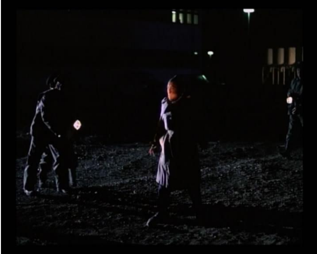
Figure 41: Rieche's face is illuminated when he is caught.

This shot then cuts to a close up of his face, which is covered and partially obscured with a skin-coloured stocking. Figure 42: