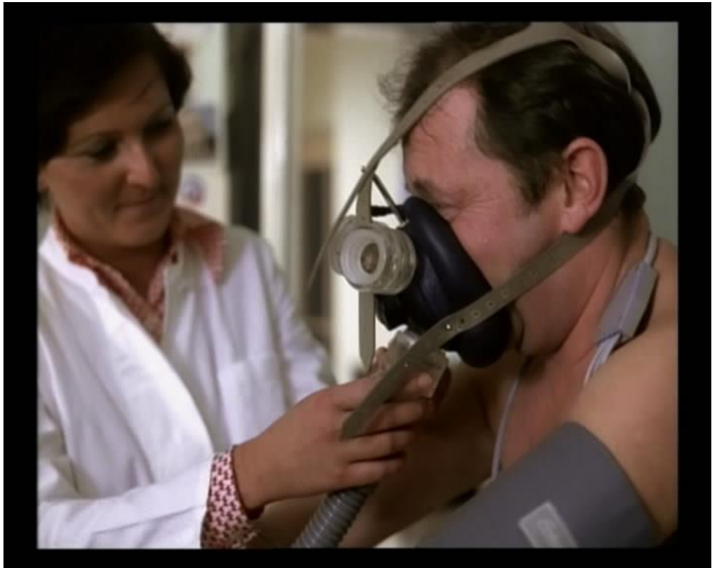
Figure 33: Rieche and his technological appendages, helped by the female doctor.

When the doctor gives Rieche his results, he replies and his voice is metallic and distorted, emphasising his robot-like depiction and suggesting a fusion of human and machine. Even though Rieche is outwardly male, the cyborg-like depiction of his body in this scene makes him into a figure that would be more associated with bodies that are unstable in terms of gender. As explained in my introductory section, Haraway's theorisation of this figure is one that is representative of a character both beyond gender binaries and representative of gender fluidity. His cyborg-like representation in this scene thereby suggests a problematisation of gender boundaries, rather than the simplistic reflection of gender as fixed to biologically stable, gendered bodies.