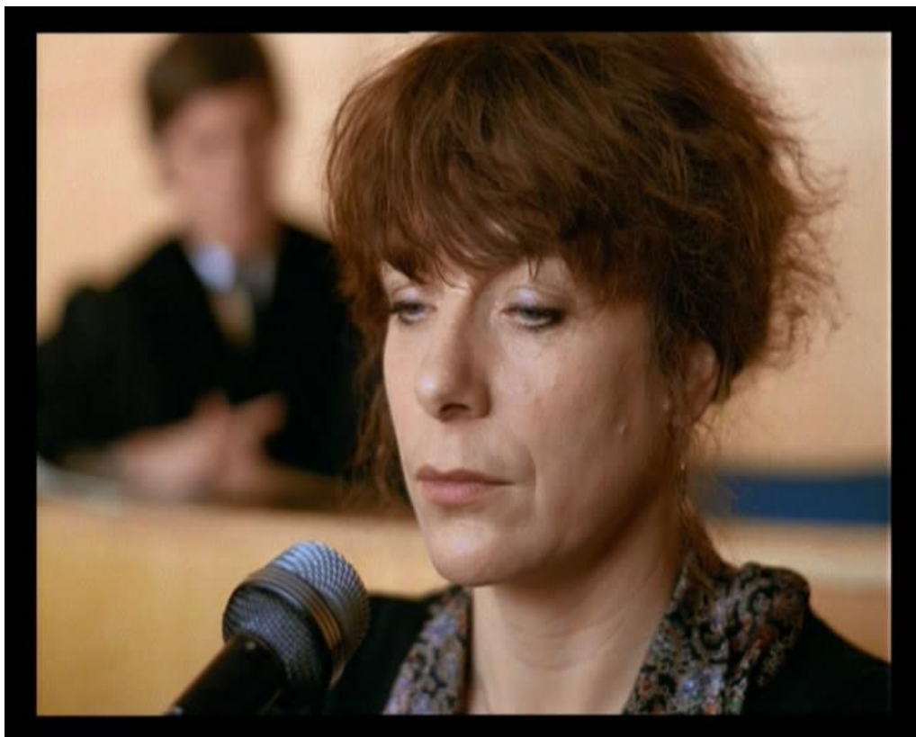
Figure 75: The accused woman's lack of reaction.

At first, it is the woman being questioned who is granted screen time, as the judge's words overlay her impassive face. Figure 75: