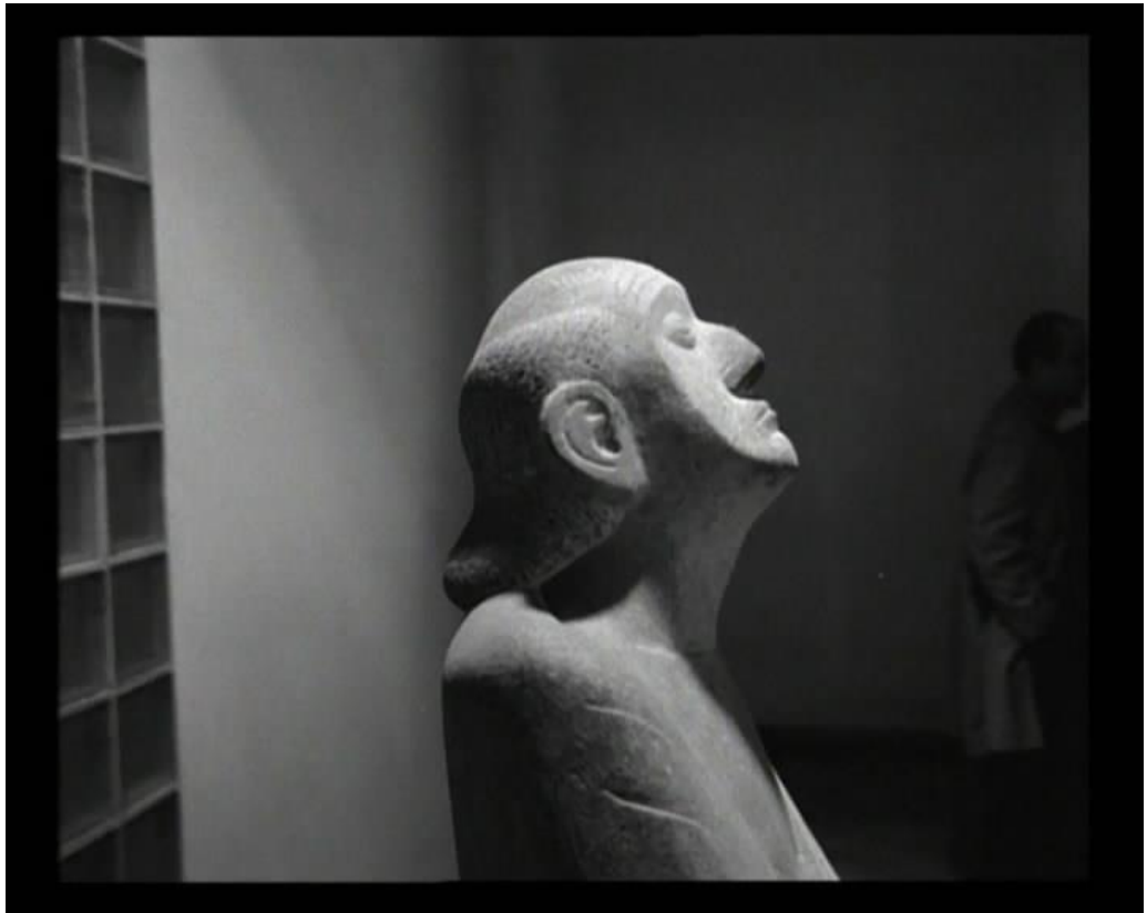
Figure 15: The first male statue.

Academia is presented as a masculine arena of authority. In the university building, the audience sees sculptures which emphasise a masculine space. Figure 15; Figure 16: