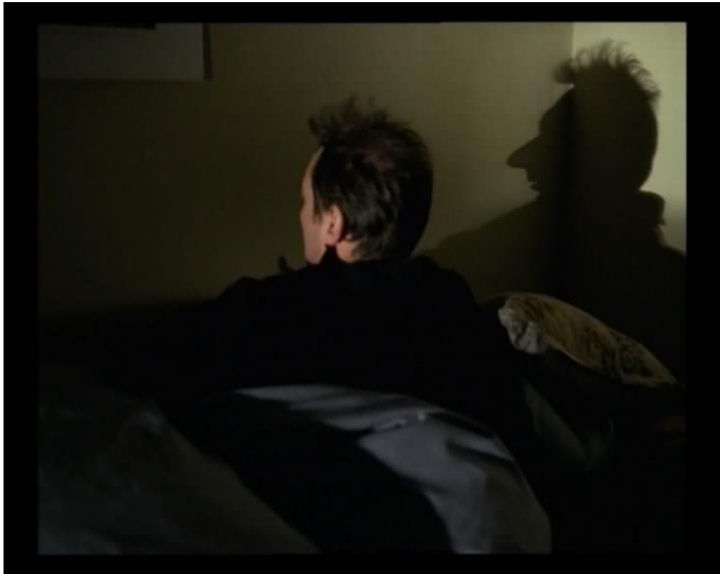
Figure 49: Rieche's grotesque shadow.

He then covers his head with a pillow and goes back to sleep. His body, as represented by the shadow as seen in Figure 49 above, with its distorted and elongated form, is clearly made to seem monstrous.