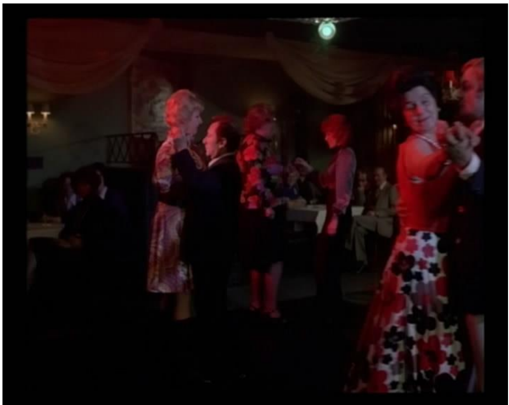
Figure 66: Rieche and the hairdresser's height difference.

Rieche's physicality puts him in a position normally occupied by a female- the couple to the right appear to be more in line with traditional notions of male/female body types. His