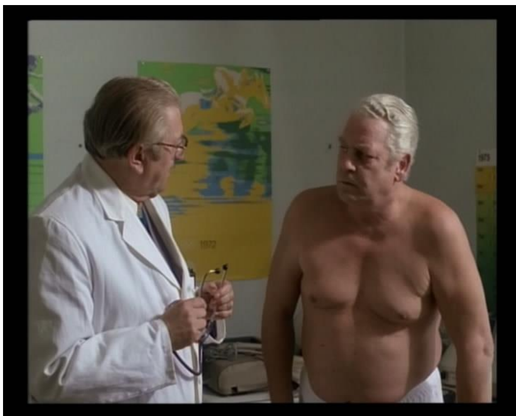
Figure 30: The feminised body of Herr Grün.

The fact that he is naked while the doctor is clothed also emphasises his vulnerability, further feminising him on a bodily level. Clearly, Grün's job is in danger, as he says that if he were to be replaced in this position, 'Das überlebe ich nicht'. This dialogue can be read in gendered terms. What one cannot see in this sequence, but can in the rest of the film, is that the only area in which only men are employed within the factory is the upper executive levels. There are women on the factory floor, in secretarial roles and evidently, as shown within these scenes, as medical professionals, but none of the factory directors are female. For Grün, the loss of his job in a traditionally hegemonically male and executive area, and one that is evidently all male in this film's context, is a threat to his masculinity. As this potential job loss is due to his aging, his body could also be interpreted as having betrayed him through its disintegration. If we adopt the discursive framework suggested by Braidotti and Grosz, who point to the ways in which feminine bodies are