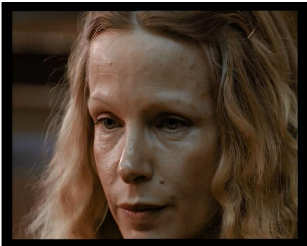
Figure 77: The rape victim's neutral expression while discussing her emotional state.

The rape victim's discussion with the female judge could be interpreted as a comment on the situation between men and women who are in conventional, normative relationships. The woman states that the feelings which were caused by the end of her romantic relationship were worse than those which she experienced when she was raped. This statement could be taken as an indictment of normative, heterosexual relationships. Kluge appears to be saying that the emotional pain caused by this apparently conventional relationship was worse than any physical pain the woman could have experienced through the act of rape. He therefore appears to be showing an extremely negative view of normative, romantic, heterosexual relationships between men and women.