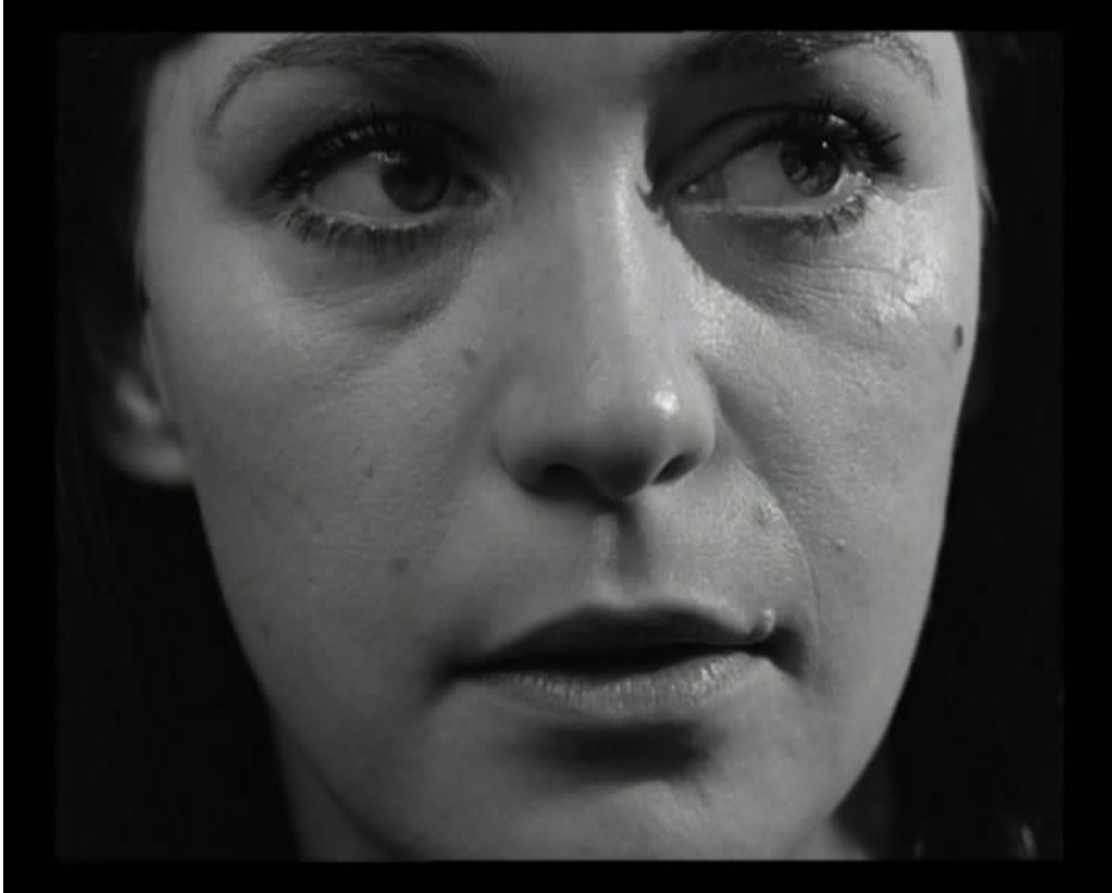
Figure 13: Anita's face being shown instead of her giving birth.

The above image is not accompanied by any sounds of her giving birth, such as her cries, or those of a baby. Instead, the only voice heard is that of the midwife, instructing her to push 'fester'. Kluge then cuts immediately to Anita destroying her prison cell. Figure 14: