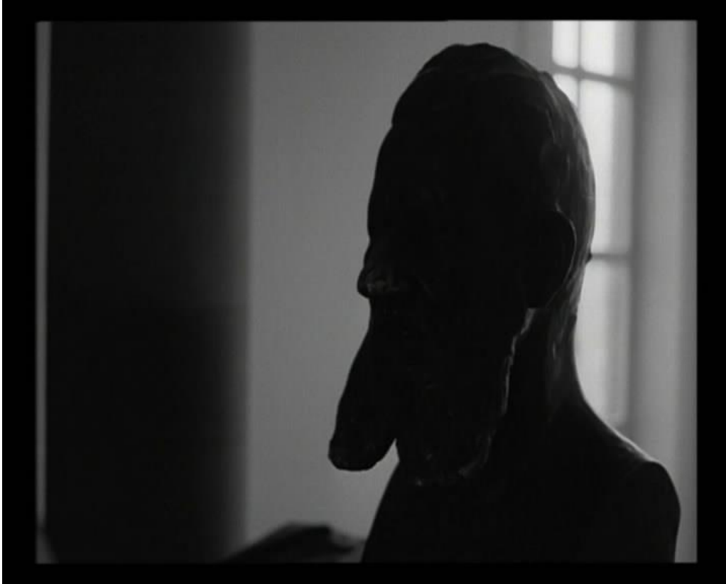
Figure 16: The second male statue. Even in low lighting it is clear this is a male silhouette.

Although there is a mixture of both men and women present at the lectures that Anita attends, every one of these lectures is given by a man. There are no female voices of authority present. It is men who control the use of words here and who produce academic discourse, which can only be understood by other academics and capable male students: when the lecture attendees are shown leaving, only male students are shown discussing the lecture, even though there was a mixed-gender group present. Figure 17: