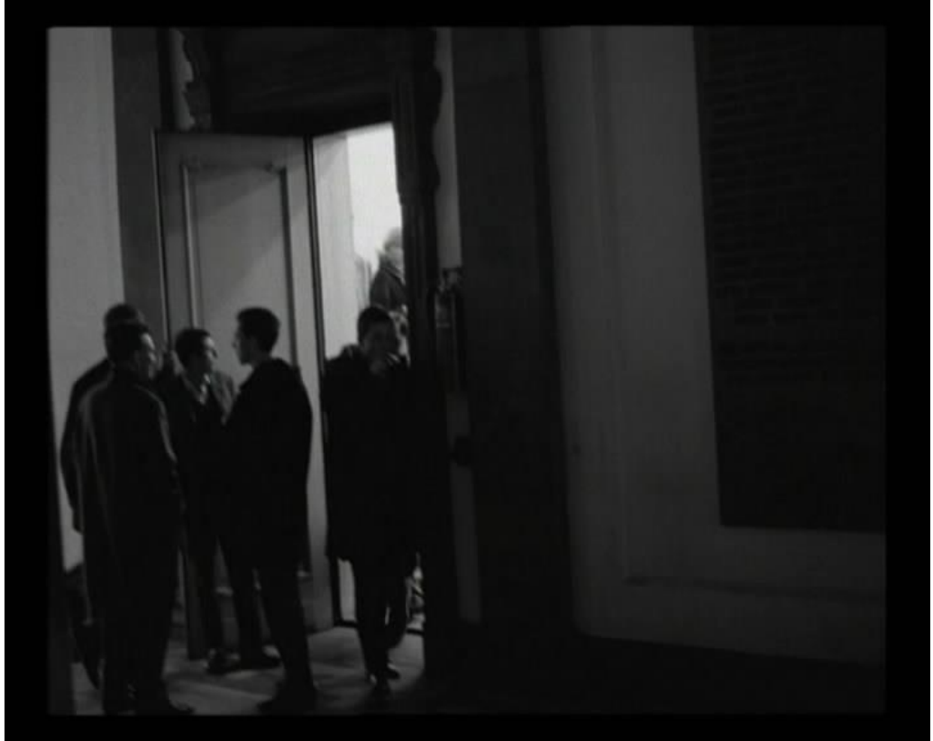
Figure 17: Male students discussing the lecture.

This shot immediately cuts to yet another all-male group of academics in their formal dress, which marks their authority and indicates the highest level of academic achievement. Figure 18: