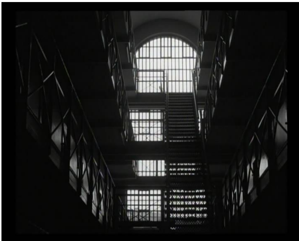
Figure 9: The prison environment, and finally to...