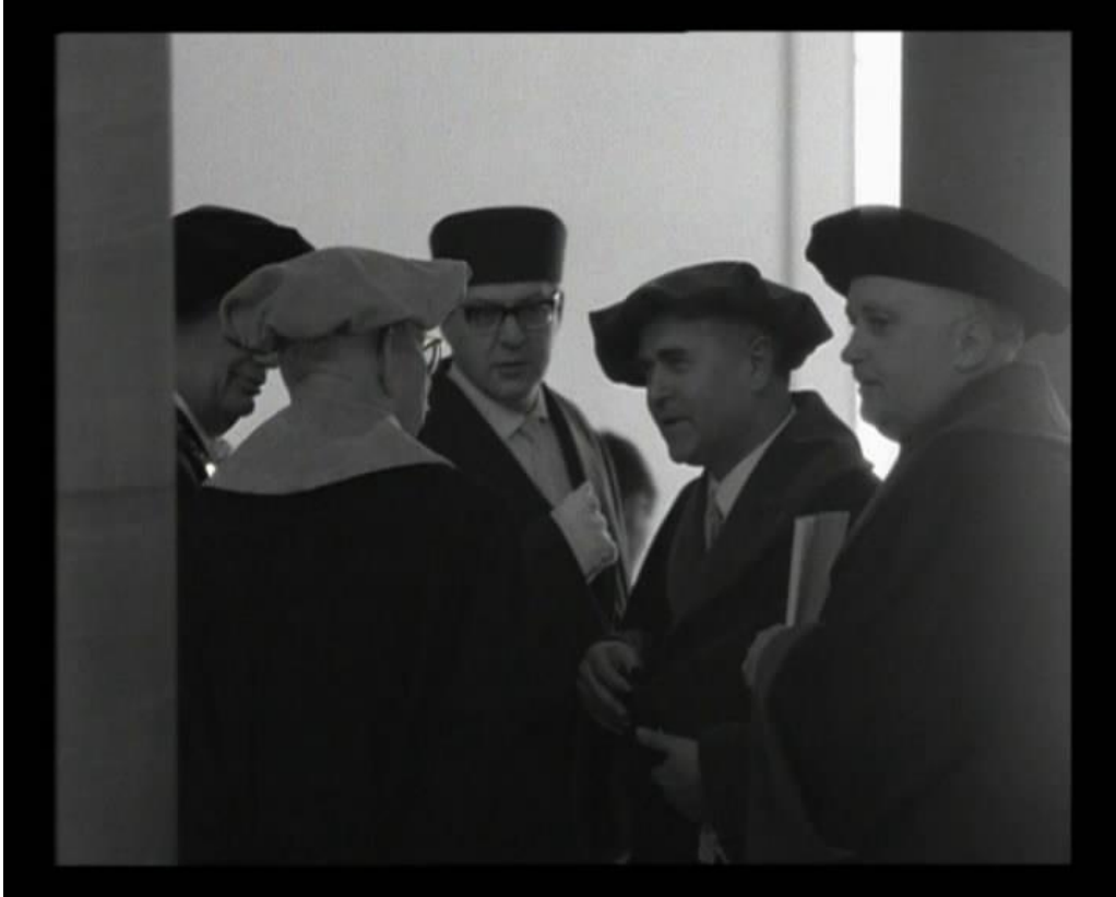
Figure 18: Academic men discussing their own lectures.

After the lecture, Kluge shows Anita falling asleep alone in a lecture theatre. He then cuts to a dream sequence. In contrast to the masculine academic setting she is currently in, this dream sequence shows a sped-up scene of both men and women engaging in dialogue in a cafe. Figure 19: