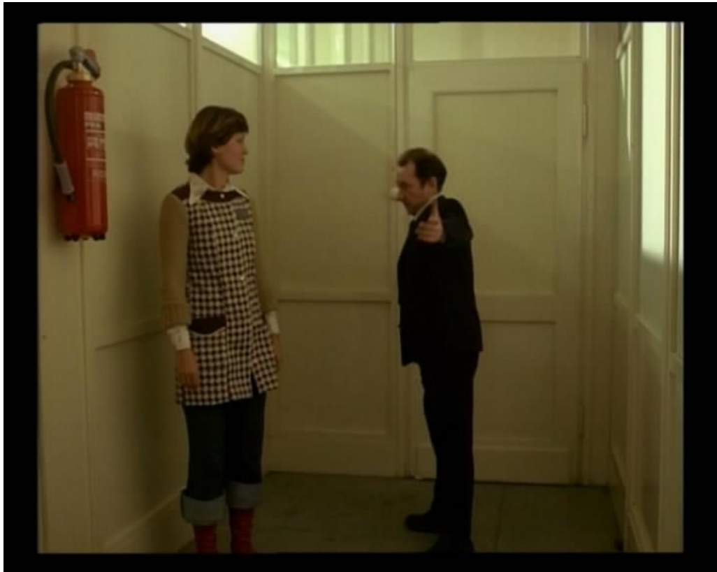
Figure 48: Rieche and the taller female worker.

This height difference is perhaps also why, when the worker sits down at his desk, there is a visible moment of surprise when she makes contact with the seat - it is lower than she had expected, putting her physically on his level. This moment emphasises their height difference, despite the fact that by being sat across a desk from each other, the implicit differences in professional authority and traditional gender roles is also underlined. It is also notable that in Kluge's voiceover, she is referred to as 'eine wegen Werkdiebstahls verdächtige Person', emphasising gender neutrality. Rather than being 'eine Frau', she is 'eine [...] Person'. Her gender becomes an issue later when her urine tests positive for pregnancy, but at this point, it is not, perhaps allowing her to be read as gender neutral. While she may not yet be specifically masculinised in her depiction, she is certainly not over-feminised, as her gender neutrality is rather emphasised.