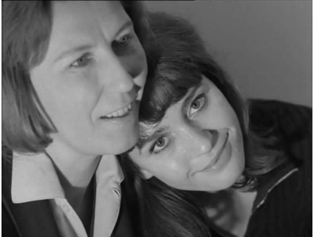
Figure 4: The female parole officer depicted as a mother figure, with Anita as her daughter.

The parole officer is indeed given the symbolic role of 'mother', and is then able to subvert the patriarchal priest, as already noted, in the subsequent scene. This scene can be interpreted as saying that female characters and even those who are portrayed like mothers can subvert patriarchy, thereby resisting its power. This point remains, despite the fact that to be a mother could be seen as a stereotypically traditional female role. There appears to be an undermining of stereotypes concerning motherhood as a refuge for traditional forms of femininity. In this film, even those who are symbolic mothers in his terms are able to subvert patriarchal authority, rather than this role forcing them to uphold stereotypical gender roles.