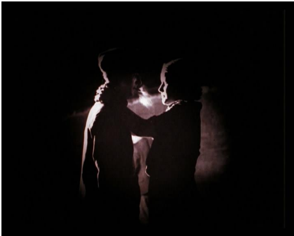
Figure 78: The couple.

In the very first section of the film, Kluge uses a song with fatalistic lyrics over images of a river bank flanked by high-rise buildings, followed by a sequence of images of a fortune teller, and then of a couple. The song's lyrics, from Dajos Bela's 'Einmal sagt man sich adieu' tell of an unhappy end of a relationship. Figure 78: