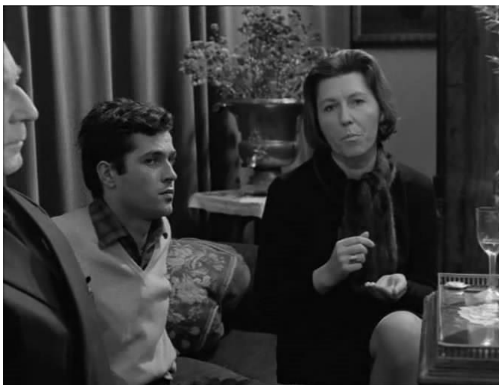
Figure 3: The probation officer addresses the viewer.

The possibility of the subversion of patriarchal authority through words is explored here. The female parole officer is able to take the anecdote of the male priest and make it into her own, more important, speech. Her speech is portrayed by Kluge as more significant as