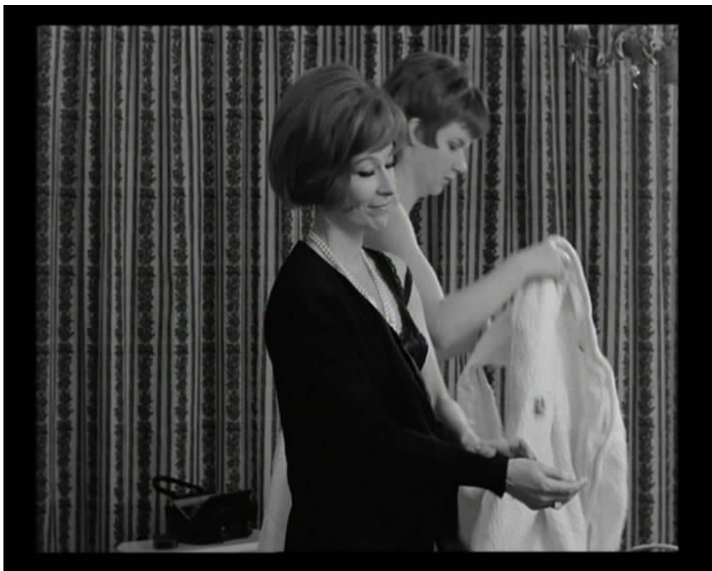
Figure 26: Frau Pichota's first, simple dress.

When discussing how she will re-integrate into Pichota's life after the end of his affair with Anita, Frau Pichota says that she will suddenly re-appear on the scene, after her absence is noted by other men whom Pichota works with. While she says this, Frau Pichota is getting changed from wearing a simple black long-sleeved dress into a highly elaborate beaded evening gown. Figure 26, Figure 27: