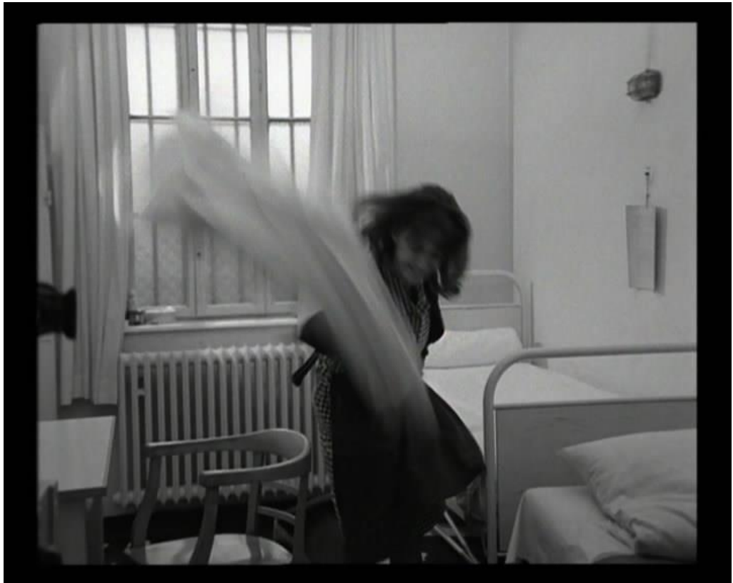
Figure 14: Anita destroying her prison cell.

The midwife then restrains her. Anita is shown to be so restricted when in prison, that she is not even allowed to make any noise during childbirth, or react in a way that a woman would naturally expect to, as childbirth is self-evidently an extremely painful and stressful event. On the contrary, Kluge contrasts the voice and words of her midwife with Anita's impassive image. This combination of image and sound suggests that Anita is unable to offer resistance to being utterly controlled by this restrictive environment, one that is representative of patriarchal authority. The audience's expectations of a traditional birth scene are interrupted, and instead this partial or non-birth scene provides an opportunity for the viewer's sympathy to be engaged for a woman who is allowed no control over her own life. By cutting immediately from this non-birth scene to Anita destroying her cell and then being restrained, Kluge implies that her unhappiness and anger has been channelled into aggressive action. The camera during this scene moves from close-ups to mid-shots, and also in and out of focus, emphasising the turbulence in Anita's mind and her lack of