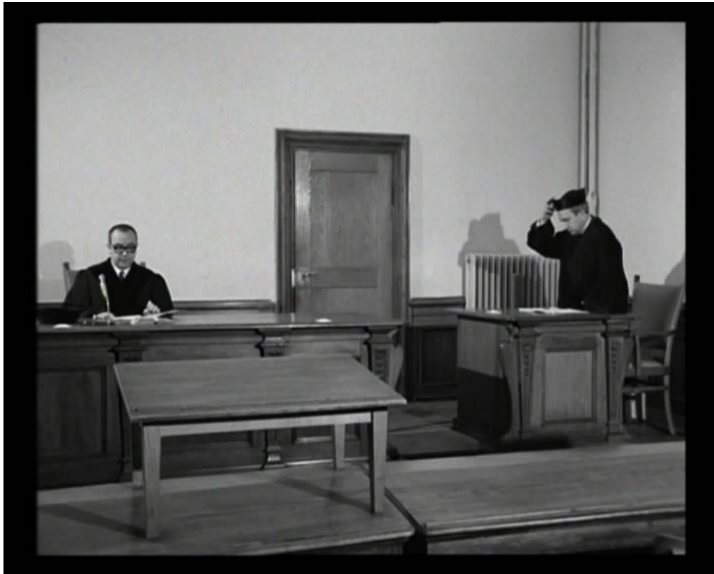
Figure 8: The courtroom, from which Kluge cuts immediately to...