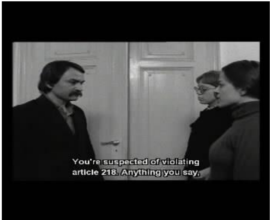
Figure 1: Female police officers arresting Herr Bronski.

It is also notable that the officers who arrest Roswitha's husband on the charge of the violation of paragraph 218 are women. Figure 1: