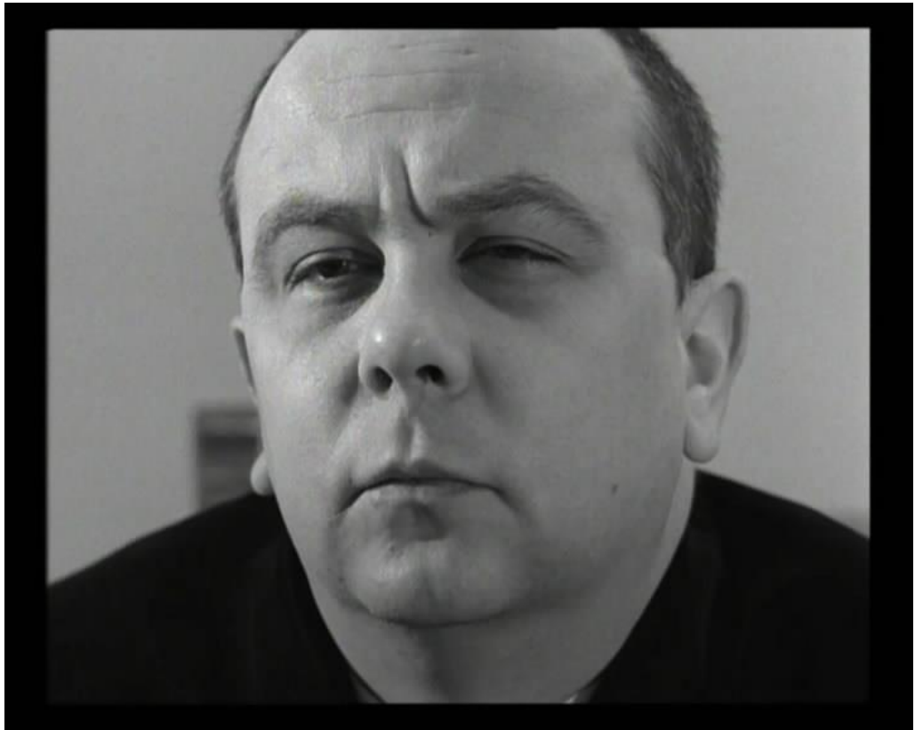
Figure 7: The sceptical judge.

This shot, like the previous shot of the back of the judge's head, is not consistently linked with the dialogue being spoken, and it serves to interrupt the audience's listening to the words being used in the scene. The judge's mouth is closed, but his line of questioning continues in the audio level alone. This interruption of the expected relationship between words and their speaker (it would be expected that the judge's mouth would move in time with the words being spoken, but this expectation is not met) highlights the way that legal discourse is being used by the judge to establish his power over Anita. This disconnect serves to draw attention to the dialogue with which the judge is attempting to discursively control her. He then attempts to construct his own narrative for Anita's actions by asking if she felt guilty about the stolen jacket, that she must have felt some 'innere Hemmungen'. She replies that something just came over her. This explanation does not satisfy the judge, who says 'Das ist nicht abschließend festzustellen'. The verbal explanation of Anita's