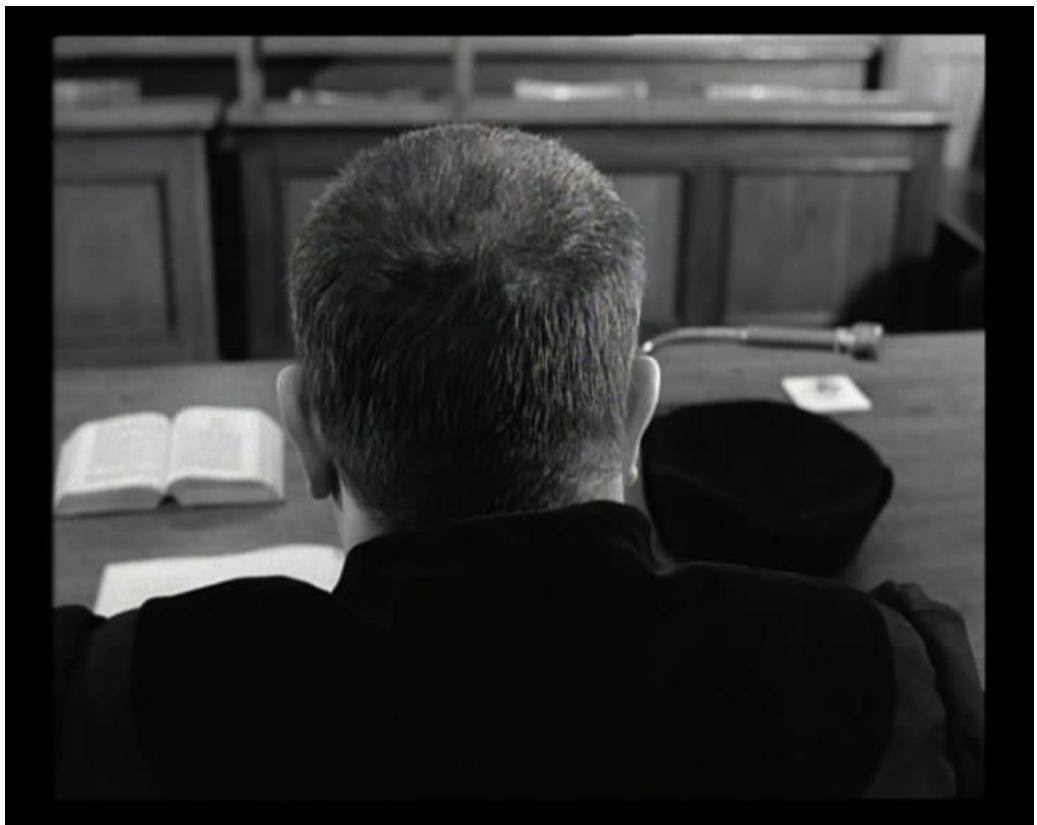
Figure 5: The first shot of the scene: the back of the judge's head.

The initial shot of this court scene is not a traditional establishing shot to explain the location of the scene. It does not, for example, show the exterior of the courts, or Anita entering the court room. Instead Kluge shows the audience the back of the judge's head, with the judge's official legal language dubbed over this shot. Figure 5: