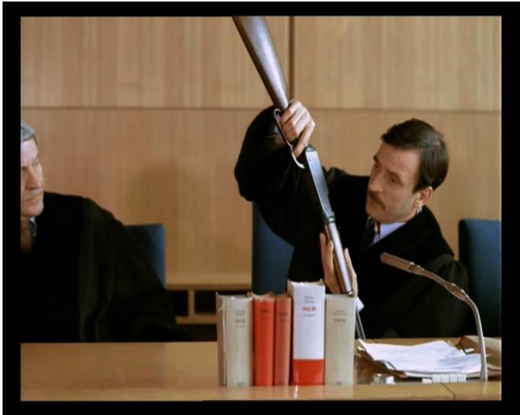
Figure 74: The judge's highly awkward body with the gun.

If one views the gun as a phallic object, the fact that the judge does not appear physically comfortable with the gun in this shot adds further weight to the obvious physical distress we see him experience in the previous scene. The negative emotions that one might associate with pain are thereby linked to male authority figures by Kluge, who appears not to support patriarchal figures but rather challenges their assumed authority. Kluge shows patriarchal figures to be unable to reconfigure or reject emotion's power, thereby showing patriarchy to be fallible according to his theorisation of emotions, wherein succumbing to existing structures of emotions and not rejecting them is something that he views as negative.