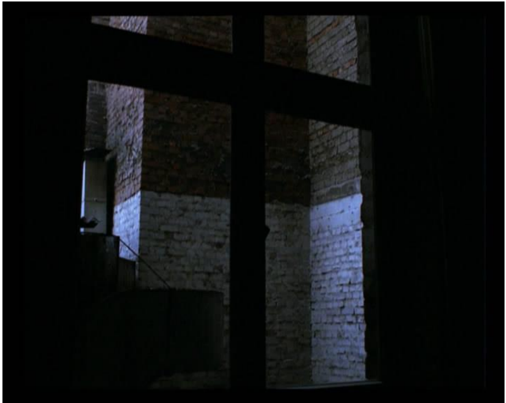
Figure 93: The first barred window.