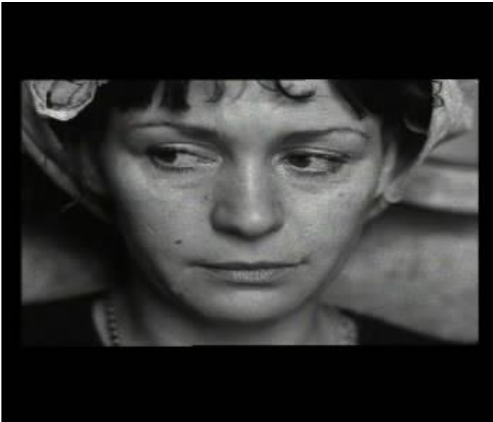
Figure 2: Roswitha appearing uncertain and lacking authority.

In the first shot of the film where the audience is told that Roswitha has a great power within her, Kluge's voice-over, as noted by Rich 'consistently undermines the film's female protagonist' (Rich, 1998a, p.241). While Kluge's voiceover ensures that he retains authority, Roswitha's face communicates uncertainty. Figure 2: