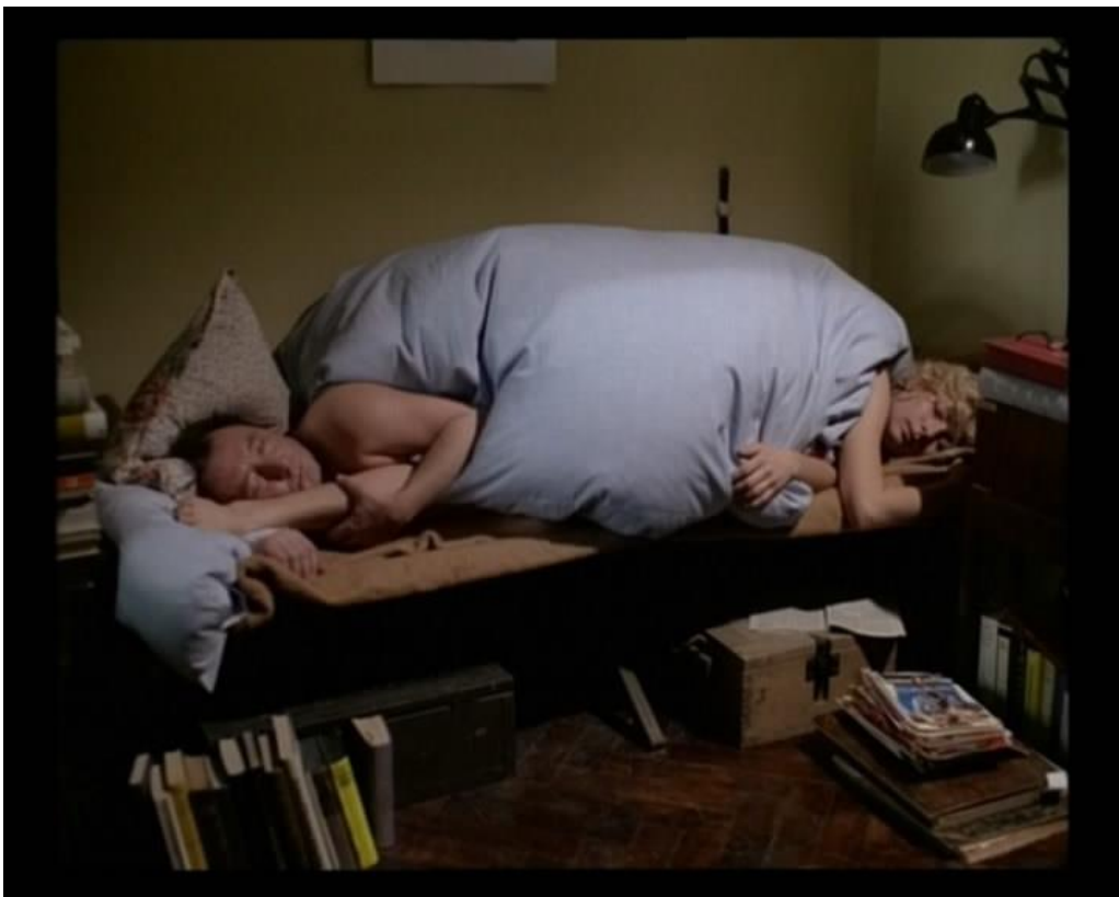
Figure 51: The couple merging into one two-headed figure.