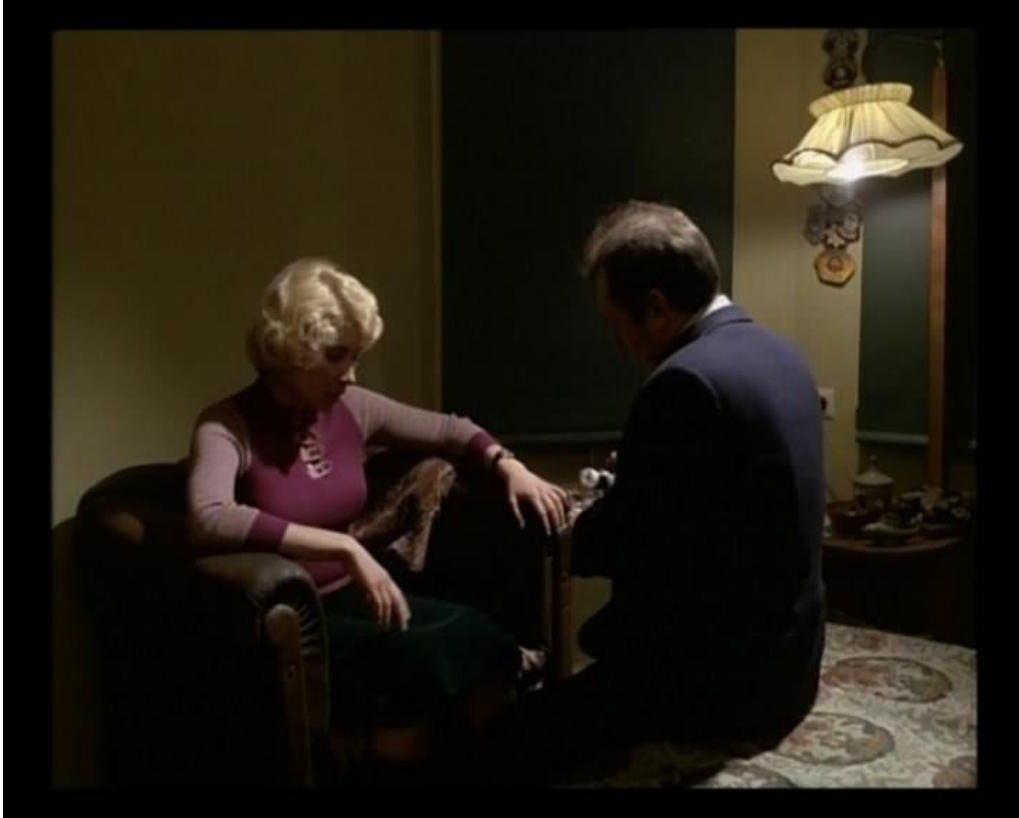
Figure 58: Gertie's passive body language.

However, the increasing level of strangeness in Rieche's behaviour serves to undermine this traditionally gendered dichotomy. After Rieche has taken her hand, he remarks that she surely cannot have eaten all the supplies she has stolen from the factory, as she would have become as fat as 'eine polnische Mastgans'. He then inspects her breast by grabbing it and finally opens her mouth, as if to inspect her teeth, underlining his comparison of her with a piece of livestock. Figure 59; Figure 60.