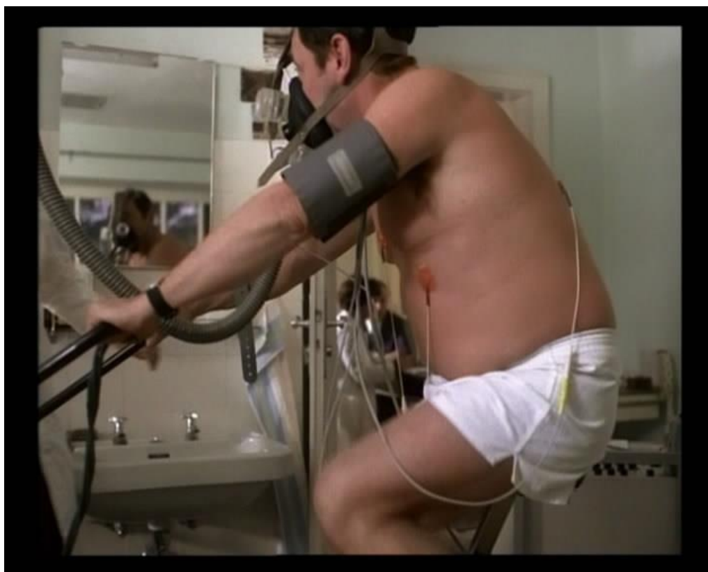
Figure 31: Rieche's feminised body, similar to Grün's.

Much like Grün's half-naked appearance and his being sat next to the fully clothed doctor, Rieche is defined in this scene as profoundly feminised. He also seems to be presented visually almost as a cyborg, which confers even more gender instability on him, as will be explored later. The female doctor asks him to remove his undershirt, which he does, revealing a body similar to that of Grün- feminine breasts, generally saggy, with a paunch. Figure 31: