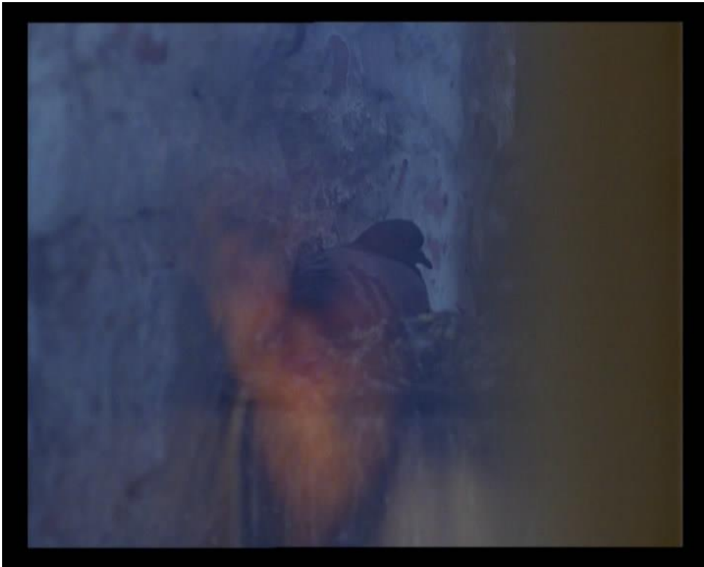
Figure 95: The pigeon on the outside, able to escape while Schmidt cannot.

It is clear that Kluge shows their relationship to have an unhappy ending, full of feelings of captivity and restraint, and also associated with violent and aggressive outbursts of emotion. This aggression is shown later in the scene when Mäxchen says she should have hit Schmidt for what he said to her- the audience is unaware of what exactly Schmidt is supposed to have said to cause this reaction. He instantly reacts and starts to assault her physically. Figure 96: