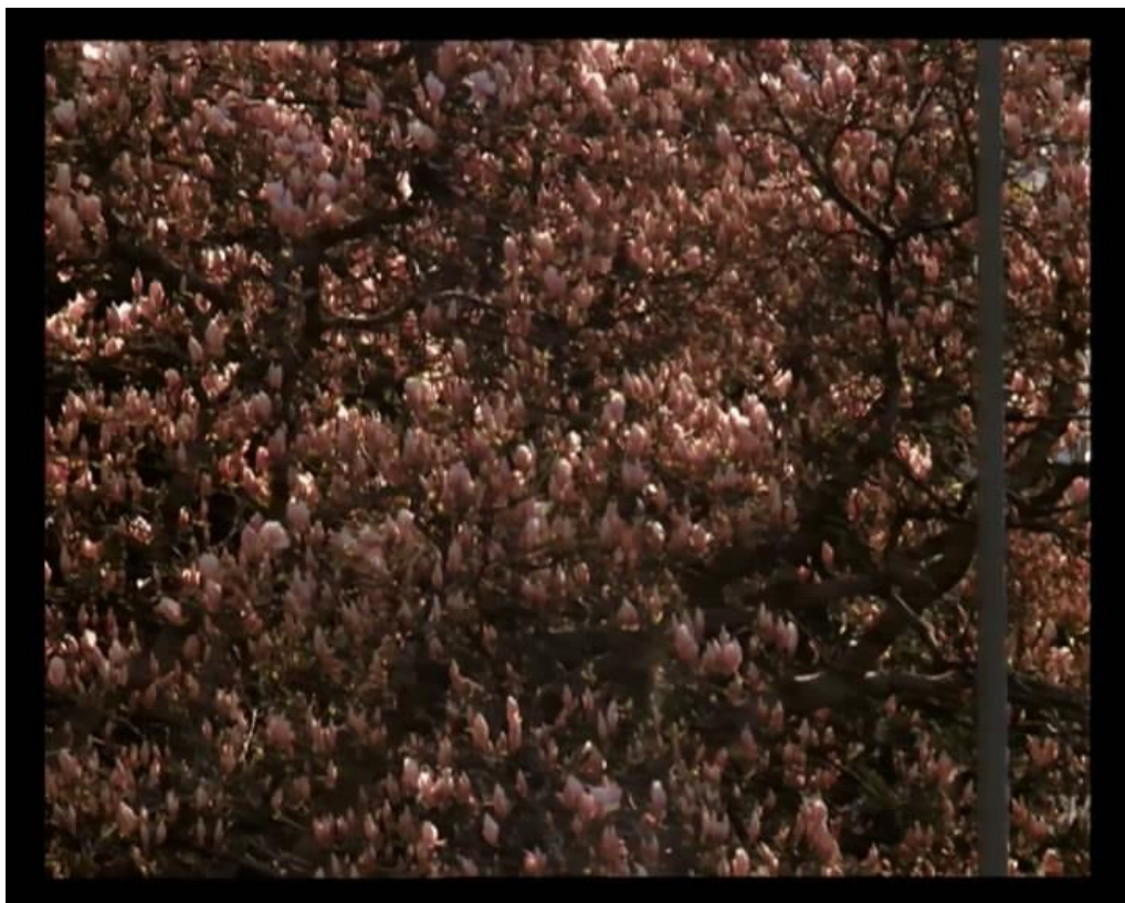
Figure 70: Cherry blossoms in the park which are accompanied by birdsong.