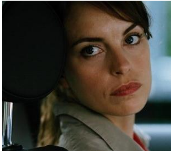
Figure 20: Nina Hoss in Yella (2007)