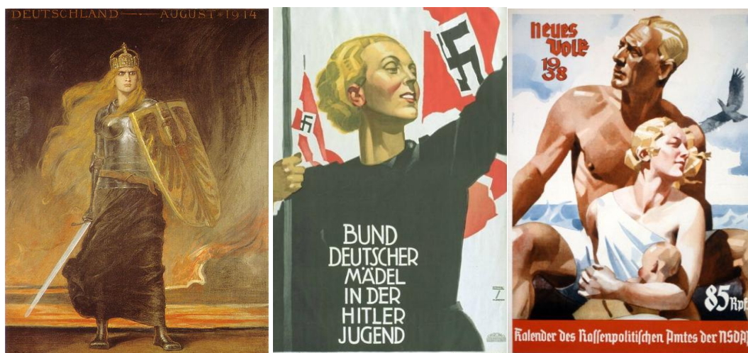
Figures 96-98: Friedrich August von Kaulbach's painting Deutschland August 1914 (1914) foregrounds the allegorical figure's blond hair (left); Nazi propaganda posters perpetuating the ideal of the blonde German woman (centre and right)

commonly pictured on Third Reich propaganda posters (see fig. 97&98). Given this abuse 32 of the blonde German woman figure and the fraught meaning associated with hair colours in German history and culture, What a Man's juxtaposition of a blonde woman that is embodied by an actress of German descent, and a black-haired woman embodied by an actress of Turkish descent risks evoking racist stereotypes. Yet the film actually subverts the (stereotypical and) fraught ideal of the blonde German woman by vilifying Karolin. Moreover, What a Man neither equates 'blondeness' with 'Germanness', nor identifies Kekilli's character as exotic or un-German.