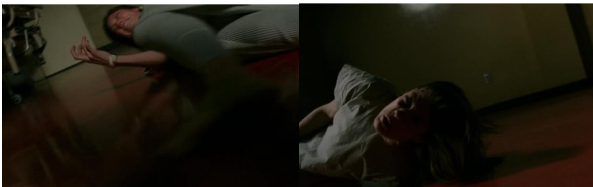
Figures 47&48: The empty space in the frame hints at the presence of Emily's invisible attacker