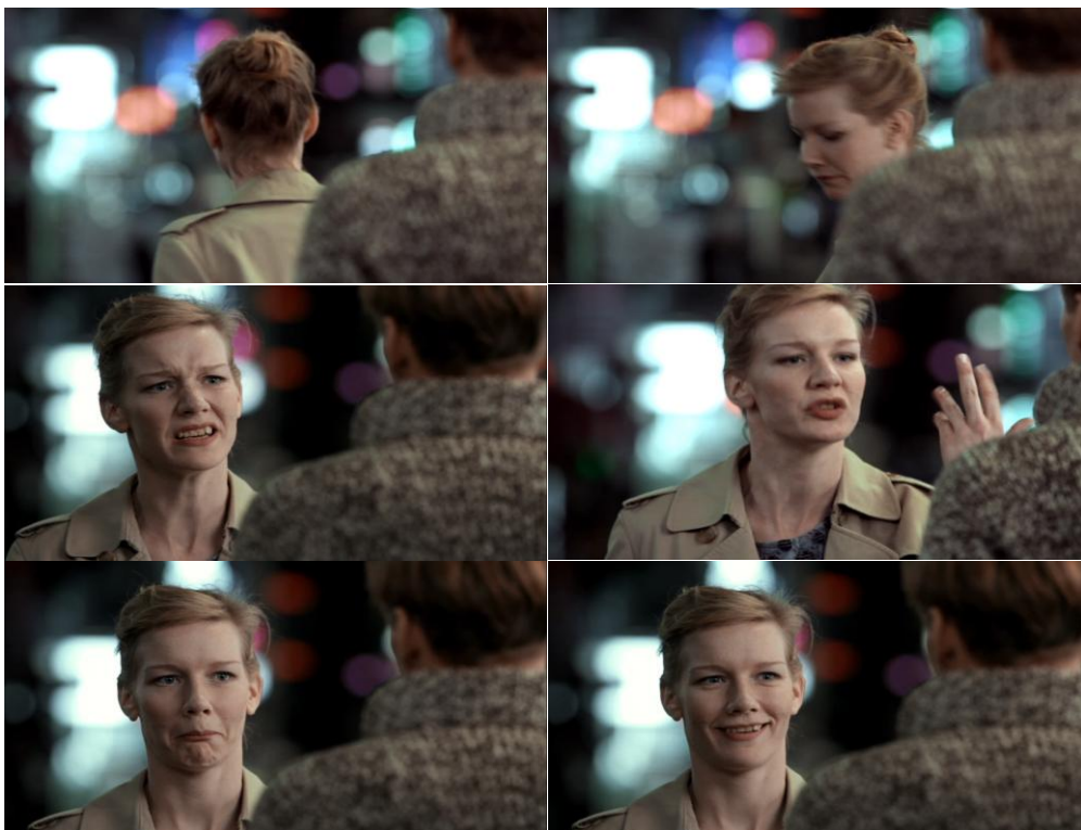
Figures 68-73: Martha’s angry outburst in front of Alexander constitutes a performance-within-the-performance

This scene operates on multiple performative and narrative levels. Martha/Hüller clearly signals to Alexander and thus to the viewer that is it put on rather than real, a performance rather than an expression of a genuine emotion by marking its beginning (turning around to face Alexander) and end (asking Alexander to judge the quality of her performance) (see fig. 68-73).