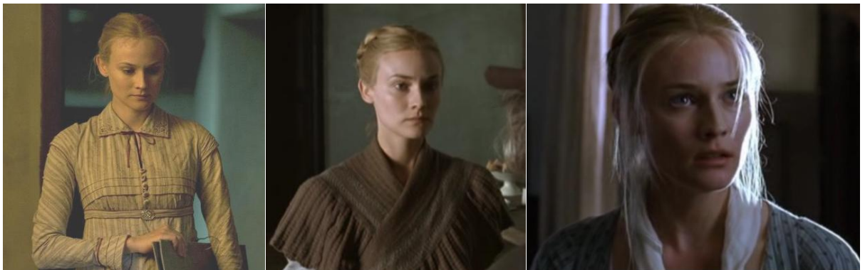
Figures 120-122: Anna wears simple, unshowy dresses in muted colours, and her hair is either tied in a tight bun, or, when she is transcribing music, it looks unkempt and messy, suggesting that the character is focused more on her musical skills than her appearance

One of the film’s primary concerns being the female lead’s struggle for equality, Copying Beethoven refrains from idealising the historic setting and costumes. It thereby differs markedly from those period dramas identified by Andrew Higson as ‘heritage films’, in which elaborate costumes and lavish interiors are key attractions that tend to undermine the films’ social critique by idealising their upper class settings: “heritage films display their self-conscious artistry, their landscapes, their properties, their actors [...], their clothes” (1993, p. 118). Kruger’s costuming in Copying Beethoven on the other hand, deliberately undercuts the actress’s good looks. Unlike Kruger’s characters in Troy , National Treasure and Merry Christmas , who are dressed in elaborate, glamorous gowns that highlight her beauty, Anna wears simple, unshowy dresses in muted colours during most scenes (see fig. 120&121), and her hair is either demurely tied in a tight bun, or, when she is transcribing music, it looks unkempt and messy, with lanky strands of hair hanging down from her head (see fig. 122), as if to emphasise that the character is focused more on her musical skills than her appearance.