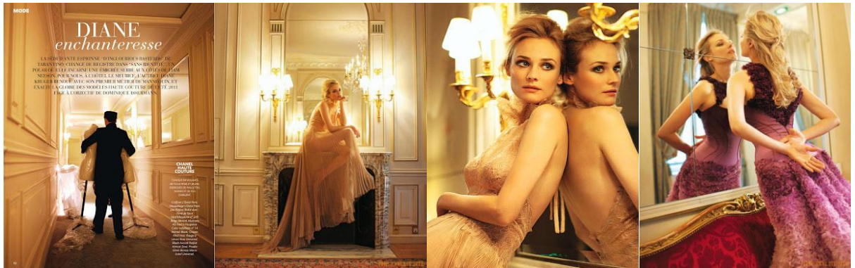
Figures 100-103: In a 2011 issue of the French fashion magazine Madame Figaro , Kruger appears once again as a model, posing in various elaborate ball gowns and other designer clothes in a 24-page feature consisting of 22 pages of pictures and only two pages of text

acting skill or intellect more than ten years after she gave up modelling to become an actress.