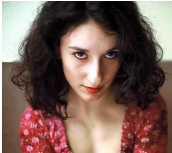
Figure 80: Sibel Kekilli in Head-On (2005)