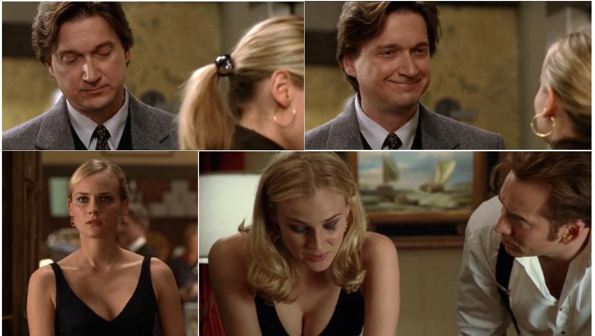
Figures 105-108: National Treasure showcases Kruger’s good looks and repeatedly presents her character as a sexual object: a male colleague stares at her bottom for several seconds, and she wears a low-cut evening dress revealing her cleavage for a large part of the film

the other side, something that is intellectual and intense, as you have in France” (cited in Haynes, 2011, p. 141).