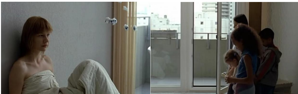
Figures 49&50: Rita’s relationship with her children is marked by alienation and distrust, epitomised by a scene in which they line up in front of Rita’s bed, unsure of how to approach her