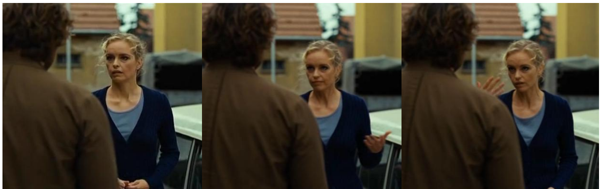
Figures 32-34: Hoss's clumsy body language when encountering André makes Barbara appear bashful and childish, whereby she resembles the protagonist of a romantic comedy who behaves awkwardly in the presence of their paramour

present André and Barbara as surrogate parents to the teenagers, foreshadowing their romance and future family-building. The film also contains some humorous moments between Barbara and André, in which Hoss's performance is particularly noteworthy as she is required to change her acting style, altering her usual screen persona. The first of these moments occurs when Barbara goes looking for André on his day off, urging him to operate on Mario again since she is convinced that the boy has a previously undetected head injury. She explains that "he remembers everything apart from his feelings, they've gone" cxxxix , and adds after a pause that "I know what you think, I should have an operation too, because my feelings ..." cxl . During this monologue (in itself a self-conscious comment on Hoss's cold and distant screen persona) Barbara appears bashful and childish, contrasting with her haughty and composed demeanour at the beginning of the film. This is reinforced by Hoss's feeble voice, awkward hand gestures and body language (see fig. 32-34). Barbara is unable to finish her sentence, her ability to convey her diagnosis with confidence being undermined by her unacknowledged feelings for André, whereby she resembles the protagonist of a romantic comedy who behaves awkwardly in the presence of their paramour.