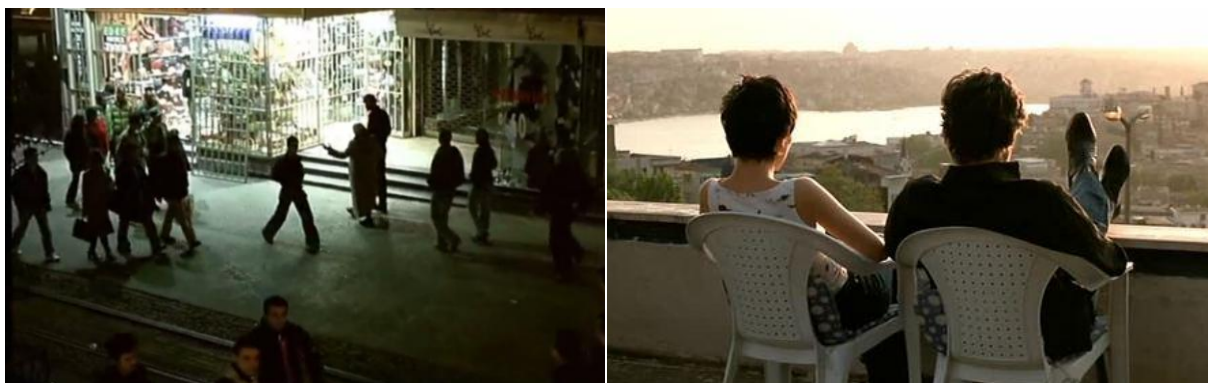
Figures 88&89: Sibel's personal development is mirrored in the changing representations of Istanbul: initially at risk of being swallowed by its dark streets, she later enjoys panoramic views of the city, visualising the degree of mastery over her life she has achieved

At the same time, the fact that both protagonists settle down in Turkey at the end of the film is highly unusual “for naturalised Turkish subjects in Germany” (Petek, 2007, p. 180): both Cahit and Sibel are German citizens who had lived in the country for decades.