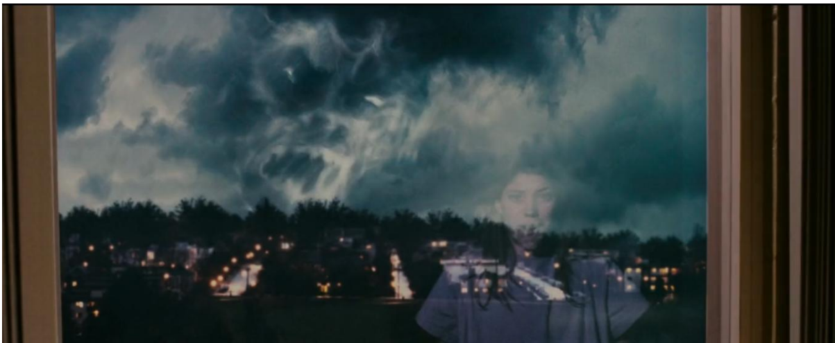
Figure 46: A demon face appearing in the clouds suggests that the threat to Emily is real

protagonist is seeing (be it real or imagined). The camerawork heavily focuses on Emily's invisible attacker by leaving room for it in the frame, by showing her whole body rather than focusing primarily on Emily's face, which would link the 'attack' to her subjective perception, and by adding dissonant, ominous sounds that reinforce the visual hints to the invisible but tangible threat. This allows viewers to share Emily's experience by creating the types of thrills and suspense typical of the horror genre. Overall, the scene focuses on what the 'demon' or 'attacker' is doing to Emily. In Requiem , on the other hand, the focus is on what Michaela is doing, on her physical and mental efforts to resist the seizure and the hallucinations, and it therefore relies much more strongly on Hüller's performance. Requiem thereby differs decidedly from exorcism-themed horror films like The Exorcism of Emily Rose that primarily seek to thrill the viewer and are less concerned with developing the protagonist's character, which functions merely as a target of the demonic attack.