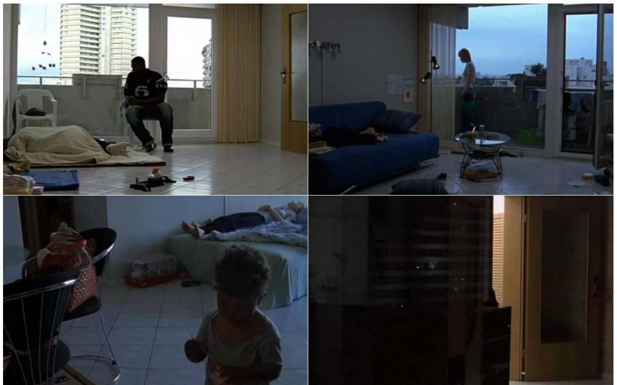
Figures 51-54: The aesthetic of Madonnas is one of observation and distanciation: long shots dominate (above), a static camera captures characters moving in and out of the frame (below left), and we occasionally see an empty room as the characters speak next door (below right)