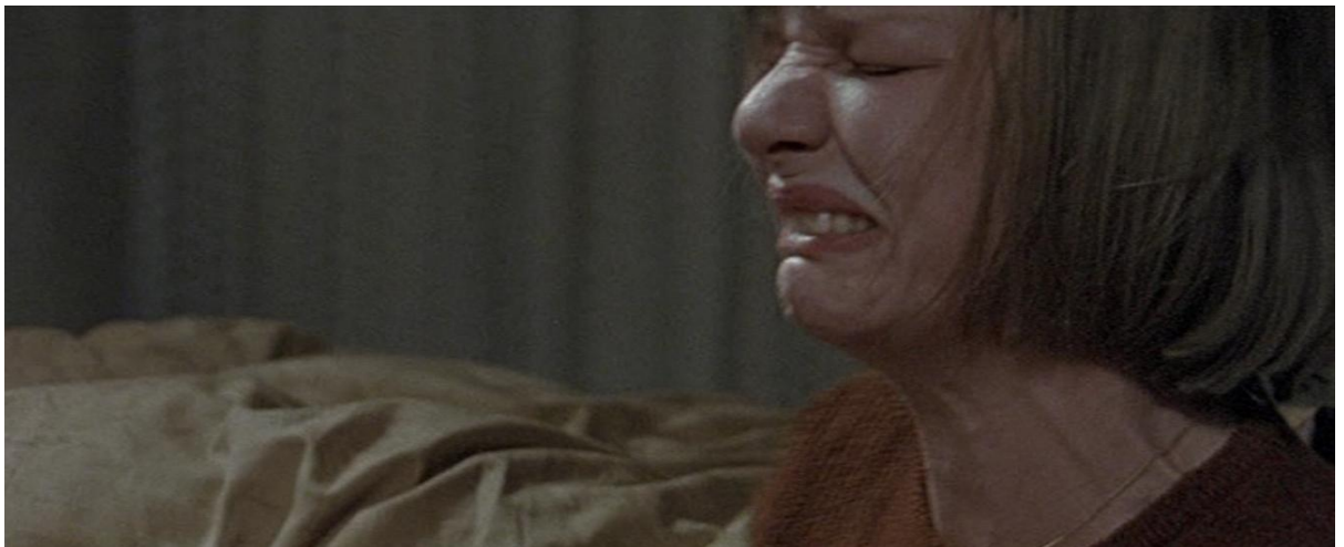
Figure 44: Hüller’s physical make-up also contributes to the overall impact of the scene

The cross and the prayer beads provided an invaluable tool for Hüller to work with, helping her to express the battle between Michaela’s mind and body. In both scenes that show Michaela experiencing a seizure, the rosary is present and she is unable to touch it or hold it in her hands. In a later scene, she shows her boyfriend that she cannot touch a