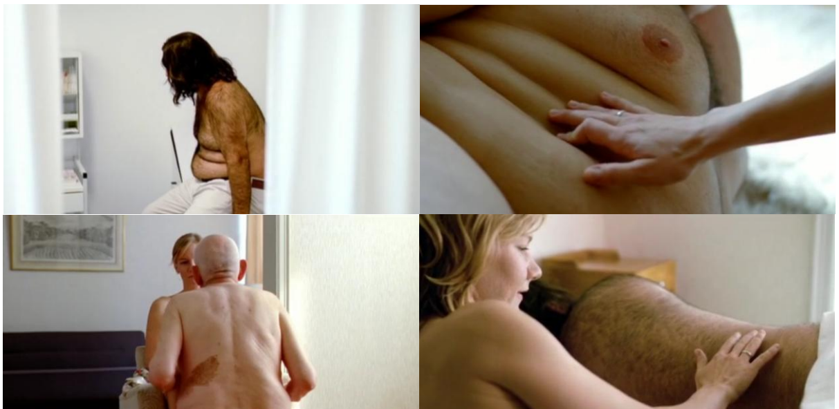
Figures 60-63: The men’s distinct physical features, such as a hairy body, a pot belly or a flabby midriff, are foregrounded through close-ups or by being placed in the centre of the frame

We can surmise that Charlotte is attracted to these men precisely because they are unfamiliar and physically different from her husband. Taken together, Charlotte’s adultery and her statements at the psychiatrist’s leave no doubt that her marriage and sex life, though harmonious and functional, does not provide complete personal and sexual fulfilment. The visual emphasis on the men’s distinct physical features suggests that Charlotte chose them precisely for their physical imperfections. This is confirmed during one of her sessions with the psychiatrist, when Charlotte explains that “I didn’t look at [the man’s] face. I was watching the hair on his arm”. And indeed, three of the four men Charlotte takes to the apartment remain faceless, whereby the film refuses to acknowledge them as individuals and denies the viewer any information about their emotions. The visual fragmentation of the men’s bodies, which are reduced to erotic objects, reverses the process by which women’s body parts are singled out and displayed in classic Hollywood films as an object of male scopophilic pleasure discussed by Laura Mulvey (1975, p. 14).