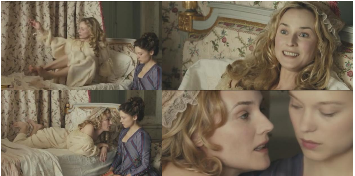
Figures 133-136: In the reading scene, Kruger uses Kruger's expressive hand gestures and body language to portray the queen as cheerful, energetic, and flirtatious, inching closer to Laborde as she reads a suggestive passage from a novel

In her next scene, she appears much more fragile, burdened not only by the news of the storming of the Bastille, but also by heartache. Sitting by the fireplace at night in a lushly decorated room, the queen confides in Laborde, telling her about her feelings for Polignac and her anxiousness over the duchess's refusal to see her. Laborde goes to fetch the duchess, only to find upon her return that Marie Antoinette appears to be a different person yet again. Coordinating the packing of her belongings for her departure to Metz, she is authoritative, domineering and irascible. She orders her servants around, angrily commanding Laborde to help her take off a bracelet, before condescendingly asking her: "What are you crying for? [...] I'll return soon" cccxlvi .