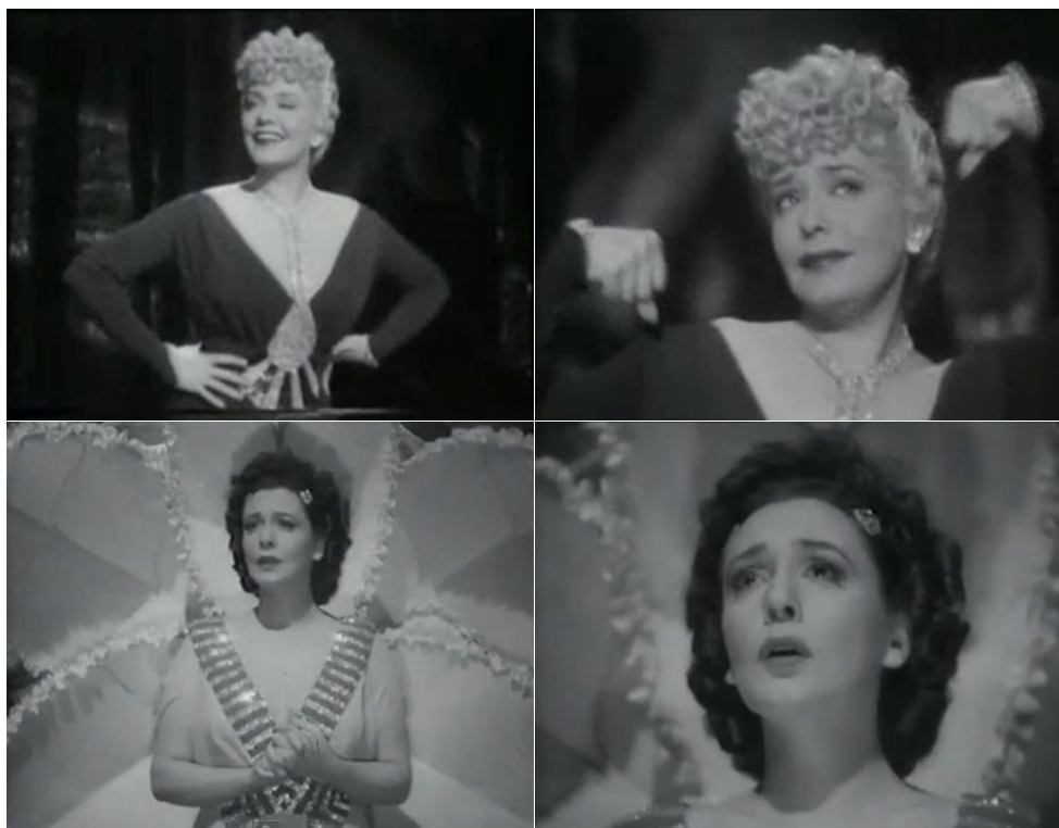
Figures 10-13: Zarah Leander’s character changes from lascivious, vain revue star (above) into an angelic figure boosting German morale (below)

The film depicts the heroine’s gradual renunciation of her egoistic affectations as she becomes an ordinary woman faced with the deprivations of wartime akin to the film’s female viewers, whom the film sought to teach communal solidarity for the good of the nation. The different stagings of Hanna’s musical numbers at the beginning and at the end of the film showcase her transformation from frivolous stage performer to dutiful future soldier’s wife (see fig. 10-13). During her first performance, the camera follows Hanna as she moves across the stage, her knowing smiles at the audience underlining her suggestive lyrics (“There should be no nights without love” xliii , “My motto is: all is permitted that pleases” xliv ). Her coquettish comportment recalls Marlene Dietrich’s stage performances as vampish night club singer Lola Lola in The Blue Angel , which demonstrates Leander’s functioning as a Dietrich stand-in or surrogate.