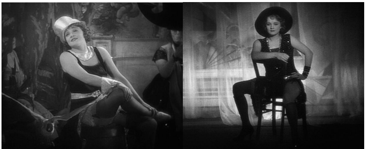
Figures 3&4: The differences between Lola Lola's first and second performance of 'Falling in Love Again' epitomise her transformation from seemingly innocent flirt to callous femme fatale