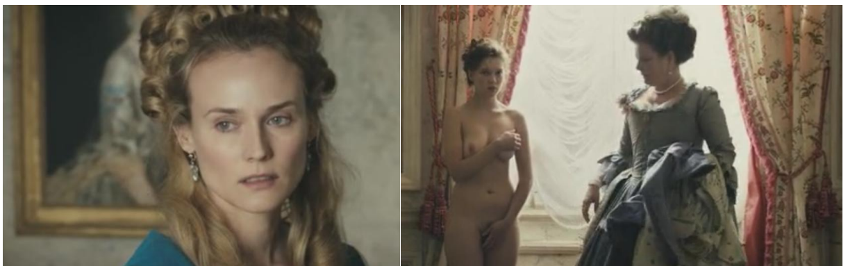
Figures 140&141: Through her condescending yet curious gaze at the naked Laborde, Kruger's Marie Antoinette signals a shift in the dynamics of looking and thus in the power relations between the queen and her servant

Having been executed during the French Revolution, a defining moment of French national identity, Marie Antoinette holds a central place within the country's cultural