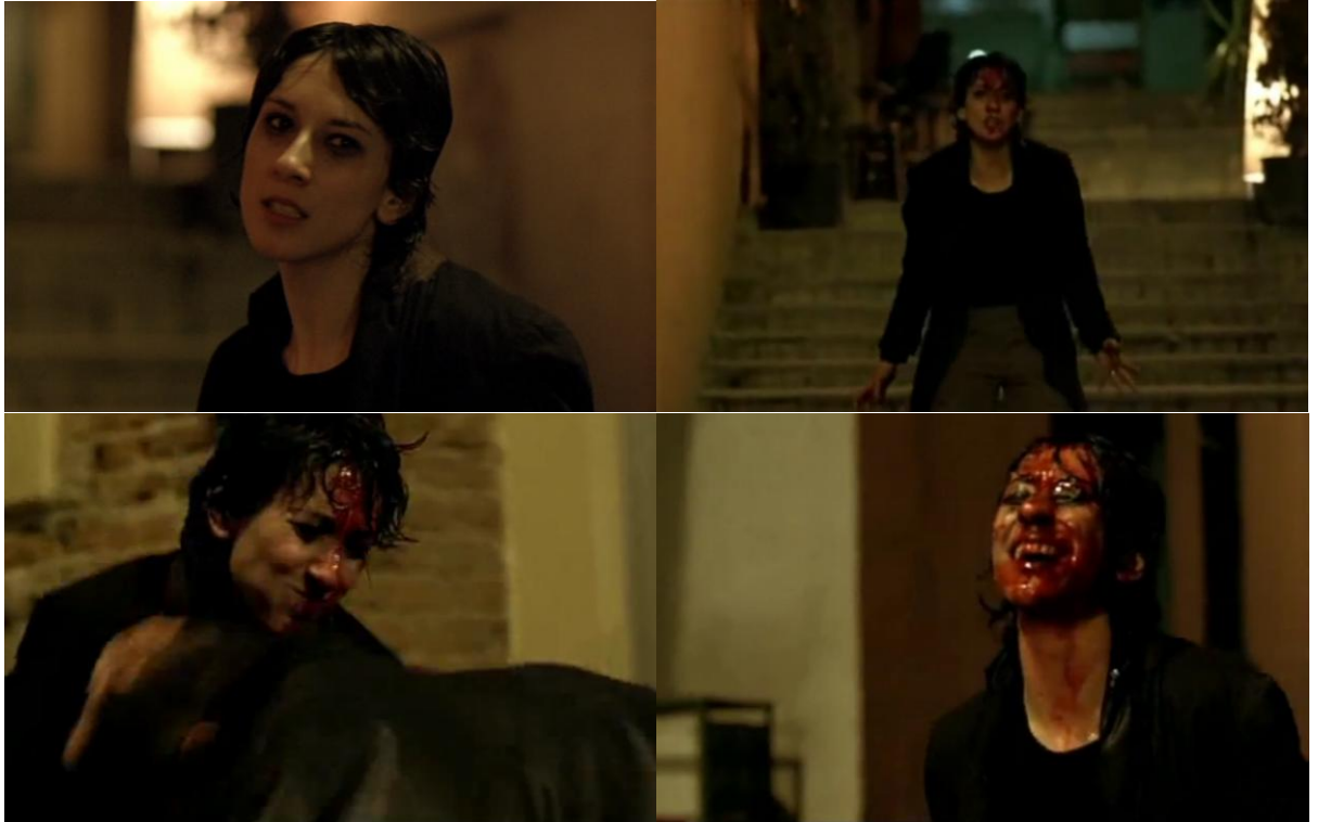
Figures 84-87: Sibel provokes and attacks a group of men several times, continuing to taunt them even when she is severely injured

her unbridled rage and defiance exemplified by her overreaction to being provoked and her repeated taunting of the men. Even though she is acting irrationally and self-destructively, as viewers we are struck by Sibel's extraordinary courage and resilience, so forcefully conveyed by Kekilli in this scene.