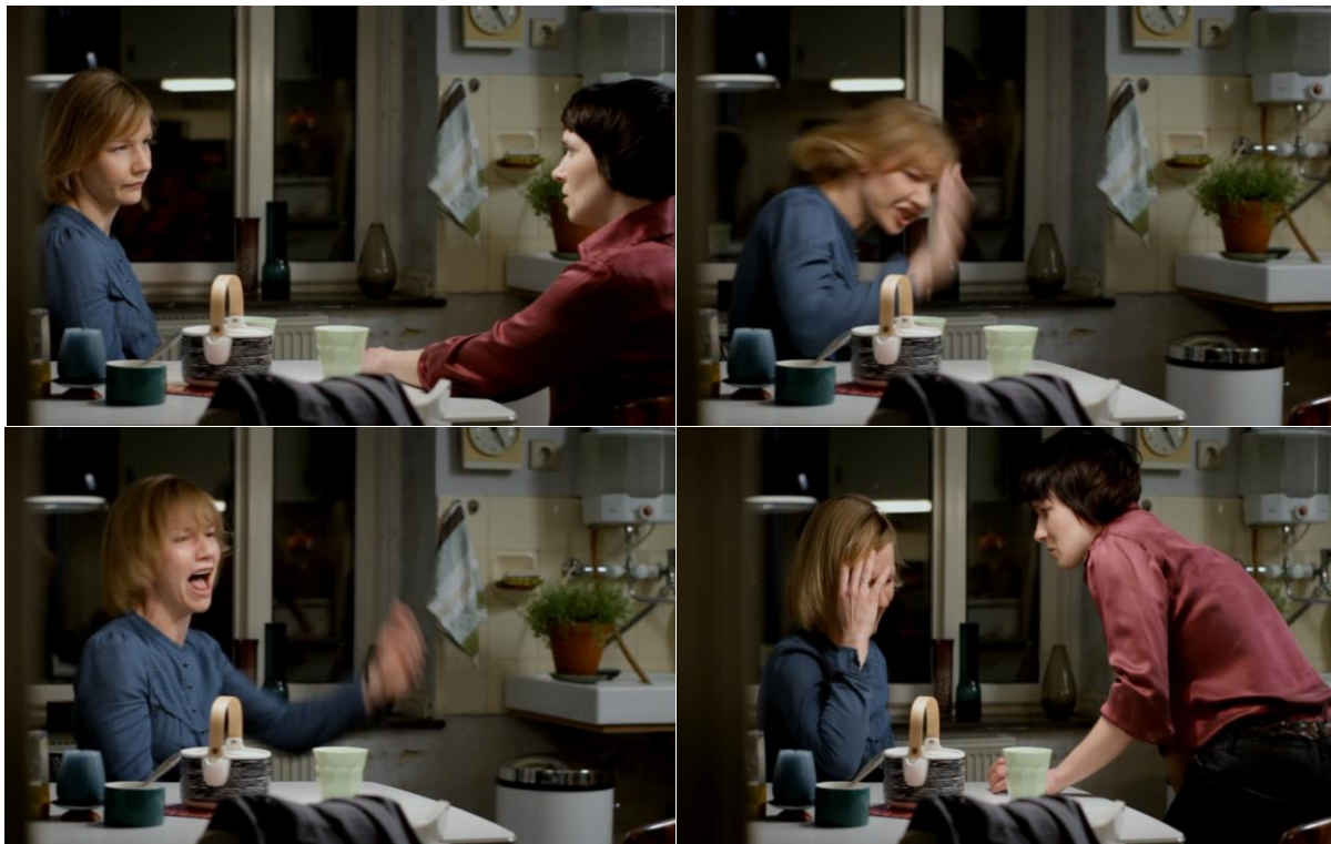
Figures 76-79: Martha’s emotional outburst is captured in one single take, the static camera resting on Hüller while another character moves in and out of the frame

Requiem : it relies primarily on Hüller’s performance to carry the scene, rather than enhancing it through close-ups.