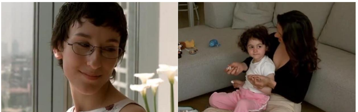
Figures 90&91: Sibel casts her daughter an affectionate look, suggesting that Pamuk gives her happiness and a new responsibility to care not only for herself, but for the child that is dependent on her

In the later Istanbul scenes, Kekilli's speech and body language indicate that Sibel has changed. She appears more calm and serene, suggesting that the character has achieved a degree of stability and contentment that she was completely lacking earlier in the film, when she was compulsively striving to live in a way that contradicted everything demanded by her parents and their cultural tradition. Head-On depicts Sibel's struggle not only to liberate herself from her oppressive family but also to relinquish the reckless and self-destructive lifestyle she had adopted as a result of this oppression. By the end of the film, she is able to define herself not against her family background, but independently from it, having started a family of her own. One scene shows Sibel in her apartment with her daughter Pamuk. Sibel casts the child an affectionate look, which suggests that Pamuk gives her happiness and a new responsibility to care not only for herself, but for the child that is dependent on her (see fig. 90&91).