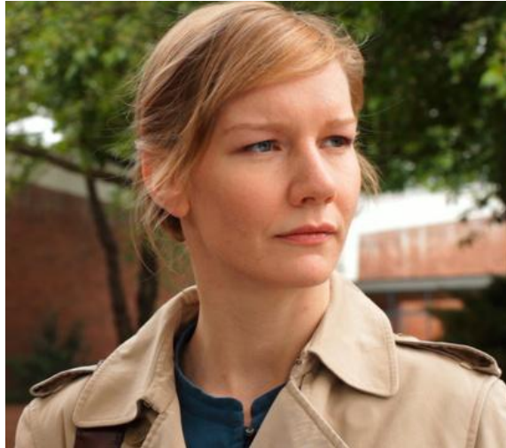
Figure 39: Sandra Hüller in Above Us Only Sky (2011)