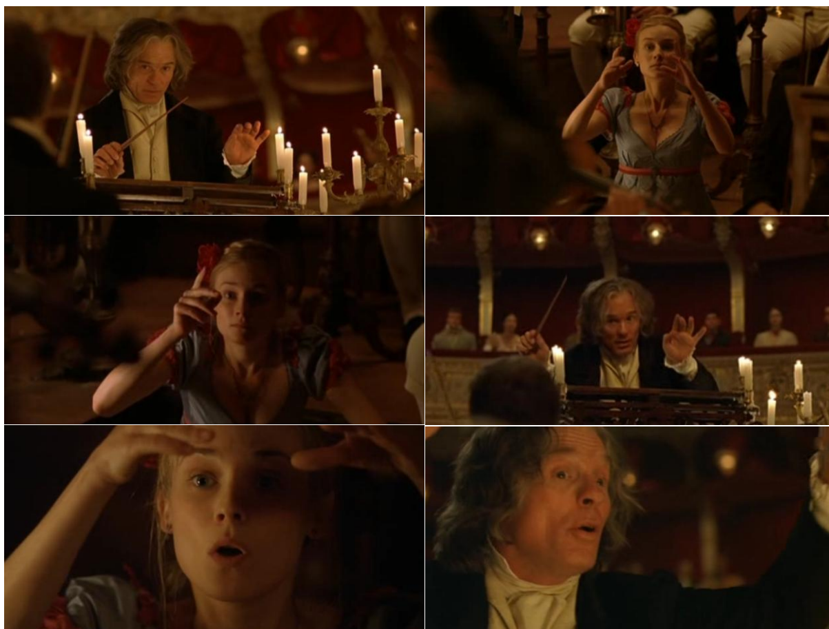
Figures 114-119: In the concert sequence, close shots and close-ups of Beethoven's and Holtz's faces and hands show that the composer looks to Anna for guidance, and Beethoven's gestures repeatedly mirror Holtz's, communicating her vital role in the concert's success

Anna's close working relationship with the composer also endangers her engagement after the irascible Beethoven destroyed her fiancé's model for a bridge which he entered into an architecture competition. Her fiancé Martin Bauer (Matthew Goode) then sets Holtz an ultimatum, asking her to stop working for Beethoven, or else he would break off the engagement. Beethoven's dislike of Bauer's work is founded on his conviction that Bauer is an uninspired engineer and technician who does not share the passion for and insight into the sublime, elevating power of music which, as the film suggests, unites Holtz and Beethoven. Holtz's conscious decision against Bauer and in favour of Beethoven must therefore be read as her choice to pursue a career as a composer (her work is ultimately approved of by Beethoven) as opposed to reconciling herself to the role of housewife and mother. Thus highlighting the consequences Anna's professional ambition has for her personal life, Copying Beethoven suggests that the protagonist has to pay a heavy price for her emancipatory drive. However, it is not only her fiancé who threatens to confine Holtz to a more traditional female role. Anna's interactions with Beethoven equally highlight her