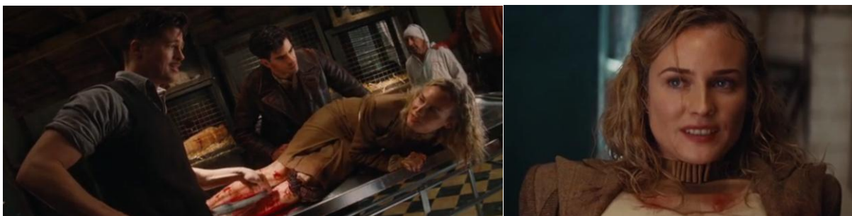
Figures 127&128: During the interrogation scene, von Hammersmark is the dominant character both visually and verbally: the camera is either focused on her, or keeps her within the frame as Raine is speaking

Although physically inferior and writhing in pain, von Hammersmark nonetheless controls the situation since she has the information Raine and his men need to proceed with