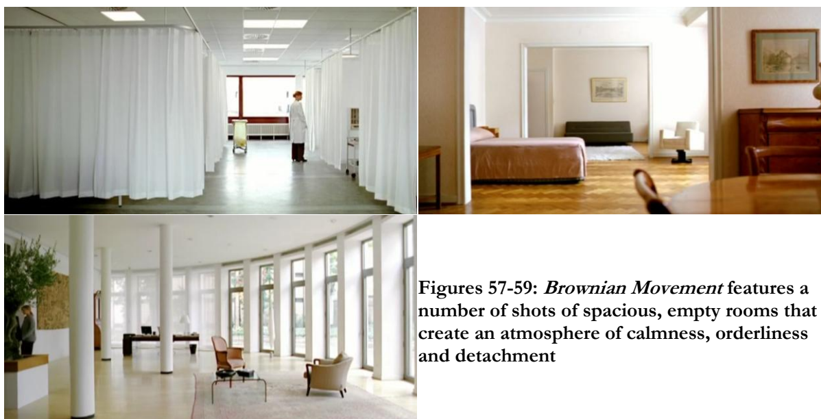
Figures 57-59: Brownian Movement features a number of shots of spacious, empty rooms that create an atmosphere of calmness, orderliness and detachment

the point of view offered by director Nanouk Leopold allows viewers (male or female) to almost understand: What Charlotte was doing, in the apartment, in the other room, was not cheating. Was something she only did for herself. Out of interest and curiosity. She gave room to her desires, quite literally ccii (2011).