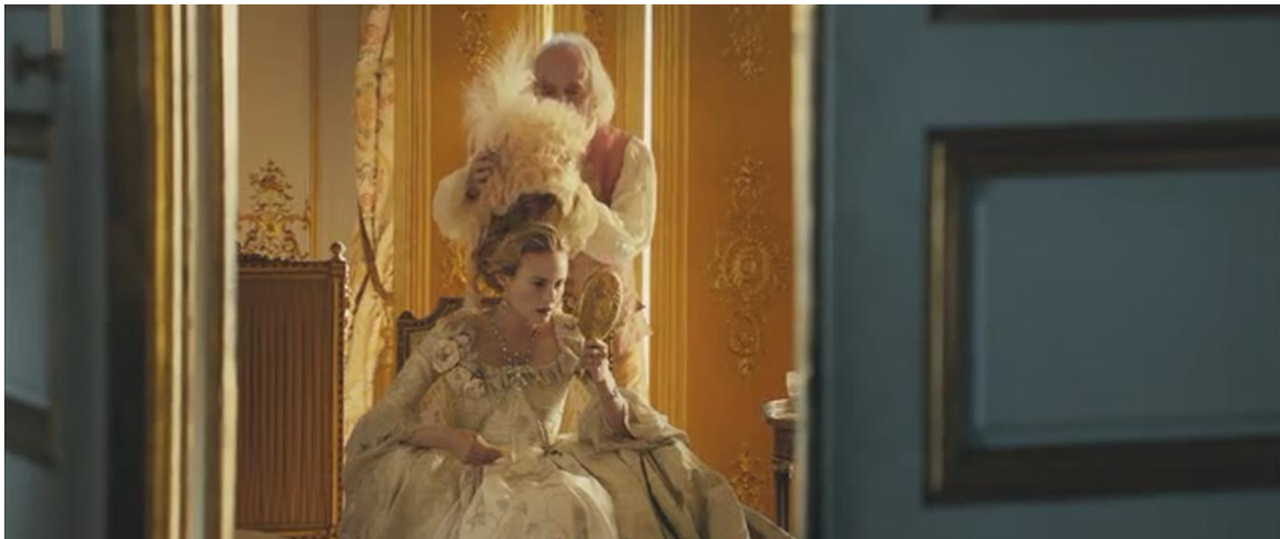
Figure 137: A manservant taking off the queen’s large wig functions as an indication that Marie Antoinette is about to drop her facade of composure, orderliness and control she previously maintained in front of strangers