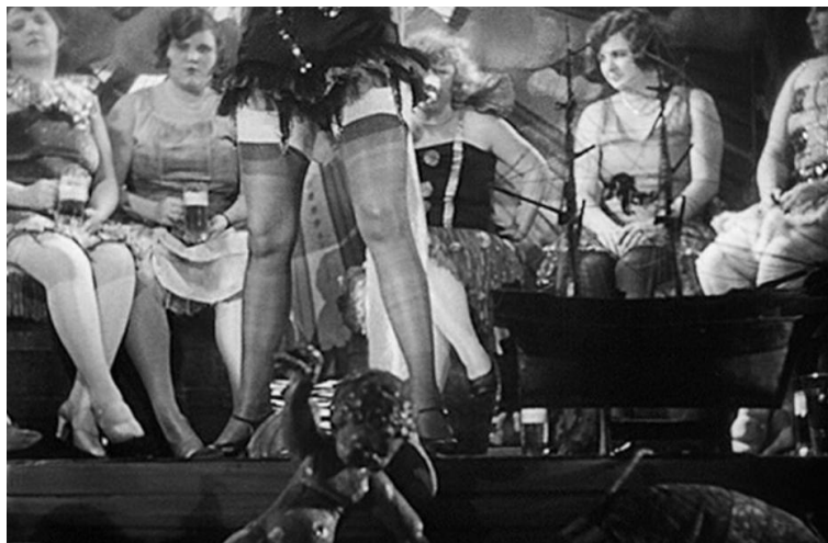
Figure 5: Dietrich's/Lola Lola's legs are fetishised by von Sternberg's camera

The way Dietrich is set in scene also enhances Lola Lola's status as a filmic spectacle. Sitting in front of a plain white background and filmed in a full-frontal shot, she seems to address viewers directly: "she is no longer a theatrical phenomenon, but rather a truly 'cinematic' illusion' in the classical sense: an illusion of reality unburdened by any evidence of its construction or the audience that watches it" (McCormick, 2001, p. 123). The visual representation of Lola Lola in The Blue Angel has been used by feminist film scholar Laura Mulvey as a prime example of the fetishisation of a female performer for the male viewer's gaze (1975, p. 14). The woman's "body, stylised and fragmented by close-ups, is the content of the film and the direct recipient of the spectator's look" (ibid), exemplified by the shot of Dietrich's legs in black stockings that can be seen during Lola Lola's first appearance on the stage of the 'The Blue Angel' before Rath appears at the club. It has no narrative motivation, but functions as a moment of erotic contemplation for the heterosexual male viewer (see fig. 5).