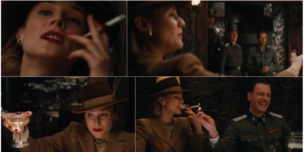
Figures 123-126: Kruger's sweeping hand gestures and her use of props reinforce the scene's focus on appearance and performance as opposed to interiority

props function as a shorthand for communicating von Hammersmark's sophistication and film star persona, but they also work as a shield or disguise, denying both the other characters and the viewer access to her genuine thoughts and feelings. The feathered hat, the cigarette (smoking) and the large champagne glass are integral to Kruger's/von Hammersmark's performance of a celebrated film star and entertainer, and she initially is defined by these props more than by her conversation or actions.