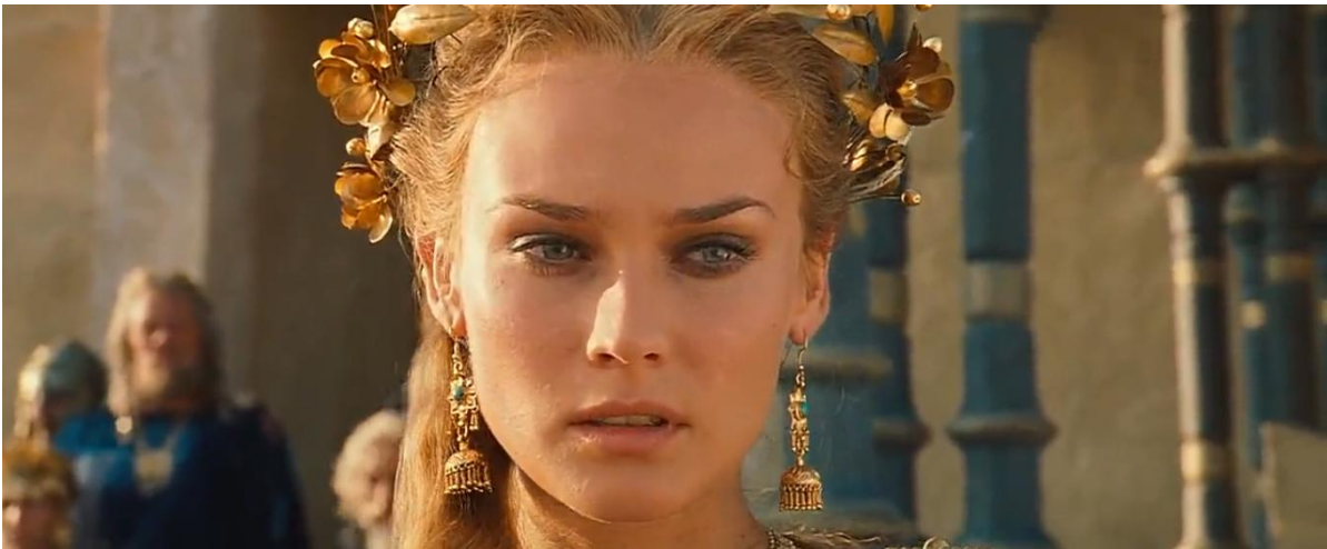
Figure 104: Playing Helen of Troy, the most beautiful woman in the world, Kruger was judged both on her appearance and charisma

Kruger herself has since acknowledged that she secured the role primarily on the merit of her looks rather than her acting abilities ("In the end, it was not about acting talent, but about appearance" cccxxiii (Kruger in Stuttgarter Nachrichten , 2004)), and that her performance suffered because she was somewhat overwhelmed with the scale of the