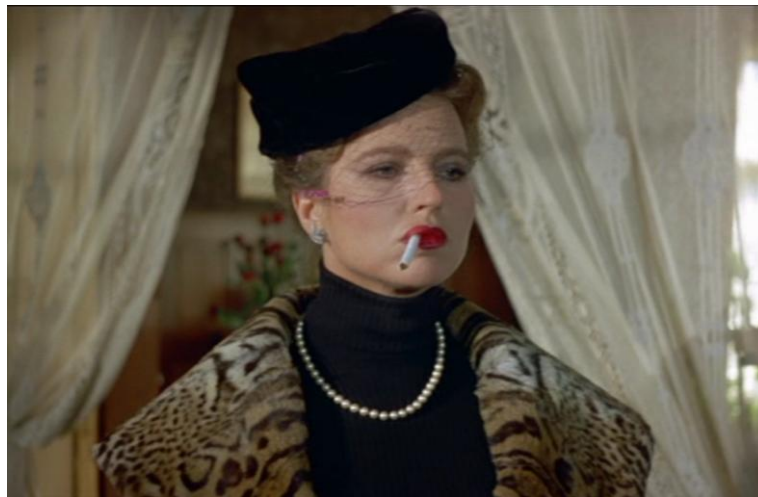
Figure 7: Schygulla’s Maria Braun symbolises the blind materialism and moral hollowness of 1950s Germany

explosion. Elsaesser observes that “Maria accidentally blows up both of them, just at the moment when West Germany wins the football world championship, symbolically – and for Fassbinder highly ironically – finding itself once more as a ‘nation’ ” (1996, p. 292). Kaes reads Fassbinder’s symbolism in a similar way: “one person’s utopia disappears in rubble and ashes, but the nation ‘is somebody’ 7 again” (1992 [1989], p. 98). Fassbinder interprets this ‘founding moment’ of the FRG as burying “the hopes for a radical new beginning [...] with the rise of Germany from the pariah of 1945 to the proud victor and ‘world champion’ in 1954” (ibid). For Fassbinder, the nation that Germany became after 1954 is built on a denial of its guilt, trading its conscience for a superficial chase of material wealth and respectability.