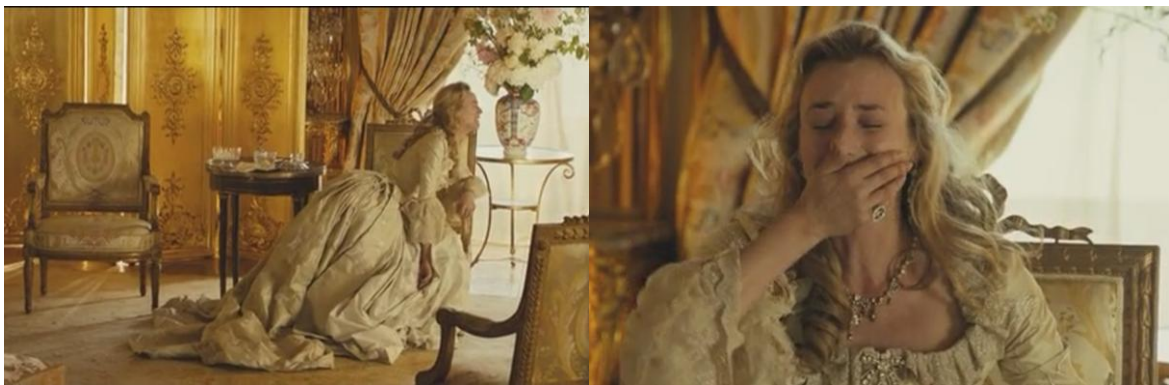
Figures 138&139: Once Polignac is gone, Marie Antoinette breaks down in tears, staggers and squirms, before sinking into a chair