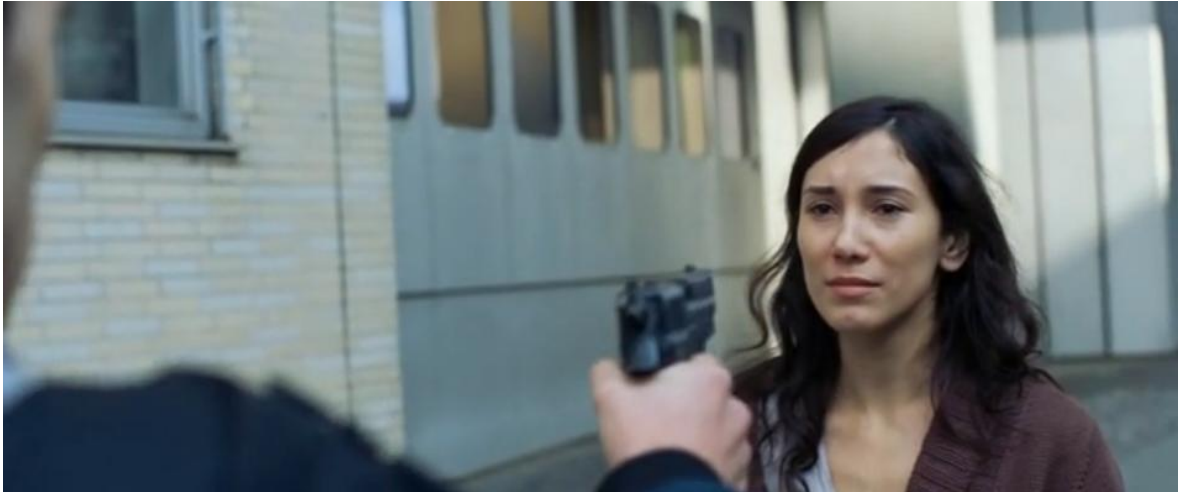
Figure 92: Kekilli's facial expression communicates her character's exhaustion and resignation