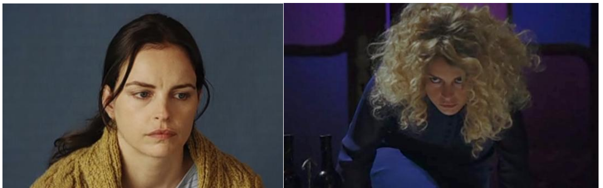
Figures 28&29: During the masked ball sequence, Marie transforms herself from mousy housewife (left) into sexually confident vamp (right)

female character on the screen as a person possessing thoughts and feelings, rather than a spectacular, but hollow erotic object: “women are body” (ibid, p. 79), the woman “ is the image” (ibid, p. 78). Doane takes the example of Marlene Dietrich, who stylised herself as “an excess of femininity” (ibid, p. 82), self-consciously demonstrating the image of a woman’s body to suggest that through masquerade, women can achieve a certain distance to the image with which they tend to be conflated. Women can use it to demonstrate that what is commonly seen as defining femininity, is in fact, a fabrication or mask, and the “masquerade, in flaunting femininity, holds it at a distance” (ibid, p. 81).