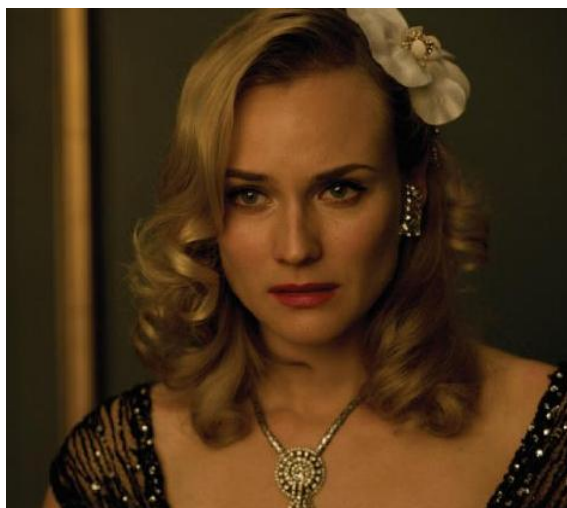
Figure 99: Diane Kruger in Inglourious Basterds (2009)