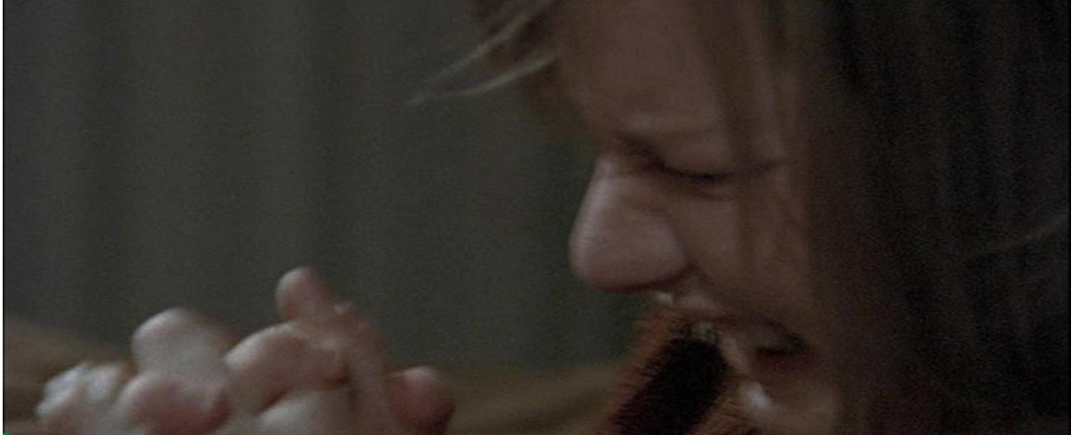
Figure 45: The shaky images produced by a handheld camera contribute to the disorienting quality of the scene

my analysis of the scene has shown, the cinematographer is also guided by Hüller's performance, and focussing on and capturing her facial expressions and gestures as she enacts them .