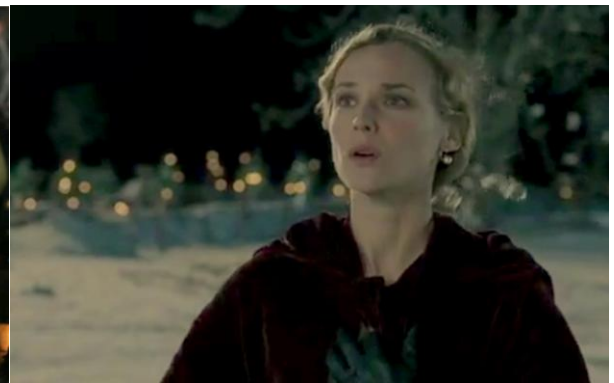
Figure 111: The figure of Sörensen is highlighted against the background of the white snowy field and candlelit Christmas trees

The framing of Sörensen’s performance at the impromptu Christmas service equally elevates the character. Medium shots and close-ups of Sörensen/Kruger against the background of the white snowy field and twinkling candlelit Christmas trees alternate with wide tracking shots of her large audience, the soldiers, who are surrounded by a nightly darkness akin to the one in a cinema auditorium (see fig. 112). Close-ups of individual soldiers’ faces suggest that they are as enraptured and moved by Sörensen’s angelic appearance as they are by her singing (see fig. 113). The Sörensen character thus constitutes an effective “fictional extension” (Hollinger, 2006, p. 50) of Kruger’s star image that centres on her exquisite beauty and appearance, “allowing the part and the actor to be seen as one” (ibid), and affording the viewer the “pleasure [of] feeling that the star-actor is doing something remarkable on the screen” (ibid).