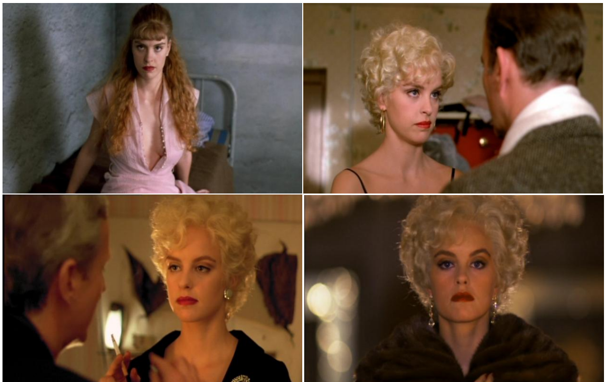
Figures 21-24: Rosemarie's typical cold, disdainful look. Above left: in the prison cell, Above right: with Hartog; Below left: confronting Fribert, Below right: at the party preceding her death

One of the film's most powerful scenes is set in the workhouse. A warden, whom Rosemarie had bitten in the arm in order to keep him from confiscating her shoes, brings the teenage protagonist to her cell. Unexpectedly, he brutally hits her in the face. She recovers surprisingly quickly, and rather than trying to shield herself from him, provocatively faces him and unbuttons her blouse. Here Hoss for the first time presents the aggressive, defiant look that will recur throughout the film. Slightly lowering her eyelids, and fixing him with a stern gaze, she gives the impression of being in complete control of the situation. The man hits her a second time, catapulting her onto the bed. Again, she quickly regains her composure, this time slowly pulling up her skirt as a calculated provocation, piercing him with the same disdainful look. Hoss employs this look in key scenes in which Rosemarie needs to demonstrate her strength to her antagonists. She uses it to hide her desperation when Hartog tells her he is going to leave her; she uses it when denying the Fribert the audiotapes, which she wants to use for her own ends, and she uses it in confronting Hartog and his fiancée at the end of the film (see fig. 21-24).