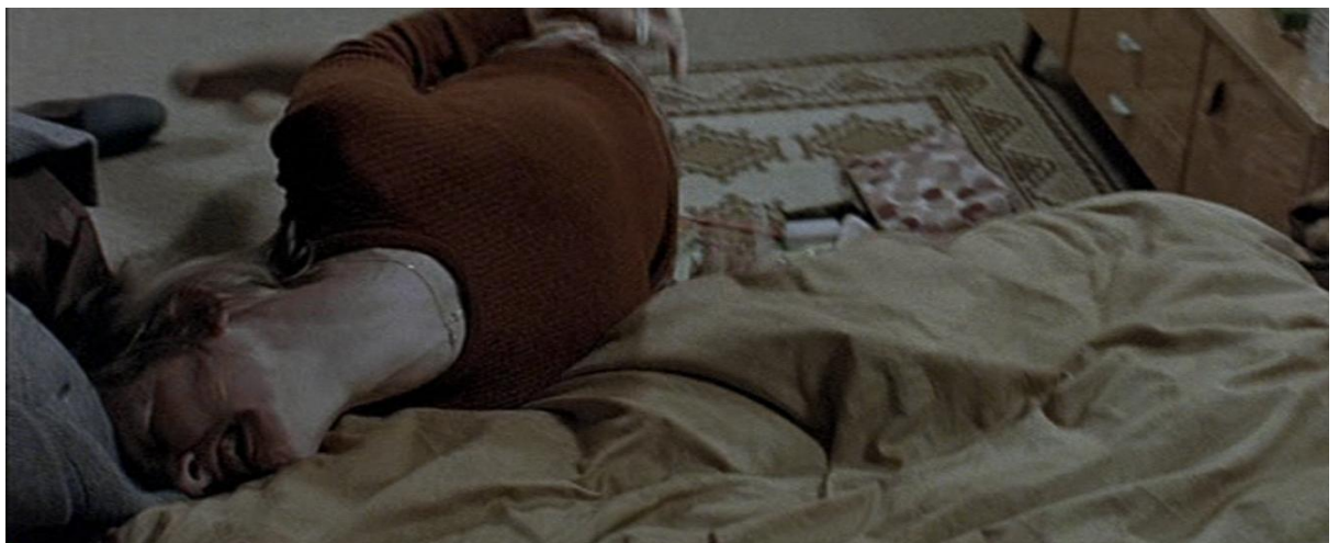
Figure 42: Michaela rolls around on the bed

When she screams, it is not the piercing, melodramatic scream typical for young female characters in horror films, often captured in close-up. Instead, Hüller utters a number of short, roaring sounds while being framed in a medium, high-angle shot showing her rolling around on the bed (see fig. 42). Thereby the screams are presented as an integral part of Michaela's mental and physical agony, as opposed to functioning as a recognisable element of the non-naturalistic, melodramatic performances found in many horror films.