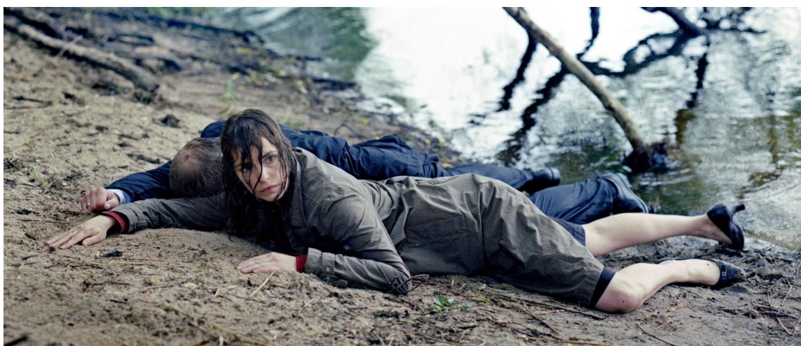
Figure 27: Yella's ghostlike state after escaping from the water signals her mental and emotional disintegration

central to the film's social critique: it “suggest[s] that globalised, postnational societies governed by neoliberalism increasingly turn the flexible, cooperative, and efficient individuals living in them [...] into zombie-like creatures disenfranchised from themselves and their environment”, their “subjectivity and identity” being shaped by “ghostliness” (Biendarra, 2011, p. 465).