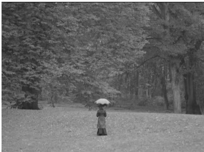
Figure 6: A static long shot of Effi, facing away from the viewer, contrasts markedly with the voiceover, which describes a moment of intense feeling

creature that is pushed into coldness” (cited in Penkert, 1985, p. 8), while Fassbinder sought to stage “death through suffocation in lace-trimmed, posh surroundings” (ibid). Schygulla recalls that “seeing myself in Effi Briest , I felt like looking at a mummy and thought: Is that really me? Good God! High time to stop!” xxv (cited in Müller, 2007). Fontane Effi Briest functions as an important point in Schygulla’s career, equipping her with greater self-awareness as an actress and leading to her emancipation from Fassbinder’s formative influence after starring a film in which she appears as a highly stylised, soulless ideal image of woman.