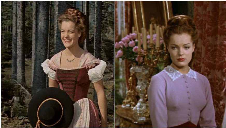
Figures 16&17: In the Sissi trilogy, Romy Schneider portrays her character's transformation of from carefree child of nature (left) into a troubled young woman trapped in the golden cage of courtly life in Vienna (right)

mindedly into the distance when receiving another piece of bad news or being informed of new duties to perform (see fig. 16&17).