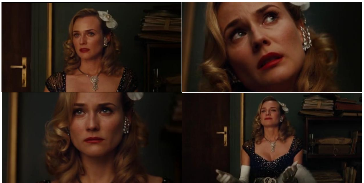
Figures 129-132: Frequent close-ups of von Hammersmark’s anxious face communicate her profound fear and despair, but she also briefly raises her hands, admitting defeat while signalling that she is not willing to plead with Landa for her release