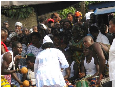
Plate 9: Musician's helping Woyo into trance

The drumming was an ensemble of three tuned drums, with the addition of a double-headed drum (armpit control). Two Gong Gong ( Nono ) players stood behind the drummers to keep time and additionally, two shakers were played to heighten the tension when a woyo appeared agitated, swaying, rocking and showing the signs of becoming entranced.