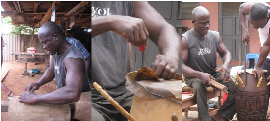
Plate 4: Drum-maker, Kaneshie.

(bells- Nono ) are produced in various sizes to give different tonal quality.