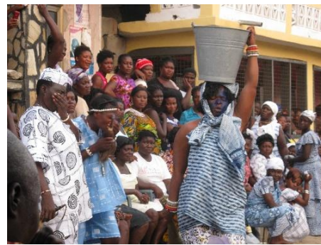
Plate 10: Woyo entranced.

At the first event I attended, an entranced woyo appeared from the dressing area having changed clothes to identify the character that was making an appearance. The crowd instantly recognised the newly-arrived and welcomed them with applause. When each woyo took the lead, as dancer, or became entranced, they were