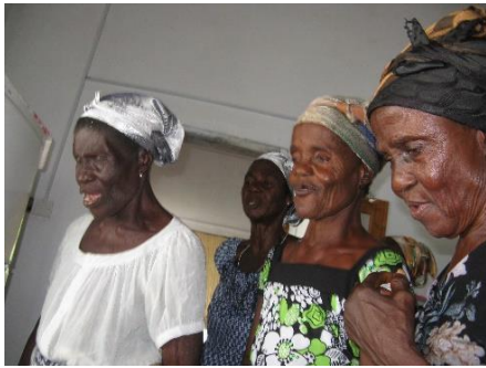
Plate 15: Watching video playback.