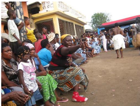
Plate 13: Audience participation in Teshie.