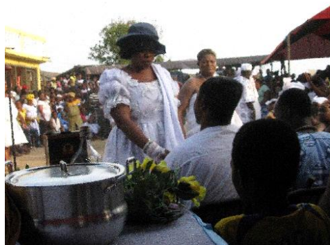
Plate.11: Woyo in British attire.

handed a horse's tail that was a visual indication that they were taking the leading role.