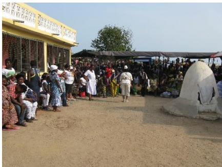
Plate 8: Teshie shrine in dance area.

The shrine is a sacred space in the centre of the community where the gods