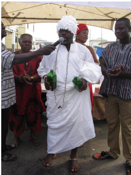
Plate 3: Wulomo. Anumansa Division, Jamestown.

There is a concept of trinity in the Kple faith, as the sky god, Nwei , is considered a male and the earth goddess, Shikpong , is female. The marriage between the two 'resulted in the birth of the sea, Nsho ', 206 whose sacred day is Tuesday when the sea is closed for fishing, a practice continued in contemporary society.