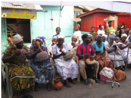
Plate 16: Adesa group Jametown.

Adesa is a Ga local communication system that uses a social drama activity where a storyteller, singers, musicians and dancers engage with the audience who become part of a performance. The drama begins with a performer's story which is constantly interrupted by musicians, singers or dancers who claim that the story-teller is lying, is wrong, or they claim, 'I was there that day, and it wasn't like that' it was like this.