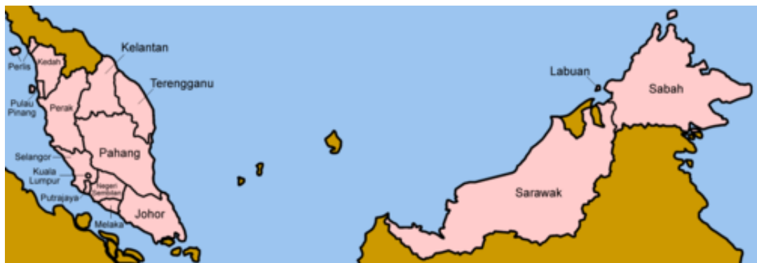
Figure 1.1 The states and federal territories of Malaysia (indicated in pink)

Malaysia is a federation that consists of thirteen states and three Federal Territories (Kuala Lumpur, Putrajaya and Labuan) in Southeast Asia. The capital city is Kuala Lumpur. The country is separated into two regions by the South China Sea: Peninsular Malaysia and East Malaysia (on the island of Borneo) (Figure 1.1). It is located within 150 km north of the Equator (Latitudes 2-7 degrees North). The climate is hot and humid most times of the year and the country is best described as tropical, with high rainfall all year round especially in the lowlands. The wettest period is between mid-November and mid-January (Bowden, 2000, 2012).