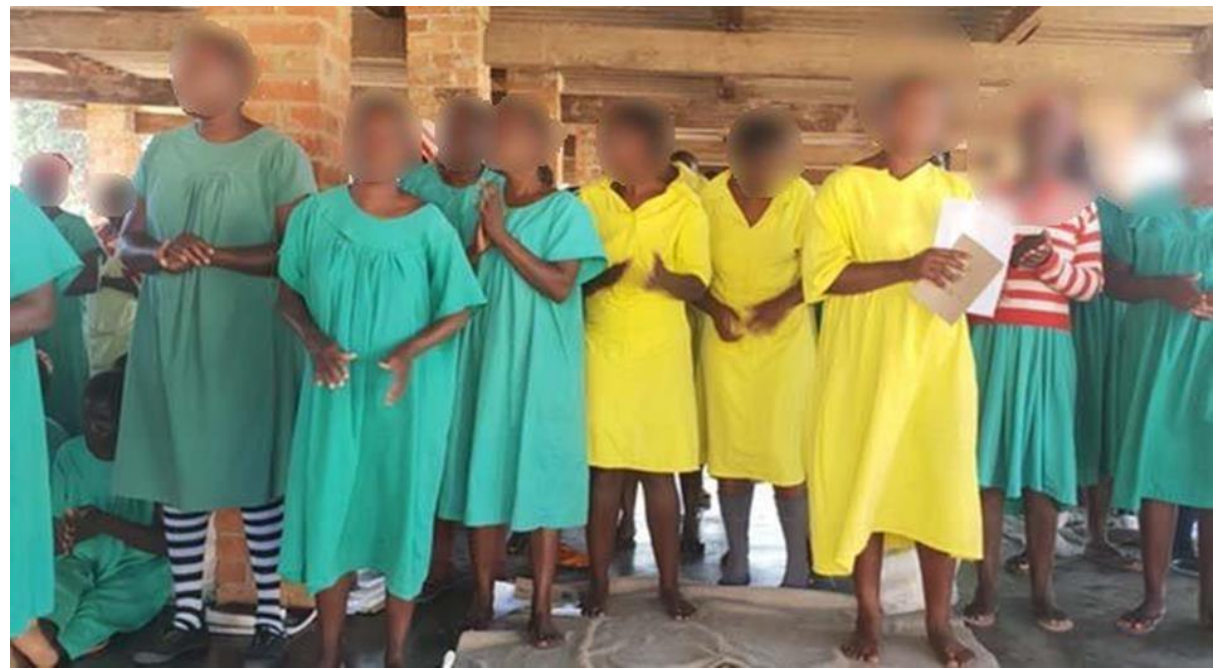
Image 3: Incarcerated women in their prison uniforms.

Until January 2021 when the prison system changed the colour of the prison uniform for women, little attention had been given to the issue of what prisoners should wear, despite prison reform efforts initiated in 1997 (Zimbabwean Prisons and Correctional Service's Act, 2023). This discussion will focus on the present tense description of the prison dress, as limited research has been conducted on the new pink prison dress. At the time of this research, women incarcerated in Zimbabwe wore either the green or yellow dress, depending on whether they had been sentenced or awaiting trial. These dresses were initially introduced by the British colonial administration when they established the prison system. The clothing served as one of the many mechanisms employed by the British to enforce a clear distinction between prisoners and the general population. Even after the end of colonial rule, post-colonial Zimbabwe inherited and continued to utilise the symbolic power of prison attire as a tool of control and social separation in various forms. The use of prison uniforms in this context serves as an example of the complex ways in which the historical legacies and practices have endured and shaped the dynamics of the nation even after its colonial history has formally ended.