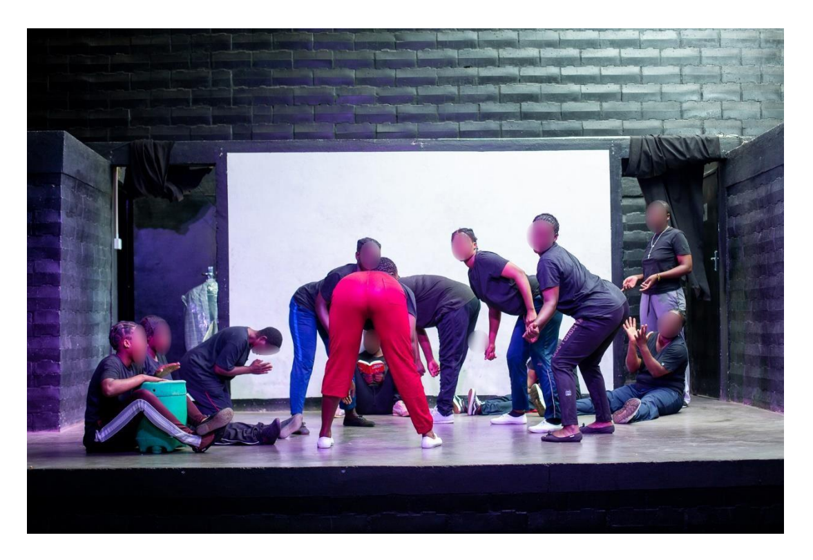
Image 5: Participants dancing in their rehearsal costumes at Jason Mphepo Little Theatre.

Through engagement with the costumes, the participants in this study discovered a unique form of self-expression which held great significance for them. Upon donning their costumes, they became intentionally performative. During these fleeting moments, the harsh realities of their daily lives behind bars seemed to fade away, replaced by a new sense of freedom of expression.