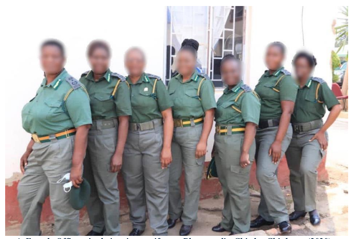
Image 4: Female Officers in their prison uniforms.

The distinction between the attire worn by prisoners and that of the prison officers reveals a complex network of power relations that is manifested through the medium of dress. Below is a picture of the prison official's uniforms.