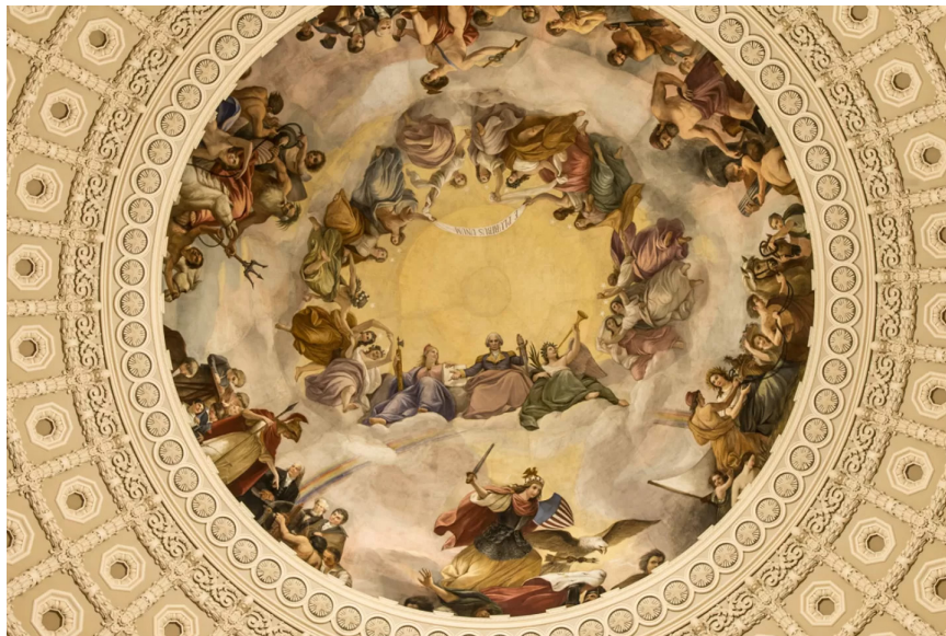
Figure 1: Constantino Brumidi's 'The Apotheosis of Washington'

The painting I have in mind for this purpose is the 'Apotheosis of Washington'. The European artist Constantino Brumidi painted this particular artwork at the end of the Civil War in 1865. 263