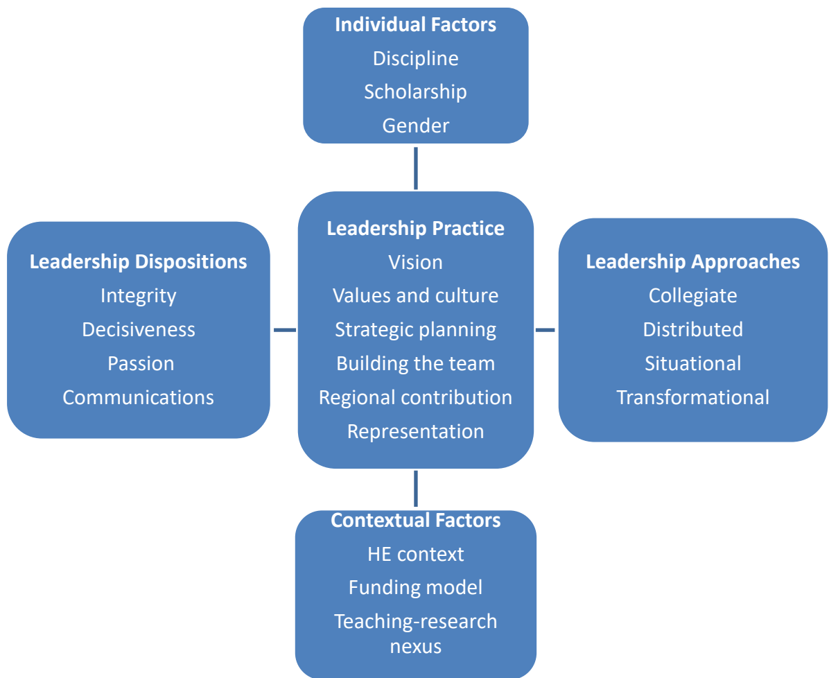
Figure 6.1: An Integrative Model of Higher Education Leadership

The vertical axis of the model describes the individual and contextual factors which mediate leadership practice. While this study investigated the influence of many individual factors, the three dominant ones were discipline, scholarship and gender. The final part of the model proposes contextual factors. By definition, contextual factors will be situationally or contextually dependent. However, the three elements identified in this study are framed as more general themes, in order that they may have wider application. These three elements are: higher education context; the funding model and the teaching-research nexus. While these will have different manifestations in various higher education settings, at a high level they describe the categories of contextual factors that may be capable of being applied in other higher education settings.