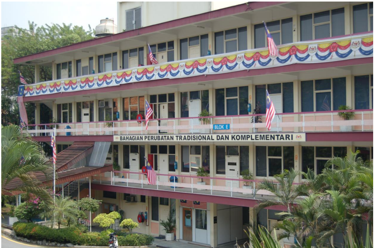
Traditional and Complementary Medicine Division, Malaysia was established in 2004.