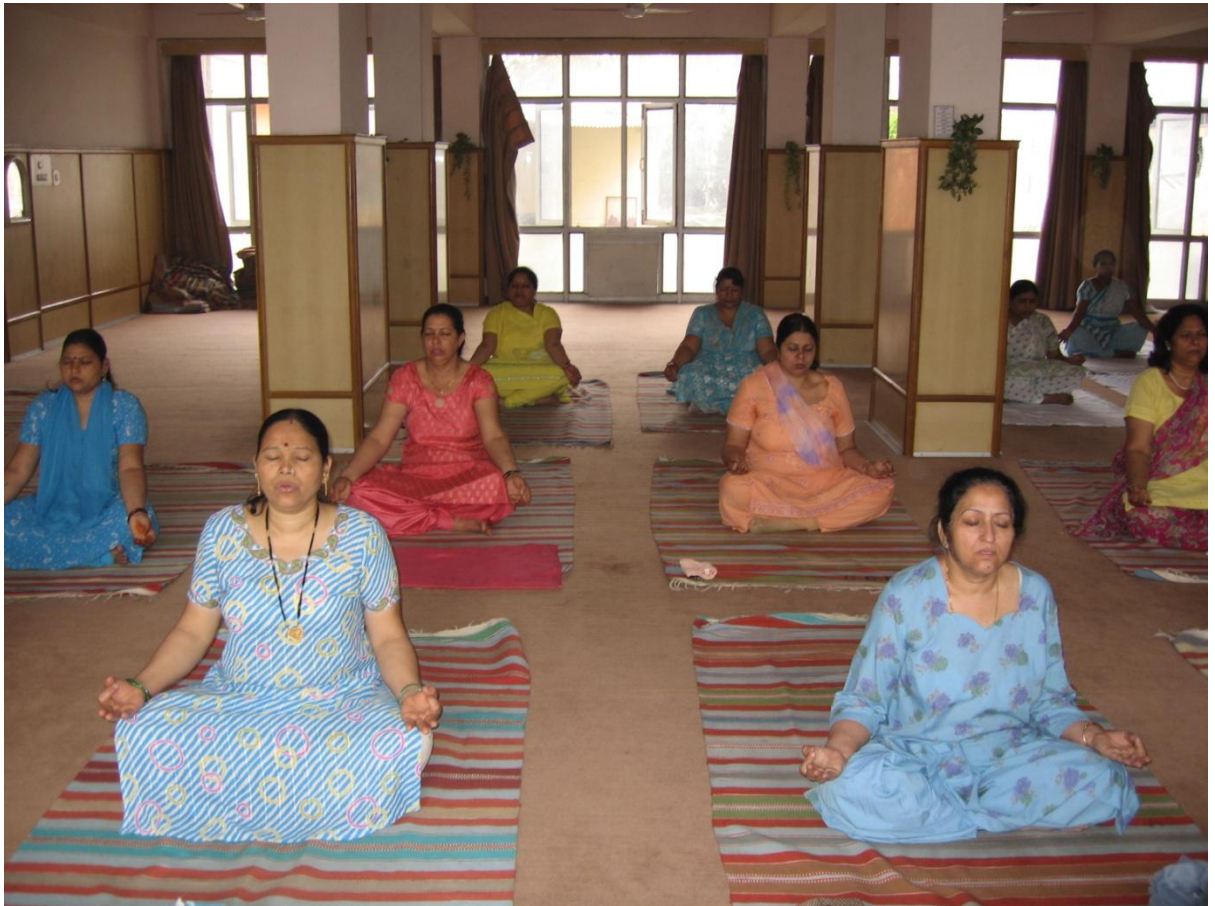
A group of Indian ladies practise yoga in the lifestyle intervention centres in the Department of Ayurveda, Yoga and Naturopathy, Unani, Siddha and Homeopathy, New Delhi, India.