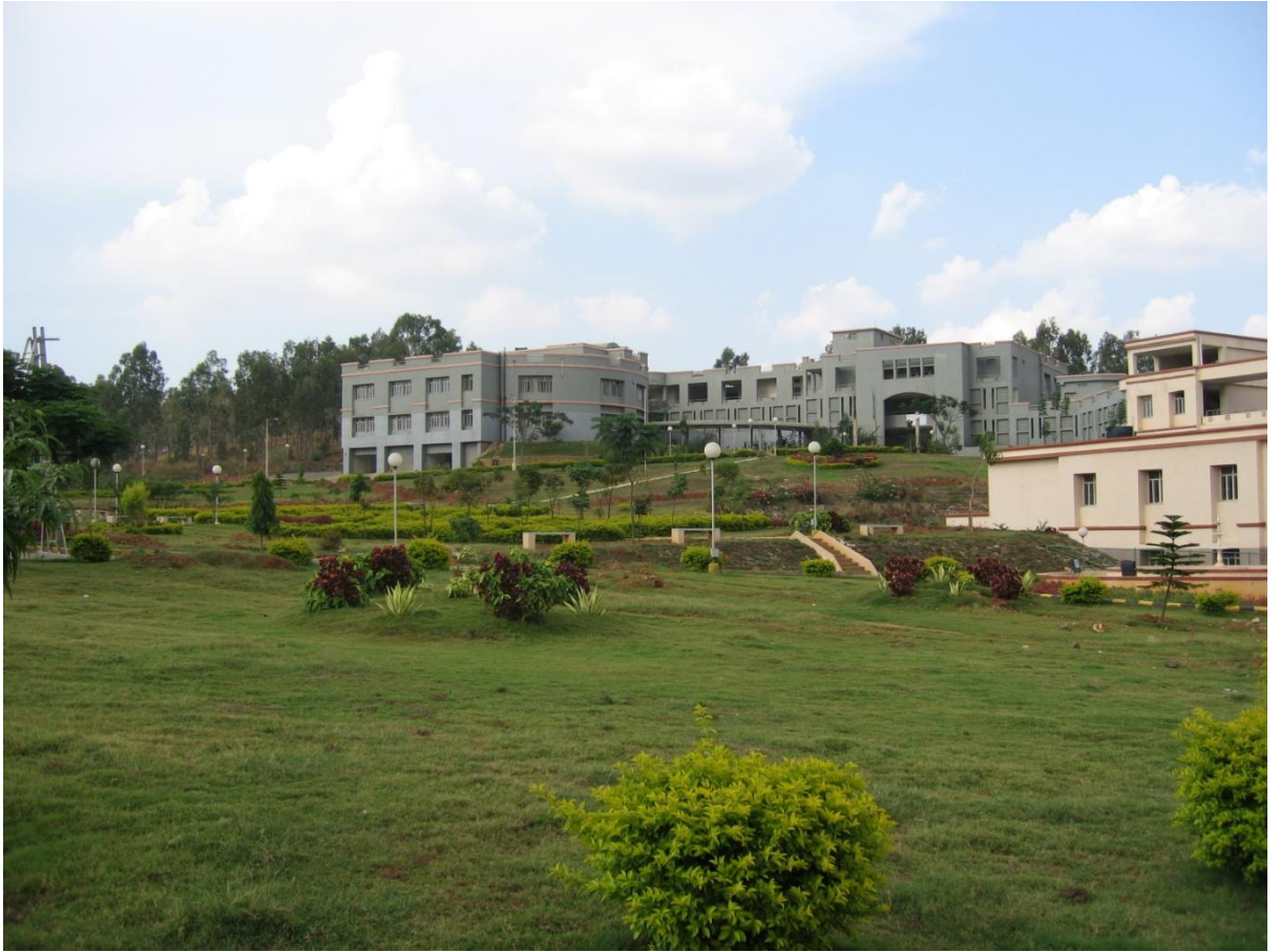
A photograph shows one of the Indian national institutes, National Institute of Unani Medicine, Bangalore, India.