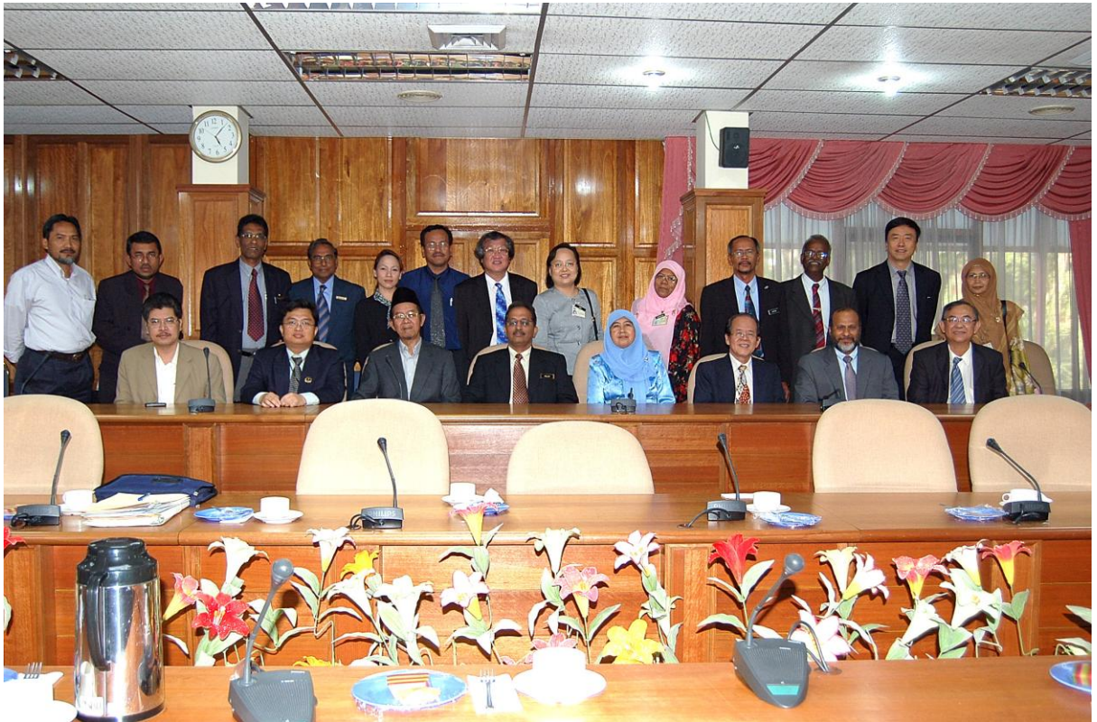
The Standing Committee of Traditional and Complementary Medicine Division, Malaysia, of which is chaired by the Deputy Director General of Health (Research and Technical).