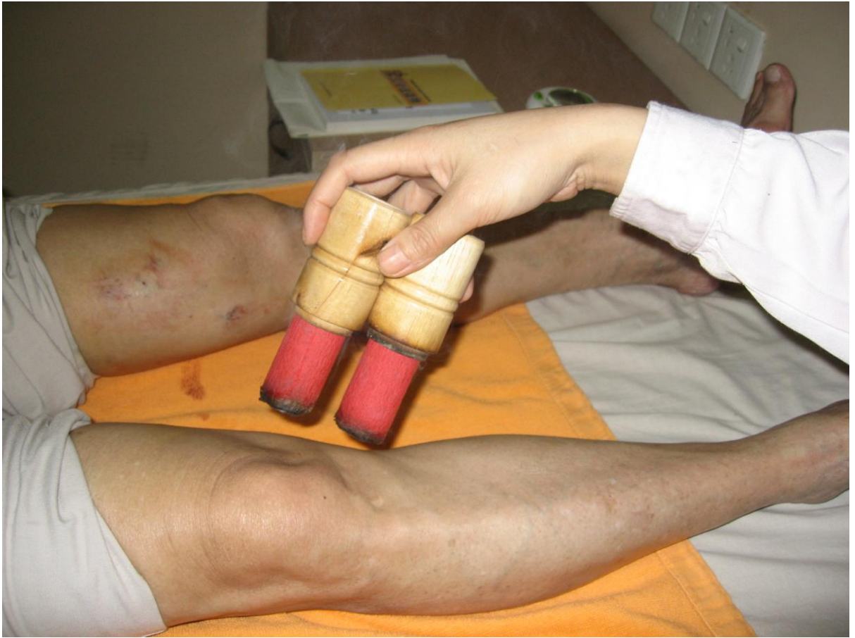
A patient receives moxibustion at an acupuncture clinic in the Guangdong Provincial Hospital of Traditional Chinese Medicine, China.