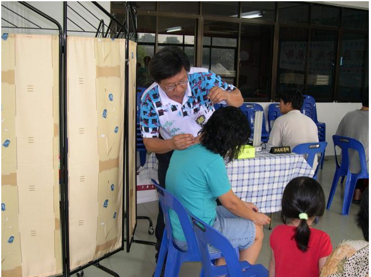
A Chinese medicine practitioner applies acupuncture over the lower part of the neck of a female patient in a charity activity in Bukit Mertajam, Malaysia. This charitable clinic is organised by a religious society (宗教慈善团体) known as 'Bukit Mertajam Moral Uplifting Society' (大山脚德教会).