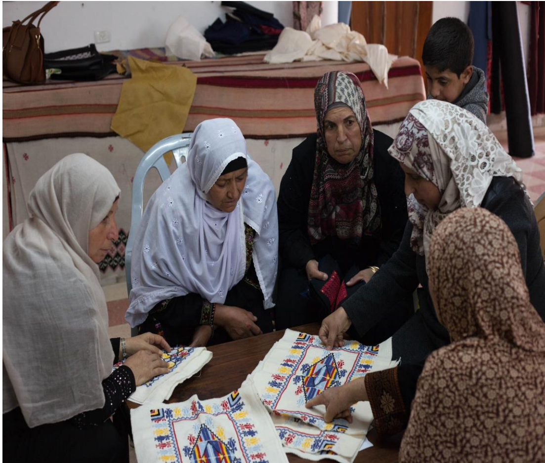
Figure 33 Grandmothers, from different villages of Hebron (22/12/2017)

I have provided many examples throughout the thesis where the family elders, that is, fathers, brothers and extended male and female relatives including mothers-in-law are responsible for protecting the honour of young female members of the clan. 34 There are harsh restrictions on the mobility and socialization of an unmarried woman introduced by her family. Depending on the level of the conservativeness of a given family, schooling (especially after secondary education) and working outside in almost any activity that involves the public presence of a gendered body can be an issue that needs to be negotiated within the family and is subject to the approval of males.