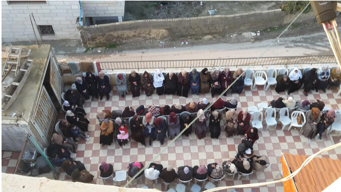
Figure 24 The Grieving Ceremony (10/01/2018)

During the five-day-long grieving period, almost all the female community members (hundreds of people) visited our courtyard, some (the close relatives) stayed until midnight. As the figure illustrates, the courtyard looked like a tea garden with dozens of women lined up on white plastic chairs while young females were serving some coffee and sweets. The grieving rituals set for males were different from females who went to the mosque for the funeral prayer followed by a visit to the graveyard. When I enquired about the rituals that males should accomplish, I was told that there was a second males-only gathering space further away in the village.