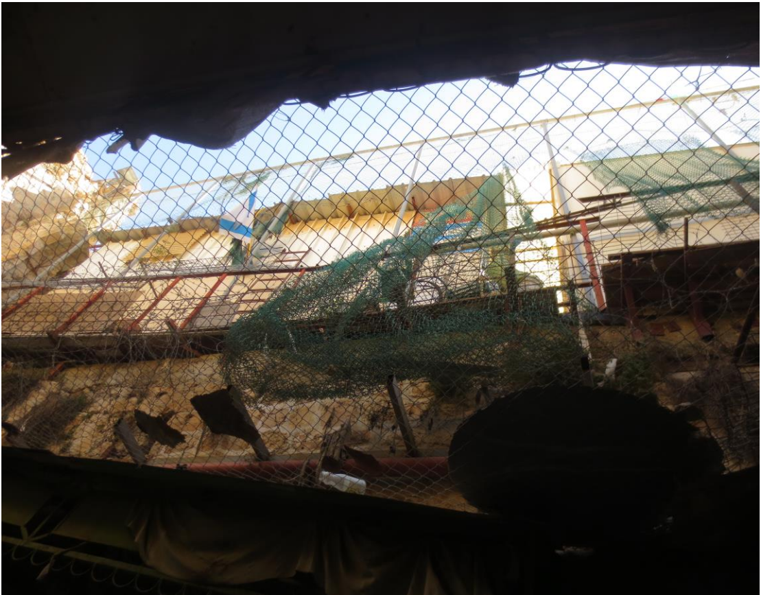
Figure 13 Old City Market, Hebron (15/11/2017)