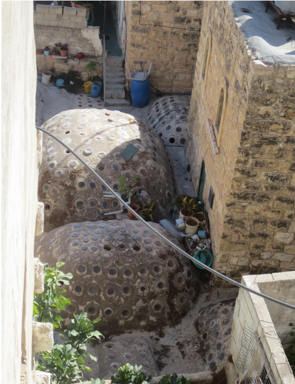
Figure 16 Ottoman Baths, Old City Hebron (15/11/2017)

Endurance sometimes make you jump over roofs to enjoy a hot bath as well as reclaim the walls and stones of homeland by graffiti (Peteet, 1996). How people endure precarious conditions, which focuses on subversive politics in the sense of the propensity to resist structural inequalities or vault and improvise despite them, has spatial dimension that contain anticolonial sentiments. By enduring the occupied landscape, Palestinians affirm life for land and freedom. It is neither smooth nor free of conflict, yet a profound embodied experience that connects people and spaces in affective ways with the hope for possibilities