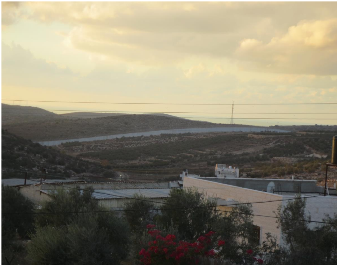
Figure 21 The Occupation Wall, Hebron (12/12/2017)

Partaking in everyday life let the constant mood of insecurity and confinement gradually fade away in order for us to survive. I pursued a ‘normal life’ whatever it might entail in an occupied context (Allen, 2008; Richter-Devroe, 2008). Darya, three of her children and I climbed up the roof for a better view as we brainstormed potential changes in the garden and the best spot for another birdhouse. No one else in the rooftop seemed to be interested in the view of the occupation wall yet they patiently waited for me as I took some pictures. Perhaps the situation was too obvious to make any verbal comment. Perhaps a ‘flat affect’ where stuckness and stillness translated as tacitness: ‘Multiple forces converge; yet things remain out of joint. History is not adding up to something, but resonates in a hovering, over-determined environment where unresolved effects suture the scene in which plot plays out’ (Berlant, 2015: 192). Even so, Darya’s silence was a bit of a surprise to me given that she came from a politically engaged family and her husband was employed by the Palestinian Authority.