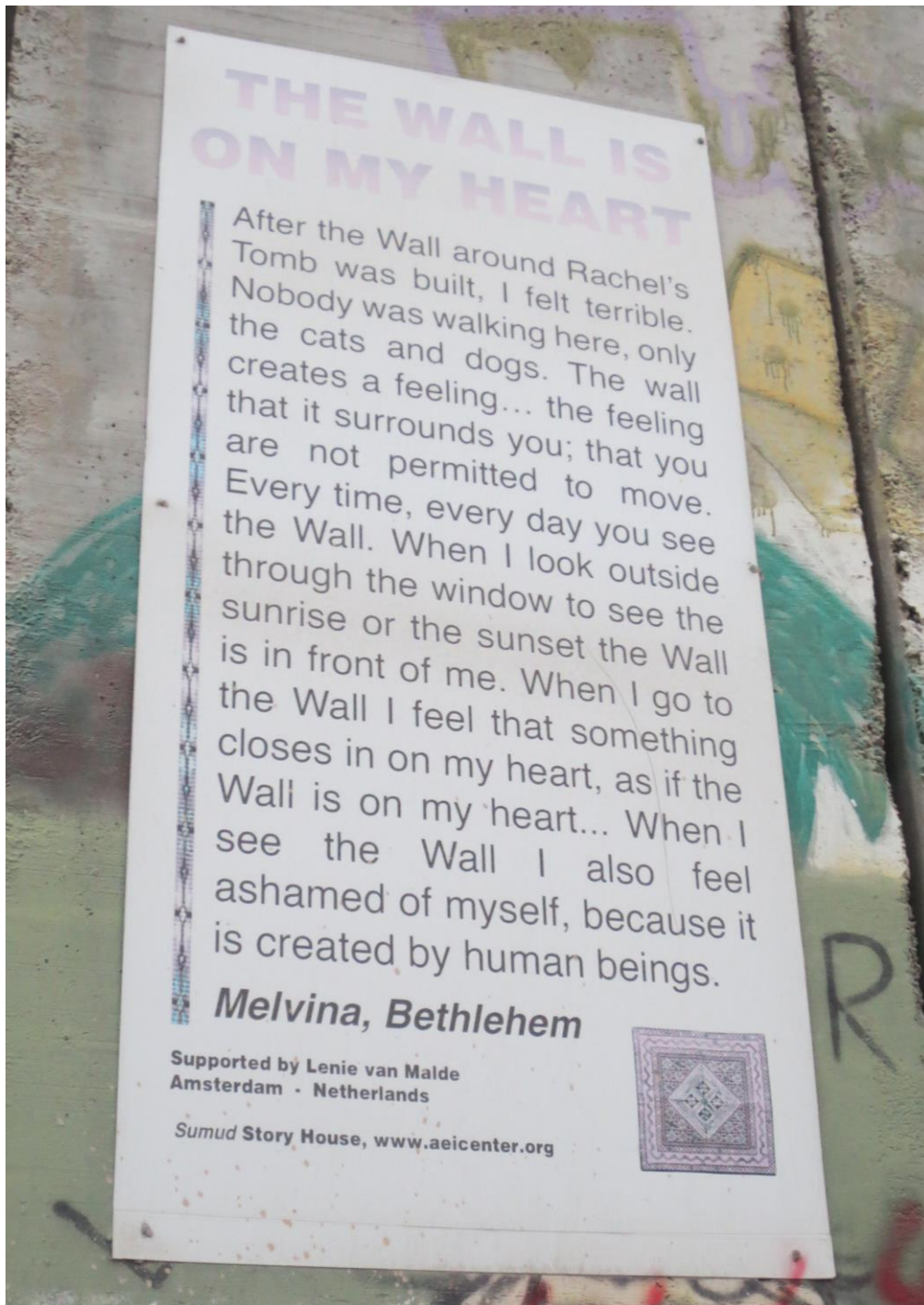
Figure 17 "The Wall is on My Heart" Sumud Project, Bethlehem (30/11/2017)

of movement and struggle. Here, the Sumud Project curated by Palestinian artists where the apartheid wall circles in Bethlehem gives more insight into the emotional aspects of perseverance amidst hardship.