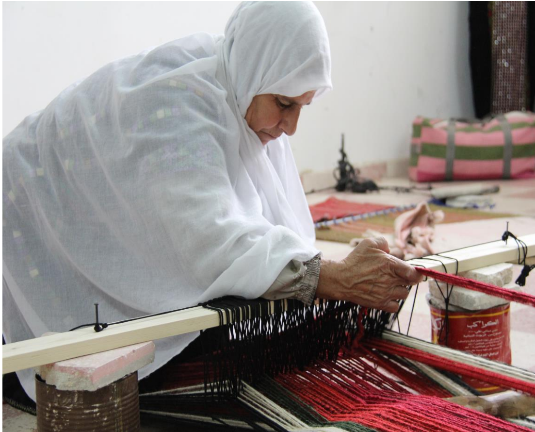
Figure 30 Handmade Palestinian Rugs, Village, 2018.

As Aysa suggested, older generations are more tempted to link handcrafting to Palestinian heritage, therefore it is important to hand it down to the next generations. All the women I spoke to learnt embroidery from a female family member, from their mothers, grandmother or mothers-in-law. ‘I learnt embroidery from my grandmother. Embroidery is art. We need to protect Palestinian heritage’ (Rauda, 47). ‘Embroidery is like art for me. I am happy that I can earn money by doing art’ (Maryam, 37). ‘Embroidery means income to me first. Also, I like it in the same way that I like the land. Embroidery has roots in our lives (interview 2017)’ (Wafa, 60).