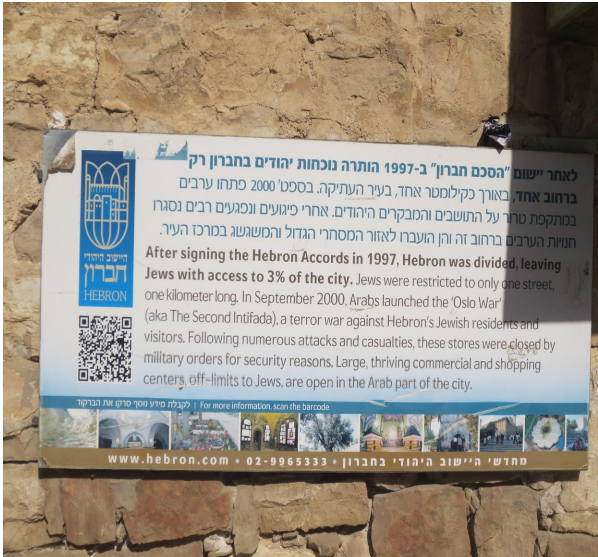
Figure 5 Shuhada Street, Old City Hebron (15/11/2017)