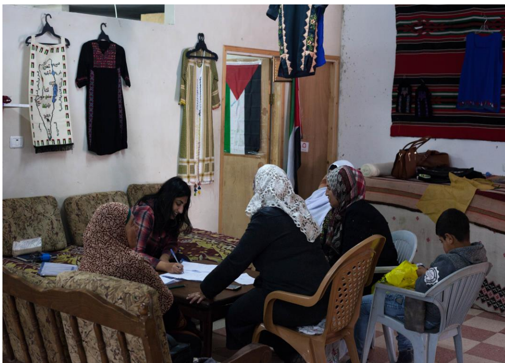
Figure 32 Interview, Cooperative (22/12/2017)