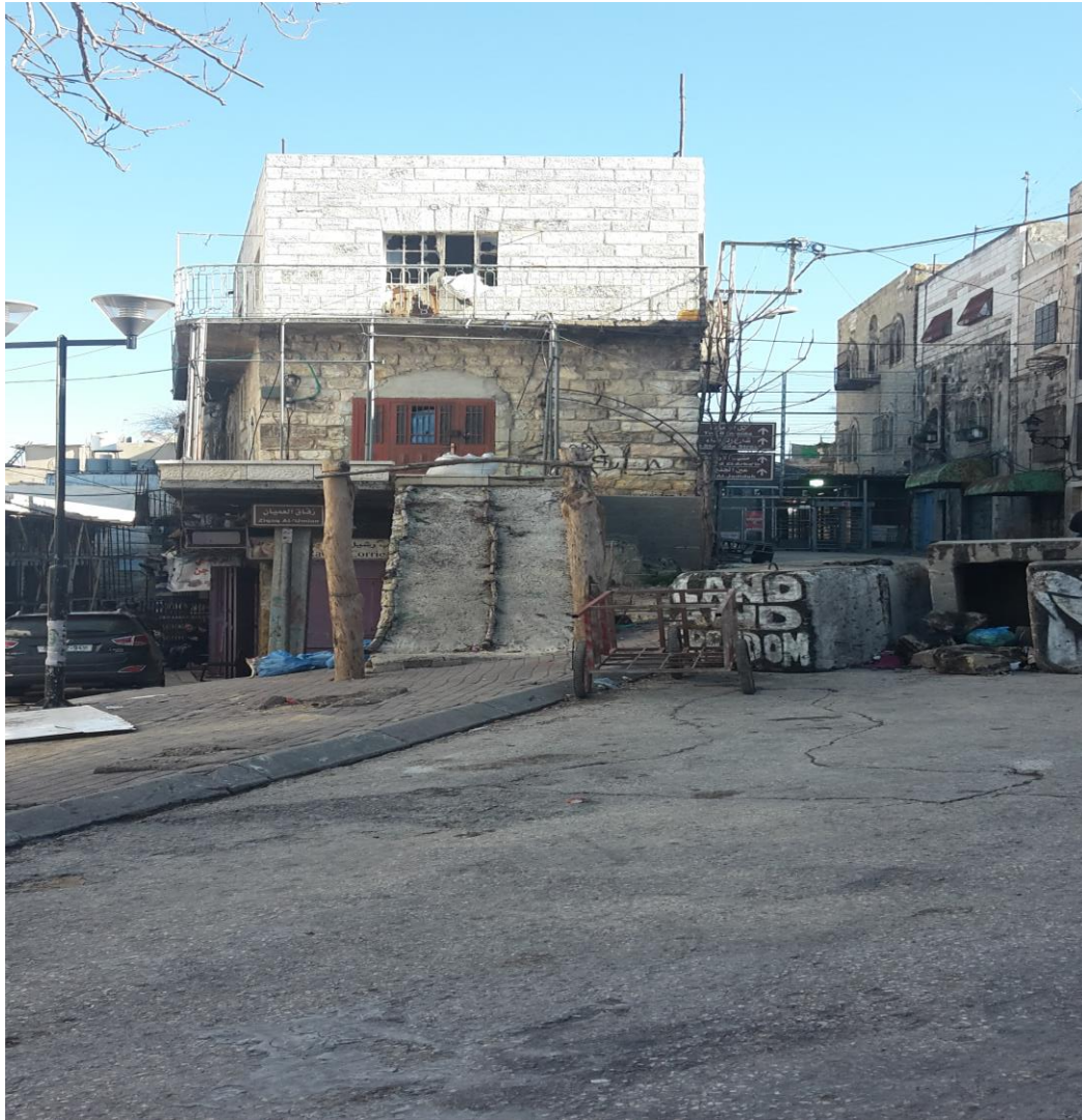
Figure 15 "Land and Freedom", Shuhada Street Checkpoint (15/11/2017)

With the Old City gradually taken over from Palestinians and made into a ghost town by the Occupation forces, into a designated enclave for the pious settlers backed by the military presence, the presence of Palestinians living in the area under Israeli control is reduced to 10.000 from 40.000 in the last decade (according to our tour guide). The landscape of Hebron is closely knitted to the struggle for free home/land ('land and freedom'). During the walk, we passed by the Turkish baths made during the Ottoman rule which our guide made me notice and added: 'The entrance door is on the Shuhada Street, though, so no longer accessible to us. Palestinians can get in via the back door if they manage to jump over a couple rooftops,' and finished his sentence with a bittersweet smile: 'Palestinians can take a shower if they can access to the baths.'