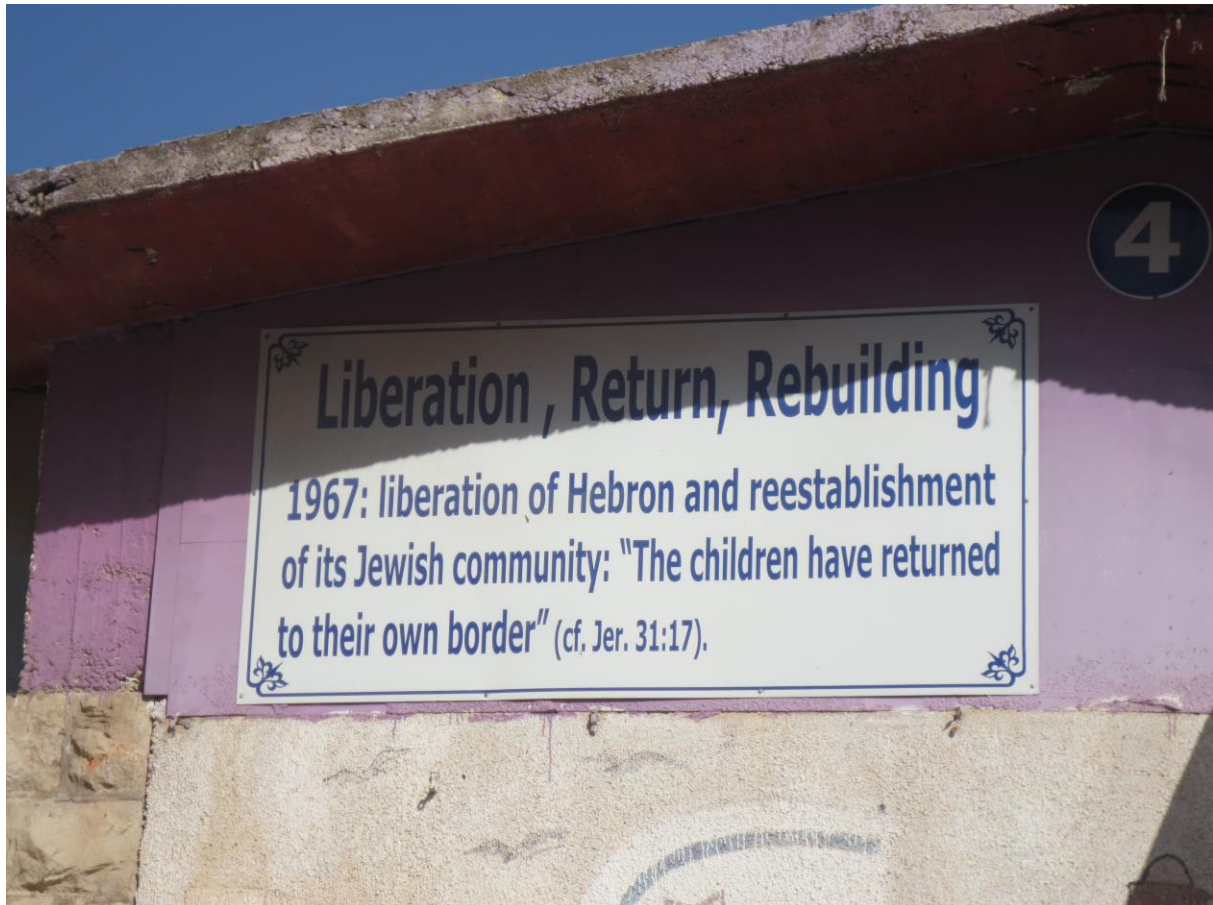
Figure 6 "Liberation, Return, Rebuilding" Old City Hebron (15/11/2017)

The figures above capture some of the settler sentiments that meticulously dismiss the 1997 massacre and instead propose the exact year as the time period that Jews lost access to the space. So, reclaiming the land with reference to the sacred texts ('the children have returned to their own border') becomes an act of everyday border making that requires constant violence eliminating any other alternative claims to space and space making in Hebron.