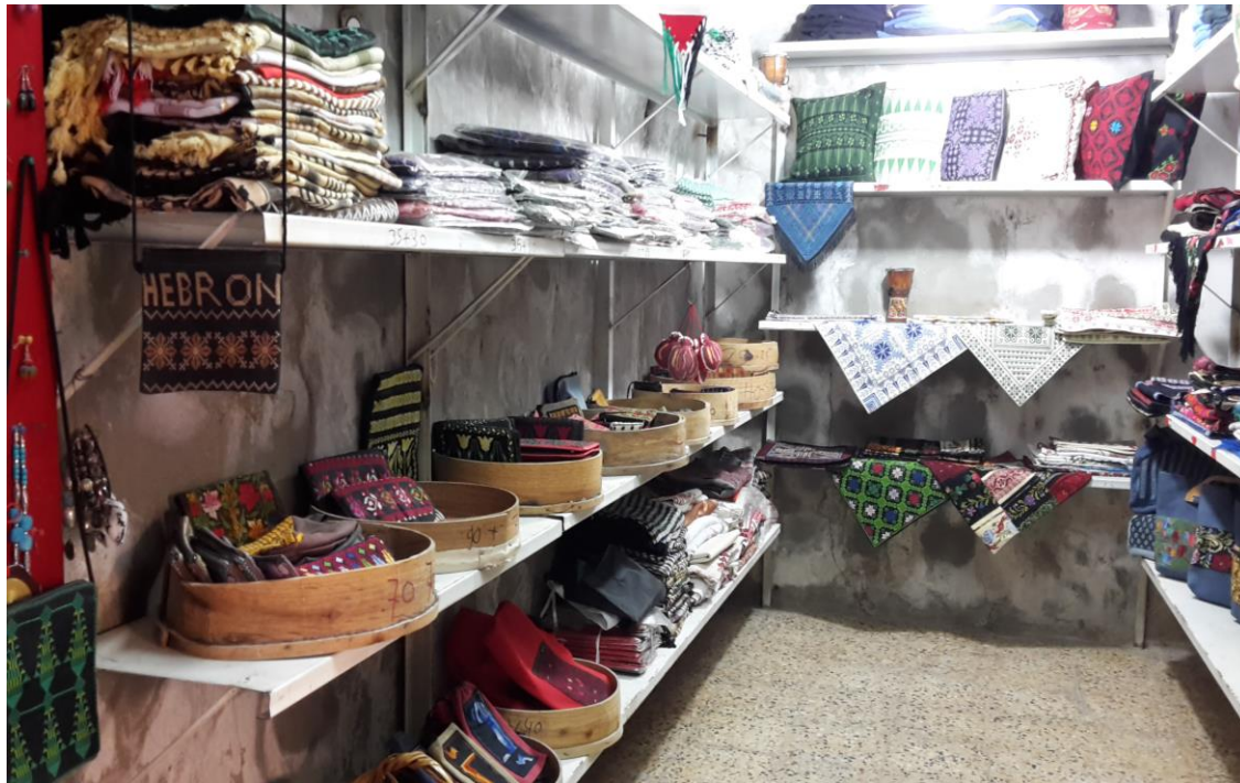
Figure 26 Cooperative’s Shop in the Old Quarter of Hebron (21/11/2017)

prominent intersecting lines of continues source of sadness in Palestinian women’s lives. The moments that women feel stuck, blocked, immobile, choked, limited, incapable, powerless and frazzled, all the different manifestations of sadness in everyday life, require a Spinozist account of how power operates over gendered bodies. To that extend, I pay attention to the shared moments of laughter, joy and yearning in the cooperative (and beyond) as antidotes to gendered exploitation.