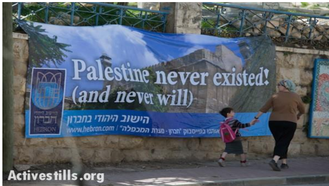
Figure 1 Shuhada Street Old City Hebron

resembling the features of colonialism, and ‘the separation principle.’ At this point, the latter requires more of our attention to understand ‘the recolonization of Palestine’ (Veracini, 2013). The separation principle overlaps with the vertical politics where Israel has no interest in the lives of Palestinians, but only in the extraction of resources and land confiscation.