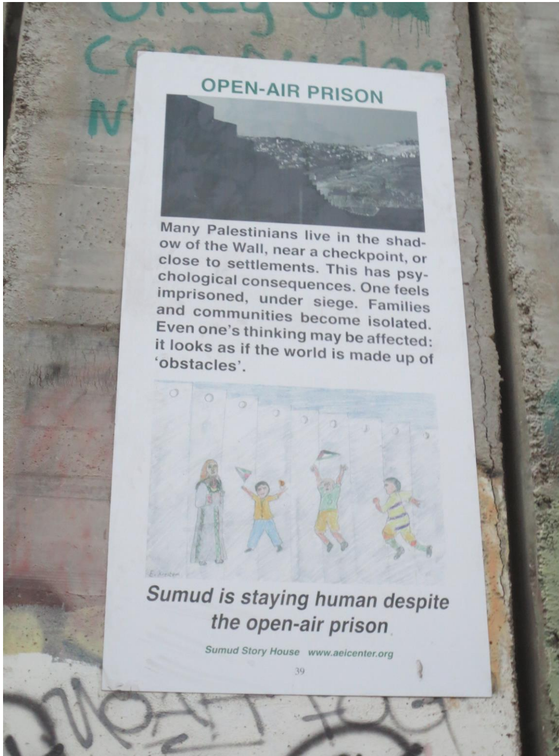
Figure 18 "Open-air Prison" Sumud Project, Betlehem (30/11/2017)