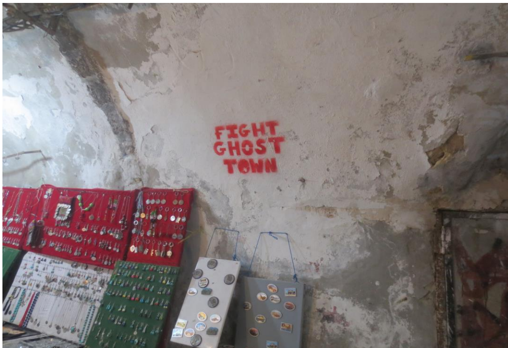
Figure 4 "Fight Ghost Town" Old City Hebron (15/11/2017)

Hebron was divided into two areas: H1 and H2. The control of H1 was shifted to the Palestinian Authority and H2 remained under Israeli military control. ‘The H2 area is inhabited by approximately 35.000 Palestinians and 500 settlers living in four downtown settlements inside the Old City. The Palestinian population in H2 is declining due to the impact of Israeli measures including extended curfews, restrictions on pedestrian movement and the prohibition of vehicle movement and closure of shops and other commercial buildings, all of the above applying only to Palestinian residents. All Palestinians in area H2 are under the military law while Israeli settlers under Israel’s civil law.’ 17 Along the way, we passed by the symbolic markers of stubborn though fading Palestinian presence reclaiming an entitlement to the space.