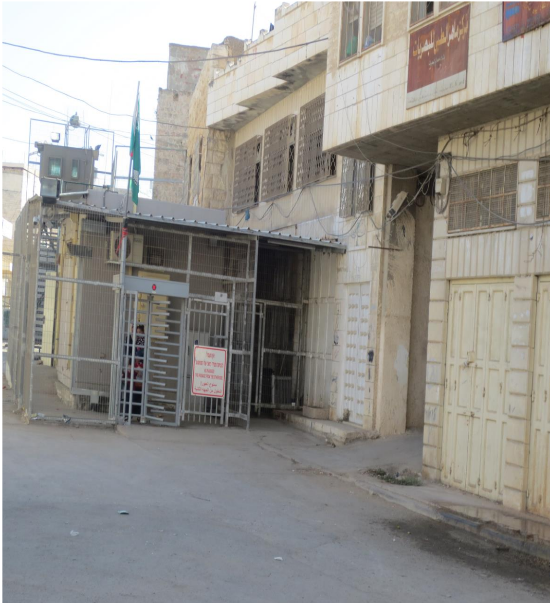
Figure 14 Shuhada Street Checkpoint (15/11/2017)

When I finally passed the last checkpoint of the tour, where I had to explain why I visited the Old City of Hebron, I turned around, still quite dazed and woeful that the settler colonial occupation existed. It was then I saw the Palestinian graffiti on the hard rock barricade ahead: ‘Land and Freedom.’