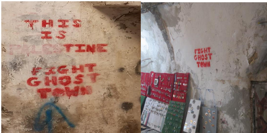
Figure 25 “This is Palestine - Fight the Ghost Town” Graffiti, Hebron (15/11/2017)

The cooperative's shop in the Old Quarter of Hebron is where women sell embroidered handicrafts produced in the cooperative. Once you get off from the service –the shared taxi that is the only available public transportation between villages and Hebron centre– at the terminal, the cooperative's shop is a 15-minute walking distance from Bab-a Zawiya in the Old City surrounded by checkpoints, settler houses, pedestrians, cars and closed streets. In 1997, the Hebron Protocol divided the city into two sectors: H1, controlled by the Palestinian Authority and H2, roughly 20% of the city, administered by Israel that facilitates more Orthodox Jews to settle in the Old City and nearby settlements. Since then, the old quarter that used to be a cultural centre and hub of trade has had 'fight the ghost town' stencils on the ancient city walls under Israeli military domination.