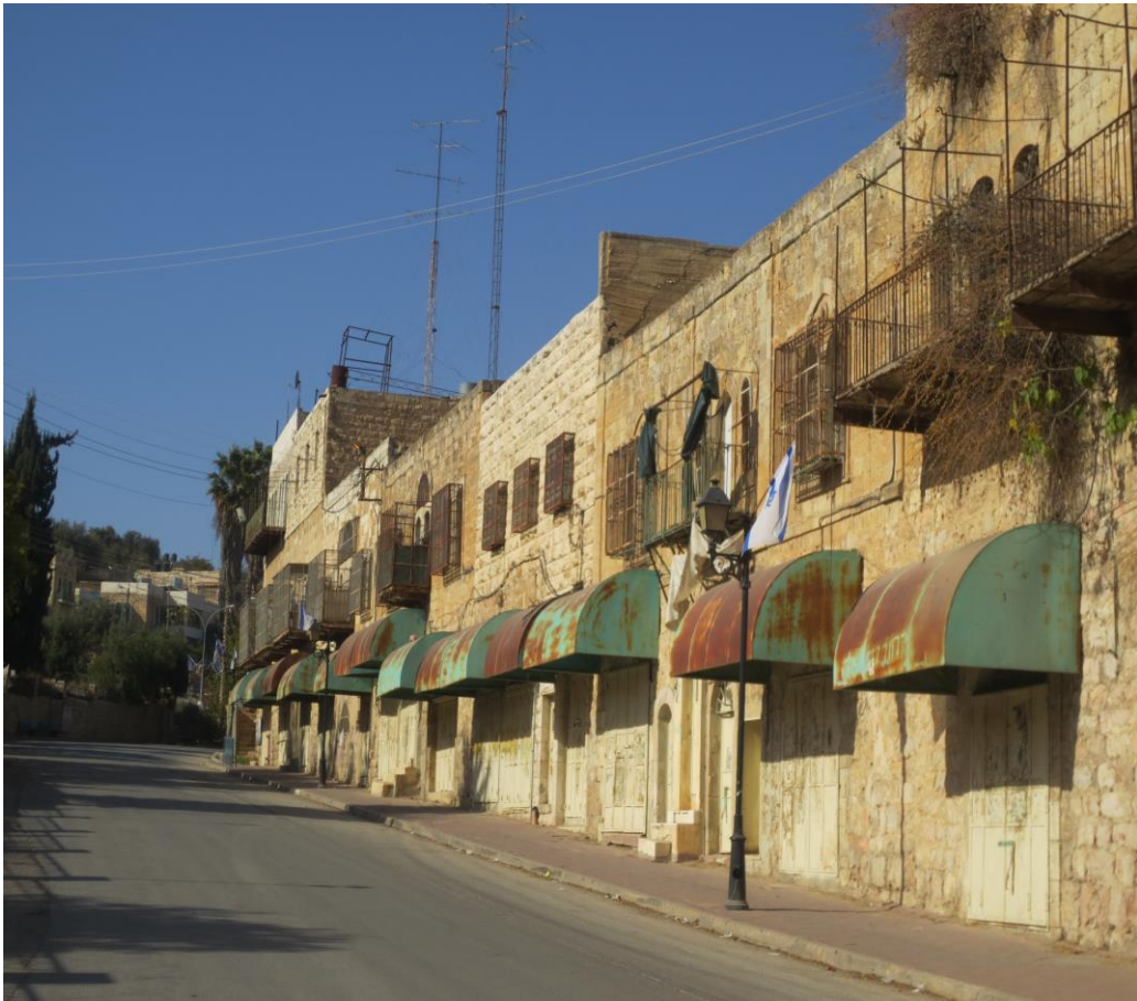
Figure 11 Shuhada Street, Old City Hebron (15/11/2017)

When we arrived the Shuhada Street, our Palestinian guide had to leave as it was closed to Palestinians and walked up the street alone, crossing the check point to meet us on the front. Currently, this area is the main entrance to the Avraham Avinu settlement, which makes it one of the most highly controlled areas that is completely closed to the Palestinian access, except the ones who live in the area of H2 and whose mobility is monitored by the checkpoints. It is the largest settlement in the Hebron city centre, located in the heart of the Old City between the Al-Shuhada Street and the main street of Casbah. Palestinians endure living under Israeli military control; they are not allowed to have any visitors, including relatives from the H1 part of the city, harassed by settlers and soldiers, and children cross several checkpoints every day to go to school. Several windows from settler houses look out on the street, so the Palestinian municipality installed protective nets to ensure the safety for visitors as well as the shopkeepers exposed to trash thrown out of windows. The metallic protection network covered the sky for us throughout the Palestinian market, materializing the divisions and tensions over space in the Old City.