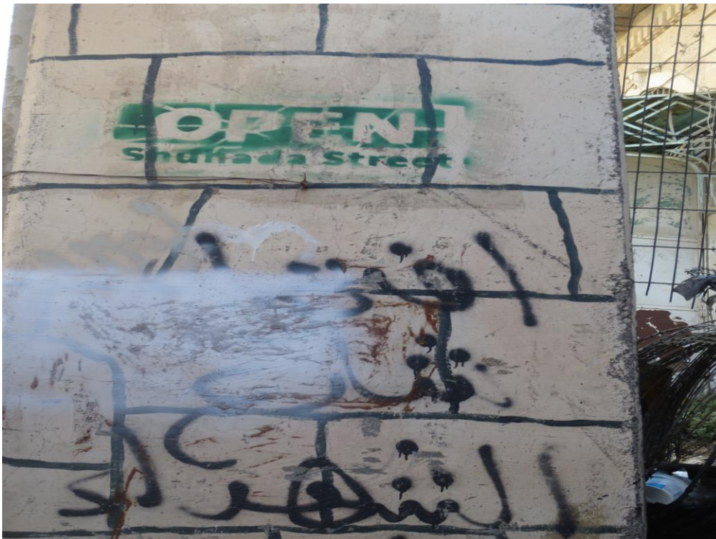
Figure 9 "Open Shuhada Street" Hebron (07/12/2017)

Hebron's old city became the target of a plan by Jewish settlers, backed by the Israeli state, to "Judaize" it. Under military occupation-with prolonged closures and curfews and daily harassment by settlers who have occupied buildings by extrajudicial and often violent means -the old city has progressively declined from a bustling market town to a melancholy and deserted place, streets sealed off with cinder block, razor wire, and concrete-filled oil drums. The old city's infrastructure has been deliberately neglected, its buildings allowed to deteriorate. Faced, too, with a worsening economic and physical situation, many of the Palestinian inhabitants of the old city have moved to safer areas. Those remaining are now in desperate need of support to make their homes habitable and to resist the aggressive efforts of the settlers to demolish and replace entire quarters of the old city (Sellick, 1994: 70).