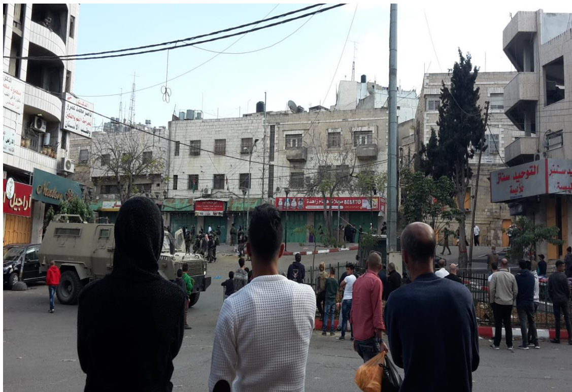
Figure 7 Sarah's Day, Hebron (25/11/2017)

The first incident was the Jewish holiday of Sarah's Day when thousands of settlers flocked to the city centre from nearby settlements, other parts of historical Palestine and overseas. Unaware of the increased harassment and violence endured especially during the Jewish holidays, I happened to be passing by 'the settler parade'. To understand what was going on, I approached to a Palestinian standby, among many others, watching the cruising settlers accompanied by army forces. His answer/conclusion was short and painful: 'Settlers having fun.'