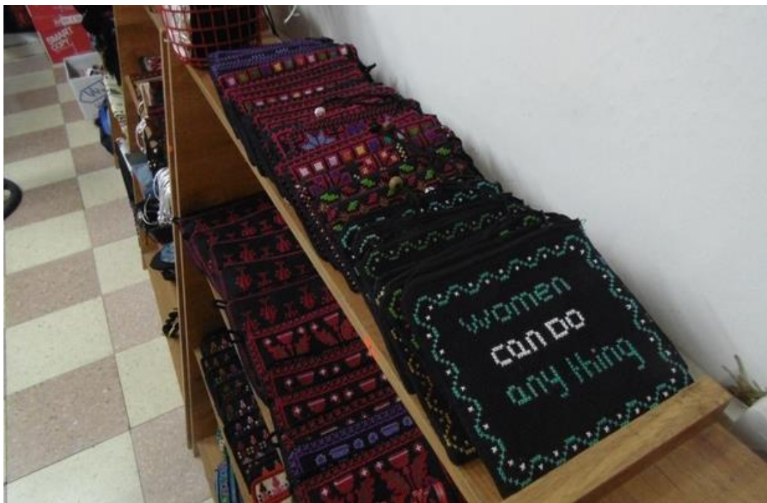
Figure 31 "Women Can Do Anything" Purses, Cooperative, (07/01/2018)

As part of this commodification, they embroidered ‘Make Apartheid History’ tote bags without necessarily knowing what apartheid means. As one interlocutor acknowledged the change over the meanings of stitching embroidery: ‘Embroidery is linked to the heritage of Palestine. In past, there were only embroidered dresses and blankets, but today we are making new designs like bags, purses and so on. It is also an income (interview 2017).’ Whether it be taking roots in Palestine or benefiting from your hobby, there could always be unintended, public consequences of seemingly private acts as the content (and circulation) of the action is not always reducible to the spaces that acts take place (Staeheli, 1996). Women from the villages of Hebron who endure very strict patriarchal norms that confine them home stitch ‘Women can do anything’ on small purses, which is one of those acts with public and political consequences.