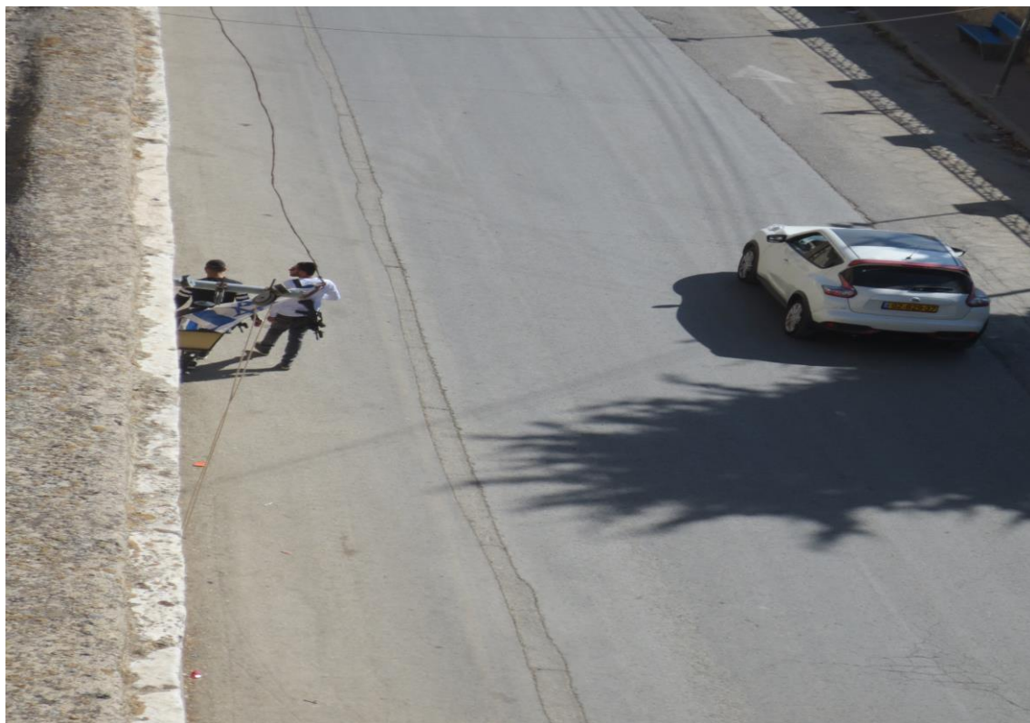
Figure 8 Settlers, Old City Hebron (15/11/2017)

For those of us who were privileged enough to walk the walk in Hebron, we reached the Al-Shuhada street, which had been closed off to Palestinians for a decade now. We stopped by the Christian Peace Makers to gain more insights from the Palestine fighting to make a living in the Old City on daily basis. They allowed us to go up to their rooftop to have the whole picture, that is, the living apartheid. I immediately noticed the soldiers pointing their guns at us from the rooftop of a nearby military base. I tried to calm down myself, pondering the idea that although the tour guide and I might look suspicious, we might not get shut this time given the white European look of the other two participants. We were warned in the first place that taking pictures was not welcomed by the soldiers. In the maximum ten minutes that we spent on the rooftop, I managed to capture two settlers passing by. I knew that settlers in the West Bank were given guns by the state, yet it was still shocking to eyewitness them walking around in daylight.