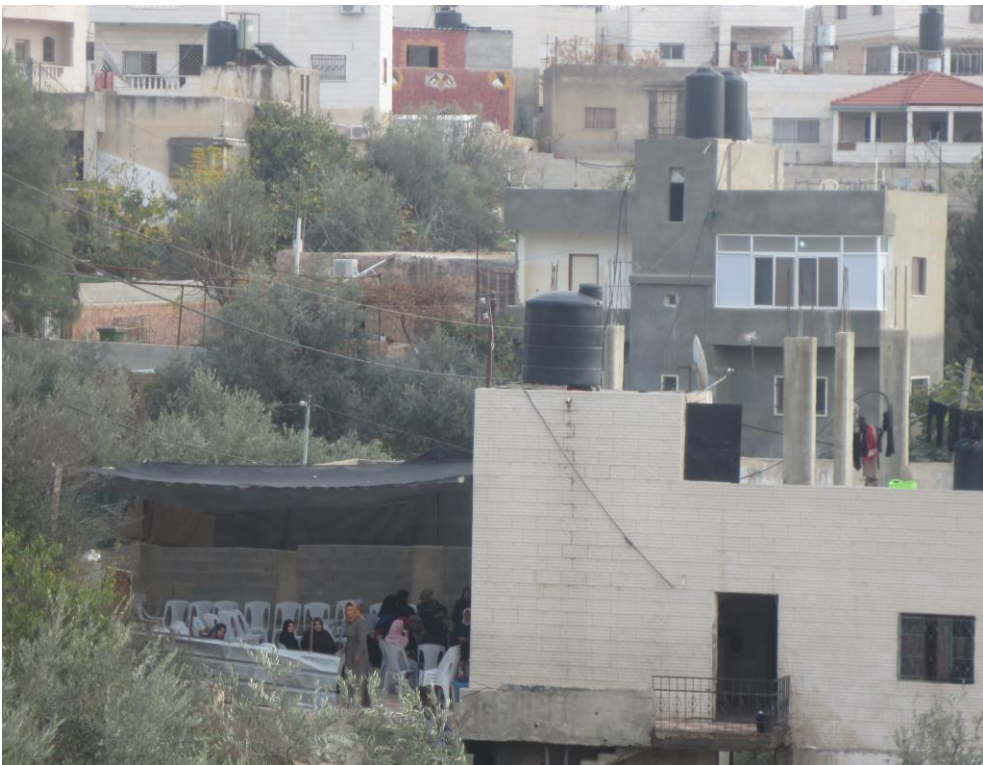
Figure 29 Courtyard, Village (15/12/2017)