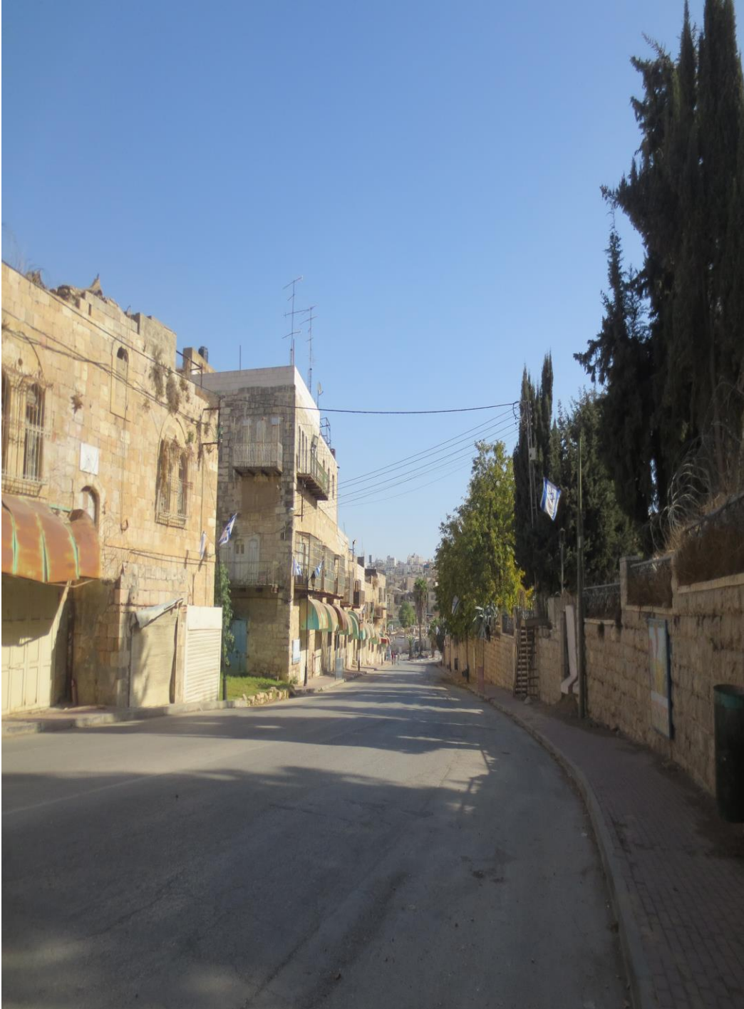
Figure 10 Shuhada Street, Old City Hebron (15/11/2017)