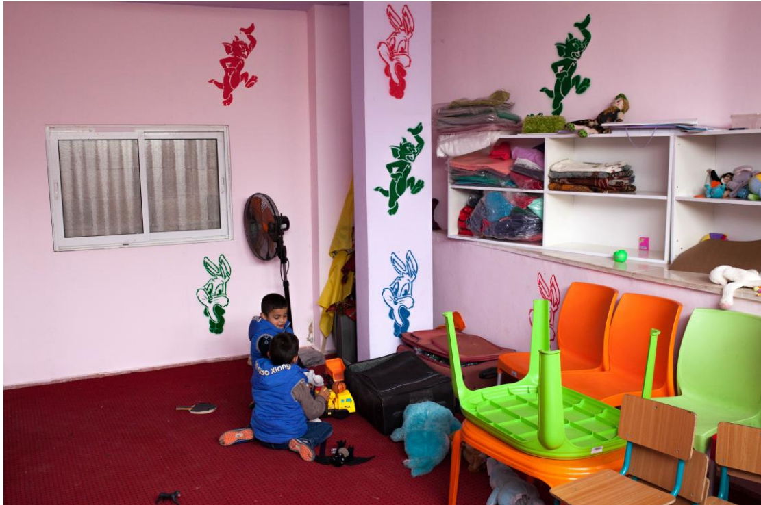
Figure 35 Playroom. Cooperative (15/12/2017)

The playroom in the figure above, made possible by international grants, is of crucial importance as women usually bring their kids. In the absence of spaces of sociality outside the home and patriarchal restrictions on mobility, I foregrounded Women in Hebron as part of the political struggle over space, making room for women's agency. During the three months I spent in the cooperative, I asked the women questions about work, embroidery, life at home and in general. We talked about if they liked making embroidery and in what ways it empowered them. We also discussed different patterns of embroidery, how the traditional motifs and colours could be applied to contemporary designs. They could easily tell, for example, the difference between embroidered works that were produced in the different parts of Palestine. We drank several cups of tea over hours-long conversation fed by jokes. Those collective moments of joy were the times we felt more capable in life.