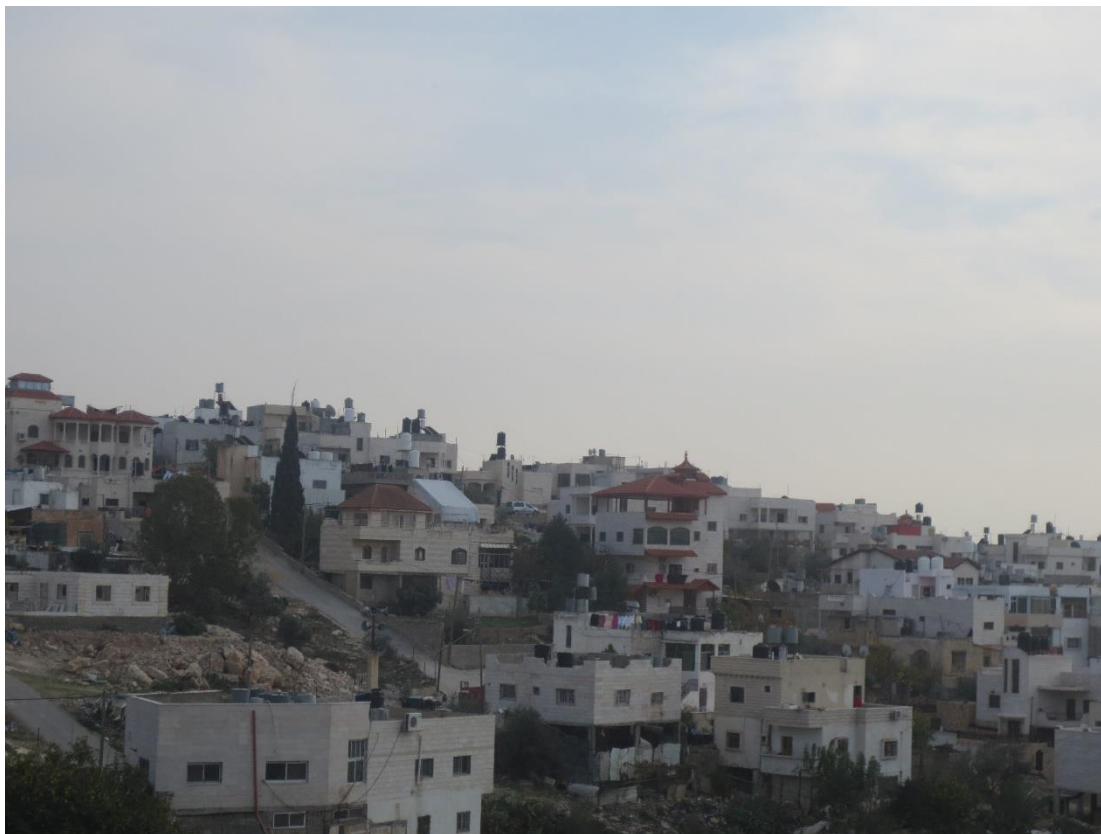
Figure 23 View of the Village (10/11/2017)

another. A courtyard may or may not be open to the use of extended family members, nonetheless; it remains semi-private as a social gathering space. With the help of some seclusion, 23 the primary aim is to protect both homespaces and family members who are entitled to have access to the courtyard from the male gaze associated with publicness. In that sense, a courtyard is an enclosed public sphere, open to the sky, allowing mostly (not necessarily only) extended family members to enjoy socializing in culturally and religiously accepted ways. Some of the daily activities that might take place in the courtyard include family gatherings, cooking, eating, smoking shisha and playing games. The courtyard functions in two interlocked ways. The sense of privacy that courtyards allow gives them a quality of private gardens. In the meantime, as the social gathering space, the courtyard has a publicness to it where communal rituals such as engagement ceremonies or grieving could take place.