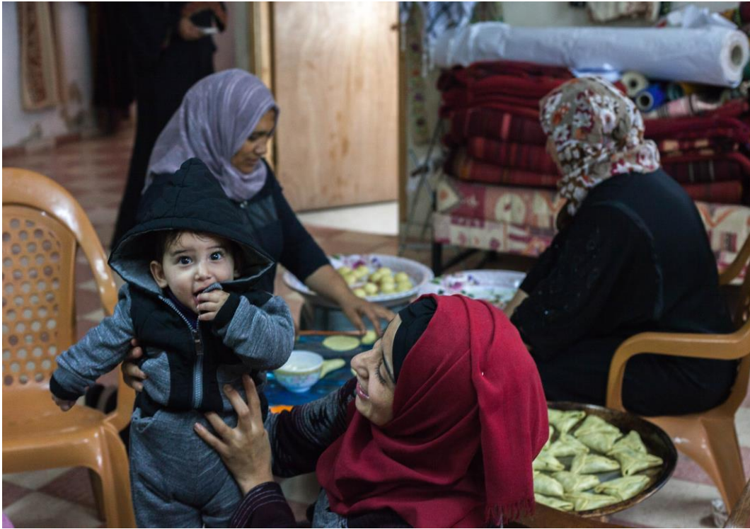
Figure 34 A day of cooking in the cooperative (15/12/2017)

My observations also run parallel to the logo consultant's remarks. As a collectively maintained gathering space for women, the cooperative is full of storytelling, cooking, joking and laughter. Space is essential to embrace joyful agency, a creative capacity for endurance and action as it provides the material conditions of its emergence. In this regard, the cooperative stands as a space of contact in women's lives; a place to encounter one another, chat, exchange stories and laugh. The chatter sometimes turns into a therapeutic advice-giving session where the problems in women's lives resulting from patriarchal social norms, the difficulty they go through in marriage, especially in their relationship with mothers-in-law and husbands, could openly be discussed. The women try to comfort each other and offer some insightful solutions. During our conversations with the founder, I brought up the social aspect of the cooperative: