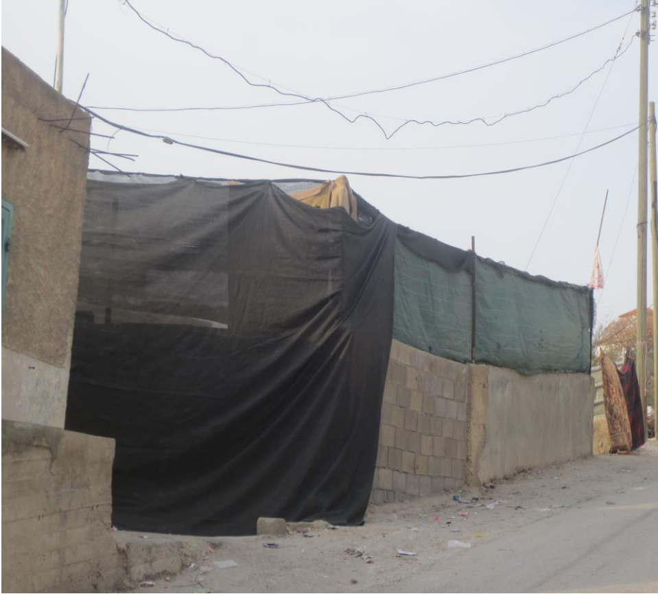
Figure 28 Courtyard, Village (15/12/2017)