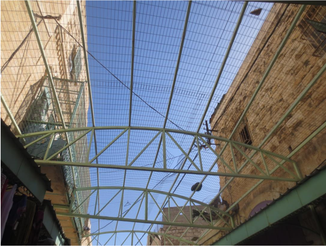
Figure 12 Old City Market, Hebron (15/11/2017)