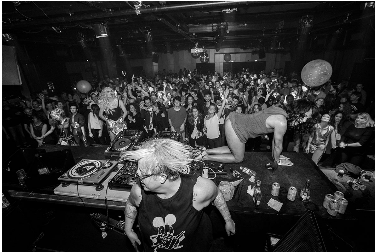
Rave Party 1997

https://www.youtube.com/watch?v=C8G8cdbPmp8