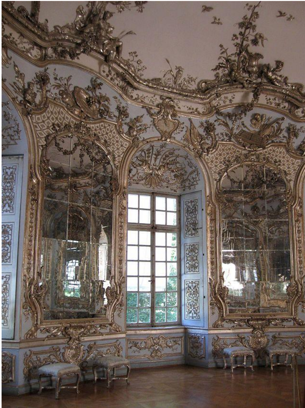
Figure 2.1, 18th-century Rococo pier glass in the Amalienburg Pavilion, Schloss Nymphenburg. The addition of divisions in these mirrors more accurately mimics the mullioned window.