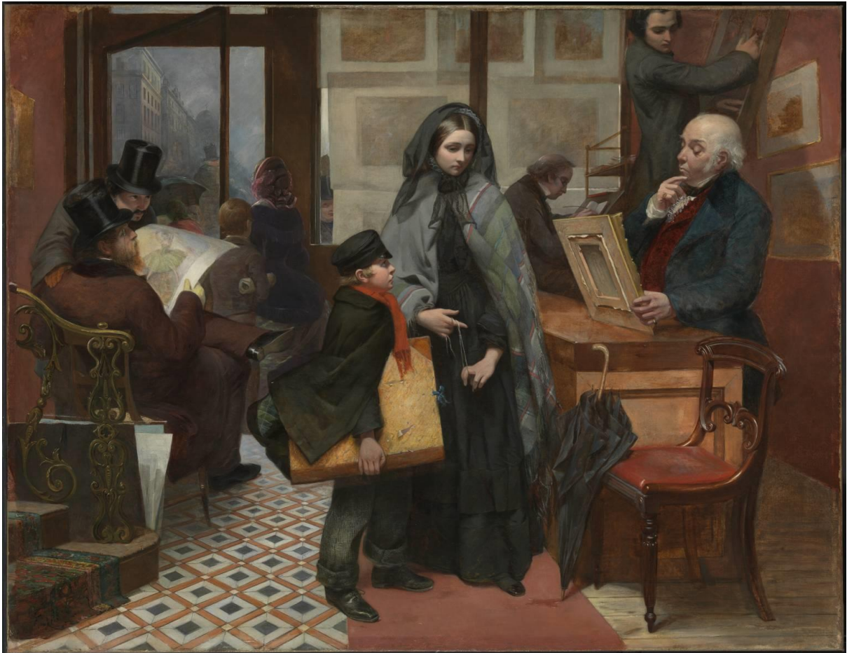
Figure 3:1 Emily Mary Osborn, Nameless and Friendless (1857)