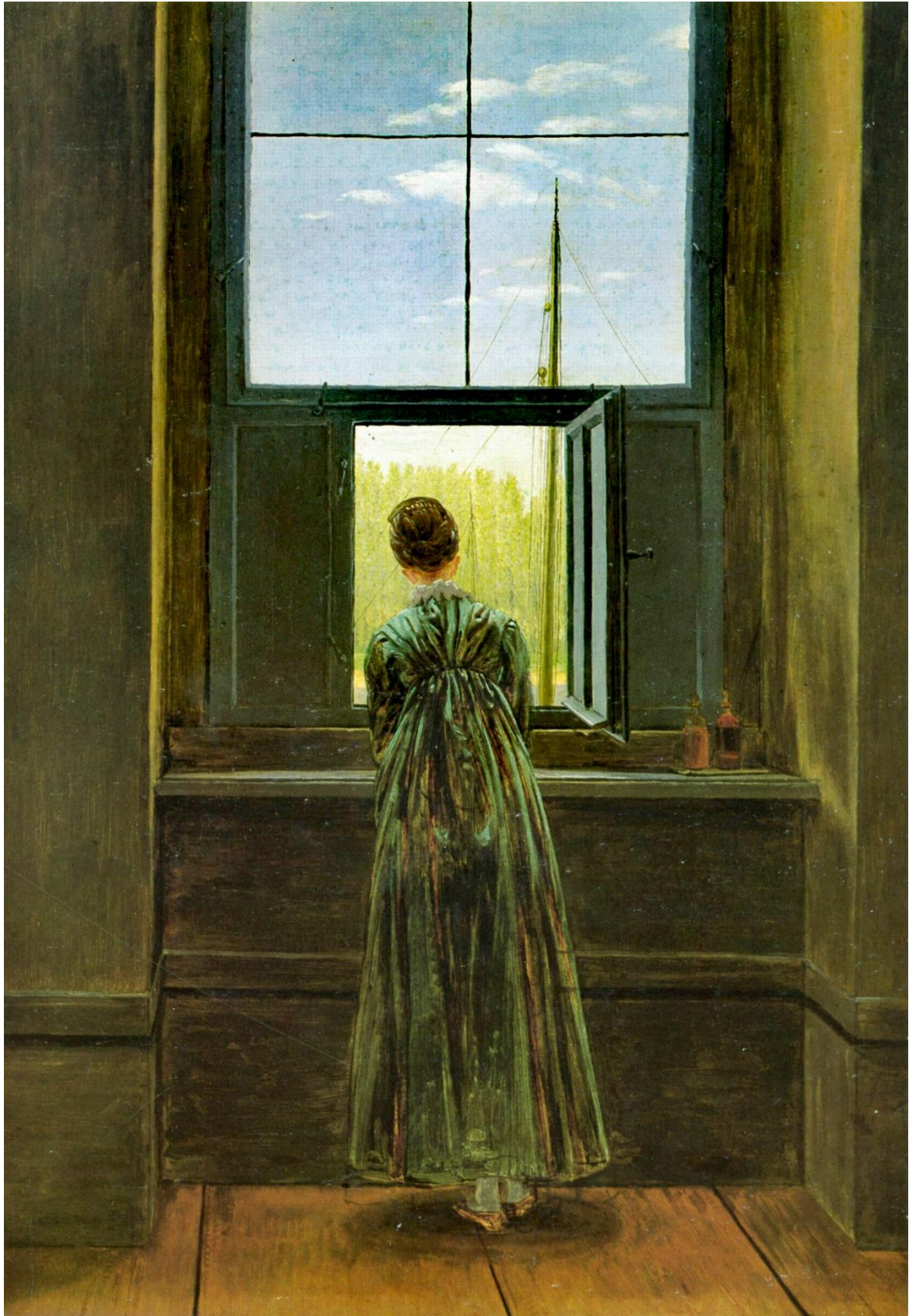
Figure 1.3 Caspar David Friedrich, The Woman at the Window (1822)