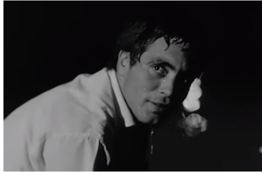
Figure 2: Accattone's face-washing with the Tiber water