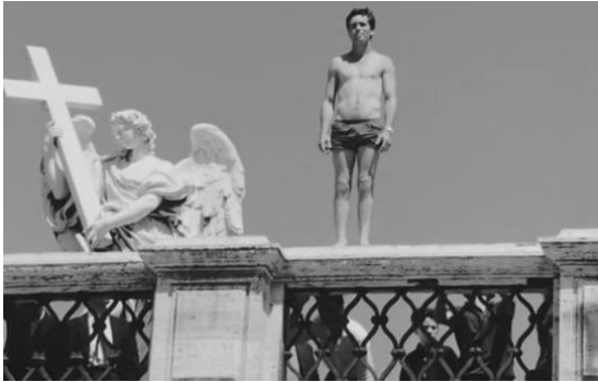
Figure 1: On Ponte Sant'Angelo, Accattone is about to dive into the Tiber

resembles the impossibility for the souls of Ante-Purgatory to enter Purgatory before a certain time has passed or equally the prohibition for any soul of Purgatory to move up a terrace before having atoned for the sins of the previous one.