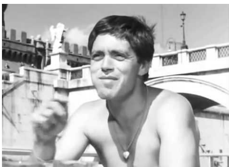
Figure 4: Accattone is over-exposed to the bright sun

Li raggi de le quattro luci sante fregiavan sì la sua faccia di lume, ch'i' 'l vedea come 'l sol fosse davante. ( Purg. I, 39-41)