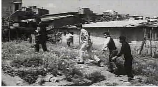
Figure 7: The subproletarians moving one after the other

da man sinistra m'apparì una gente d'anime, che movieno i piè ver' noi, e non pareva, sì venian lente.