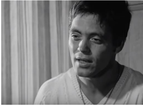
Figure 5: Accattone is illuminated by a side light coming from outside