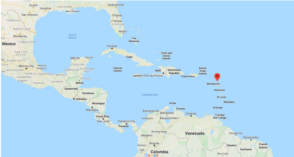
Figure One: Map of Antigua within the Caribbean