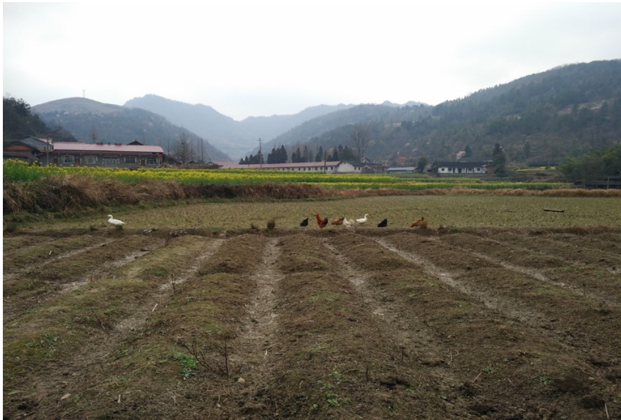
Figure 4.4 Farming and Livestock in Pin Village

hunt animals and the women gathered herbs. Wild resources were sold in Wang town or Yong county by the villagers themselves or through middlemen.