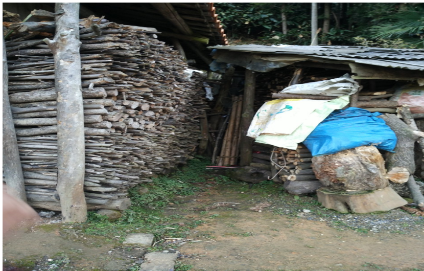
Figure 4.2 Gathered and Stored Firewood

income, some households located near the village's main road started to use liquefied gas and induction cookers. In fact, some of the left-behind elderly population in these households prefer to use gas because they are too old to gather firewood. An electricity supply for daily use was established in the early 1980s. Access to electricity was enhanced by state electrical projects. The rural power grids of the Power Supply Enterprise ( nongwang gaizao ), implemented in 1994 and 1995, improved electric power infrastructure and ensured the stability of the electricity supply.