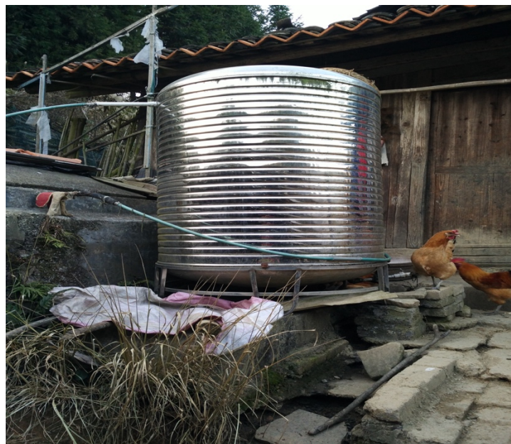
Figure 6.1 Water Tank

day, at the cost of one to two hours. The emergence of pumps and plastic pipes in the market of Wang town since the early 1990s helped to save the labour expended on carrying water. The prerequisite for using these water facilities was to widen the well in Pin village. The village team leader of Xiaping, and some male team members who intended to convey water, enlarged the well to improve its water capacity and convey water by pumps and plastic pipes. These participants were required to contribute physical labour for the well construction. Sheng and his brothers participated in the well construction since they were household male heads. Moreover, Sheng's brothers and their parents contributed financially to the materials for well construction. They also cooperatively purchased and shared a pump and pipes to save costs. Then, they dug a water channel along their field and buried pipes. Thus, water could be directly conveyed to their houses and stored in a water tank, relieving Chan from shouldering water. Because the pipes were easily damaged and sometimes leaked, Sheng and his brothers had to maintain them frequently.