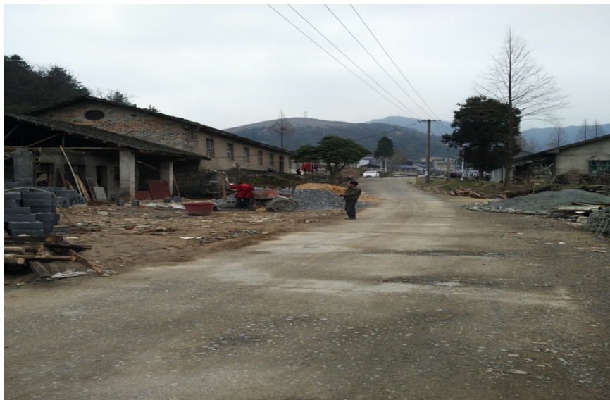
Figure 4.9 The Main Road of Pin Village

As mentioned in Chapter 1, the provision of public services and social welfare has been predominantly funded by the state since the mid-2000s. In terms of public infrastructure, state-funded projects improved piped water, irrigation canals, village roads, and constructed the village committee office. For example, the main village road, established in the late 1970s, was unpaved, uneven, dusty, and muddy on rainy days. In 2014, benefiting from the Targeted Poverty Alleviation project and others issued by the Yong County Government, the road was reconstructed and paved. The project funds were also spent on several village roads which connected households with the main road. Thus, transportation in the village was improved. Currently, a public bus departs from Pin village at 7 a.m. to Yong County Station and returns at 3p.m. Several coaches are privately used and can also be rented.