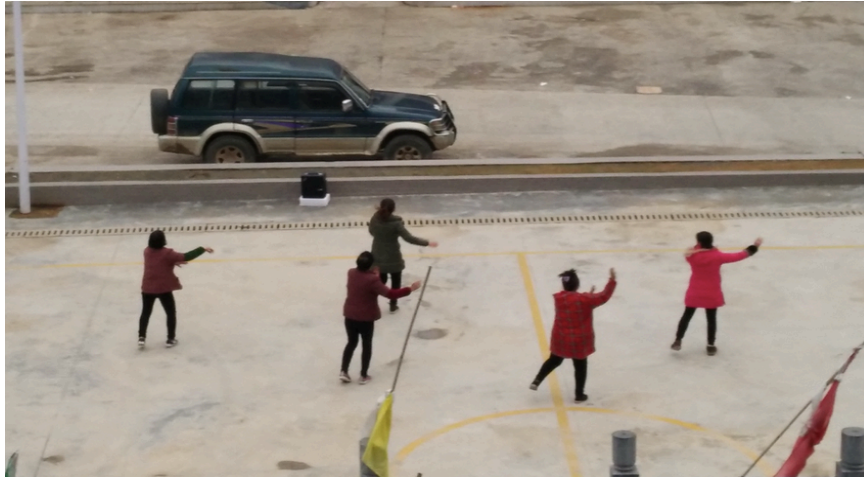
Figure 4.10 Village Art Team

decreasing population, only about ten older villagers were still participating in 2016. Because there is no church in Pin village, Christians used a shabby restroom as a site for religious activities.