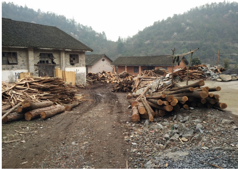
Figure 4.5 A Timber Factory Managed in Pin Village