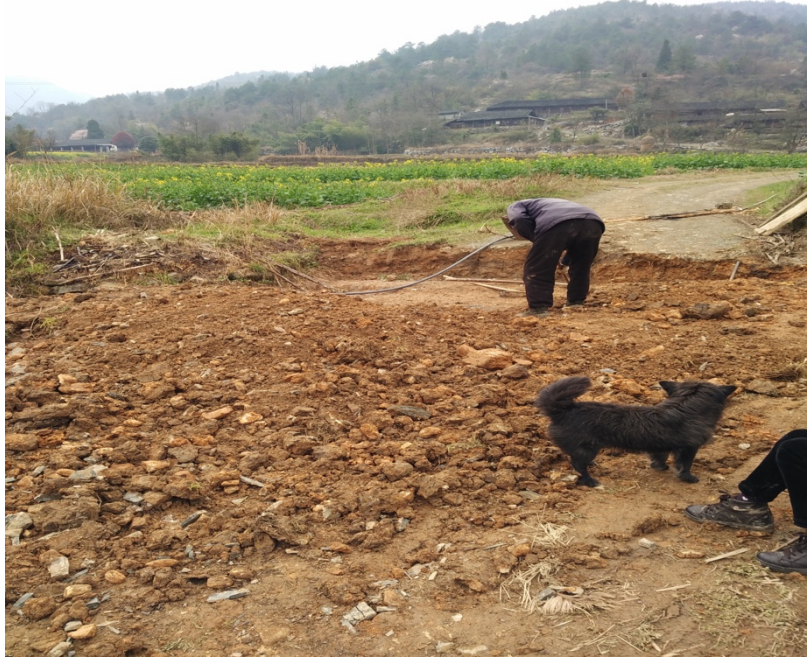
Figure 7.1 Destroying Village Road

the rural road of Yanwan team. He demonstrated to the village committee that if they would not provide the assistance, he would destroy more.