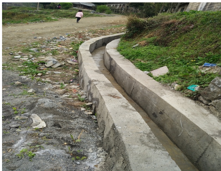
Figure 6.2 Concrete Canals