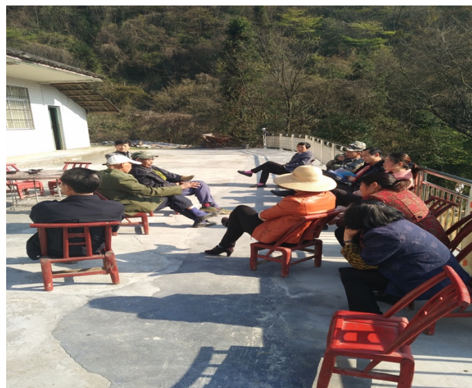
Figure 4.7 Village Representatives Assembly

Villages were the lowest administrative unit and they were assigned the right of autonomy. The Communist Party branch of Pin village predominately guided all village affairs. The Pin Village Committee organised village affairs and implemented policies and regulations. The party secretary, as leader of the party branch, and the village director from the village committee, held vital political power. Village team leaders were responsible for the fulfilment of tasks assigned by the party branch and village committee. Furthermore, the Village Representatives Assembly was established to ensure democracy and the autonomy of village governance (see Figure 4.7). The Village Supervisory Committee was established in 2013 to improve political transparency (see Table 4.2). According to the interviews with cadres, there has been no female party secretary or director in Pin village since HRS in 1981, while men have dominated the positions of party secretary and director. Male party secretaries or directors usually had external political connections with higher-level governments, which allowed them to access government projects for infrastructure and public services.