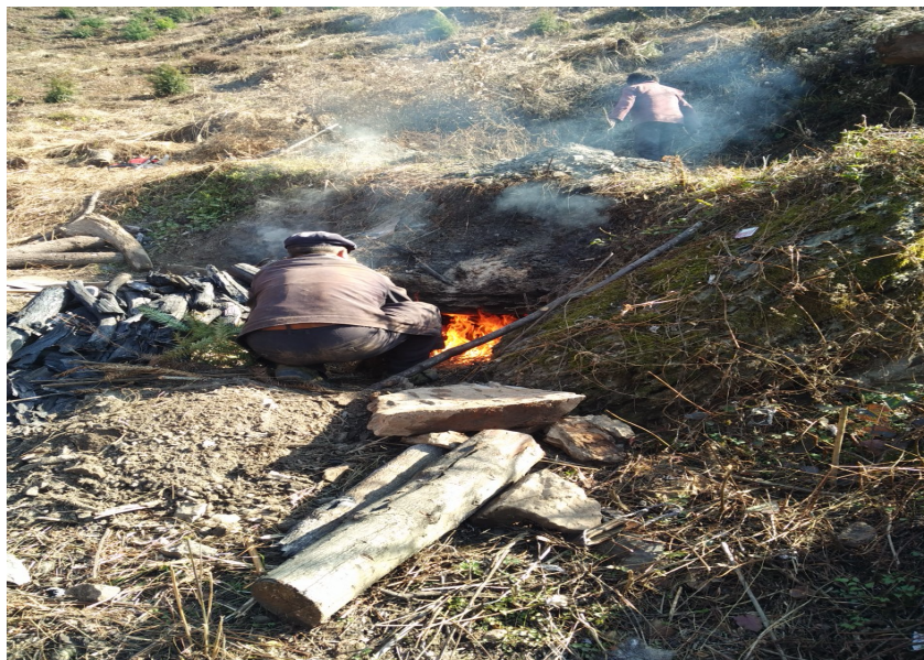
Figure 4.3 Making Charcoal