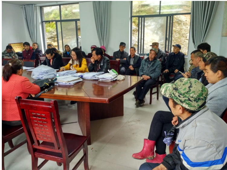
Figure 4.8 A Meeting in the Office of Pin Village Committee