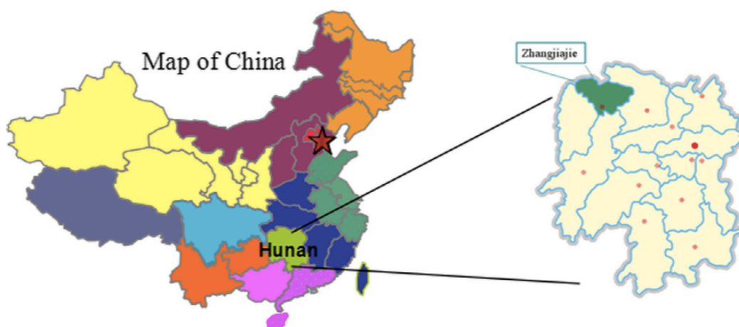
Figure 4.1 Maps of Hunan Province and Zhangjiajie City

Qualitative research requires a profile of the social context and overall setting within which participants operate (Horsburgh, 2003). I will first introduce a profile and history of Pin village, focusing on its geographical characteristics, population, resource endowments, economy and markets, politics, social relations, cultural activities, and so on. Detailed information was obtained from the interviews with village cadres, secondary documents from the Pin Village Committee, and Wang Town Government. Pin is a mountain administrative village located in Zhangjiajie, Hunan province. It is about eight miles southwest of the location of Wang Town Government and 42 miles from Yong county.