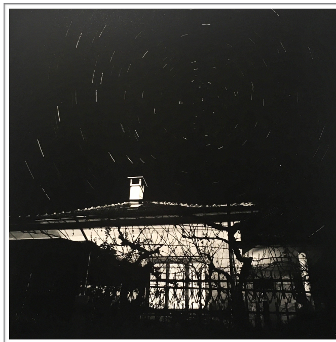
Fig. 4. A thirty-minute exposure, November 2018.

Methodologically, the idea is to combine sonic and visual field recording by capturing both simultaneously for the same duration. Having calculated light and film speed, the exposure can be timed to last for the same period of time that the field recording takes. For example, one could record for forty minutes, during which time the camera can be continuously exposing an image. In terms of workflow one presses [record], clicks-open the camera shutter—and once the desired duration has elapsed—releases the camera shutter, and presses [stop] on the recorder.