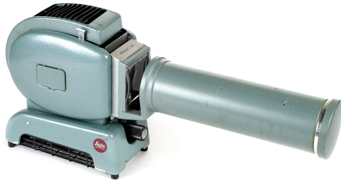
Fig. 5. Leitz Prado 66 medium-format projector

and shadows are inverted. This allows for experimentation with various projection surfaces, whose colour and material will absorb light differently, thus producing images of specific qualities. The transitory nature of projections also corresponds well with the temporality of sonic live performances, in that they both appear and disappear without leaving a material trace: light passing through film; sound-waves passing through speaker-cones. Finally, when a soundcastle is fixed on a medium, as on a CD or an LP, the printed positive image can accompany it.