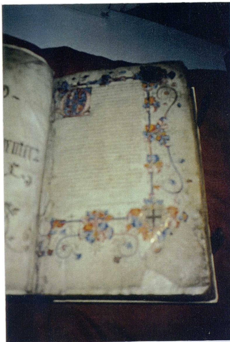
Figure 2 - London, CLRO, Custumal 12, the Liber Albus , fol. 1r., the Prologue