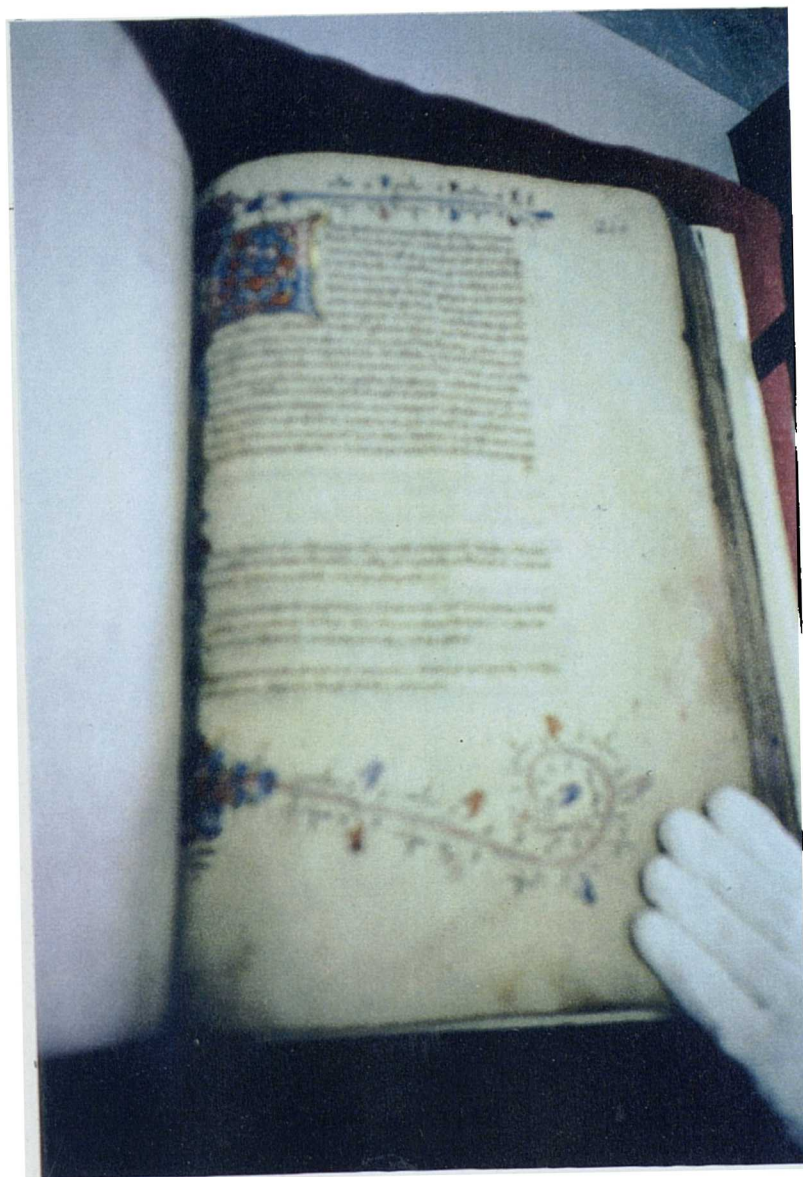
Figure 3 - London, CLRO, Custumal 12, the Liber Albus , fol. 264r., the Prologue to Book Four