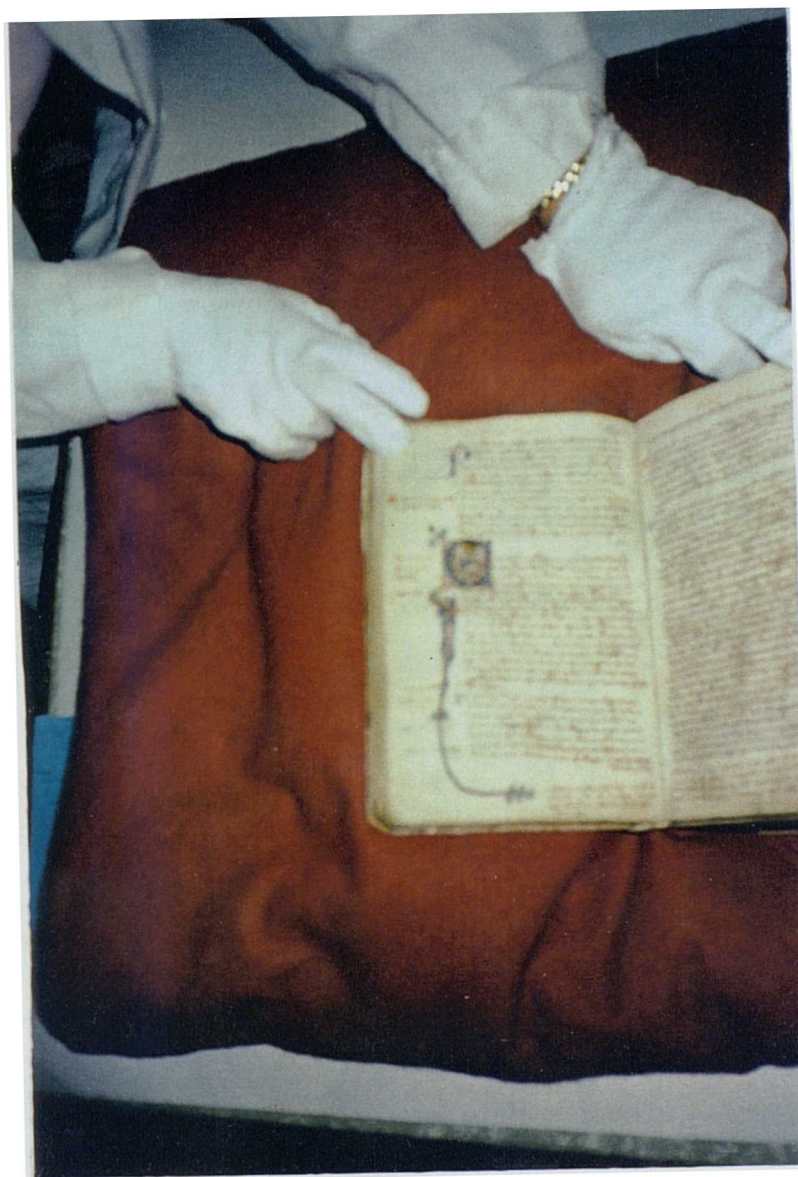
Figure 1 - London, CLRO, Custumal 2, the Liber Horn , fol. 35v., the beginning of the First Statute of Westminster