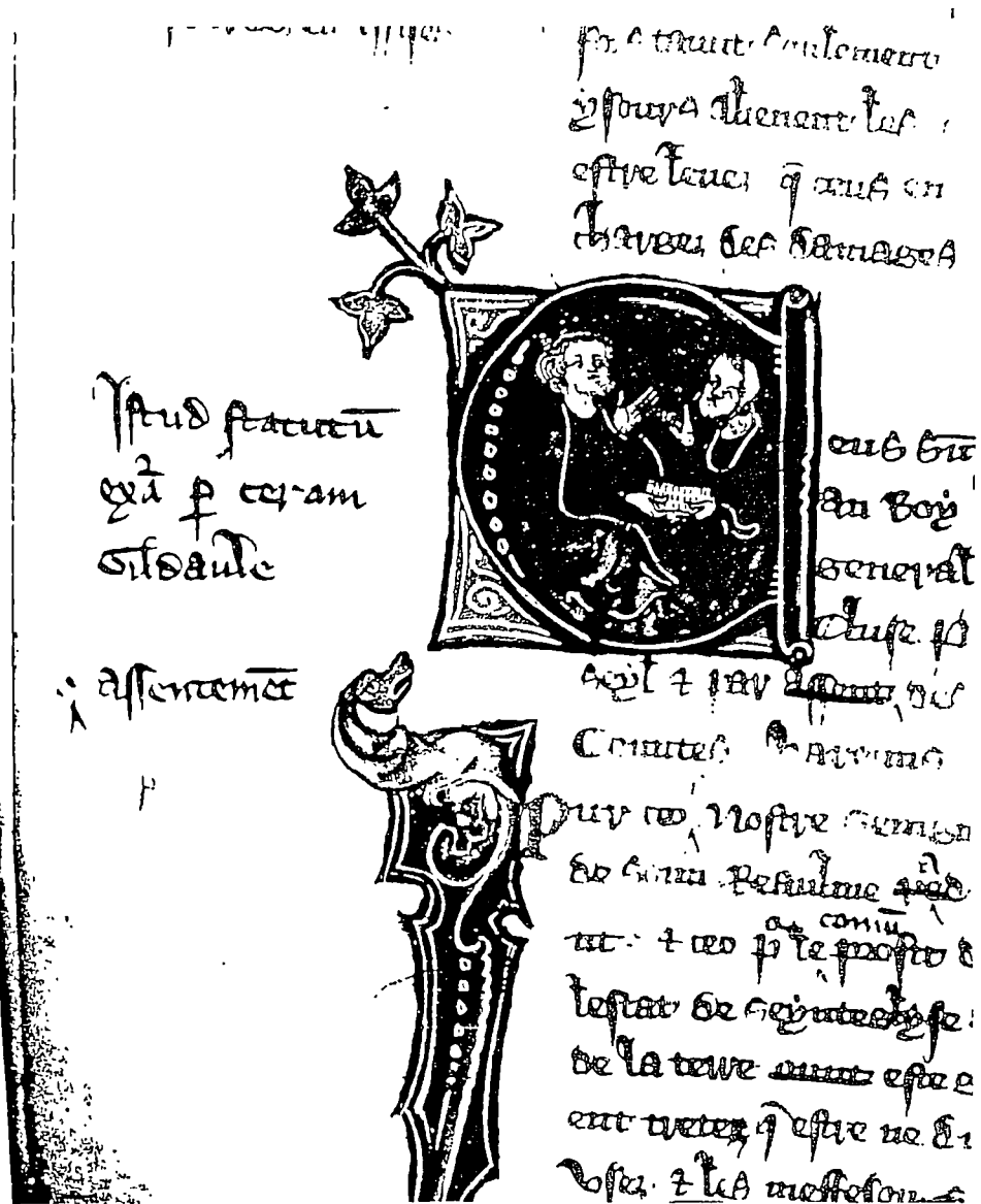
Figure 5 - London, CLRO, Customal 2, the Liber Horn , fol. 35r., close up of the historiated initial of a king seated in discussion with another man, holding a book between them

From York, Borthwick Institute of Historical Research, Microfilm 437