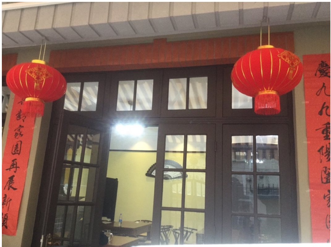
Image 6- 6 The eldercare service centre in community A

Jianghe, similar to Qingniao, established and operated a telephone-based eldercare support system, called 96890 Eldercare Platform, and provided homecare services for residents in district B (including those located in community B), especially for vulnerable older people eligible for government subsidies. The sub-district level government took responsibility for meal support and daily care support through cooperating with a third party. Secondly, different from community A, there were no meal stations and daily care centres located in community B. Older people who need meal support or daily care support had to contact meal stations or daily care centre nearby to get relevant services.