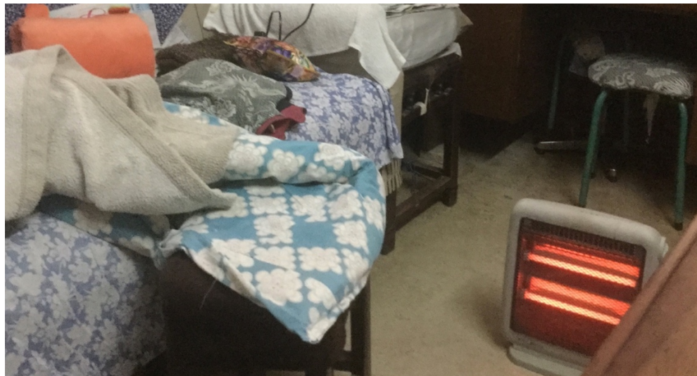
Image 6- 5 Items for keeping warm in cold winter