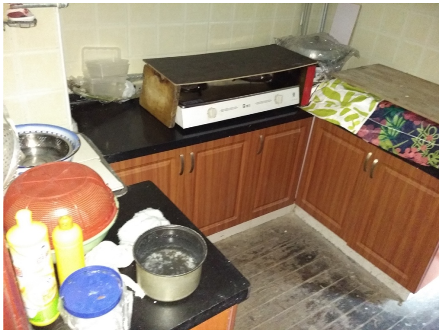
Image 6- 3 The shared kitchen