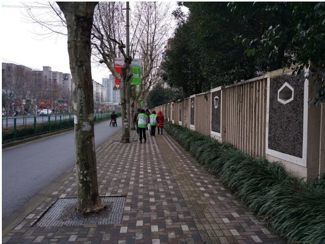
Image 6- 7 Volunteers in community B

provided support for the older residents in the two communities. These groups could be mainly classified into two types: volunteer groups and hobby groups. Activities organised by volunteer groups included assisting neighbourhood committee members in the work, cleaning the community, providing free lectures on health, disease recovery and self-care and community security patrol (see Image 6-7 for a volunteer group in community B). Hundreds of older people had registered as community volunteers in the two communities. There were also various hobby groups in both communities: singing groups, dancing groups, instrumental music groups, chess and cards groups, language learning groups, and computer skill training groups. Older people could participate in these groups and attend the activities freely. Organising various social and leisure activities, these groups sought to enrich older people's daily lives, to facilitate mutual support and to enhance their enjoyment and happiness.