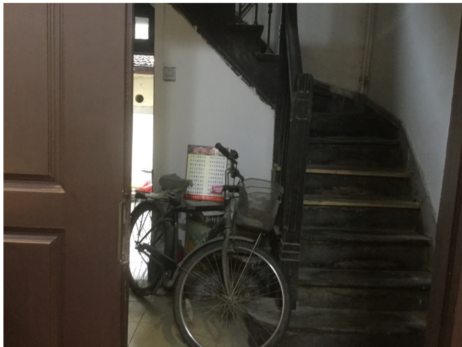
Image 6- 4 Stairs in a residential building in community A