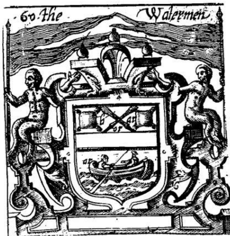
Figure 3.3. The Arms of the Watermen in The Emperiall Achievement of our dread Sovereigne King Charles (1635).