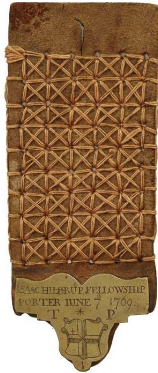
Figure 2.2 Brass Fellowship Porter Tally (1769), © Museum of London.

affected by London building fires. The proposal suggested that badges should be given to ‘porters of known credit [...] for the true performance of their Trust.’ 80