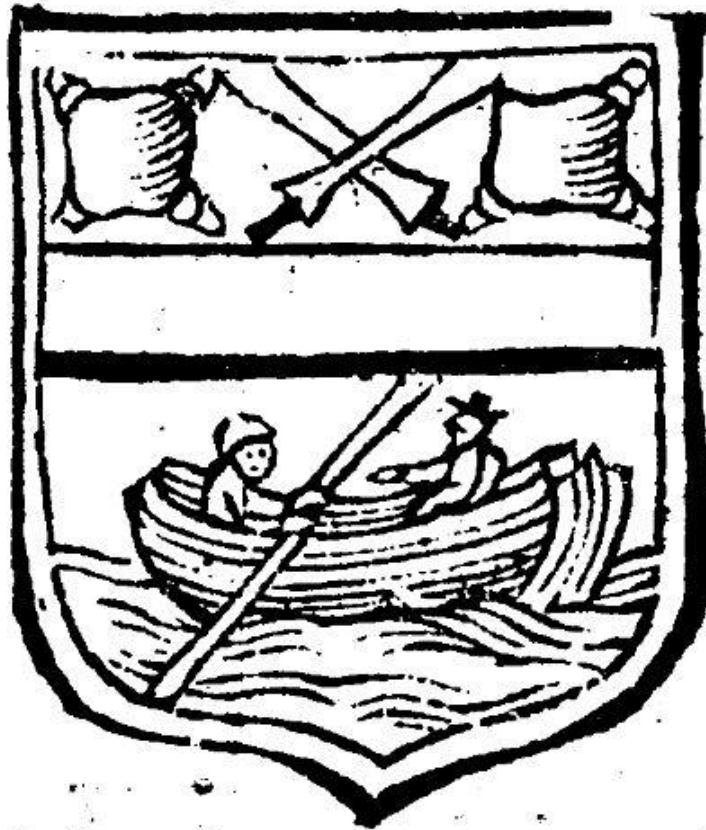
Figure 3.4. Historical Remarques and observations (1681).

There were other semblances of a 'formal' company as well. The Oath of the Watermen, created in 1626, was similar to those sworn by members of City companies. It begins with a pledge of allegiance to the Crown, swears obedience to the overseers, and threatens 'paynes and penalties' for offending the rules and ordinances of their said government. Yet, the Watermen's Oath did contain a wordy instruction against the embezzlement of merchandise or wares from ships, and/or defrauding customs: