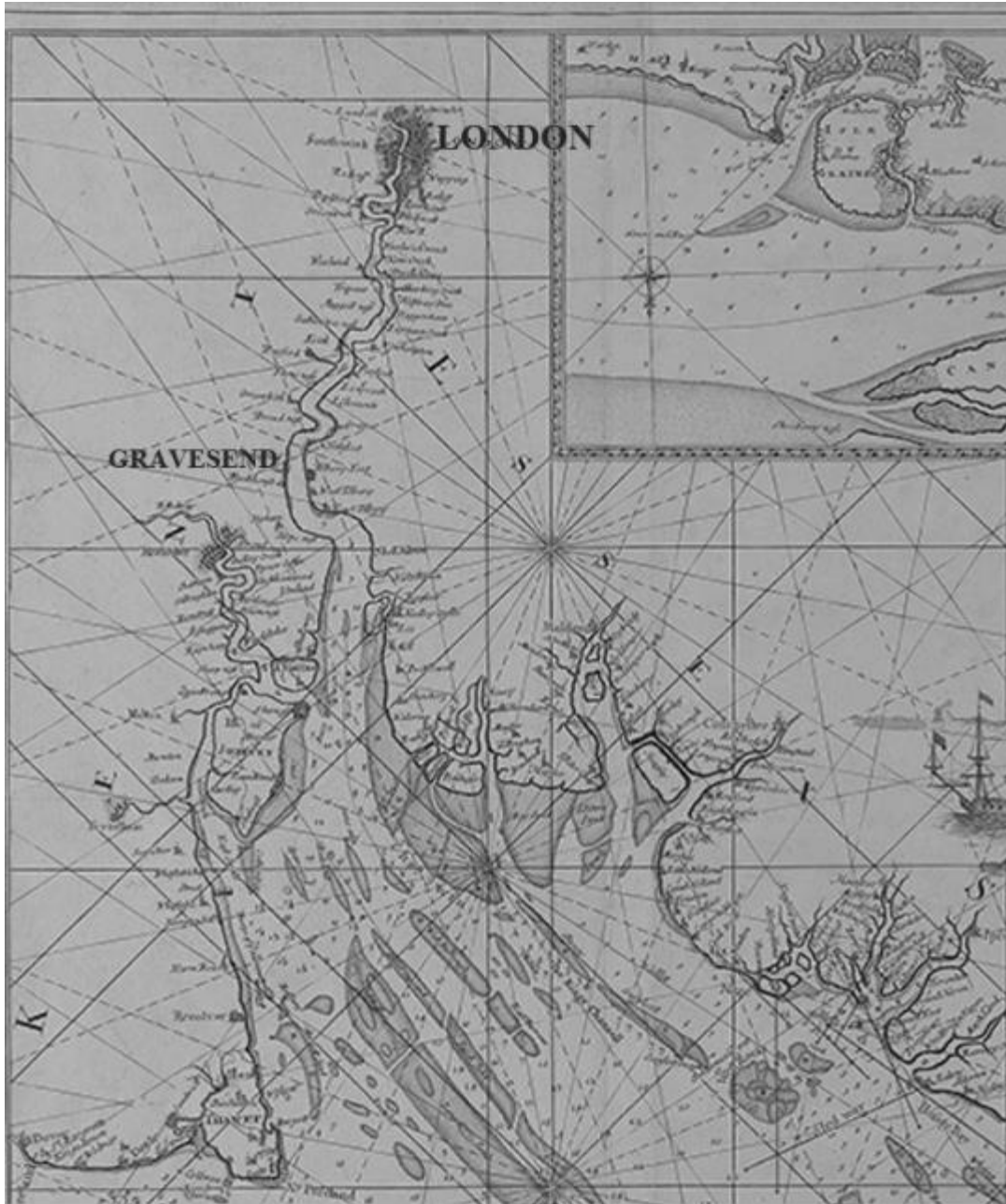
Figure 3.5. Distance between London and Gravesend. Base map: Capt. Greenville Collins, East Coast of England and Thames Estuary, from London (c. 1676).