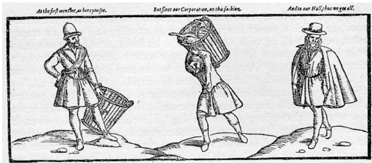
Figure 2.1. Thomas Brewer, A newe Ballad, composed in commendation of the Societie, or Companie of the Porters (1605).

Brewer stresses the new respectability of the Street Porters now they were ‘incorporated.’ He notes their exclusivity; the new company of porters rejected ‘base’ and ‘mean’ members hoping to join their ranks, which likely refers to the aldermanic order requiring sureties and court approval for all new candidates. The ballad’s woodcut—likely prepared exclusively for it—is also telling of their new status [see fig. 2.1]. 76