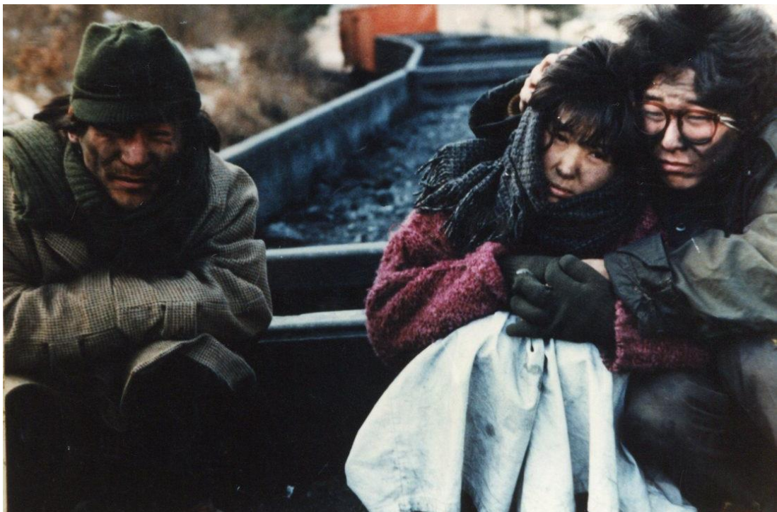
Figure 7 ...drew comparisons with a former character, Chun Ja, in Whale Hunting .