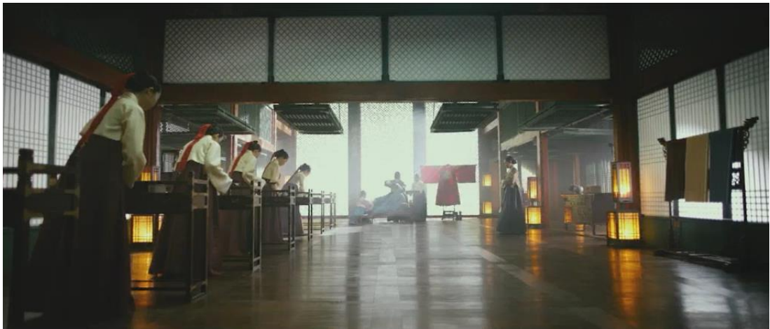
Figure 16 The first appearance of the King is distant and obscured.