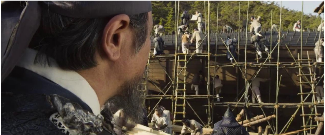
Figure 23 The turtle ship obscured by builders...