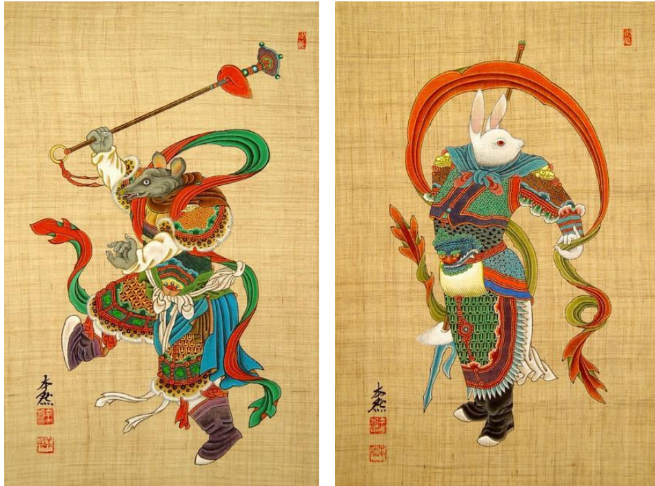
Figures 8 & 9 The rabbit and rat zodiac guardians of traditional imagery.