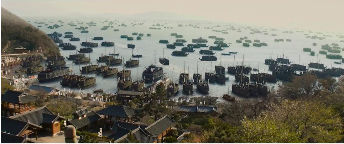
Figure 29 The scale of Japan's resources on full display.