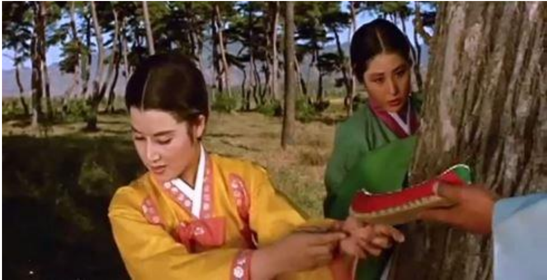
Figure 1 The Chunhyangjeon adaptation marks the advent of CinemaScope.