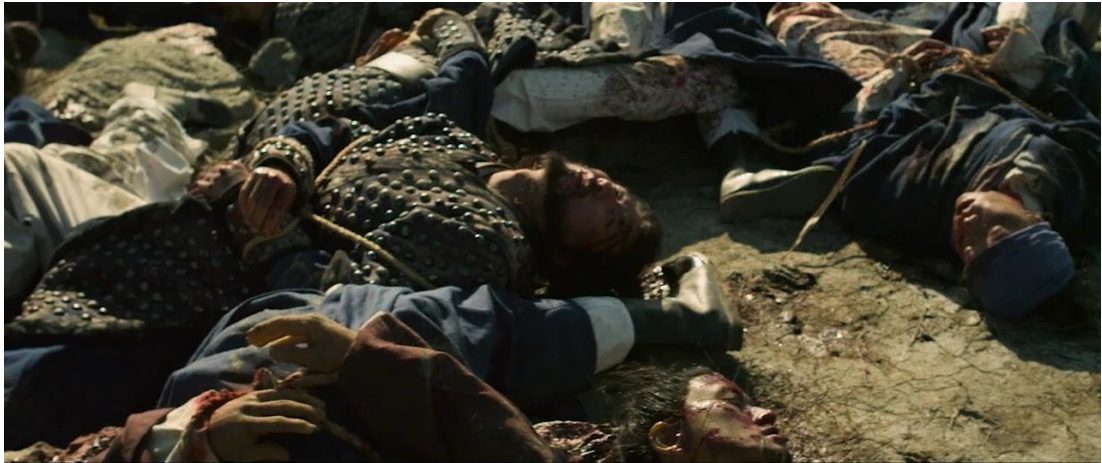
Figure 26 A close up shot of murdered soldiers.