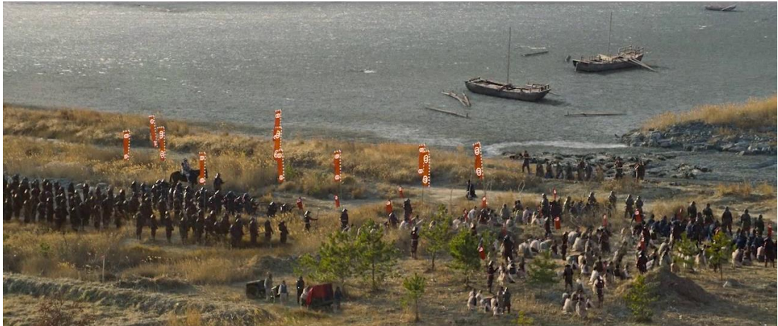
Figure 28 A wide shot, revealing the scale of brutality.