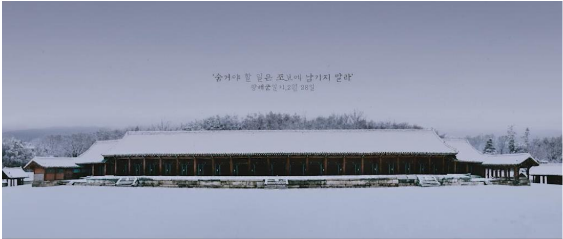
Figure 15 The first image in the film, that of the royal palace.