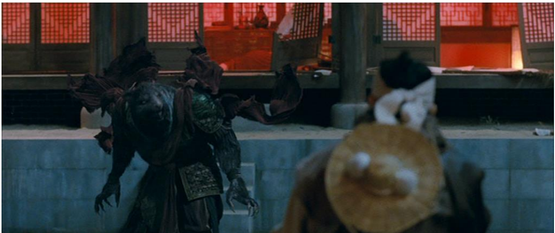
Figure 11 The rat goblin.