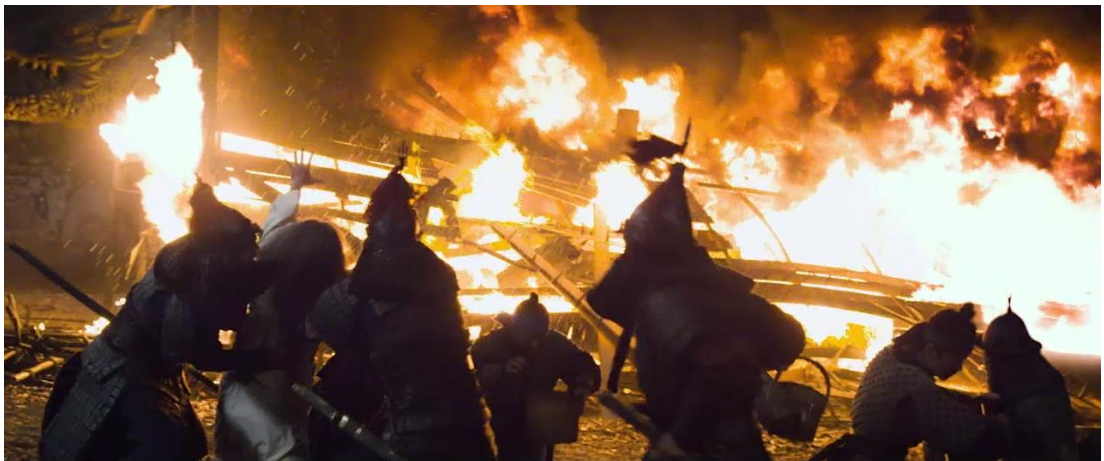
Figure 24 ...destroyed by fire...