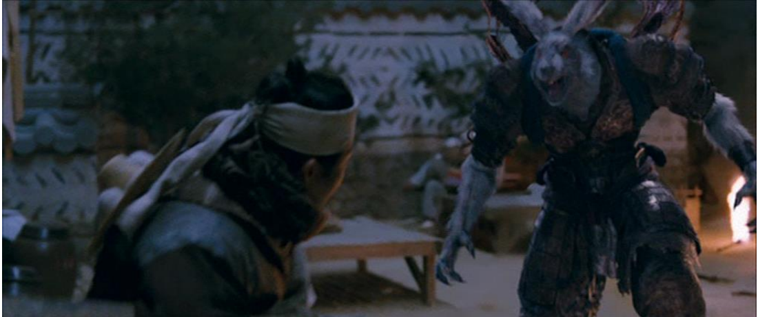
Figure 10 The rabbit goblin.