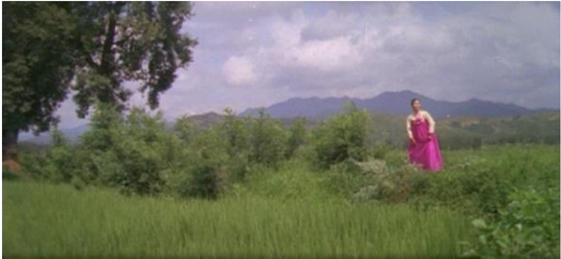
Figure 3 ... and widescreen formats to display panoramic shots of the Korean landscape. Eunuch (Shin Sang Ok, 1968)

angles, especially when establishing settings. Based largely within the confines of the royal palace, the few scenes in the surrounding landscape are given panoramic framing.