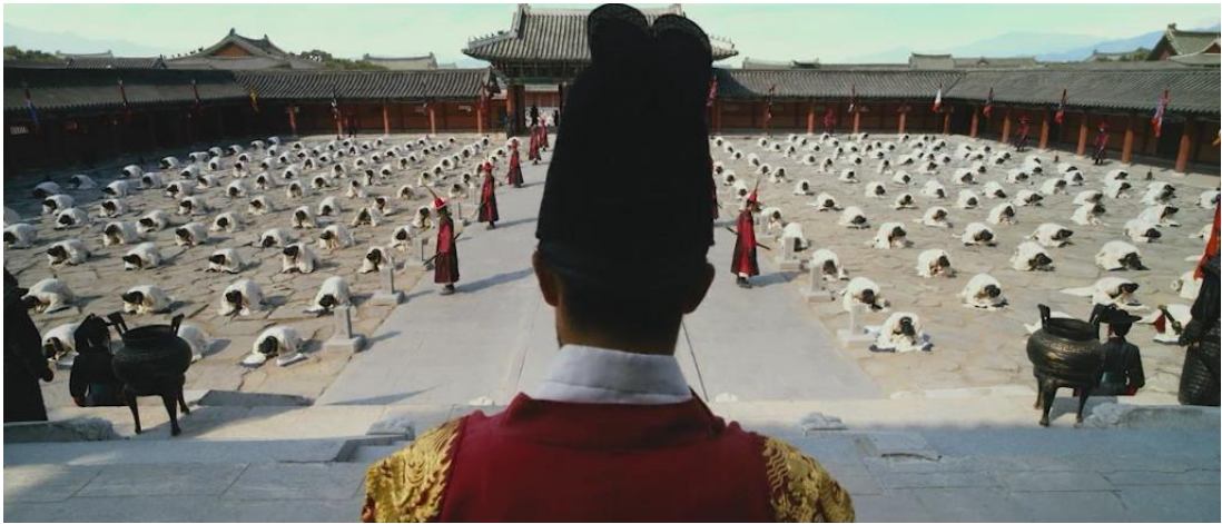
Figure 19 The symmetry of the retainers, from Ha Seon's point of view.