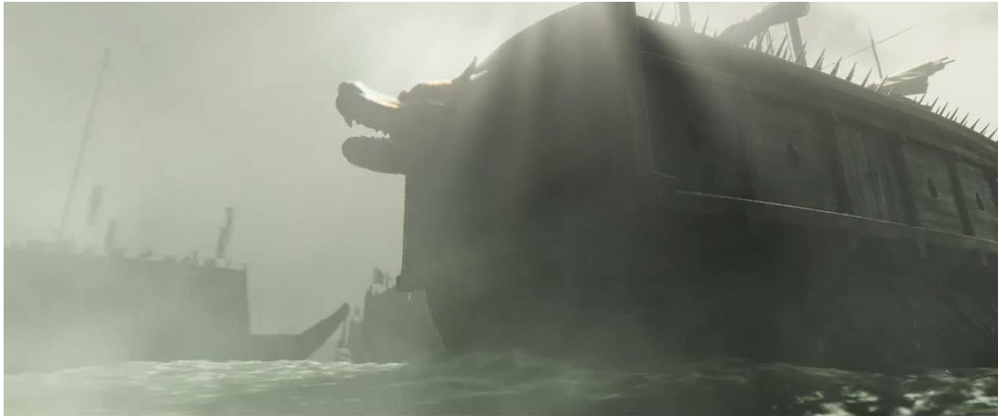
Figure 25 ...and its re-emergence in battle.