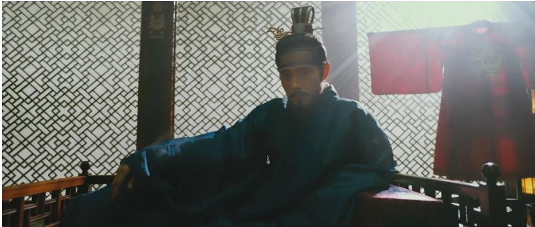
Figure 17 Lee Byung Hun as Gwanghae or Ha Seon? ( Masquerade , Choo Chang Min, 2012)