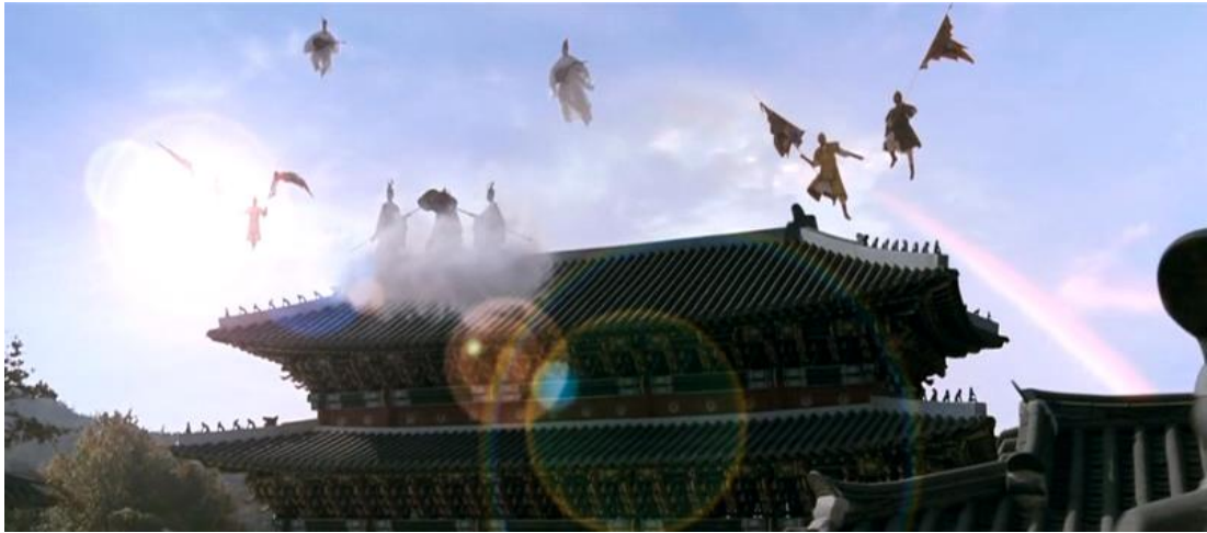
Figure 14 CGI lens flare obscuring Woo Chi's descent as the Jade Emperor.