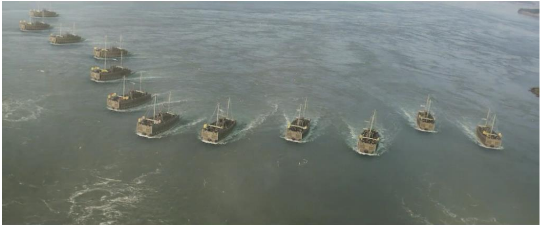
Figure 31 The Korean fleet takes up a small amount of the frame.