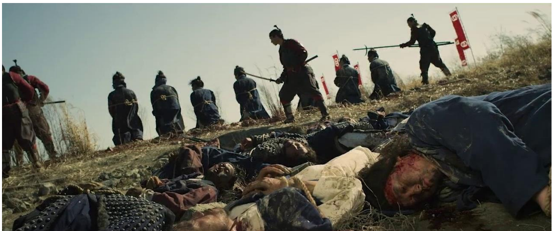
Figure 27 A larger shot, showing men waiting to be killed.