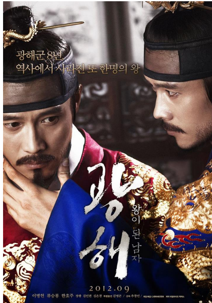
Figure 22 A poster for the film, emphasising the dual role of Lee Byung Hun.