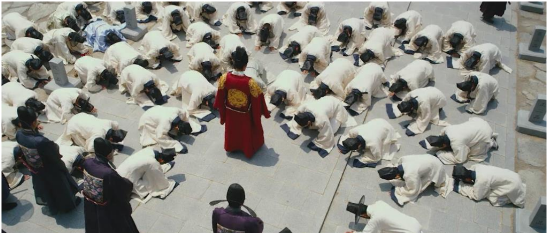
Figure 21 The frame's shifted angle emphasises the disorder of the scene.