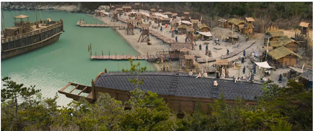
Figure 30 The resource-stricken Korean navy is shown in a more compact frame.