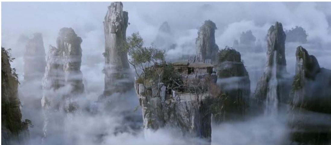
Figure 13 The Master's hermitage in a fantasised landscape.