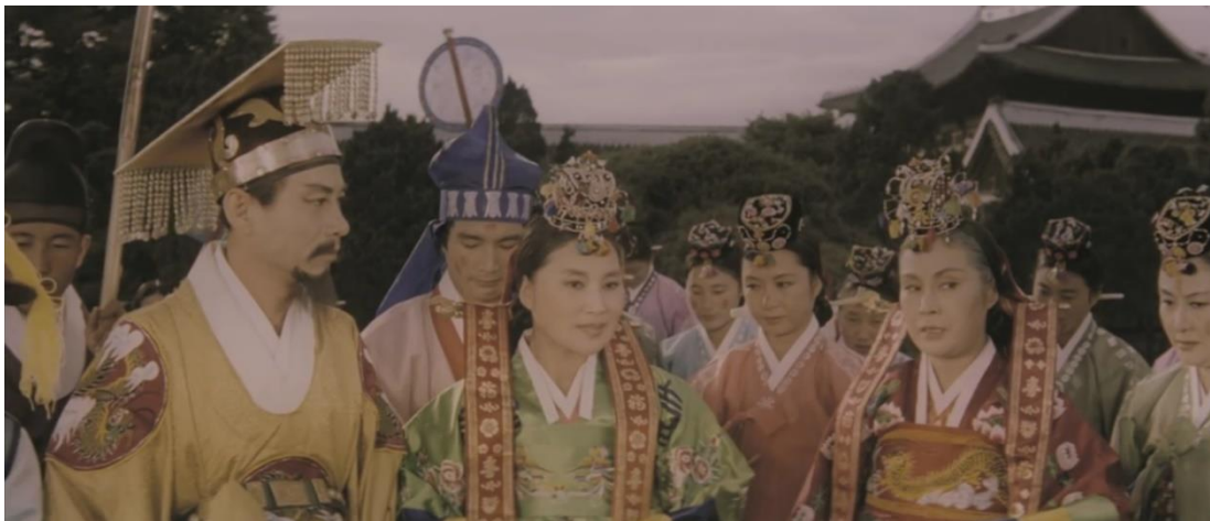
Figure 2 1960s sageuk made full use of new colour technology to showcase exuberant costumes...