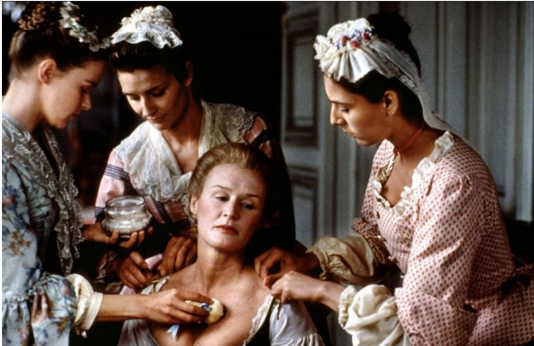
Figure 4 Merteuil's elaborate dressing ritual. ( Dangerous Liaisons , Stephen Frears, 1988)