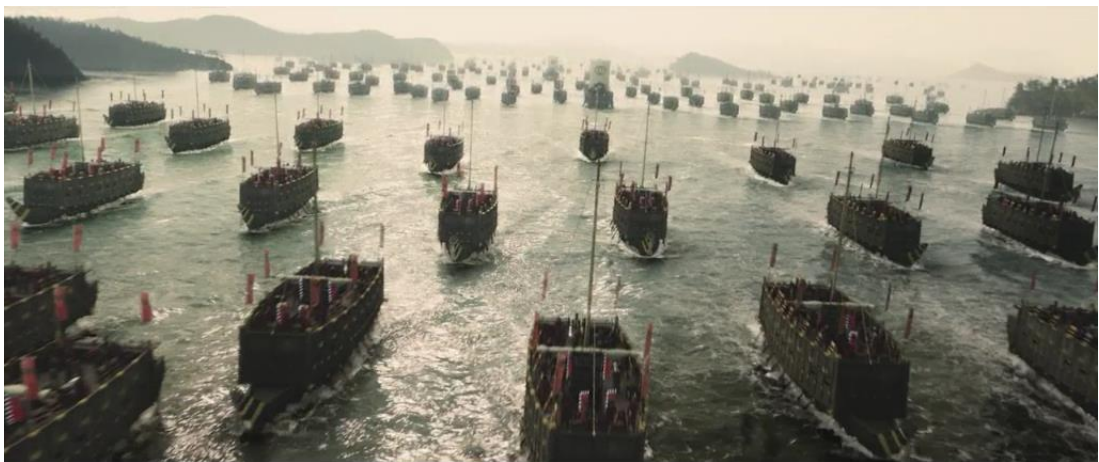
Figure 32 In comparison, the Japanese fleet dominates the frame.