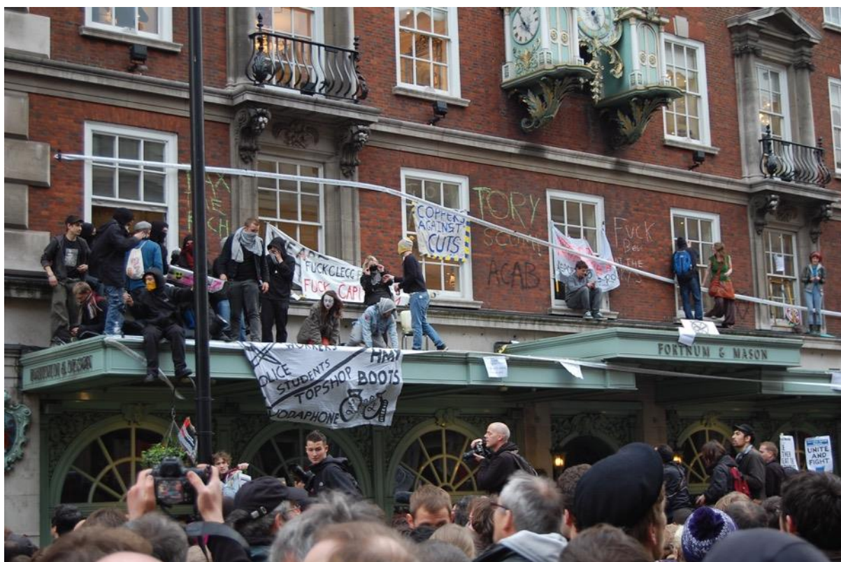
Figure 4: UK Uncut direct action outside Fortnum & Mason's on Piccadilly in London (26.03.2011)

being fostered between actors and organisations in institutional and non-institutional camps. As has been discussed, the extent to which these links are maintained is open to question. Where other social movements are concerned, the extent to which there is further engagement is also open to question. The decision for movements and unions to collaborate is based on several factors: the similarity of aims and objectives over specific policy issues being one example.