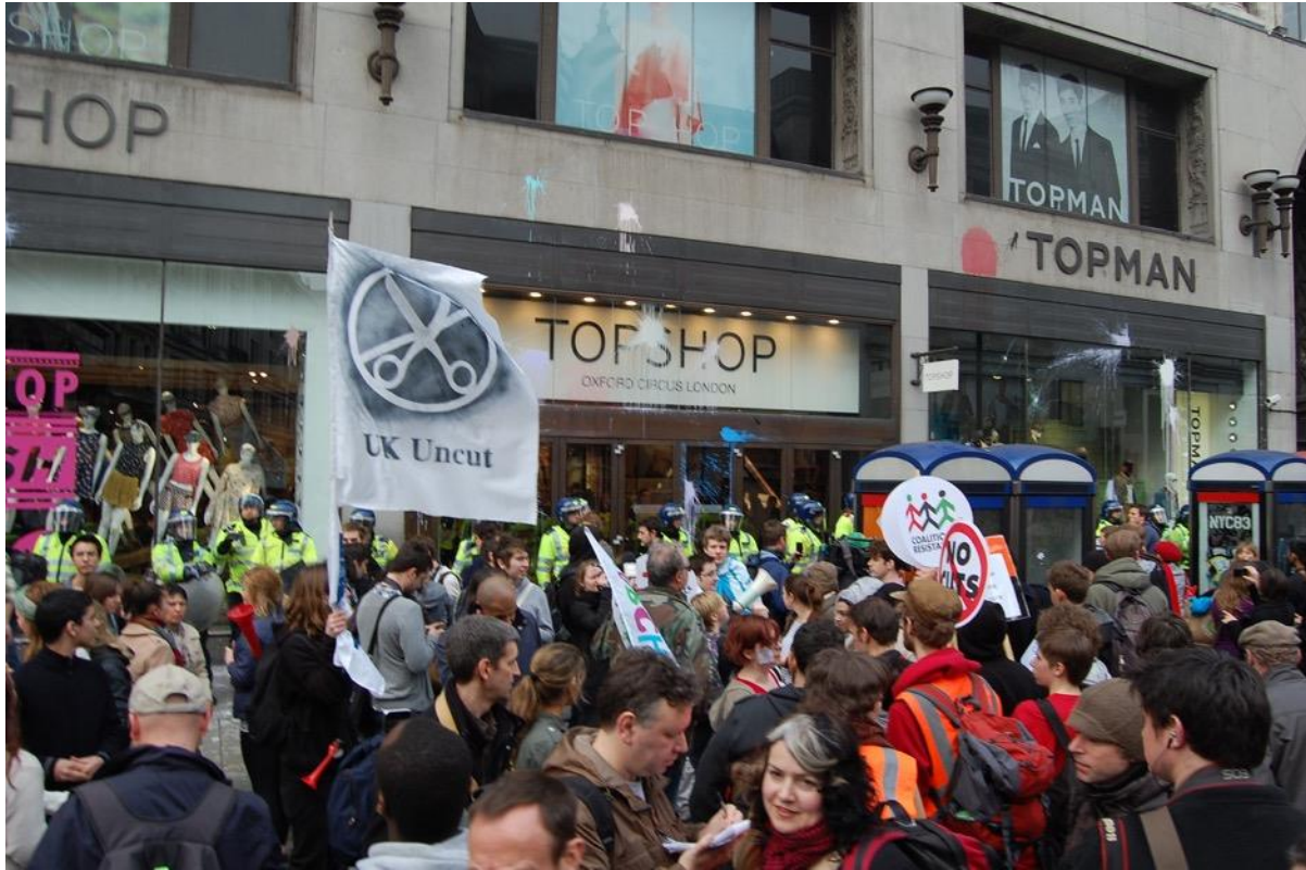
Figure 5: UK Uncut direct action outside Topshop on Oxford Street in London (26.03.2011)

the equation, the evidence from this stage of data collection is clearer, from a trade union and social movement perspective.