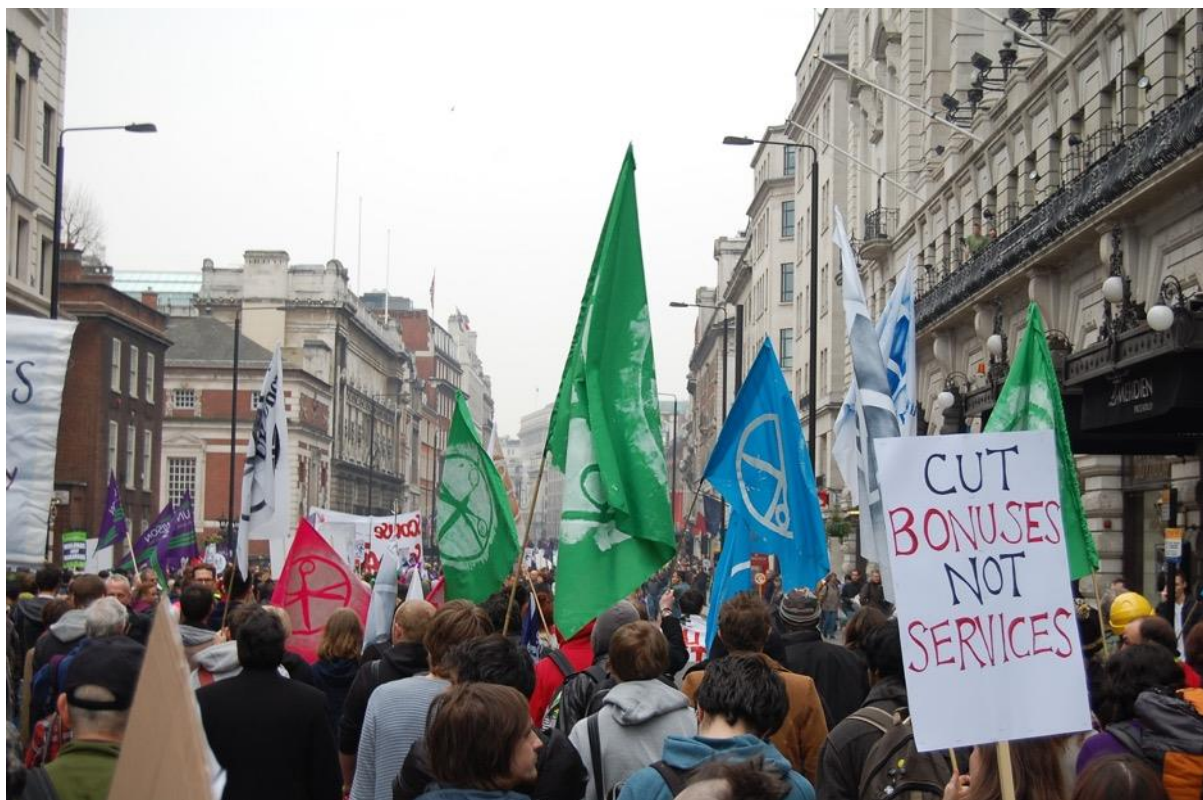
Figure 2: UK Uncut demonstration on anti-austerity march in London (26.03.2011)