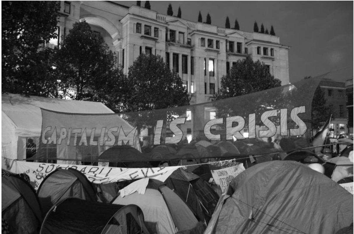
Figure 6: Occupy London encampment outside St. Paul's Cathedral, London (22.10.2011)