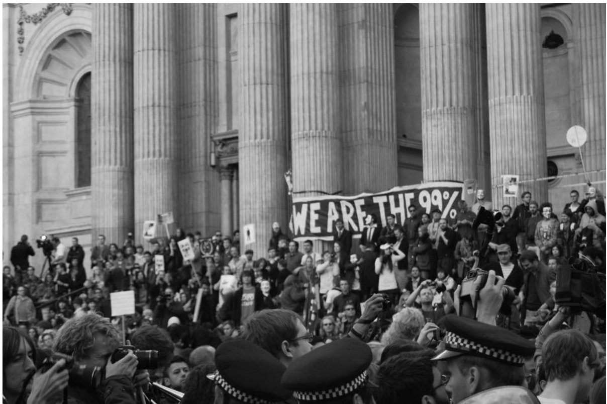
Figure 1: First assembly of Occupy London outside St. Paul's Cathedral, London (15.10.2011)