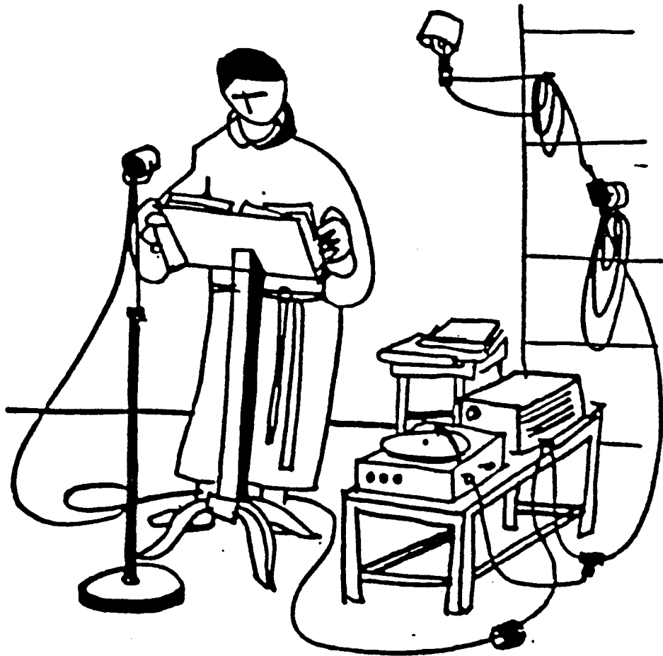
L'Ambon nouveau ou le grand bazar électronique! Illustration from L'Art Sacre (September/October 1965)