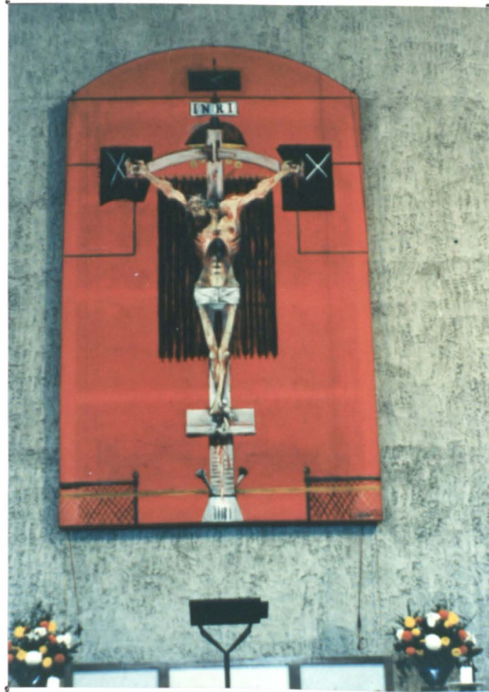
St Aidan, East Acton, London (1961), Burles Newton & Ptnrs Painting by Graham Sutherland