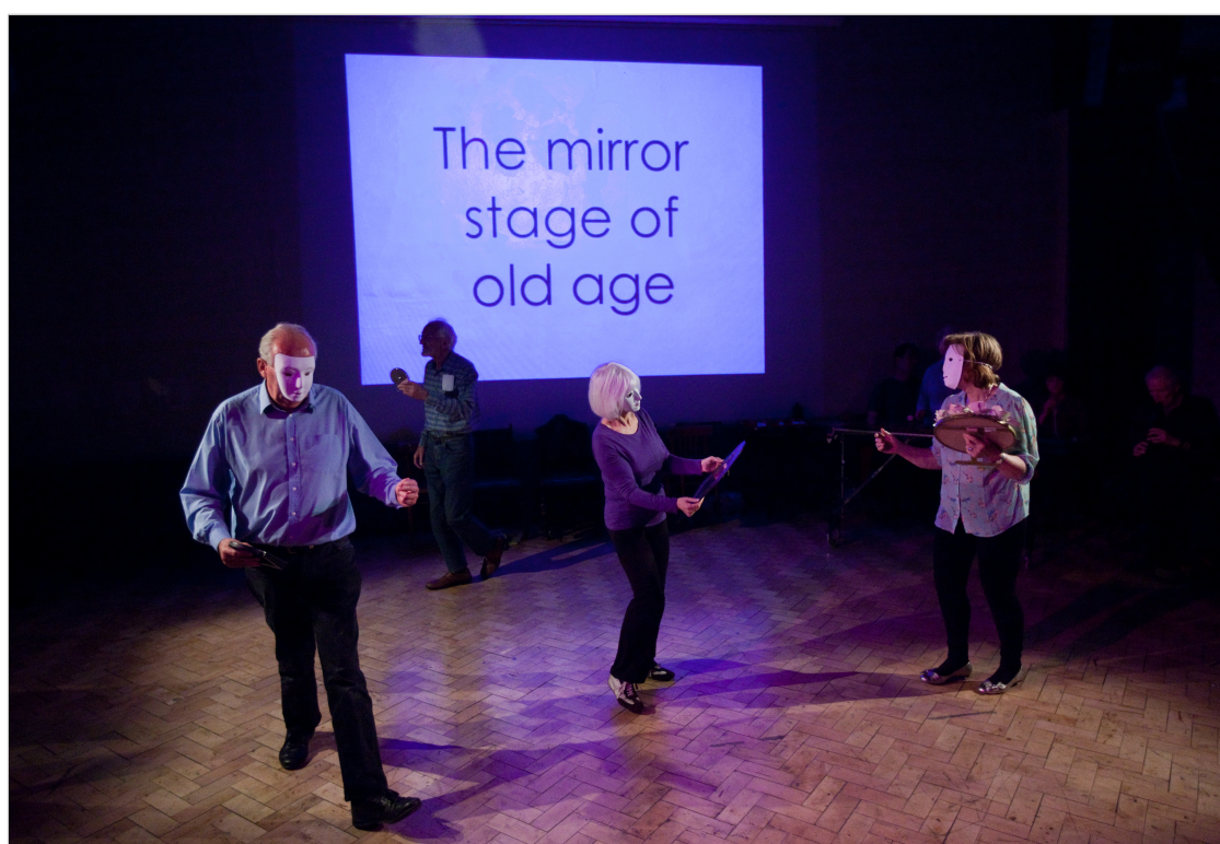
Fig. 4: Performers dance with their masked reflection

I have a small face that is quite lined, especially around the mouth and chin, with deep creases. These lines around the lower half of my face remind me of my mother, as she had them too. 18