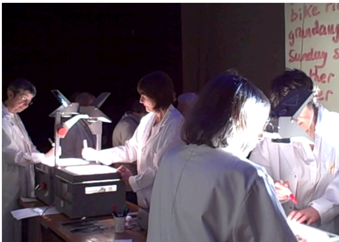
Fig. 9: Lab 1, the cast write lists of all identities they have ever had or been given and phases they have been through.

The artifacts (a series of brightly illuminated OHPs) and the props and costumes (white lab coats and clipboards) frame the proceedings as part of a scientific