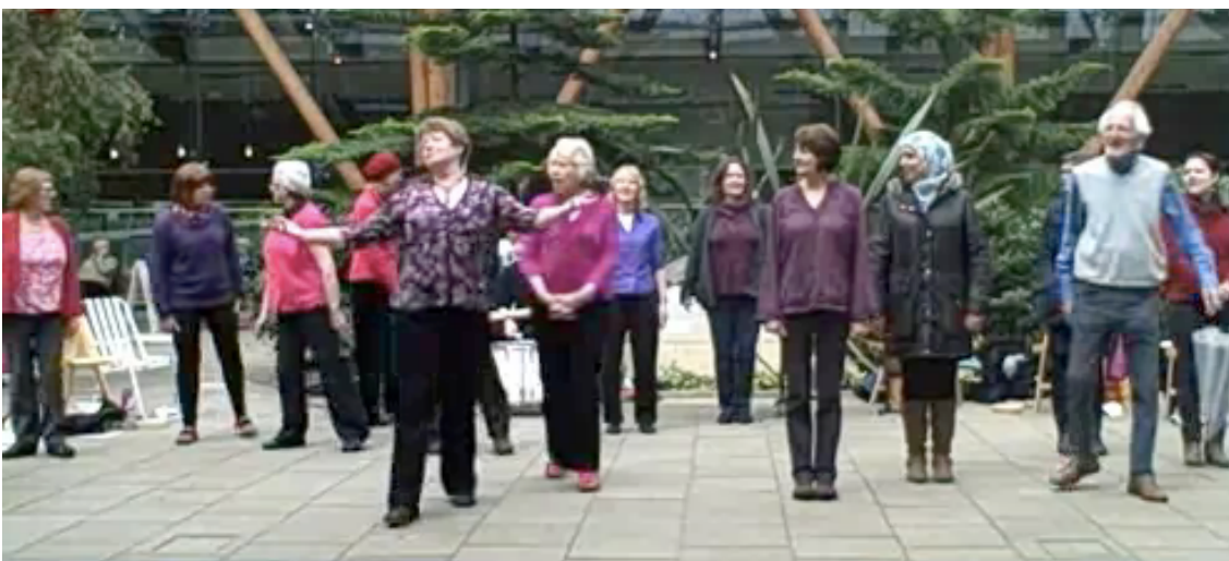
Fig 6: A polyphonic proxemics: Audience members and cast respond to statements on age and ageing.

This audience member seems to be concluding that this scene staged the possibility that with age even one individual can accommodate many perspectives. Spatial and verbal examination of these differing viewpoints staged a kaleidoscopic dialectics of age, where many splinter debates sprung up momentarily and spontaneously in the space, bringing into sharper focus the political thrust of the work.