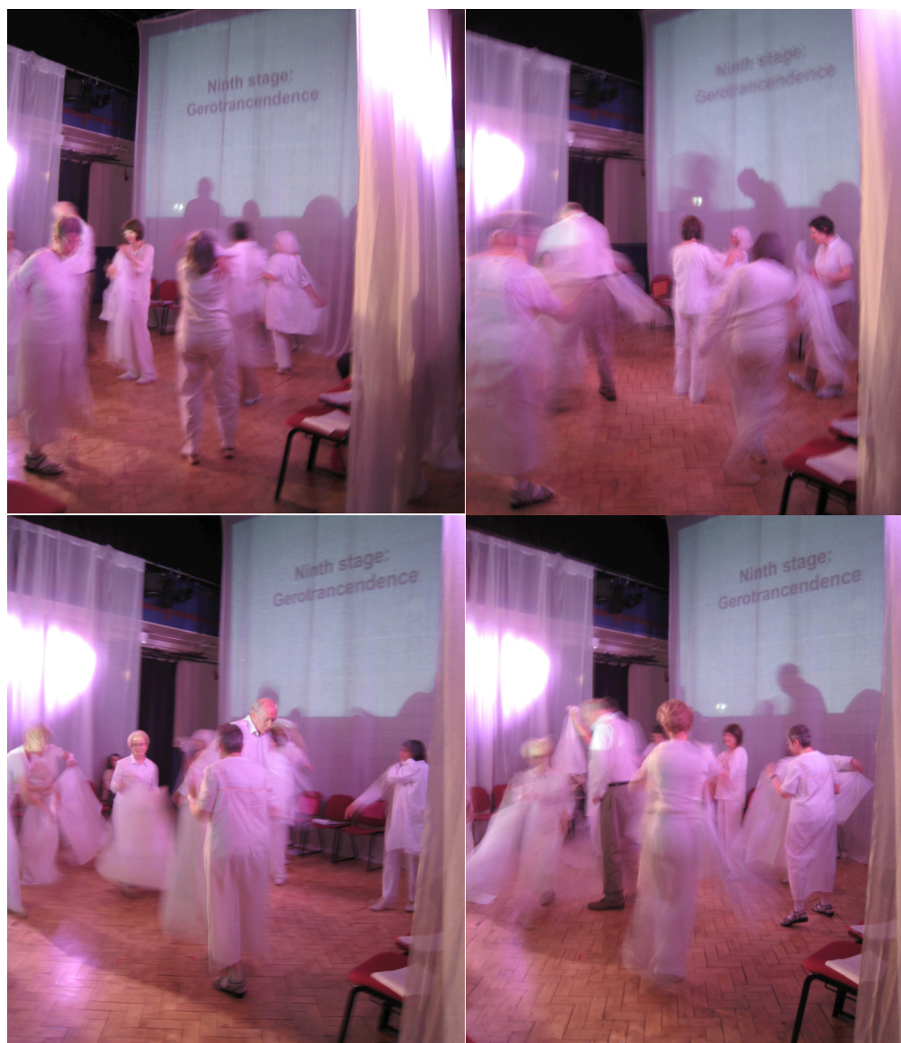
Fig. 14: The 'Gerotranscendence' in rehearsal

their emotional passage through life. The song uses the metaphor of life as a year and as something that should be wholeheartedly consumed. The singer is framed as a consumer of a number of varieties of 'girls' at various stages in life (at seventeen, at twenty-one, and at thirty-five) as if they are bottles of wine. Ultimately, looking back from 'the autumn' of his years, (at some unspecified age after thirty-five) he sees his whole life as a 'very good year' – a vintage wine – which he has drunk 'from the brim to the dregs'. The image of the group of old women (no longer 'girls') quietly, yet compellingly, reliving the specificity of their own emotional lives, contrasts with