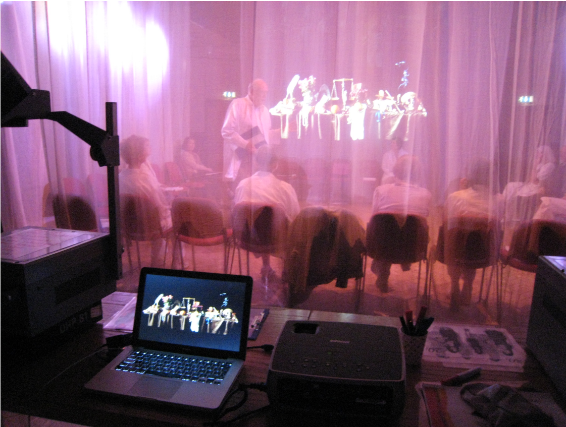
Fig. 11: The white box playing-space as seen from The Lab (rehearsal photo). The projection of a still life depicting the 'Seven Ages of Man' can be seen.