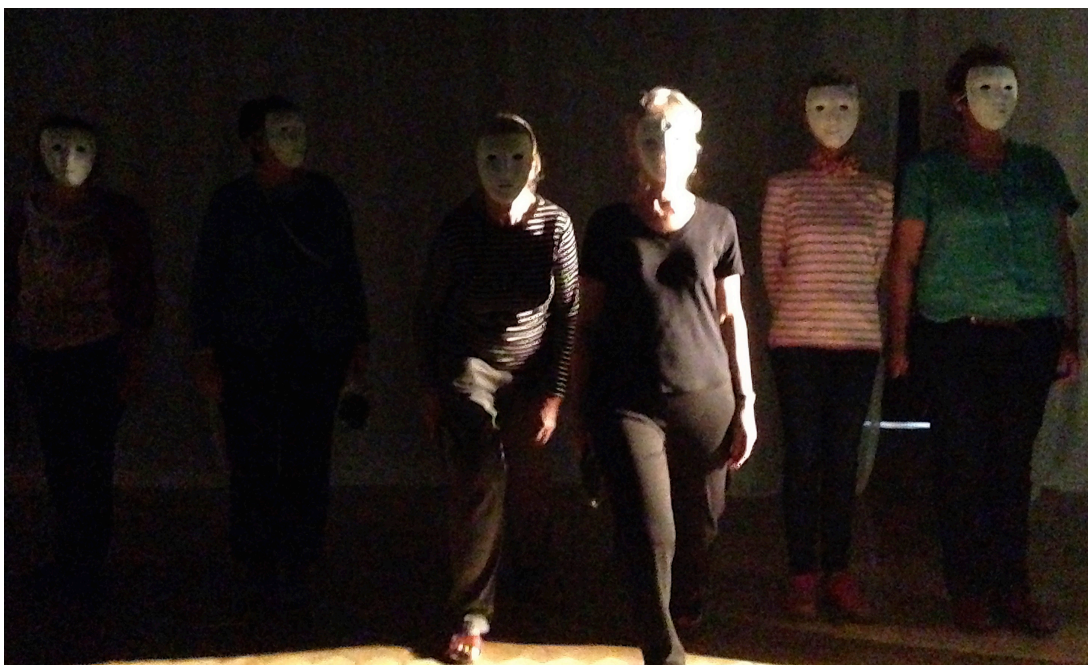
Fig. 21: The masks look out at the audience and are lit from the side.