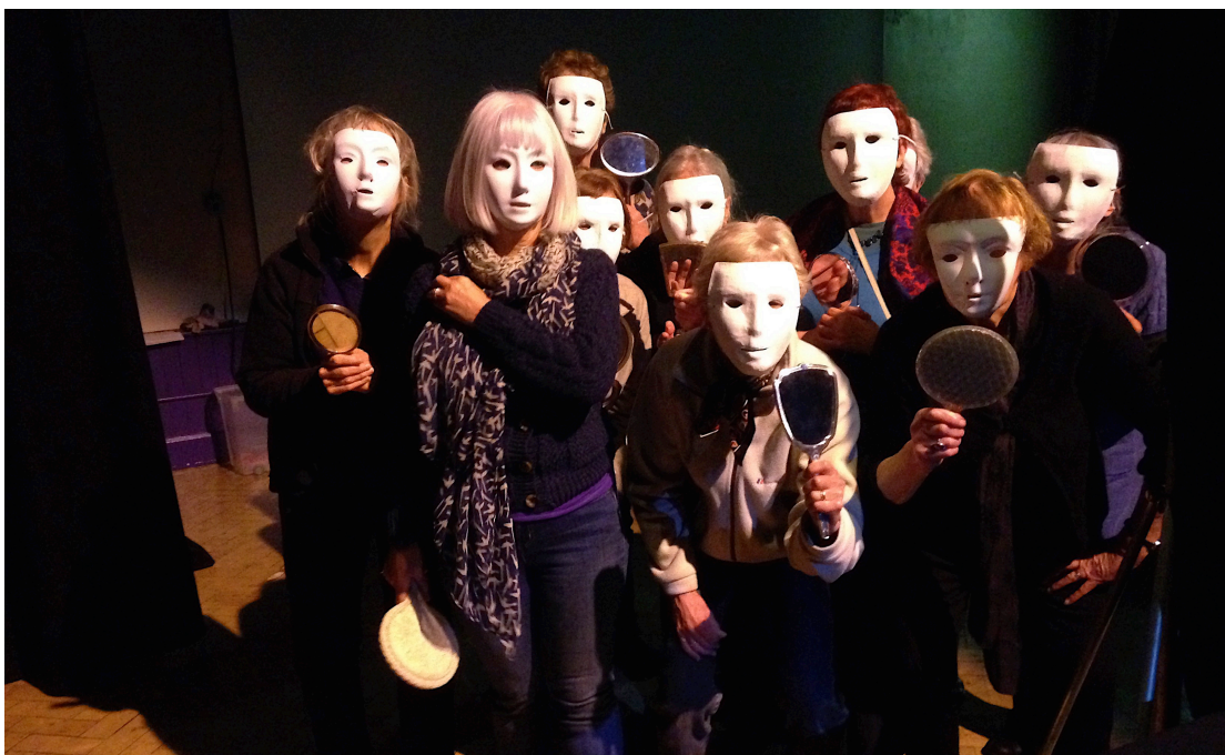
Fig. 20: Masked performers appear to the audience.