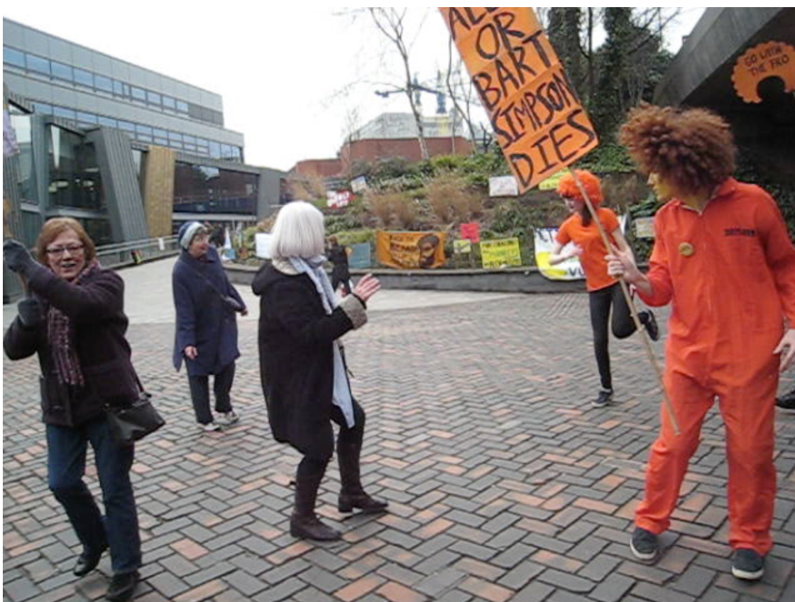
Fig. 23: Still from the film of Passages members dancing with campaigners.

age within simultaneous and proximate actions and images and thereby challenge the ‘strictly completed, finished product’ of the modern understanding of the body, in which, according to Bakhtin, the ‘completed’ body is ‘isolated, alone, fenced off from all other bodies’ ( ibid : 29). While the carnivalesque encounter is only brief, there is potential in this unconventional, liminal space – where the intergenerational group convened – for the old body and the young body, set in proximity to and interacting with each other, to bring into appearance the phenomenon of radical ‘incompleteness’ in a way that complements Basting’s ‘depth model’ of age performance as a strategy for troubling the normative performance of ‘completed’, age-static bodies.