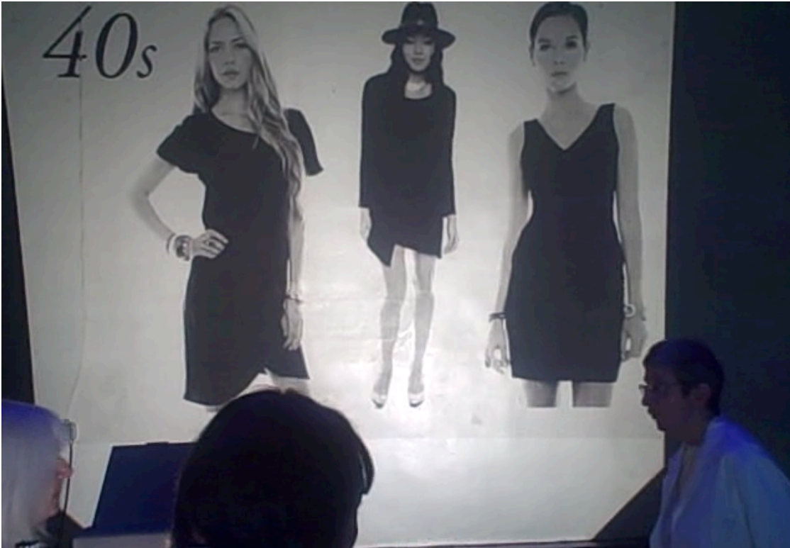
Fig. 13: The appropriate 'Little Black Dress' for different age groups (20s to 50s).