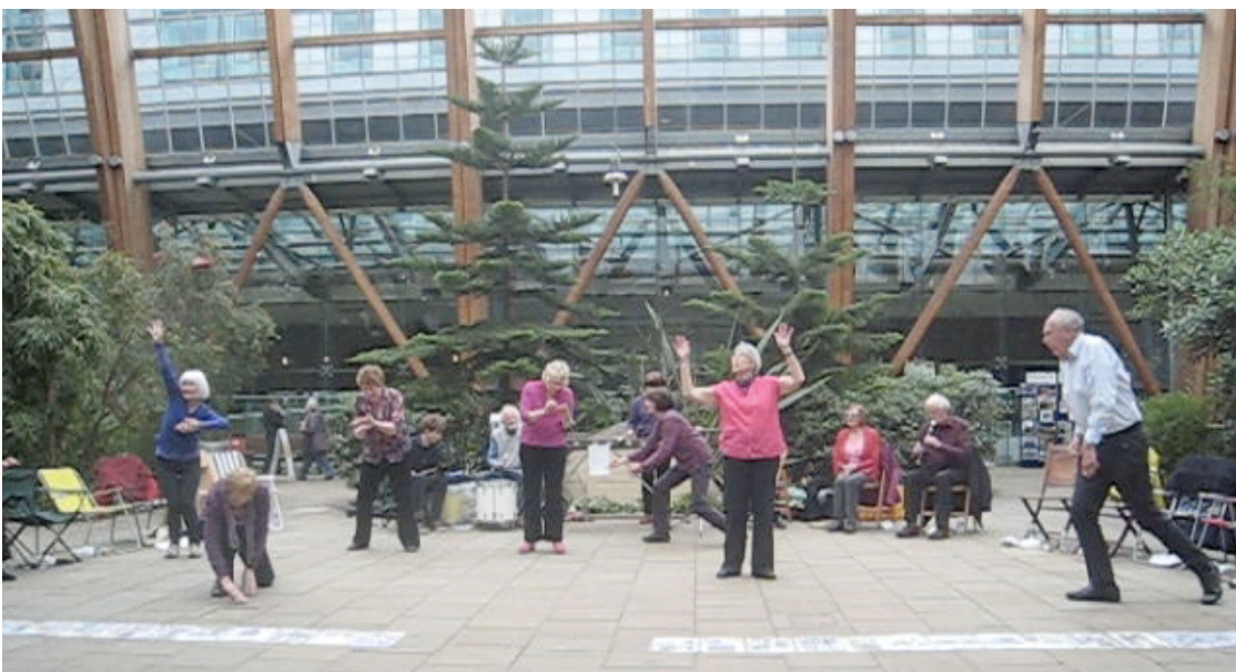
Fig. 3: ‘Significant form’ and ‘accomplished shape’ in performance at The Winter Garden.

visibility resulting from both inner inspiration and outer illumination, this acting as a counter to the creeping invisibility of ageing people. 15 The use of such a technique in the development of these sequences allows a kind of ‘accomplished shape’ and ‘significant form’ to be achieved; old bodies become more substantial in the space, growing bold and open enough in their expression of shape and form to present as significant and accomplished subjects. One audience member especially appreciated the ‘[w]onderful movement & focus – including from the oldest person on stage!’ and found the beauty of the arms opening at the end of the photo section’ most resonant.