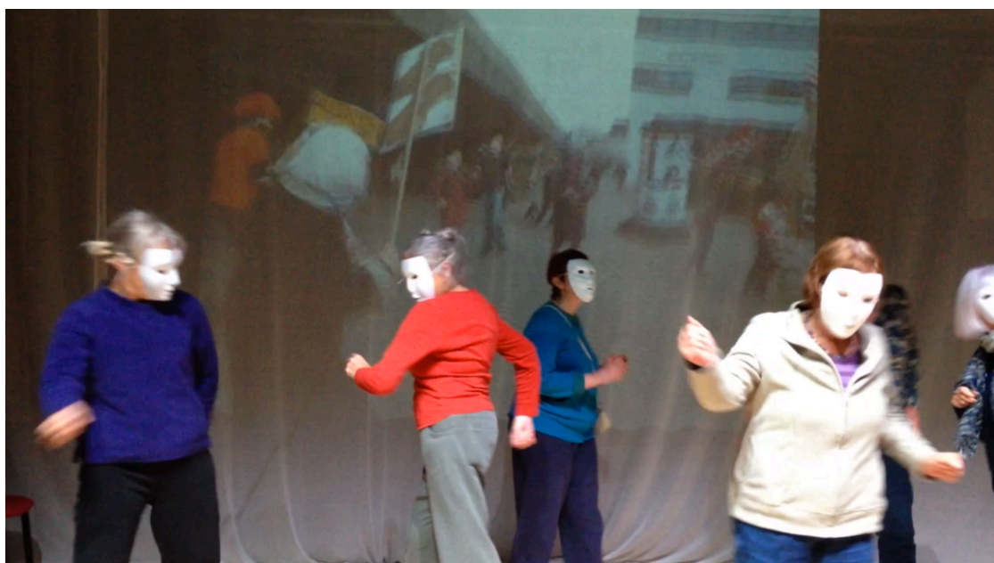
Fig 22: Rehearsal of the masks dancing in front of the projected film.

by Trentemøller. The ‘elderly people’ surreptitiously begin tapping their feet and walking sticks to the compelling beat and, as the track progresses, they begin to really catch the music. This propels them, one by one, off their seats into an exuberant and – in the words of one audience member – ‘sexy’ freeform dance. Confirming this ‘sexiness’, the masks discard their old people’s clothes and the remainder of their carnivalesque costumes in a playful striptease, returning to the all-black costume in which they began the scene (7.39 – 9.21). All, that is, apart from one mask that refuses to take off her gold lamé hot pants. The masks dance, enjoying the way their bodies respond to the music and losing themselves in the beat. Film is projected behind the dancers showing members of the company (without masks) with the Student Union election campaigners, dancing on the concourse outside the Student Union building (described above, see Fig. 17 and 9.37 – 10.33). The video of the company is seen, behind the live dancers moving enthusiastically, learning the campaigners’ dance and