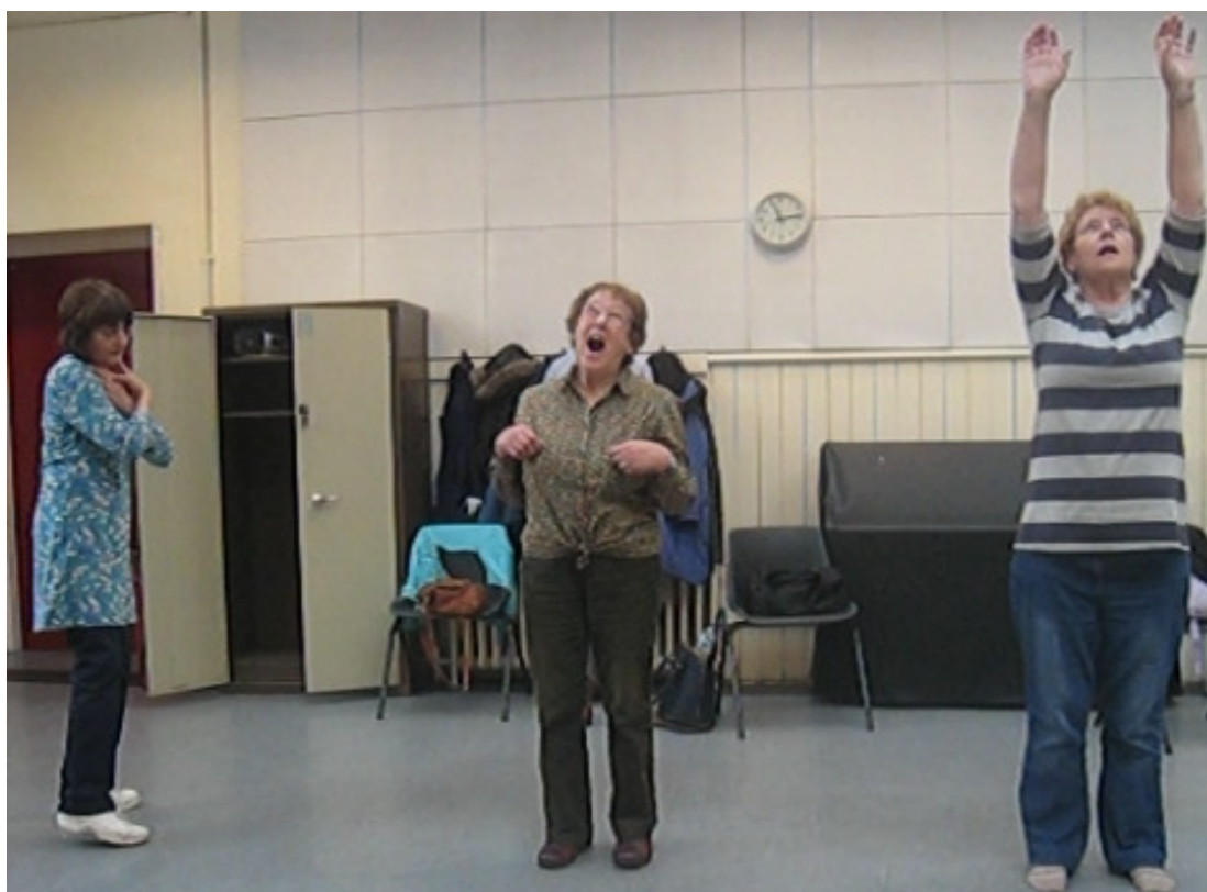
Fig. 2: Studio work exploring ‘significant form’ and ‘accomplished shape’.

techniques of photo-montage) the giant figure of a naked old woman on the staircase of a public library. Exploring an aesthetic of the old body that would allow the aged form to be significantly represented, she notes that ‘Wall [...] exposes the body as it is – not as youthful body but as an accomplished shape , as significant form ’ ( ibid , my emphasis). Following on from this, Cristofovici develops a theory of the ‘poetic body’; this is ‘a form that ensures the connection between the physical and the psychic self’, and ‘creates a generational continuum within the self’ ( ibid : 290). Her ideas provide a strong aesthetic target for the Passages’ work; the movement signatures (described above) are informed, amongst other things, by the wish to achieve a performance of ‘significant form’ and ‘accomplished shape’. This is facilitated by a physical theatre exercise that aims to imbue the performers with a sense of inner and outer