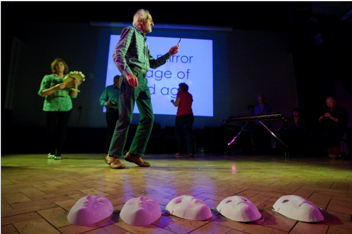
Fig. 5: Performers dance with their unmasked reflection.

The appearance of relatives such as mothers and granddaughters in these descriptions reveals something analogous to Cristofovici's 'generational continuum within the self' (1999: 290), and the piece universalises (as opposed to essentialises) the experience of encountering the reflected image of one's aged body, expanding beyond the present time and currently visible body. The universalising potential of performances such as this, could be enlisted as a counter to the 'othering' of old people by western cultural apparatus, as the performance recognises that we are placed in a continuum of generations who have experienced ageing before or will experience ageing after us. In addition, by placing the performer's descriptions between the performance-image of subjects dancing with a masked reflection and then dancing with an unmasked one, we resist the commonly reported rejection of self that Woodward identifies. 19 This piece deploys the ambiguous image of the mask to question what exactly we desire as ageing