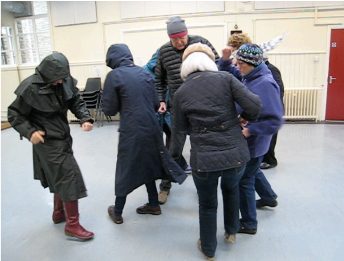
Fig. 15: The group dance to techno music as 'hoodie' figures.

without meeting the members of Passages, would make a piece exploring stereotypes of being old and vice versa; we would then come together to each perform our pieces and subsequently to collaborate on a piece that expressed whatever understanding the two groups came to collectively. However, in spite of much effort the college with whom we originally started the project dropped out and the stage school we approached subsequently only produced three willing participants. Consequently Passages did not collaborate with a younger group. It is perhaps indicative of the way young and old are now segregated that it proved difficult to attract a youth group to work with a group of old people.