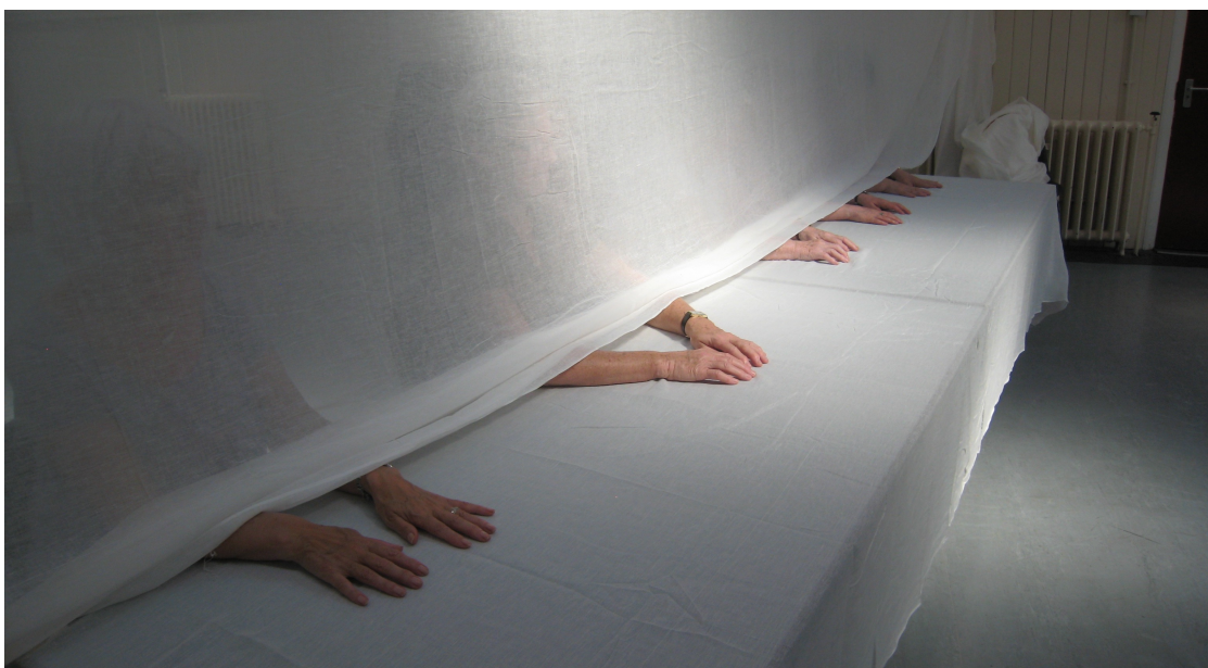
Fig. 18: The hands sequence in rehearsal.

when all they wanted was to be asked for, lent and given. (Cashdan, 2014: 57)