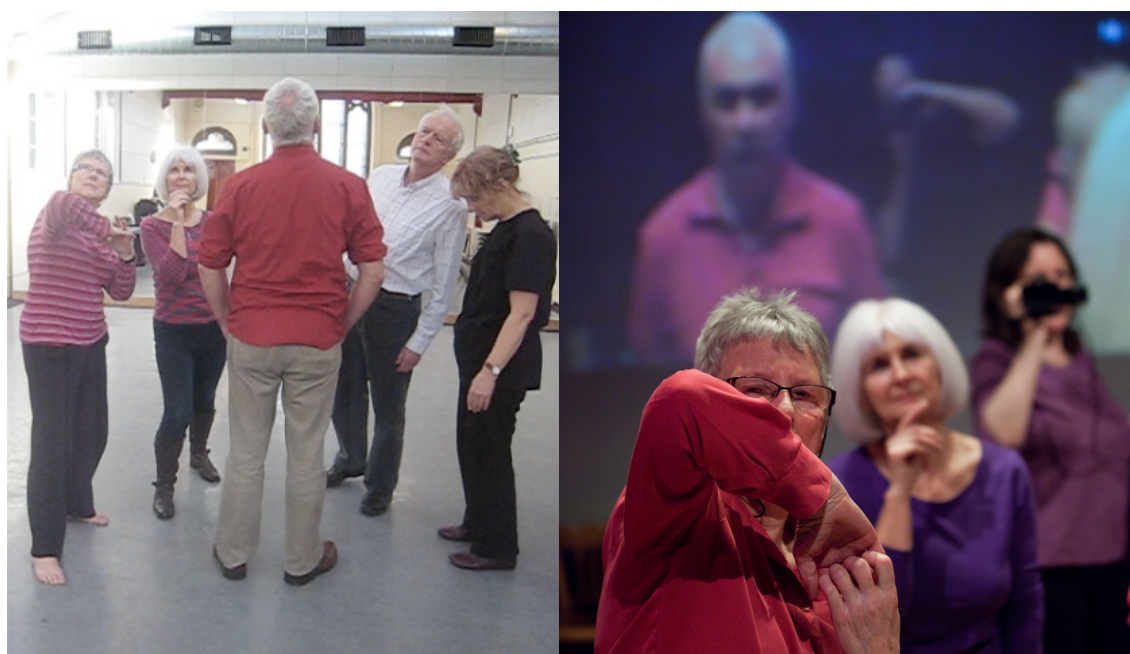
Fig. 7: Reproduction of research practice in performance: on the left a still from the video taken during one research session, and on the right a photograph of performers as they were filmed during the performance.

This presentation/performance hybrid – a new research-dramaturgy – might be best exemplified by the ‘live feed’ videoing during the ‘Images of the Future’ sequence. 45 Images and facilitation practices inspired by Augusto Boal’s Image Theatre method, used in the exploratory sessions are reproduced onstage. 46 The filming by which I recorded research sessions is replicated in the performance, the crucial difference being that the video recording feeds directly to a projector, which projects the close camera work live onto the upstage wall. Three ‘Images of the Future’ are staged simultaneously. The first is an image depicting feelings about the future, performers severally conveying fear, curiosity, wilful ignorance or denial about what the future might bring.