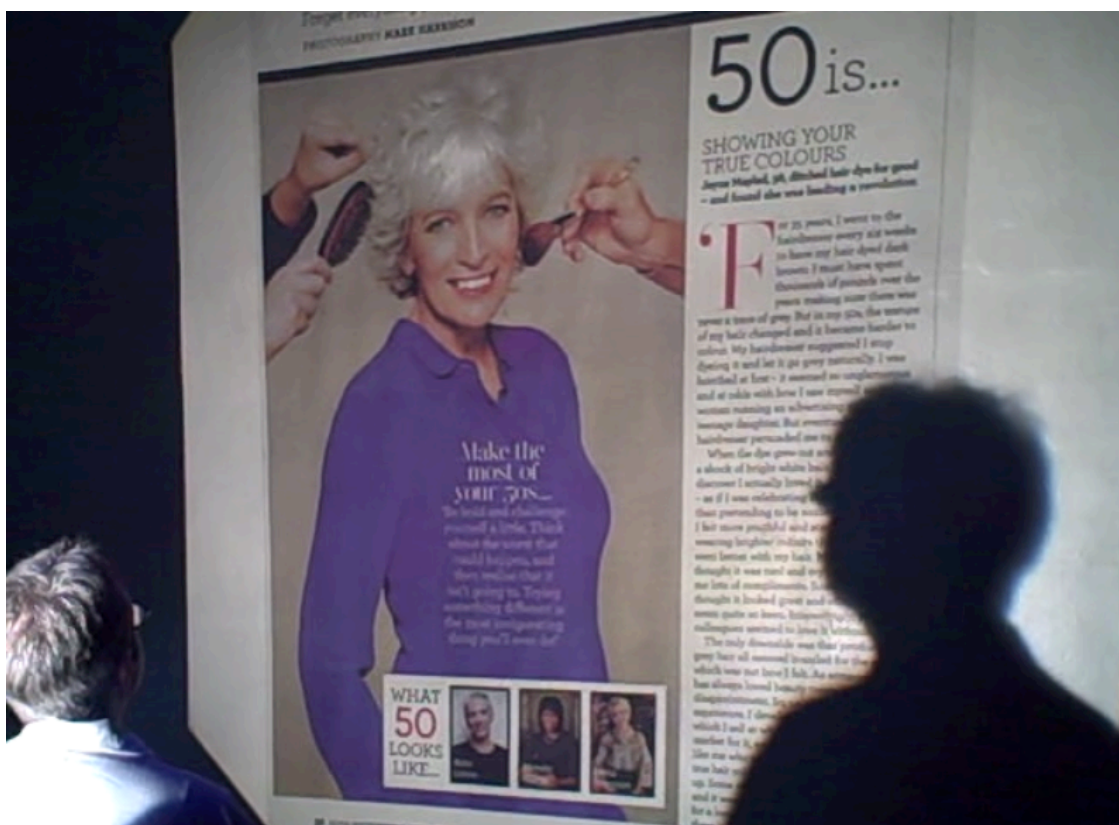
Fig. 12 : Expectations for lifestyles of different ages.

shifts onto current discourse around age prescribed behaviour and dress, and highlights the white-ethnocentric, middle-class and gendered construction of ageing. A maximum age of readership (the seventies) is stipulated by one particular magazine and, in an online article, advising on appropriate styles of the 'Little Black Dress' for different ages from the twenties to the fifties (but not beyond), a low age and body weight is in evidence in the women modeling the chosen dresses (see Fig. 13). The way in which age figures in these articles and how it impacts on women's self image is discussed. This sequence ends with a cartoon from the fifties that constructs masculine ageing, in which the previously ambitious CEO has fallen precipitously from his stepped ascent to the boardroom and is finally depicted in retirement, under a palm tree, cocktail in hand, on a level with the redundant infant once again. This comic image ends this second 'Lab' sequence and everyone returns to the main playing space.