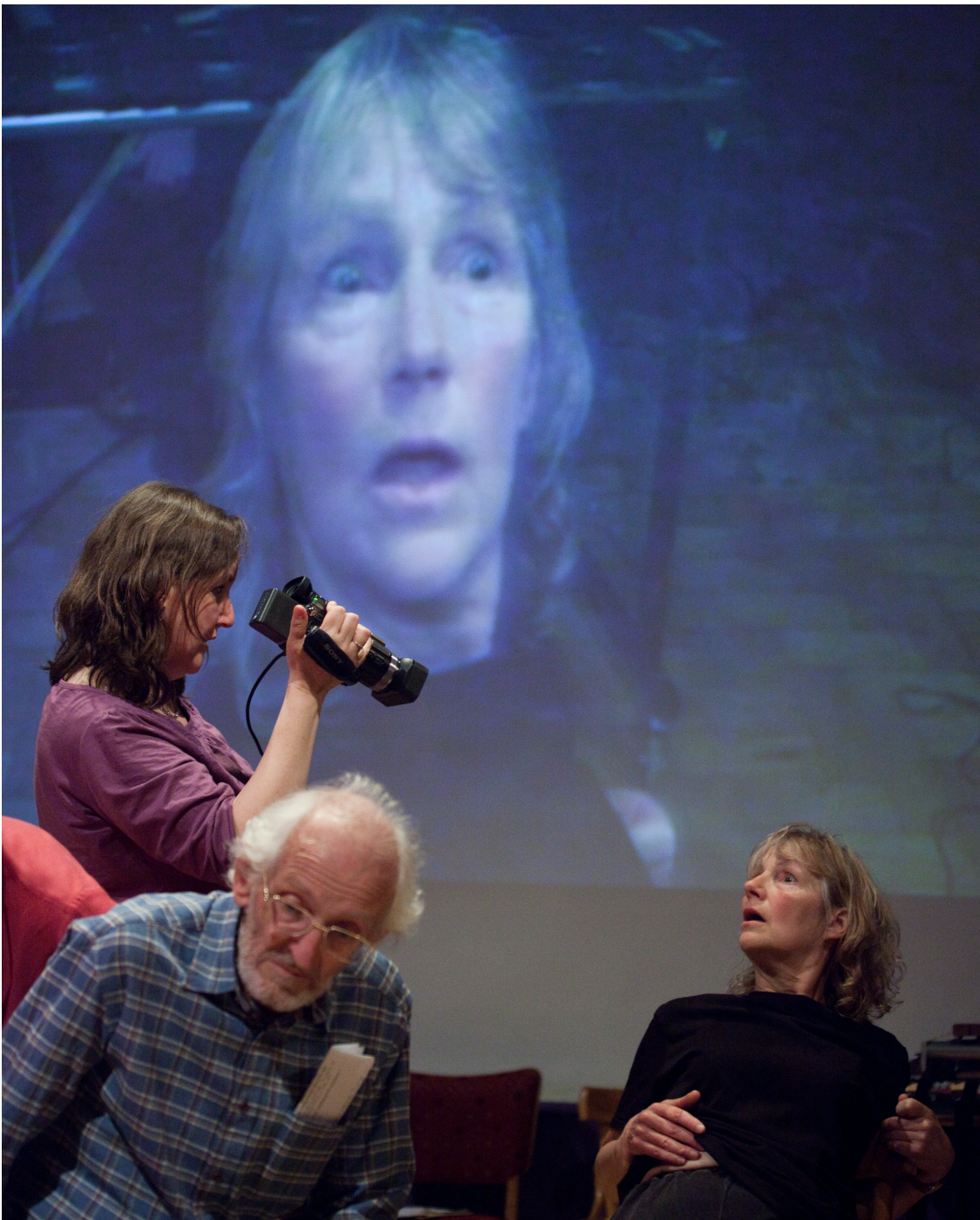
Fig. 8: Doubled seeing: projecting the close-up elevates the image of the old person to iconic status.

person it triggers the animation of each performance, in which actors voice statements about each figure's feelings, or – in the case of the final image – with interactions communicating confusion or pain. The figures are filmed in close up; their facial expressions and reactions magnified by the projection. One audience member commented: 'I found the videoing very powerful as it literally got close up to people and