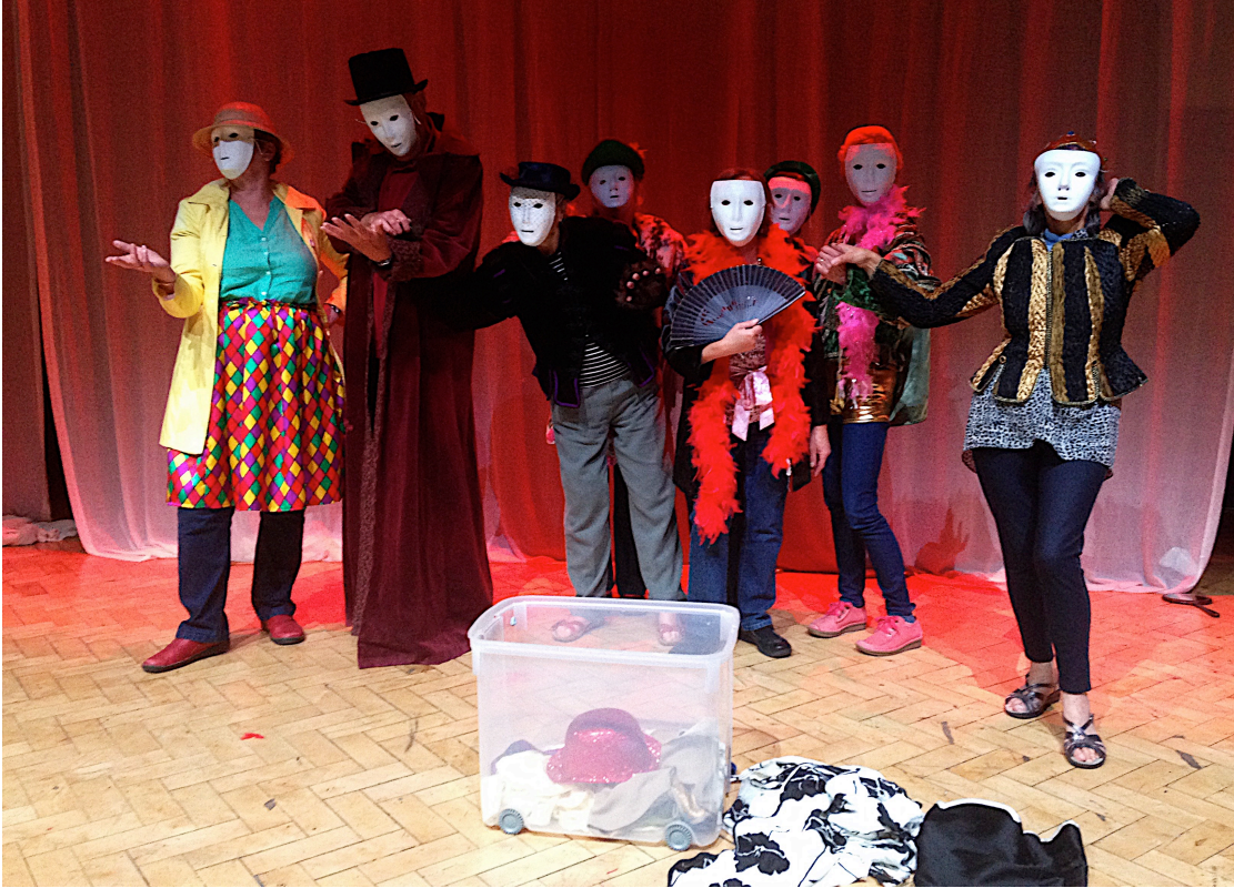
Fig. 19: The masks in fancy dress.

my phone, he got to the image that showed Fig. 19, (below), stopped scrolling and said ‘oh no, these are your young people’, thinking these were students I had been teaching at a summer school a month before. Further scrutiny, especially of moving images,