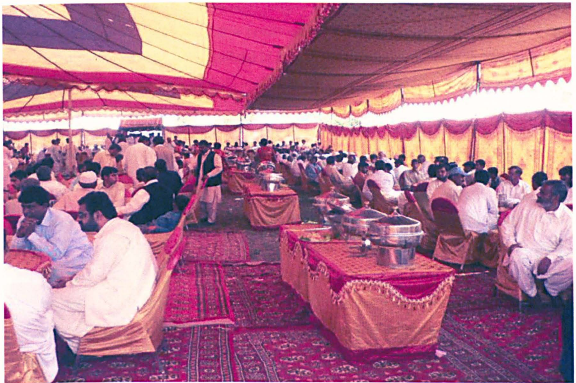
Photo 6.1 Walima ceremony at an influential Zamindar's house in the arid zone's village. It is a typical occasion for a Zamindar Biradari to identify their human resource network and express and strengthen their contacts with politically influential persons

On the other side, the large gatherings e.g. weddings and funerals, especially at the houses of influential Zamindars, are potentially political opportunities for the politicians to express contacts with the public and interact with them (Lyon, 2004). It shows how such gatherings serve the political interests of both Zamindars of a village and politicians. Walima and funerals, in particular, can be seen as the occasions through which local Zamindars and political influential develop contracts, or express and strengthen their existing contacts. Better off Zamindars or those aspiring for the leadership roles would send invitations to as many influential people as possible, especially the politically influential of the area. In contrast, comparatively poor Zamindars may only invite the leading individuals of their village and nearby villages on such occasions.