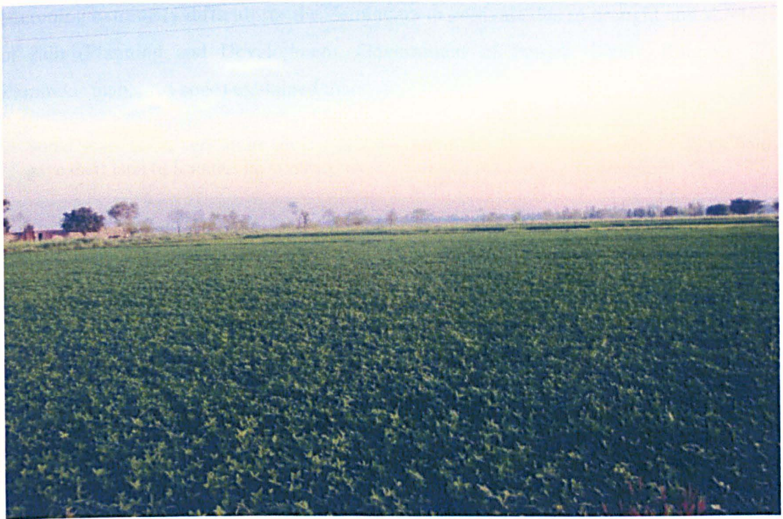
Photo 5.1 Land in the irrigated zone's village is fertile and the majority of villagers depend on agriculture for their livelihood

While the young Zamindar women in the irrigated zone's village were inclined towards education and a couple of them had a bachelor's degree, Zamindar families were not in favour of their women doing any paid jobs. In addition, involvement of the women in the agricultural activity is also reducing with time. On asking about the educational status of Zamindar women and their contribution in the agricultural activity, Rabia (24, Zamindar woman, irrigated zone) said: