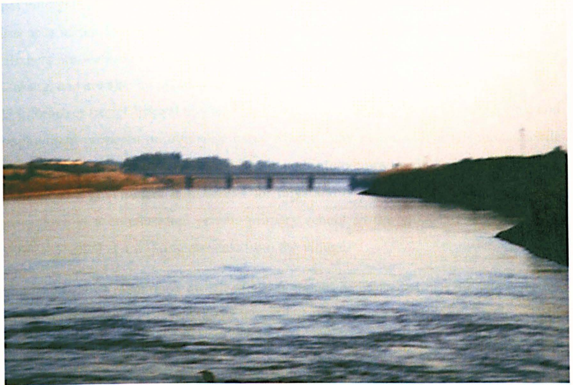
Photo 4.2 An irrigated canal is passing through the southern side of the irrigated zone's village

According to the union council records, Zamindars comprise around 82 % of the total population, compared with 18 % of Kammis. Jats of the village are divided into 3 major Biradaris. Awans and a Virk Biradari have kinship relations through marriages and thus are dealt with as one Biradari in this research. The village is located approximately 30 kilometres from Ferozewala tehsil, a larger urban centre, and the villagers frequently travel to Ferozewala for shopping and jobs. There are two primary schools in the village, one for boys and one for girls. The local health centre is located at a distance of 5 kilometres from the village. The village has the modern day facilities of electricity and telephone/mobile networks. Two Industries are located near the village where quite a few Kammis work as daily wage labour.