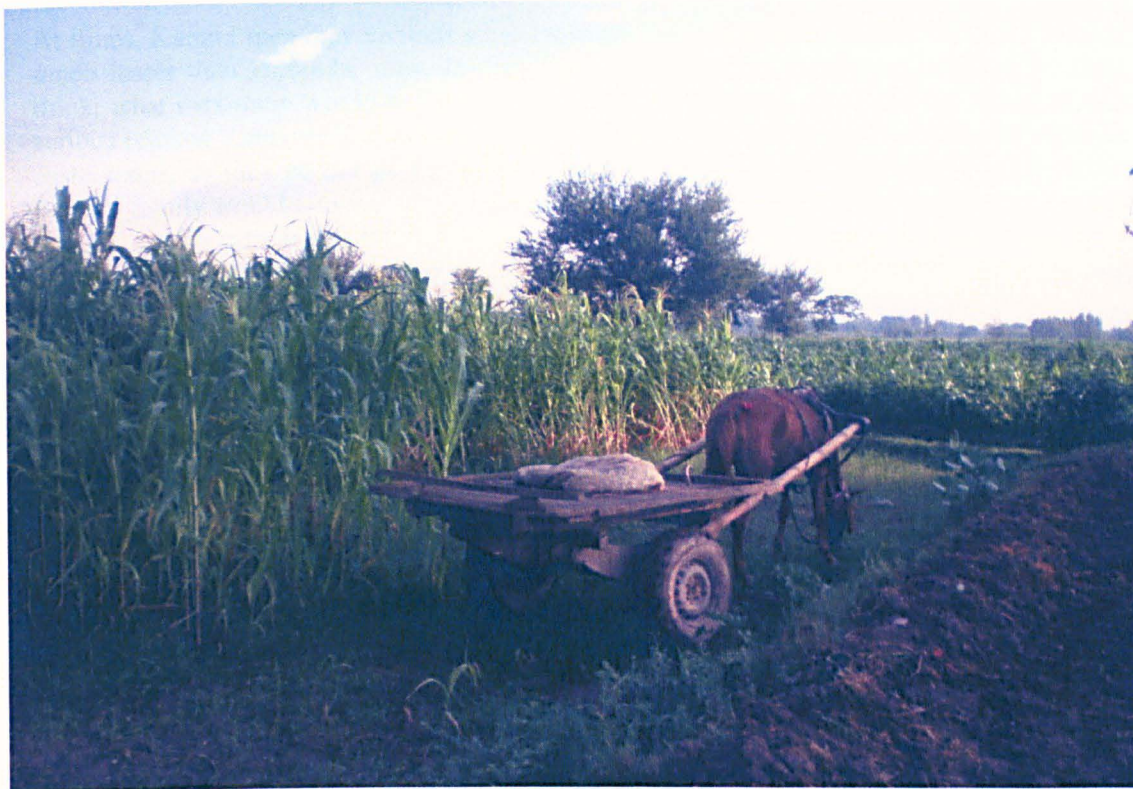
Photo 8.1 Agricultural field is largely a male space, located outside village boundaries in the irrigated zone's village. The picture shows how high the maize crops often grow. This provide some seclusion to workers on agricultural fields, which on occasion can be abused for other reasons including sexual violence; refers to the Ulfat's quotation above

Furthermore, Falaksher (35, Zamindar man, irrigated zone) mentioned that more than a few Kammi households in their village do not have toilets in their houses and for that reason their women go out on fields where they become highly vulnerable towards sexual abuse. Conversely, the situation in the arid zone's village was different in this regard and Kaneez (46, Kammi woman, arid zone) told that the majority of Kammi households in their village have toilets. It also shows that the socio-economic position of Kammis was better in the arid zone's village than the irrigated zone's village.