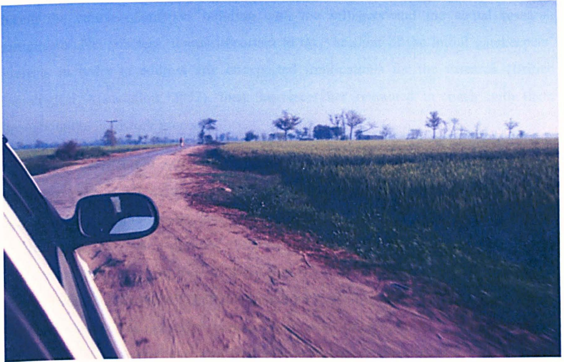
Photo 4.3 The research team approaching the irrigated zone's village