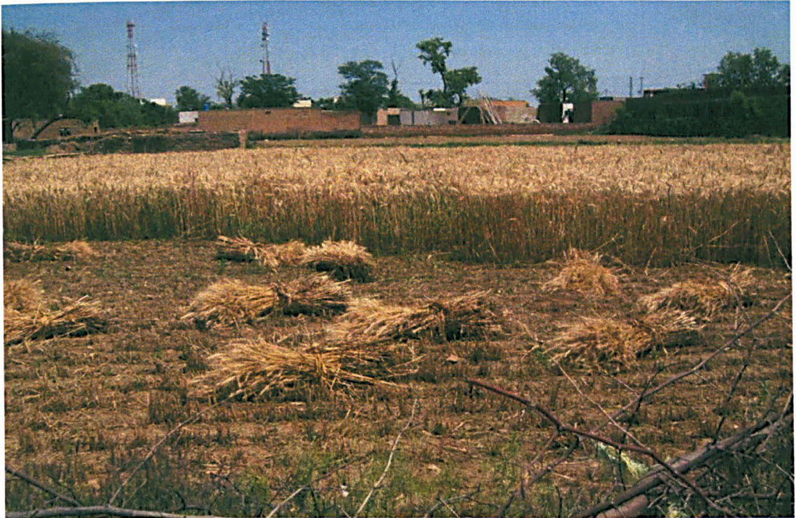
Photo 5.2 shows the harvesting of wheat crop in the arid zone's village. Land is not very fertile and the villagers cultivate on a limited scale

Some years back, agriculture almost ended in our village and many Zamindar households gave their land to Kammiss on contract. Others used to cultivate at a limited level.