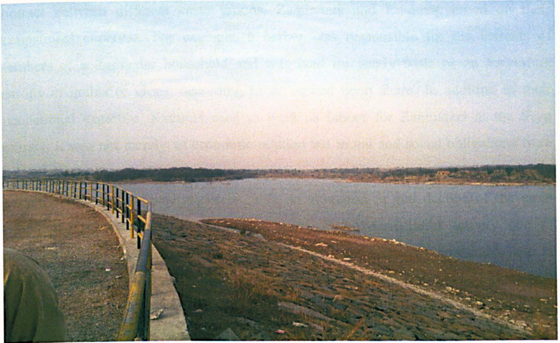
Photo 5.3 As a result of the construction of small dam near their village, quite a few villagers in the arid zone's village have resumed agricultural activity

Kamran (50, Zamindar man, arid zone) mentioned that Zamindars of their village are now adopting agriculture as a supplementary source of their livelihood. Nevertheless, agriculture remains the secondary source of livelihood in the arid zone's village and Zamindars were mainly dependent on jobs and businesses.