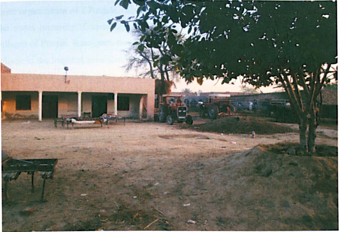
Photo 6.2 The Dera of a Zamindar Biradari in the irrigated zone's village, which they use both as a collective sitting place and to manage agricultural activity

On asking why the Dera system exists only in the irrigated zone's villages, the respondents suggested that the Dera system is found in those areas of Punjab province where agriculture forms the economic and social bases of livelihood. Mushtaq (62, Zamindar man, irrigated zone) explained how the Dera serves as a club for the villagers to relax and gossip after the hectic agricultural activity of the day in the irrigated zone's villages. Conversely, the people in the arid areas of Punjab depend on limited agriculture as a secondary source of their livelihood. Most of them are employed in the Army or other private/public sector jobs, especially in the district Chakwal (Planning and Development, Government of Punjab, 2003), and remain away from the village life. Since there are fewer opportunities of everyday life gatherings in the villages, the institution of Dera system, a platform for collective sitting on day to day basis, does not exist in the arid areas of Punjab.