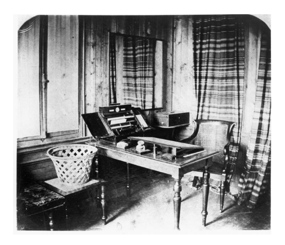
Fig. 3. Edward Banes, Chalet Interior. 1870. Photograph. Dickens Museum, London.

The importance of preserving the structure as a sacred space would become key to Georgina's actions in the 1870s (and would result in literary pilgrimages to see it in the early twentieth century). Charley's purchase of Gad's Hill at auction was a controversial move: Georgina had organised, together with Forster, to keep the house for the estate if the bidding price was not high enough (Adrian 158). Charley, attending the auction, feared it would go for too little and unknowingly outdid the reserve price, despite lacking the funds to pay for it. This left him in a difficult financial position, with a large family to support and problems at the offices of All The Year Round . The Swiss chalet formed part of his plan to solve this problem; however, in planning to exhibit the chalet at the Crystal Palace, Charley did not consult Georgina. Georgina, as joint executor of Dickens's will (with Forster) and 'Guardian of the Beloved Memory', as Adrian would later call her, was appalled that this move was made "without consulting the family" (qtd. in Adrian 167). Moving the chalet to the Crystal Palace took it from part of the family home and made it into an exhibit, placing Dickens as an author alongside