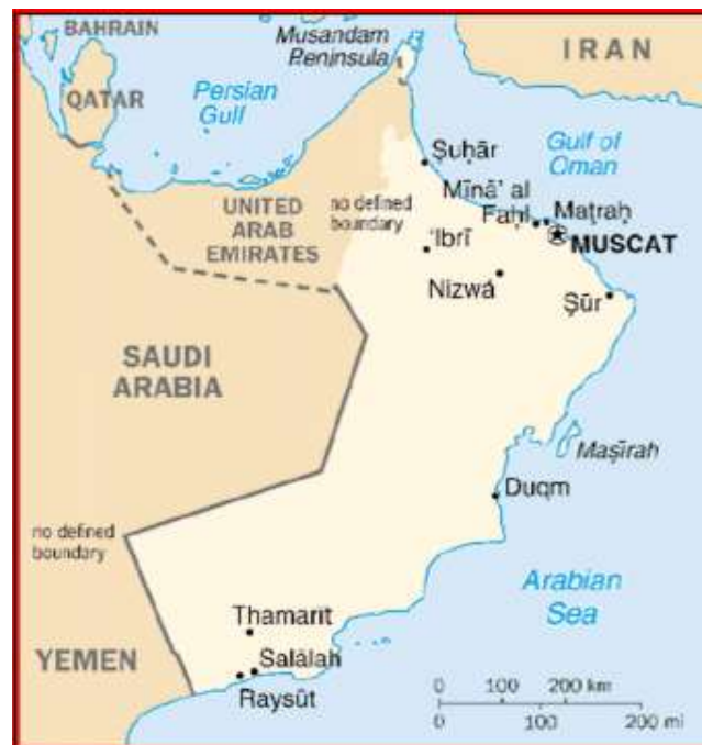
Figure 2 Map of Oman (Ministry of Information, 2013, p.21)

Geographically, Oman is about 80% desert (barren land), containing mountains. Geopolitically, Oman is divided into the three governorates of Muscat, Dhofar, and Musandam with the city of Muscat being the capital of the country. The weather in Oman is