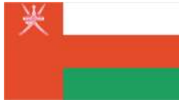
Figure 1 Omani flag (Ministry of Information, 2013, p.17)

... located in south-eastern part of the Arab semi- peninsula, ... Its shore extends from Hormoz in the north to Yemen republic in the south, so it is open to three seas: Arab Gulf, Oman Gulf and Arab sea. Bordered by UAE and Saudi Arabia in the west, Republic of Yemen in the south, Hormoz bay in the north, and Arab sea in the eastern border. This location has given Oman its historical role in connecting Arab Gulf states with these countries... ( http://www.omaninfo.om/english/2014 n.d.; cited in Al-Harhi 2011, p.345).