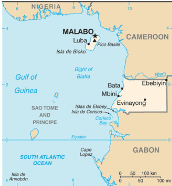
2016 US Government map of Equatorial Guinea