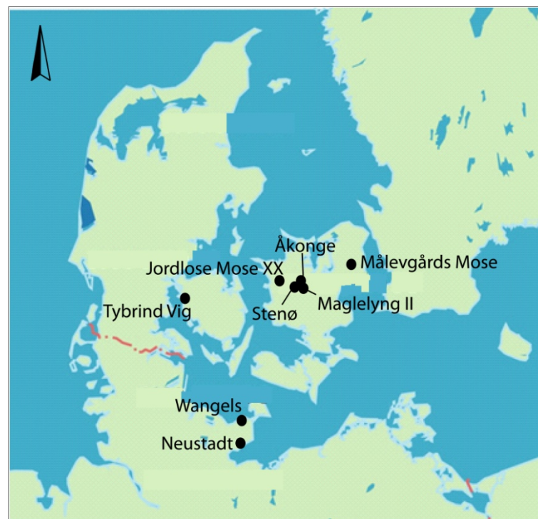
Figure 1. 1. A map of the sites from which ceramic and foodcrust samples were taken.

A range of eight sites are proposed for study, including both inland and coastal examples (figure 1.1). The sites were utilized for samples from both mundane and more ritualised contexts. The glacial history of southern Scandinavia has resulted in excellent waterlogged conditions for organic preservation at both the coast and inland locations. The relative increase in sea level since the last glacial maximum combined with isostatic rebound of the landmass has submerged many coastline settlements from the Mesolithic and Neolithic in the southern Baltic. In addition, samples from the inland Åmosen peat bog show similar levels of preservation of organic material allowing ceramic samples to be drawn from these different biotope sources of foods.