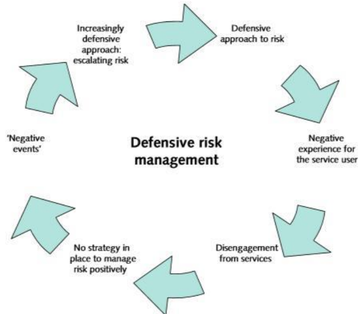
Figure 2. “Defensive” Risk Management (Sayers, 2007).

The second cycle described by the model: “ Defensive risk management ”, highlights how adopting this particular approach to risk management can lead to negative outcomes for service users (figure 2.). Conversely to the “ Collaborative ” cycle, negative experiences are described to result in disengagement from services, thus escalating risk which causes the clinician to become more defensive in their approach.