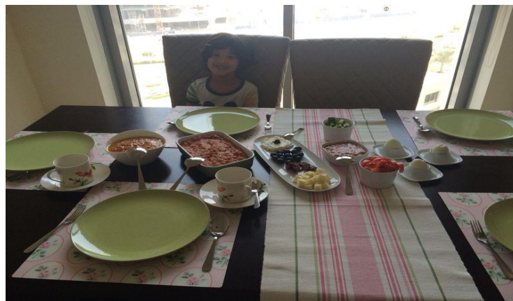
Figure 10.1 The situational negotiations within commensality

My data indicates that there are three aspects to mothers’ agency in food negotiations with their family. The first is related to situational negotiations which take place during the meal when the mother asks the child to eat or drink specific foods (see figure 10.1). The second aspect is related to the spatial and temporal negotiations , when mothers ask their children to eat together at a specific time with the other family members as part of the structured organization of Saudi family life (see figure 10.2). The third aspect is related to the influences of other agents rather than the mother on the family such as the father, elder siblings, grandmothers and aunts, or other family members (by providing sweets) which I have called familial and resource food negotiations (see figure 10.3). Indeed, all of the women in this study influence both mothers and children and the relations between them, thus shaping in many ways the family ‘food ways’. All three aspects are connected because they highlight the negotiations that occur in each context. The data illustrates that the process of eating and feeding children is negotiated between the mother and other family members involving the children in a private space in Saudi Arabia.