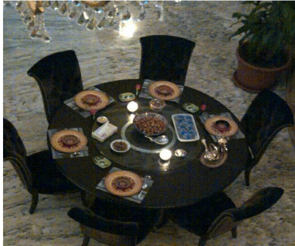
Figure 10.2 The spatial and temporal negotiations within commensality