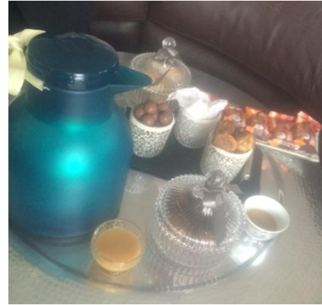
Figure 10.8 Sweet consumption is more with the elder children during coffee time