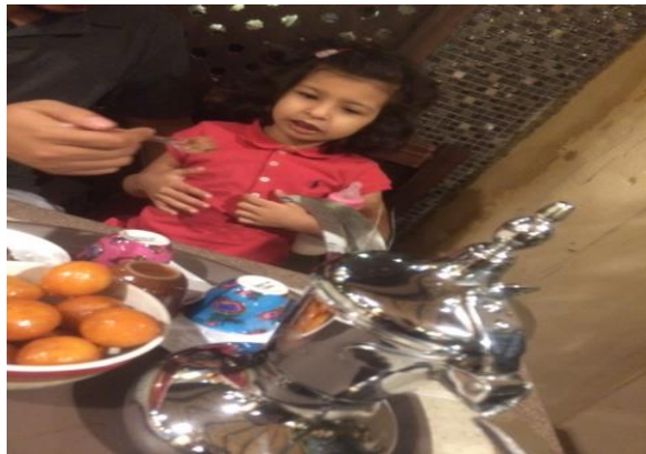
Figure 10.3 The familial and resource food negotiations within commensality