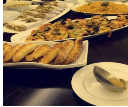
The Dinner meal