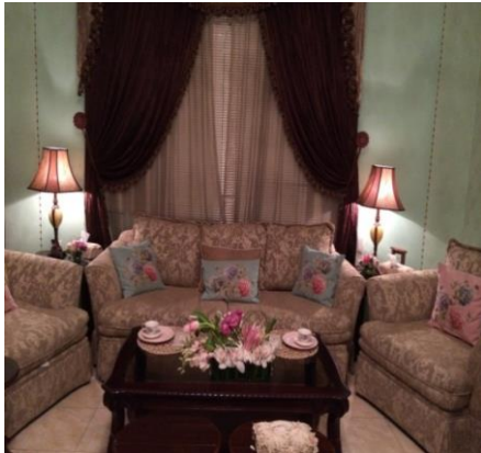
Downstairs living room