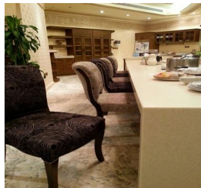
Figure 10. 4 The separate dining room that prepared to this commensal purpose in many Saudi houses located in the ground floor