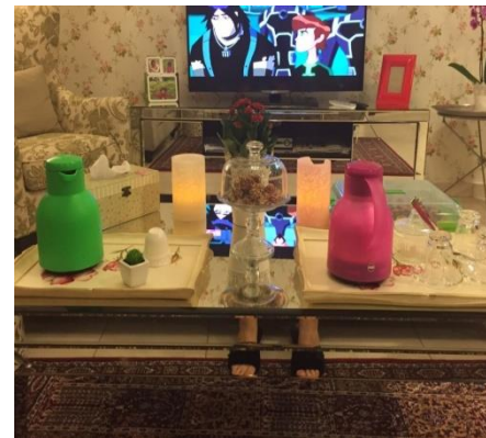
Figure 10.7 Daily commensality for daily Arabic coffee and snack after Maghreb prayer time in Saudi houses

In the family living room near their children.