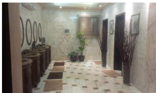
Figure 10.5 The dining room's separate toilets with many sinks (hospitality area)