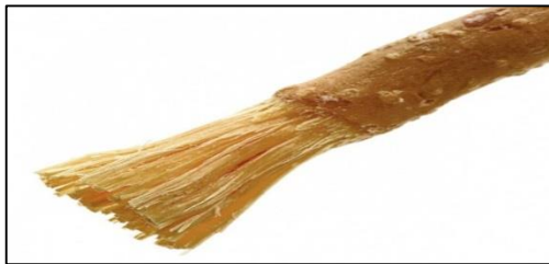
Figure 4.1 The Miswak

The source of dental hygiene as a practice emanates from Islamic knowledge given by the prophet Mohammed in Islamic societies. Oral health was originally reliant on dental knowledge which came from the Suras within the Quran and Hadiths (the prophet's sayings and actions). The Quran is offering advice about cleaning the mouth before prayer time 5 times a day by rinsing with water. The Prophet Mohammed also emphasised this instruction in the Hadith by using Miswak (a small traditional stick which has anti-bacterial properties) before each prayer time daily to maintain oral health (Owens and Saeed, 2008) (see figure 4.1). Muslims used Miswak before the discipline of dentistry was born (Owens and Sami, 2015). It is important that dental professionals respect such habits. For example, a high percentage of older people and a minority of younger people or children in rural areas use Miswak for cleaning their teeth with or without a tooth brush. Many older people believe it is more than enough (the Miswak), in contrast most young people use it as an additional aid with the toothbrush (Scully and Wilson, 2006).