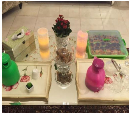
Figure 10.6 Daily commensality for all meals in Saudi houses