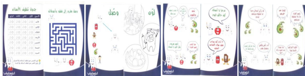
Figure 8.2 Examples of schools’ oral health programmes activities for children to be taken home.

Within Saudi Arabia, oral health programmes are implemented regularly within both the state and private schools. One example of this is the provision of posters for children to colour in at home, the provision of toothpaste and tooth brushes which may in turn positively affect the child’s daily practices. Anecdotally, mothers had these types of