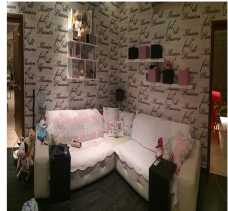
Upstairs living room