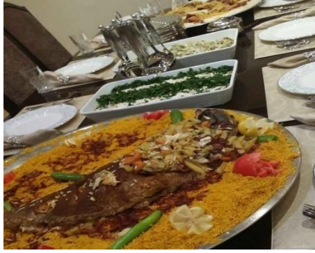
The lunch meal