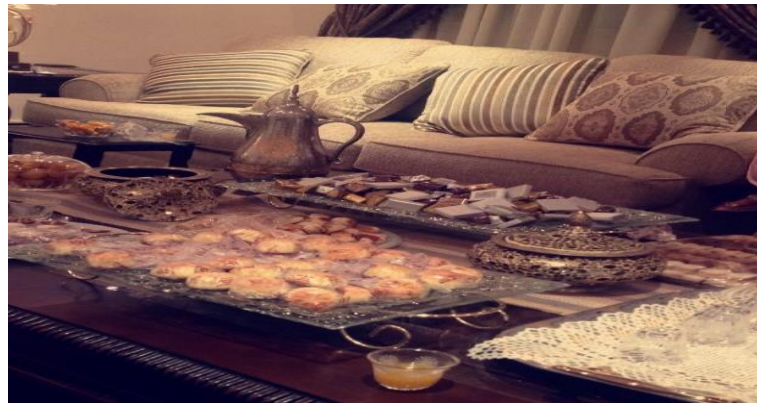
Figure 10.9 The provision of sweets is considered normal and associated with the family gathering

Therefore, these eating issues that are provided by the women's views of everyday life in their homes; where the mother is the main provider (agent) for food, health and family practices, enabled me to understand the dietary practices in Saudi families. They offered more understanding about the social rules and cultural constructions associated with eating habits that may promote children's oral health or even present the negative dietary practices amongst the Saudi families (see figure 10.9). The findings of this research show how family life in Saudi culture is deeply valued. They also demonstrate how daily commensality in Saudi homes has not changed even with the advent of recent developments leading to an increase of nuclear family structures (see figure 10.10).