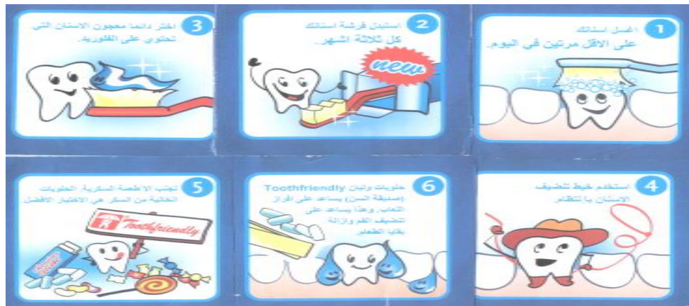
Figure 8.1 A leaflet of oral health practices as a part of the oral health programmes in the schools.

clinics (Ministry of Health, 2007). The schools programs also aimed at parents through the distribution of printed products to emphasise regular tooth brushing under supervision to improve children’s daily oral health practices. All these activities are conducted to make oral health part of the daily teaching activity and spread oral health awareness among the children (Ministry of Health, 2007). Tooth brushes and tooth pastes have provided in all programmes activities.