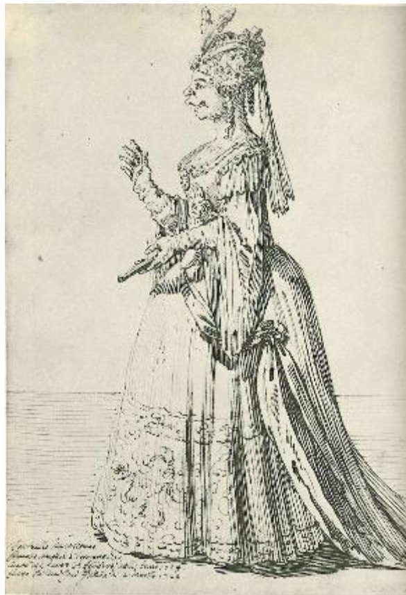
247 Ghezzi, Piere Leone, jpeg image of ink drawing. The Pierpont Morgan Library, New York. 1724.