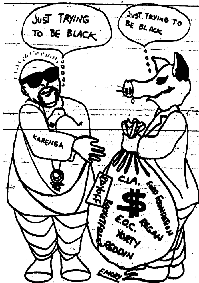
Figure 3: 2 February 1969