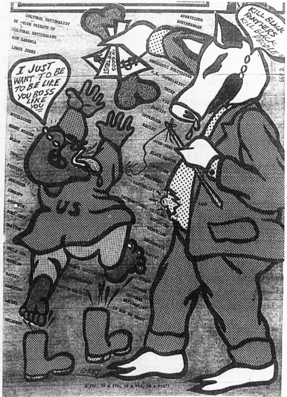
Figure 4: 23 August 1969

Douglas also reflected the BPP's increasing internationalism, taking influence from the material contained in the Liberation News Service, especially the propaganda posters from south east Asia, Africa and Cuba. 80 'Their pictures,' he argued, 'show napalm burning people alive, but they always express the victorious spirit.' 81