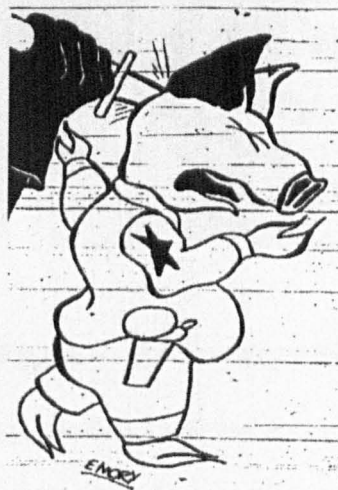
Figure 2: 7 September 1968