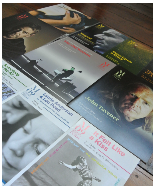
Figure 12: MIF printed materials from MIF09 and MIF13

It is evident that the design of the office is intended to match the values that are displayed within the Festival's printed materials (described as "Timeless, classic, elegant, [...] running through the absolute veins of everything we do" – IV10, MIF Employee) – a facet related to Original Modern through the aim of the brand ethos to be easily translated across time periods – and one employee announced to me that "the office is now a very good demonstration of the brand values" in its current home at Blackfriars House (IV10, MIF Employee). Some employees even developed a tendency during my time at the Festival to refer to a fictitious MIF 'Aesthetics Committee', determining the look of the desks (I once spent an afternoon checking every branch of Ikea for a particular colour of discontinued desk), the type of flowers that should be on the front desk (requiring daily attention), the display of awards and printed materials on the shelves (see Figure 12).