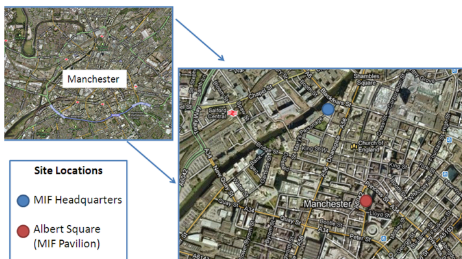
Figure 2: Primary Site Locations

different implications for the research undertaken, particularly regarding issues of public and private space; for example, MIF Headquarters falls within the parameters of private space, and thus access to this area was contingent upon my role as office administrator as well as my role as a volunteer (or indeed as a researcher) necessitating my visiting the offices. The issues surrounding the sites that constitute public space relate more to concerns about informed consent of participants, whilst the issues of ordinarily public spaces 10 that have certain restrictions placed upon them for the duration of the Festival differ slightly again as the interaction of the public with the space differs from the way in which they would use it ordinarily.