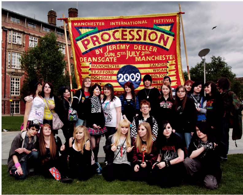
Figure 10: 'Cathedral Gardens, Saturday Afternoon, Rain or Shine' (Deller, 2010. Image courtesy of MIF)

A number of other interviewees also expressed a belief that this project could show a different side to the Festival, and create 'legacy' – a process that was brought to the forefront of the minds of cultural and sporting bodies in the wake of the London 2012 Olympics. One said that “you know you can say ‘I saw Macbeth in a church, that’s pretty cool’ but actually look, what is the lasting thing that’s going to put Manchester on the map is things like The Biospheric Project ” (IV11, MIF Employee), with the inference being that the different and lasting nature of The Biospheric Project (which is intended to run for a minimum of 10 years) may have more impact on Manchester’s national or international reputation than some of the more traditional shows (with MIF13’s Macbeth starring Kenneth Branagh cited as an example here). Despite questions of how to measure value, the decision on the part of MIF’s directors to include The Biospheric Project in the initial MIF13 announcements in Autumn 2012 (along with Macbeth starring Kenneth Branagh and The xx in residence) suggests that there is a desire to place an unusual and seemingly more community-focused project on a par with both popular music and innovative stagings of Shakespeare, and perhaps thus a desire to shift the image of MIF in the eyes of the public: