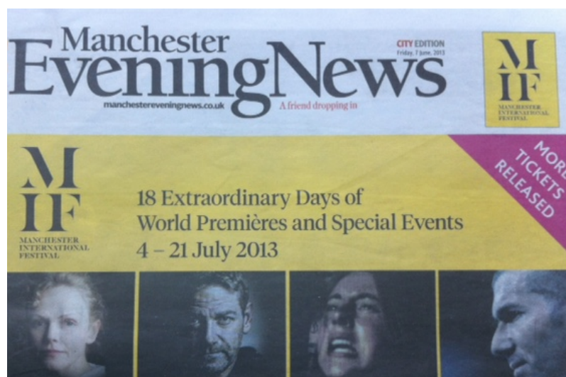
Figure 9: '18 Extraordinary Days'; Manchester Evening News cover, 7 th June 2013

the bank ASAP? The phrase that greeted me on my (breathless) arrival at the bank some minutes later: “Are you feeling extraordinary yet?” – a throwaway remark, and yet one that resonated with an overarching sense of what MIF appeared to be about.