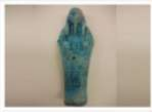
Ancient Egyptian Funery Figure