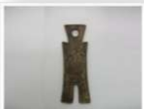
Old Chinese Money

"With a sense of unshakeable fascination I reached out for the Egyptian Shabti which I felt was the greatest in value for its historical position. After discussing all other artefacts I was surprised how my perception changed about certain objects, however the Shabti still convinced me for the sole reason that it survived centuries and the fact that it belonged to a mighty empire of the past."