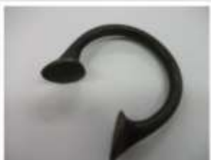
Old West African Money