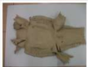
Modern Nile Crocodile Skin

"I thought the Shabti was the most valuable, after discussing with the group my opinion changed to the hand tool, due to the facts that were presented to me."