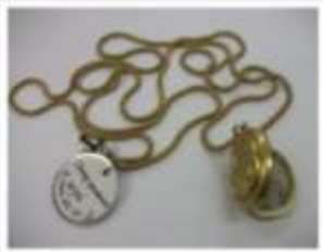
Edwardian Keepsake Locket

"I was immediately drawn to the Olduvian Hand Axe. Without this one item from human history humans wouldn't be who they are today. Therefore to me it is the most valuable object in our history and development."