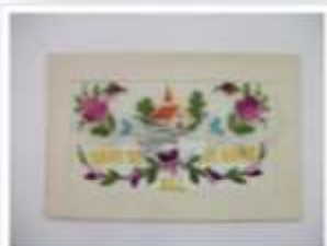
First World War Silk Postcard