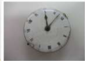
Early English Watch (Front)

"I thought the Verge Watch's historical concept of time keeping was the most interesting of the objects, yet the locket has become the most valued to me as it holds an emotional romanticism."