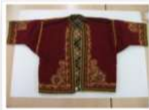
Modern Palestinian Wedding Jacket