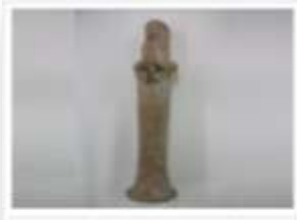
Ancient Symbolic Cypriot Figure