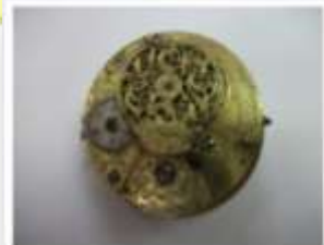
Early English Watch (Back)

"Palestinian Wedding Jacket: I was instantly drawn to the bright colours, the intricate patterns, and the shape and design."