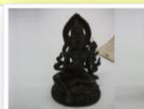
Modern Tibetan Buddhist Figure