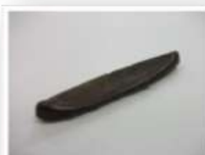
Old Indonesian Money