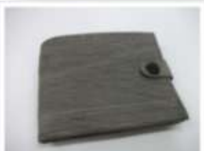
Modern Elephant Skin Wallet

"WWI Postcard: because of the traumatic circumstances it was produced in, and the Honey-bee specimen: the immensity of their contribution to ecosystems and human survival."