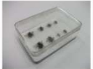
British Bees Specimens

"I thought the Verge Watch's historical concept of time keeping was the most interesting of the objects, yet the locket has become the most valued to me as it holds an emotional romanticism."