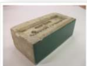
Victorian Glazed Brick