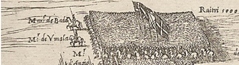
Figure 9, Detail of an engraving of the Battle of Montcontour, showing Philibert of Baden at the head of 1000 German reiters . 112

did get the chance to prove his worth on the battlefield. He fell at the battle of Montcontour on 3 October 1569, a fact that was recognised in amongst others a German pamphlet from 1570 and an Italian engraving from 1569. 111