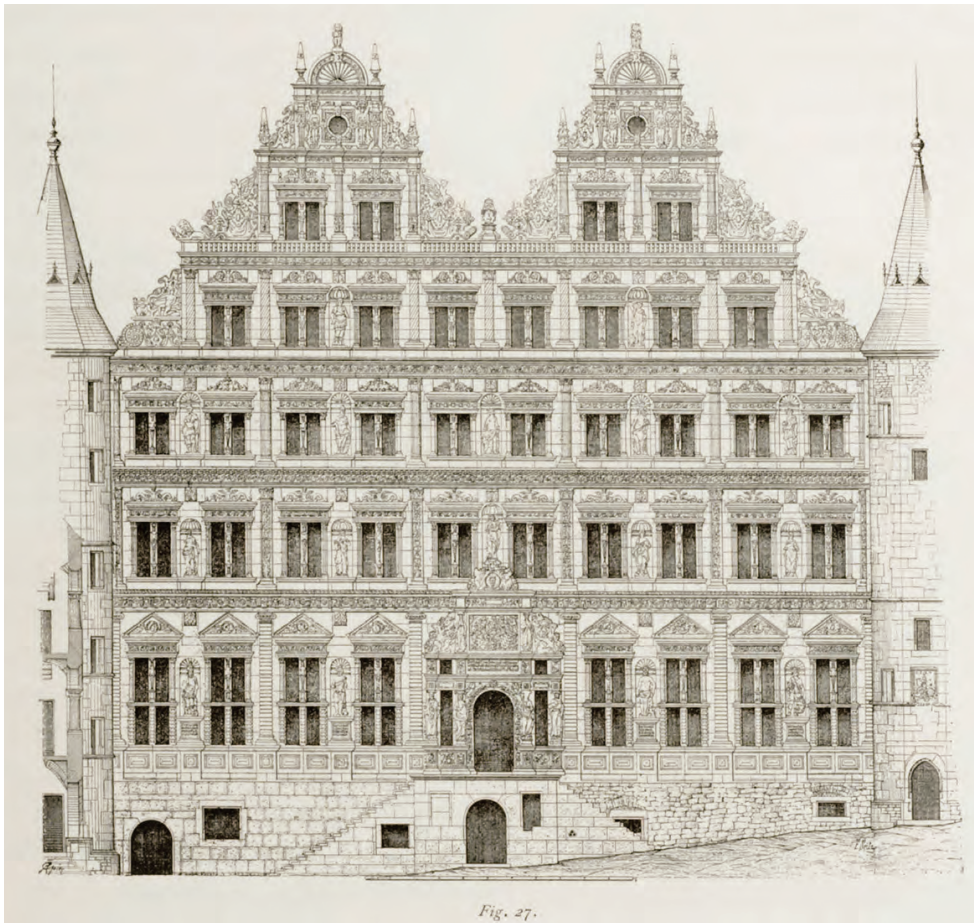
Figure 3: Nineteenth-century reconstruction of the Ottheinrichsbau. 131

statues of figures from classical antiquity, looks so quintessentially Italian that it has often been (falsely) rumoured that Michelangelo Buonarroti was its architect. 129 The building project gave Ottheinrich, father of Friedrich III, international renown. In 1559, an English ambassador in Germany, Dr Christopher Mont, described the Ottheinrichsbau as ‘a magnificent and sumptuous building, for which [Ottheinrich] assembled from all parts the most renowned artists, builder, sculptors, and painters.’ 130