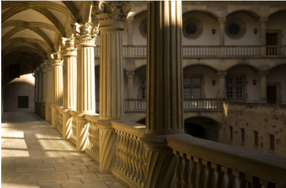
Figure 4: The courtyard, Altes Schloss, Stuttgart. 134