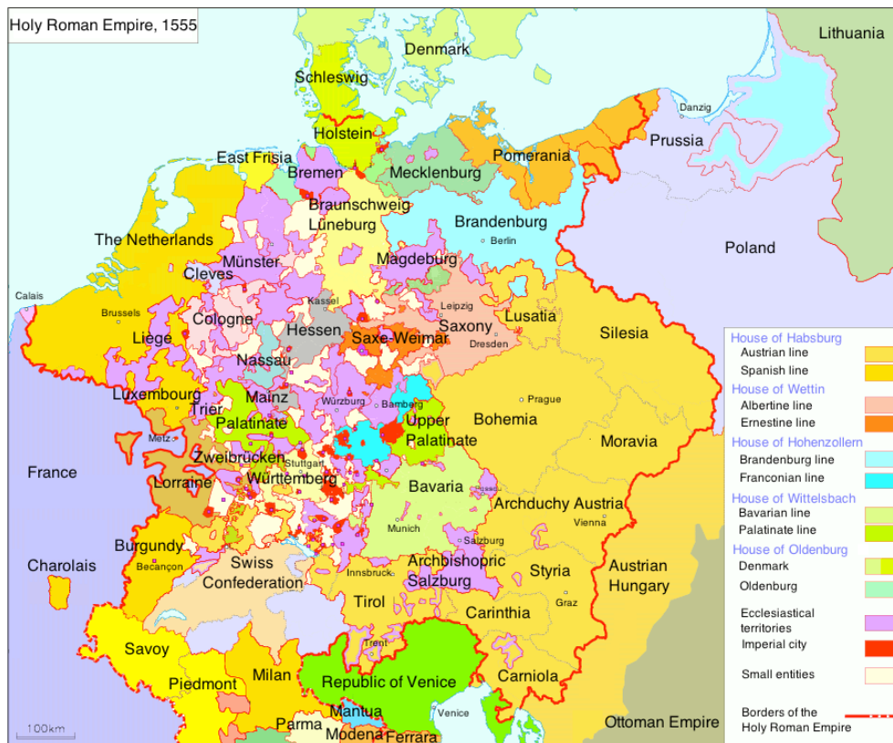
Figure 2: Map of the Holy Roman Empire in 1555. 18

Politically the Rhineland was also unusually diverse. Broadly speaking, the political entities that formed the Empire were significantly larger in the east than in the west (see Figure 2). Around the Rhine the map of the Empire looked most fragmented. 19 Some of the most important Protestant entities, such as Württemberg, Nassau, and the Palatinate, were located in close proximity to the seats of the three ecclesiastical Electors: Trier, Mainz, and Cologne. Moreover, besides the many duchies, counties, and bishoprics, a string of Imperial free cities lined the Rhine. As a result of this fragmentation, regionalism, rather than nationalism, dominated life in the sixteenth-century Rhineland. In his book Town, Country, and Regions in Reformation Germany , Tom Scott