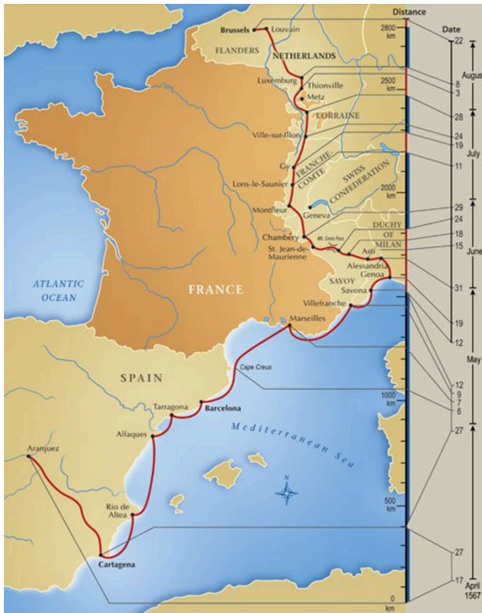
Figure 7: Route taken by Alba and his forces in 1567. 8

The events of 1566 and 1567 marked a new phase in the European religious conflict. For the first time, tensions in France, the Low Countries, and Germany were explicitly linked. Besides underlining the transnationality of the conflict, the events of 1566 and 1567 created a new intellectual and emotional climate. As a result of the escalation of the confessional conflict in the Netherlands and the aggressive Spanish reaction, distrust and hostility in France turned into panic. Conspiracy theories that before 1566 had been confined to the