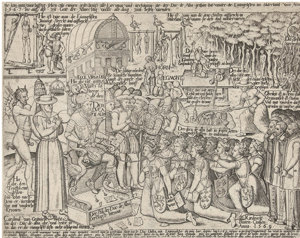
Figure 8, "The throne of the Duke of Alba". 58

Occasionally, descriptions of Catholic violence were packaged in Biblical or even providential language. In one anonymous pamphlet, the pope is said to have designed the Conspiracy so 'that he can once again erect his Pharaonic Roman chair in the Temple of God, so that sitting there he may reign and tyrannise ...' 59 The Catholic leadership is often likened to the archetypal tyrants from the Old Testament, such as the Kings of Babylon or the Egyptian Pharaohs, who subjugated God's chosen people. This identification of Protestants with the people of Israel was not new, but was perfectly suited for capturing the threat of the Conspiracy in an instantly recognisable and easily understandable image. In one pamphlet, the Conspiracy is explained as a direct consequence of sinfulness of Europe's Protestants: 'If we remain