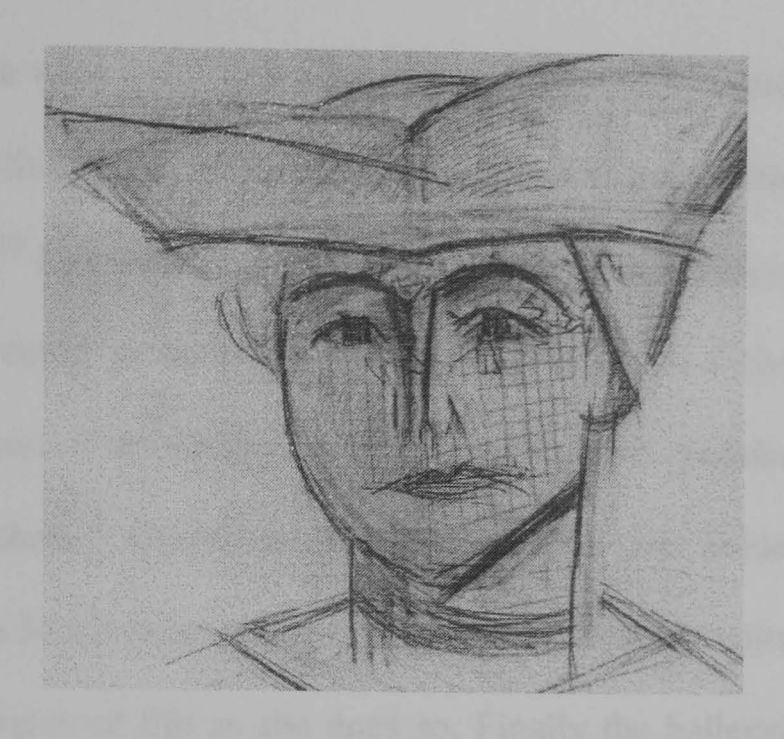
Fig 10 Madame Matisse 1915

The 'misaligned eyes' that are replicated in 'Drawing Ballerinas' are all that remains of the woman's face, almost as if she is devoid of an identity. The body becomes an horrific visual representation of sectarian violence through the grotesque robotic image of the head as a modern day sculpture. What was once a live woman's body is now viewed as sheer matter, that which is devoid of all human emotion. McGuckian presents an image of the death and destruction that lies behind a superficial image of a ballerina. As the body is stripped of its beauty, a grotesque image of a body destroyed by war replaces the ballerina's sensual delicacy. The body 'obligingly' offers itself as a willing victim to fulfil the political intentions of this piece of art. The body articulates the atrocities of political violence through its the grotesqueness. After exposing the truth the body collapses under the 'burden' of its own weight: