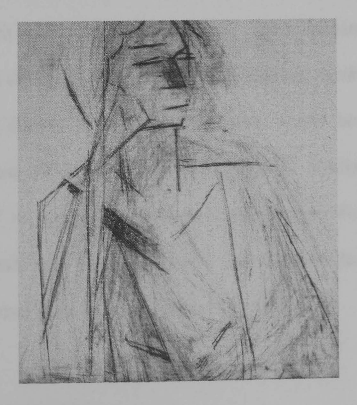
Fig 7 Eva Mudocci 1915

Discussing Eva Mudocci (1915) and Greta Prozor (1915-16), Elderfield comments that, 'These drawings have literally been reconstructed from destroyed matter. And they freeze into their temporally perceived wholes the turn of a head, the movement of a body settling under its own weight .' (See Figs 7 & 8 below)