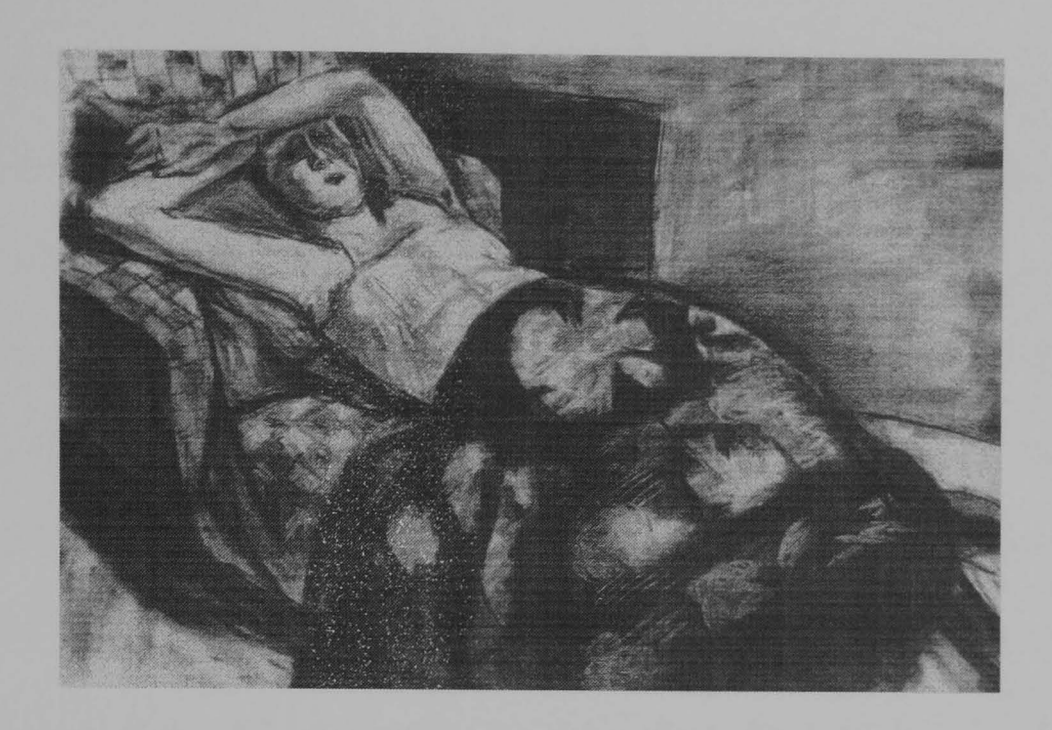
Fig 9 Reclining Model With Flowered Robe c. 1923-24

When all these snippets from Elderfield fuse together in the poetic form, McGuckian creates her own abstract portrait by piecing together different parts of bodies from various Matisse drawings. A new life is being created to replace the one that was lost. Thus, employing the same artistic technique as on the canvas / page when dislocating bodies, but rebuilding them whole: