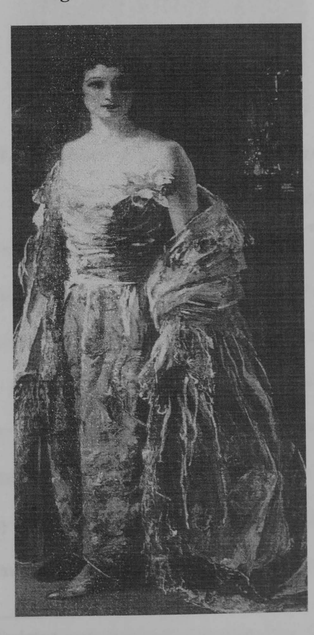
Fig 4 The Green Coat 1925

experiments with multiple meanings of beauty through the figure of Lady Lavery, the epitome of Irish beauty. The poem, 'Hazel Lavery, The Green Coat, 1926' (DB, pp.34-35), is a prime example of McGuckian's questioning national ideals of Irish beauty as part of her feminist aesthetic. This painting, which was originally titled 'Lady Lavery', was shown at the Royal Academy in 1925 (See Fig 4 below). Hazel Lavery was the wife and muse of Sir John Lavery, who was an Irish nationalist. He played an important, though unauthorised, part in the London negotiations over the 1921 Anglo-Irish Treaty, leading to the establishment of the Irish Free State.<sup>58</sup>