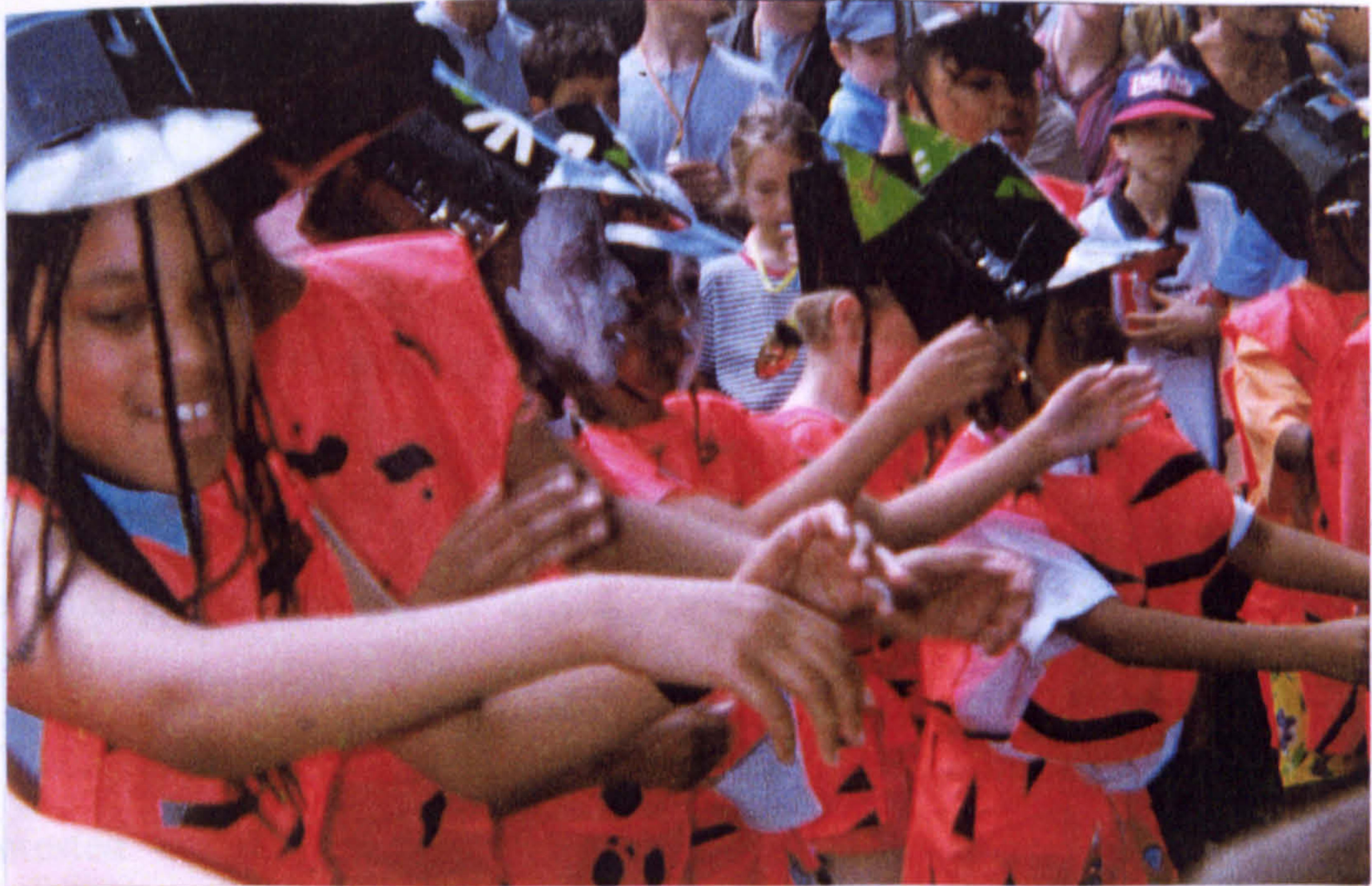
Figure 4.3: St. Barnabus School Urban Jungle Freedom Fighters watched here by an unusually unmixed section of the crowd, St. Paul's Carnival 1997.

and emphases of the context in which it is evoked, alternative collective memories are reconfigured through place, destabilizing notions of a coherent, stable and essential identity as part of the fluid and dialectical interplay which occurs between multiple diasporas and outside diaspora concepts altogether.