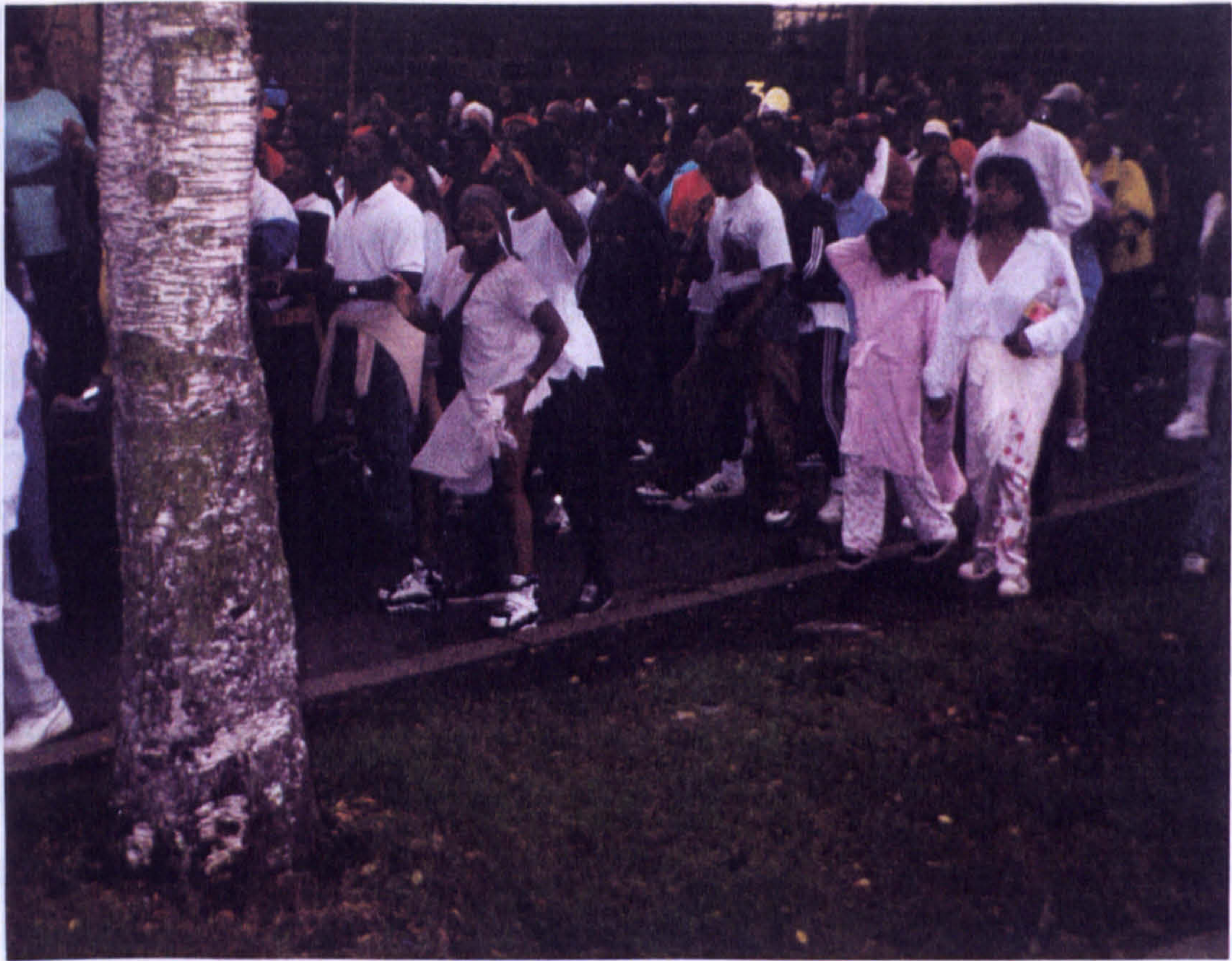
Figure 3.10: A pyjama wine on Harehills Avenue, J'ouvert Morning 1997, Chapeltown.