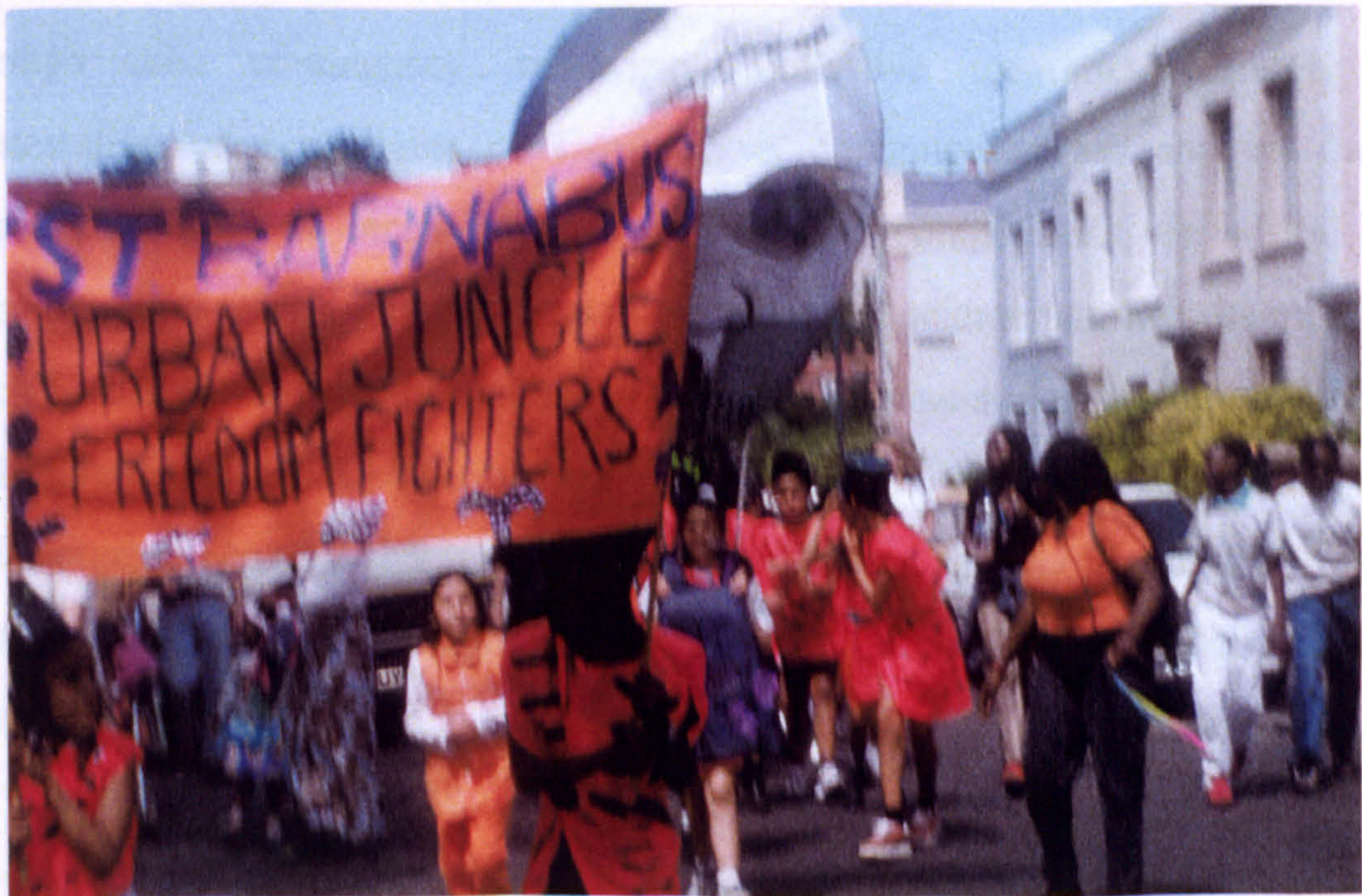
Figure 4.4: The Urban Jungle Freedom Fighters proclaim their interpretation of the 1997 Carnival theme.