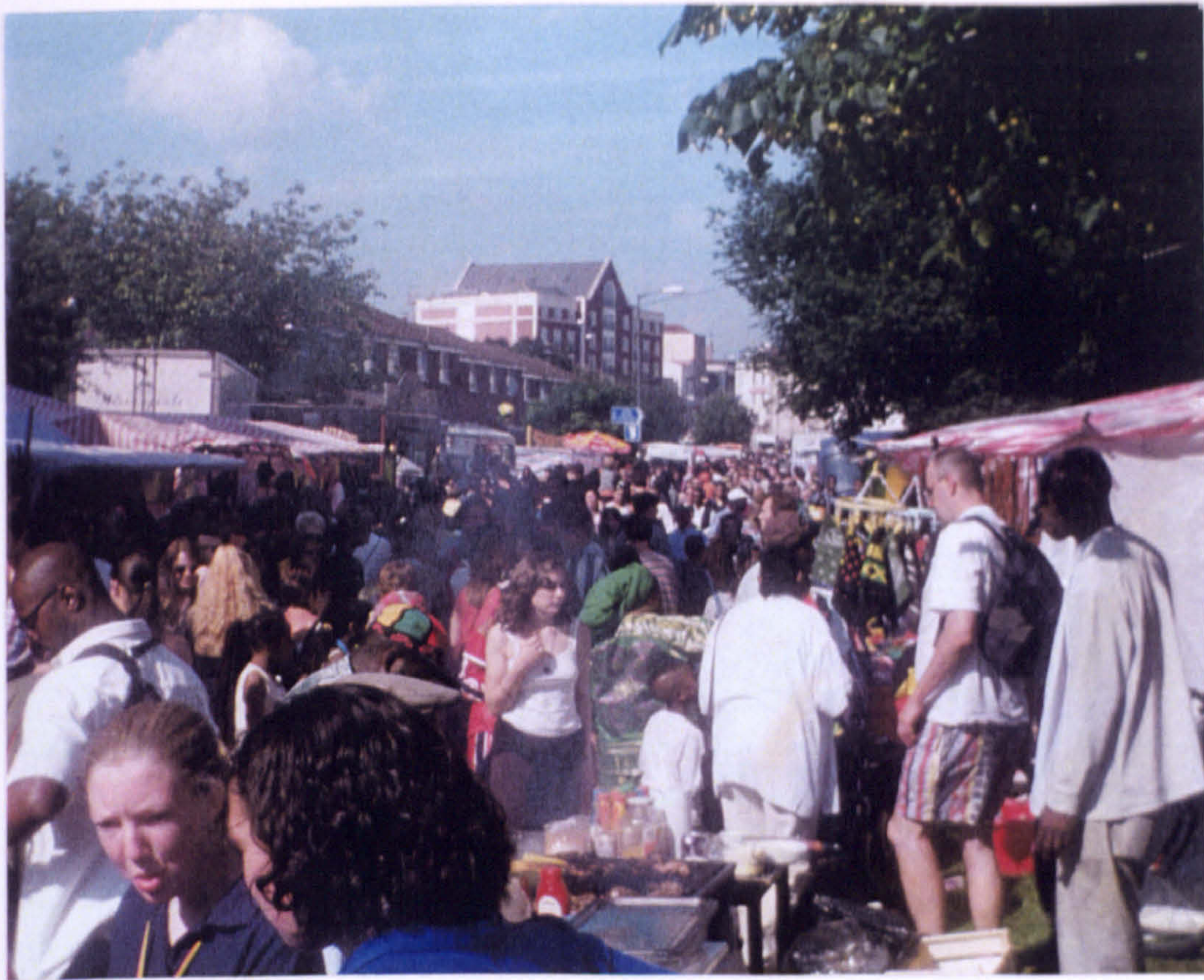
Figure 6.1: Grosvenor Road on Carnival Day 1997: a landscape of 'exotic' food...for whom?