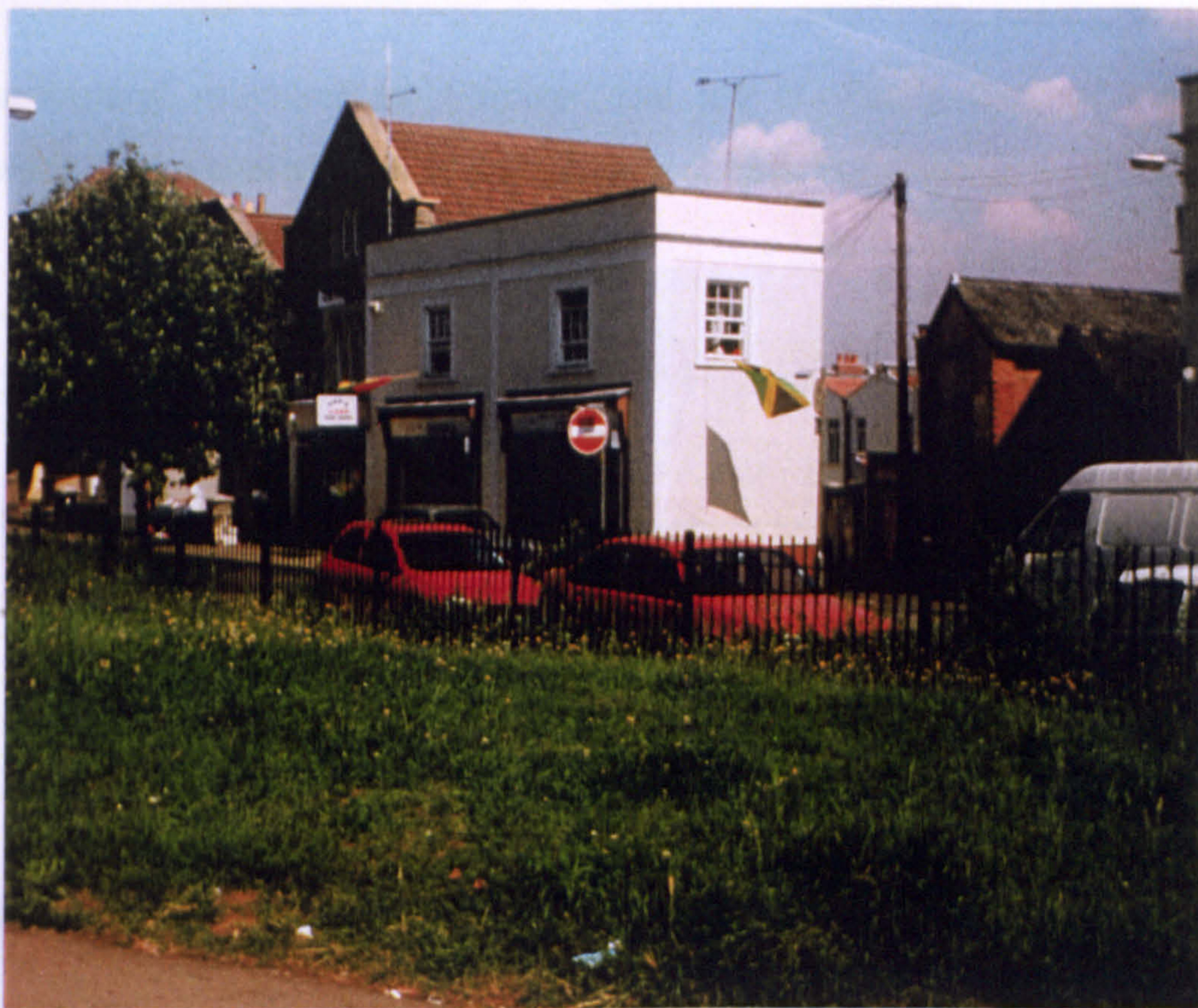
Figure 3.4: The flags of Jamaica and Ethiopia flutter over Grosvenor Road, St. Paul's, July 1997.

of St. Paul's (see Figure 3.3 ) stretch from the north-east corner of Bristol city-centre, along the edge of the busy and commercial A38 or 'Stokes Croft' to the west, across the tree-lined Ashley Road to the north, and back along the enforced division of the M32 and Newfoundland Road/A4032 to the east. They encircle wide Regency and Georgian terraces with their pastel-coloured facades (see Figures 3.5 and 3.6 ), some closely packed Victorian terraces, clusters of local authority maisonettes, a small park, several shops and pubs. It is a very small 'place', a mere 'pin prick' in the 'inner city' (Bristol Interview 20 - Charles). And yet, there is no place so famous, so semantically charged, in the whole of Bristol. This impression of otherness cannot be excluded from the varying definitions of 'place' from within St. Paul's. But that is just part of the story: senses of place in St. Paul's are (re)constructed through the productive tensions of its 'multiculture' (see Back 1996), through cultural interchange and separation, political unity and discord, through a provisional, trans-local and recognizably local re-definition of itself. It is these social relations that provide a frame, a background, the