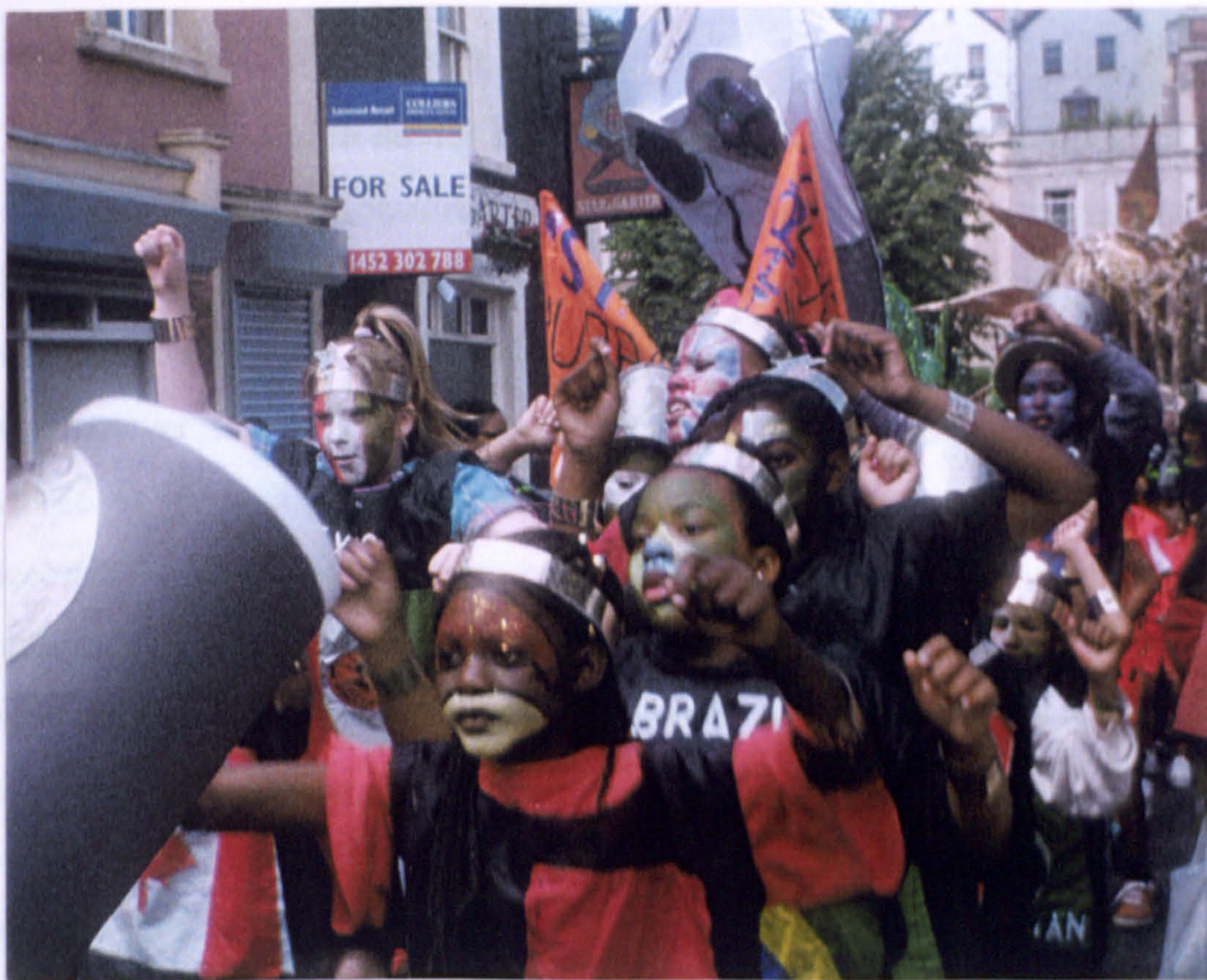
Figure 7.1: Black and White jump-up together in St. Paul's, July 1997.