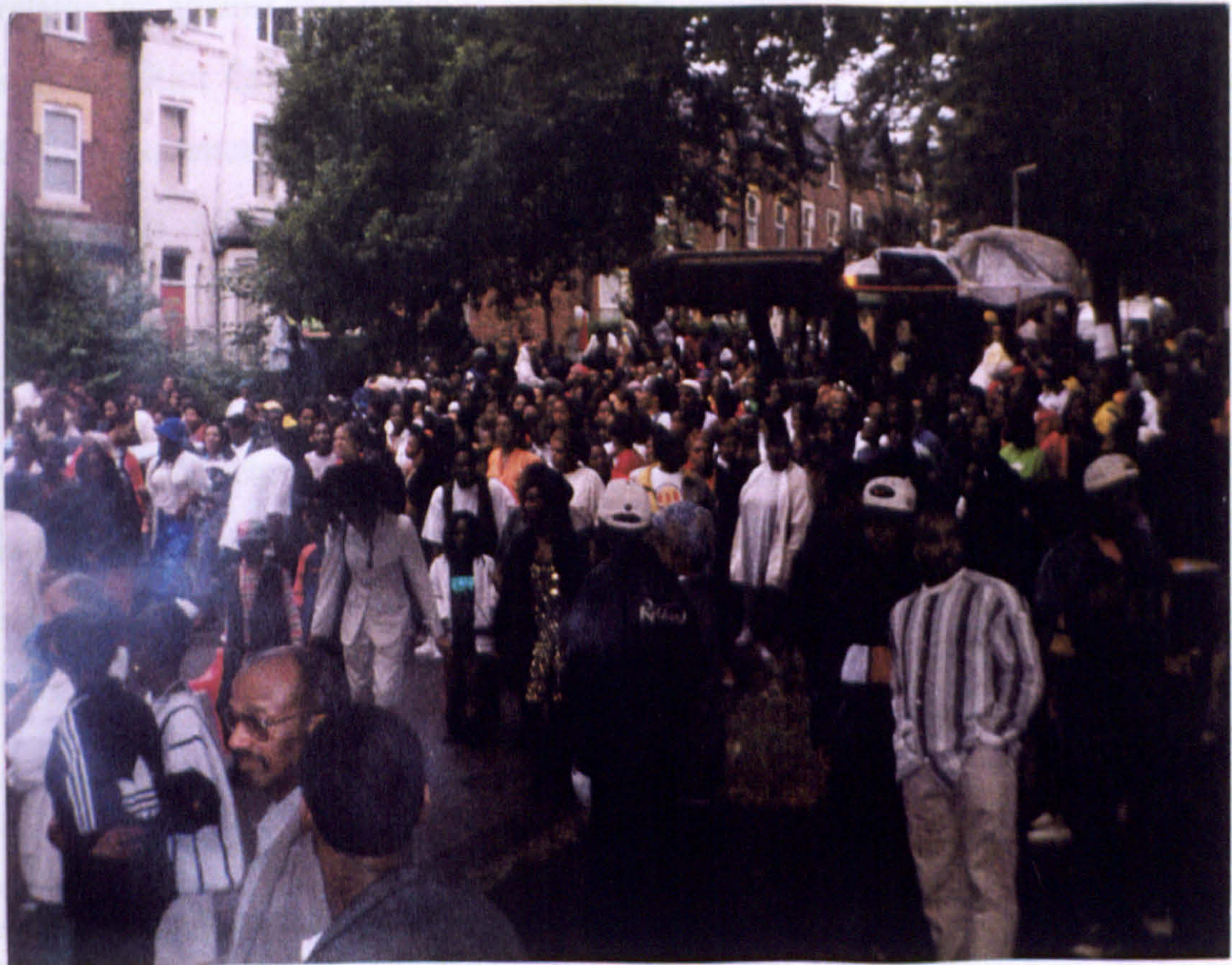
Figure 5.4: A mas by other means?