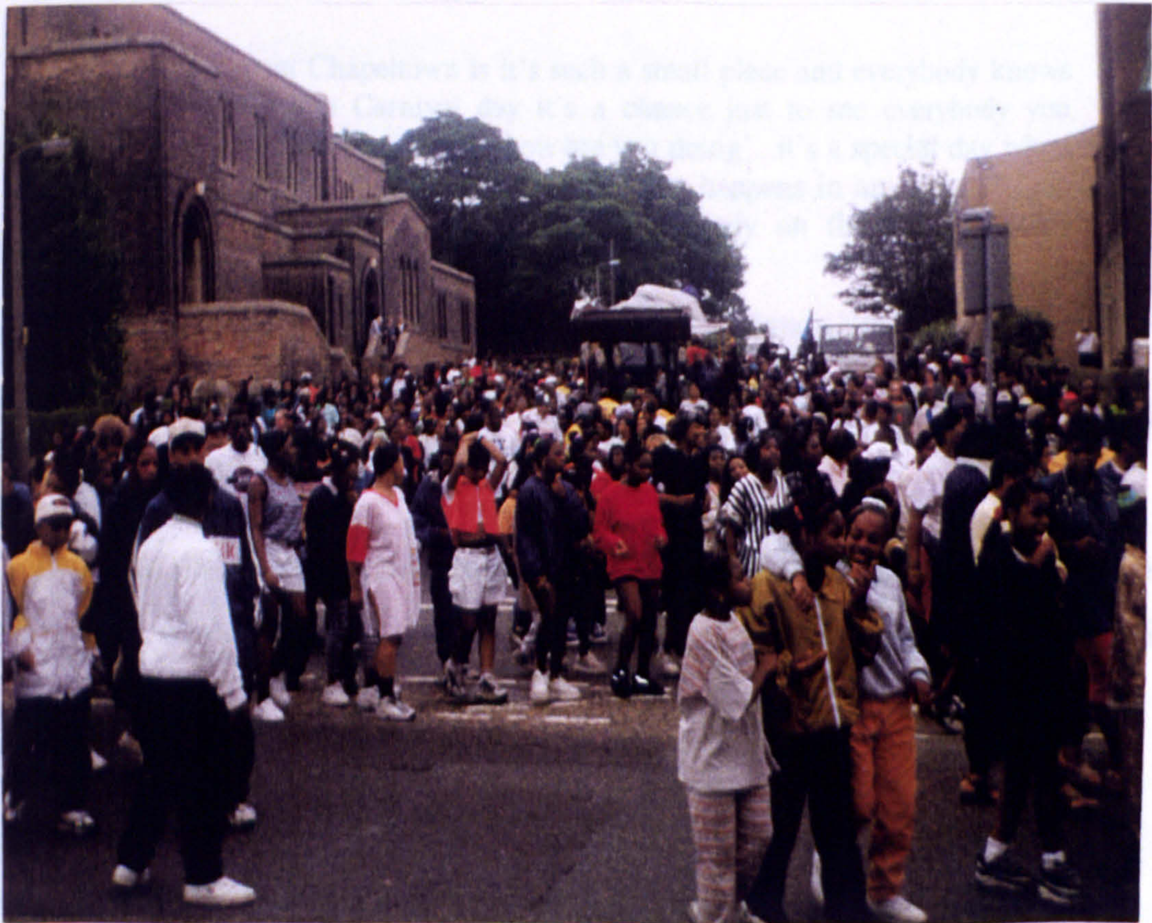
Figure 3.11: The J'ouvert mas rolls down the hill, J'ouvert Morning 1997, Chapeltown.