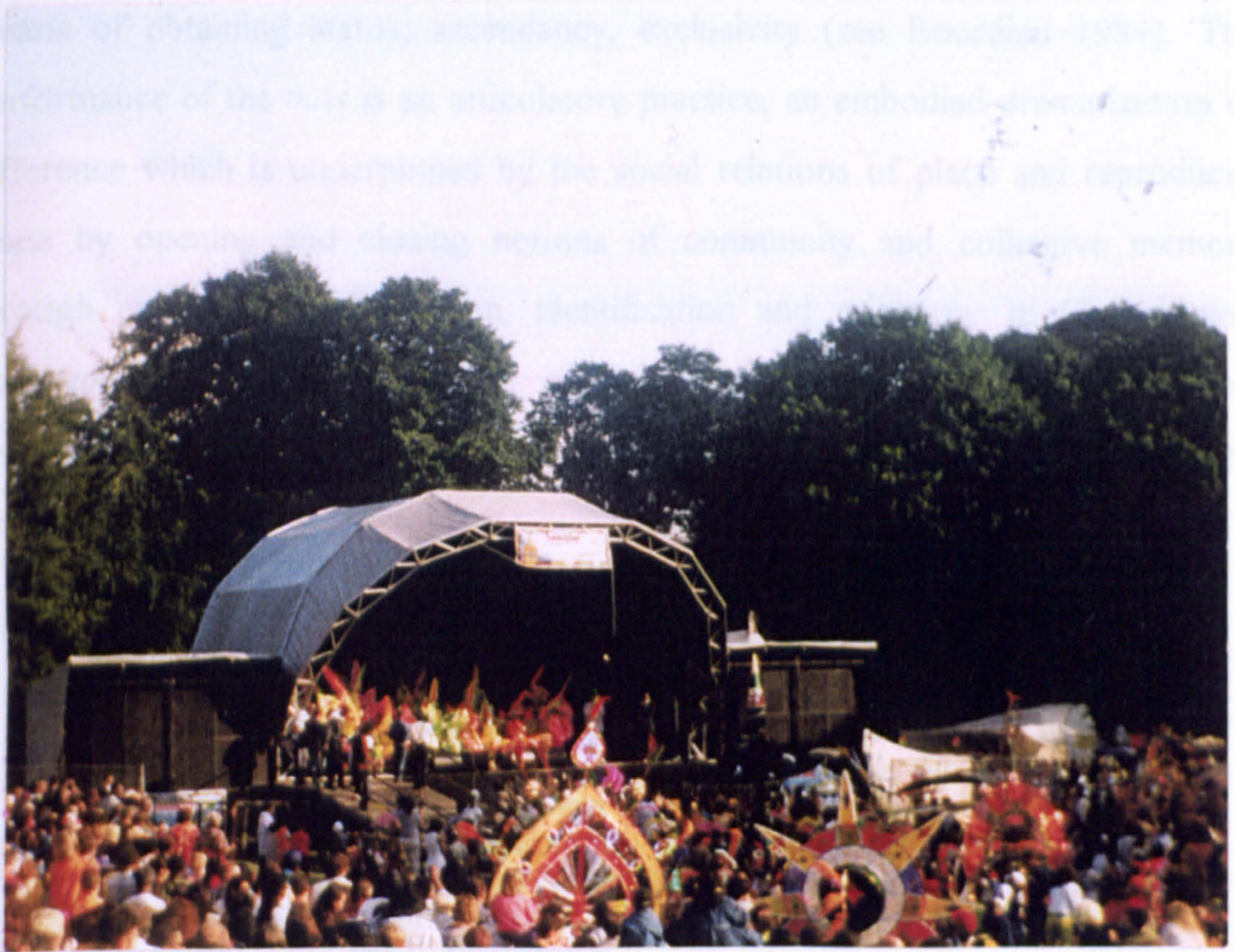
Figure 5.1: Complementing each other? The 1997 Chapeltown Carnival in Potternewton Park.