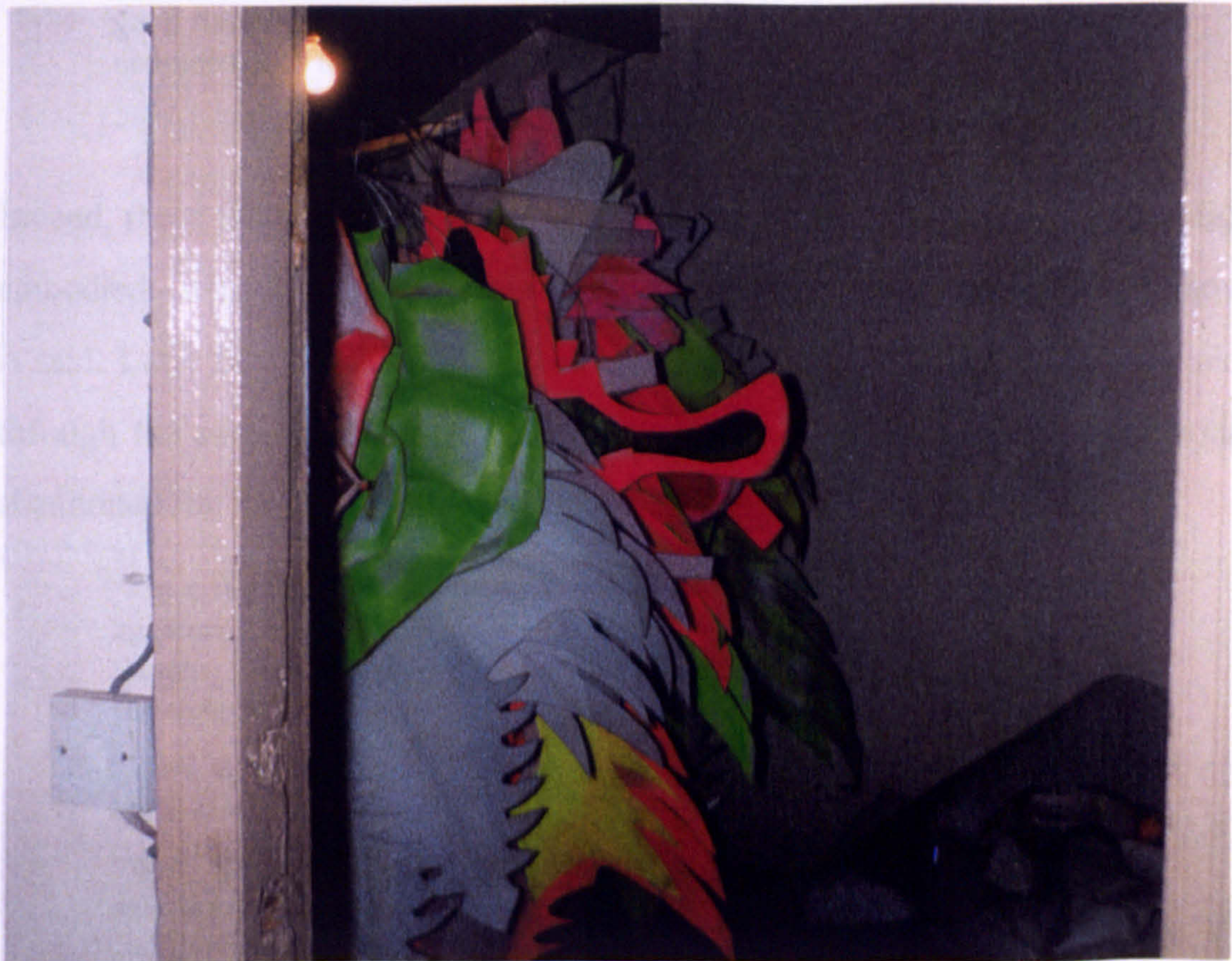
Figure 3.9: Magical Fantasies hanging out to dry, The Palace, Chapeltown, August 1997.