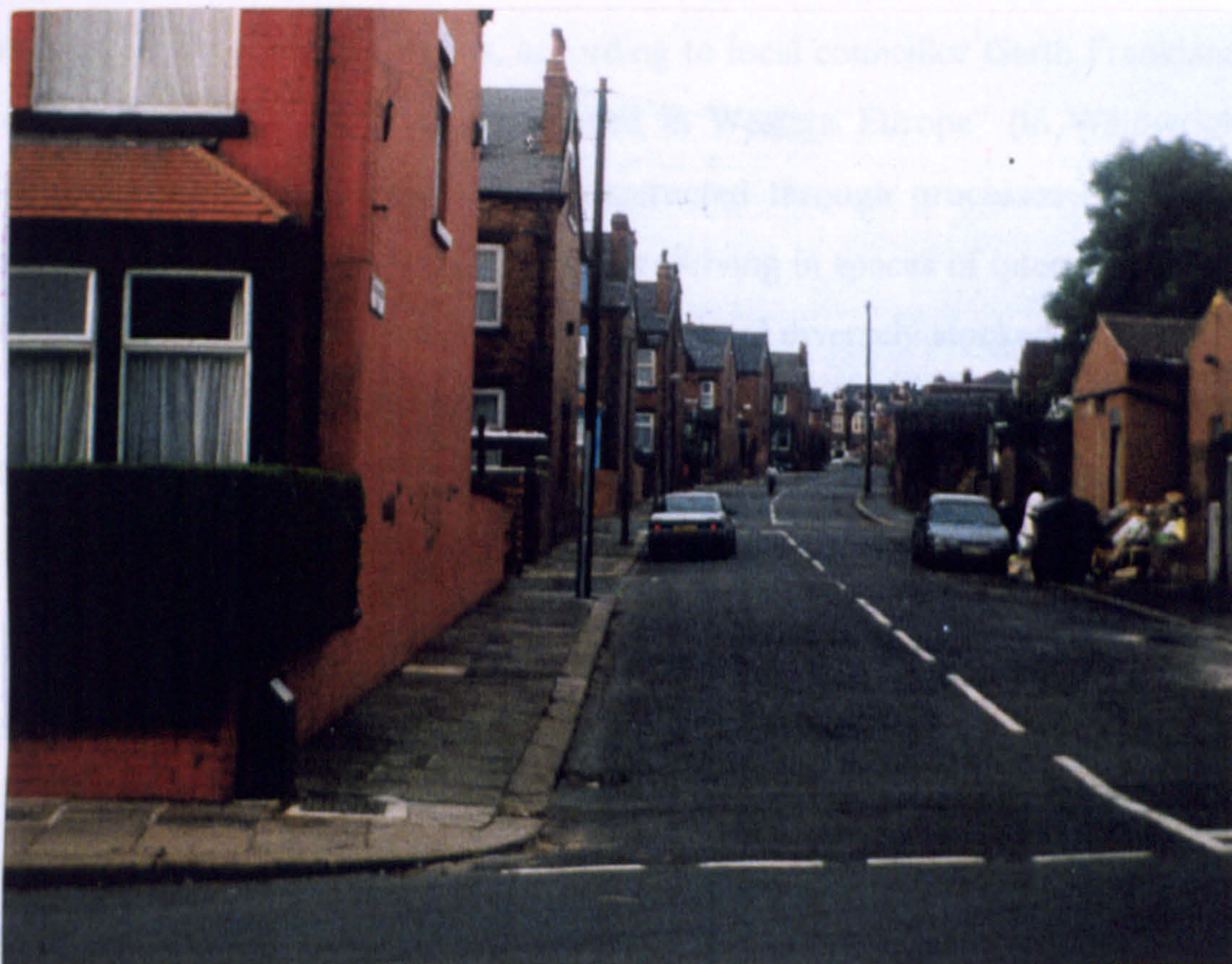
Figure 3.2: Terrace after terrace off Mexborough Avenue, Chapelton, March 1997.

Chapelton is Chapelton Road - the 'heart' of the area - climbing gently from the city to the suburbs of the north, lined with a mixture of Victorian shopping parades (but many of the shops have gone), and large grey terraces. The built environment of Chapelton is a landscape of contradictions. It is softened by trees yet harshened by litter and dereliction; it is spacious yet cramped; handsome yet frayed; it is of 'the inner city' and yet it upsets that very notion, exposing it for what it is - a social construction.