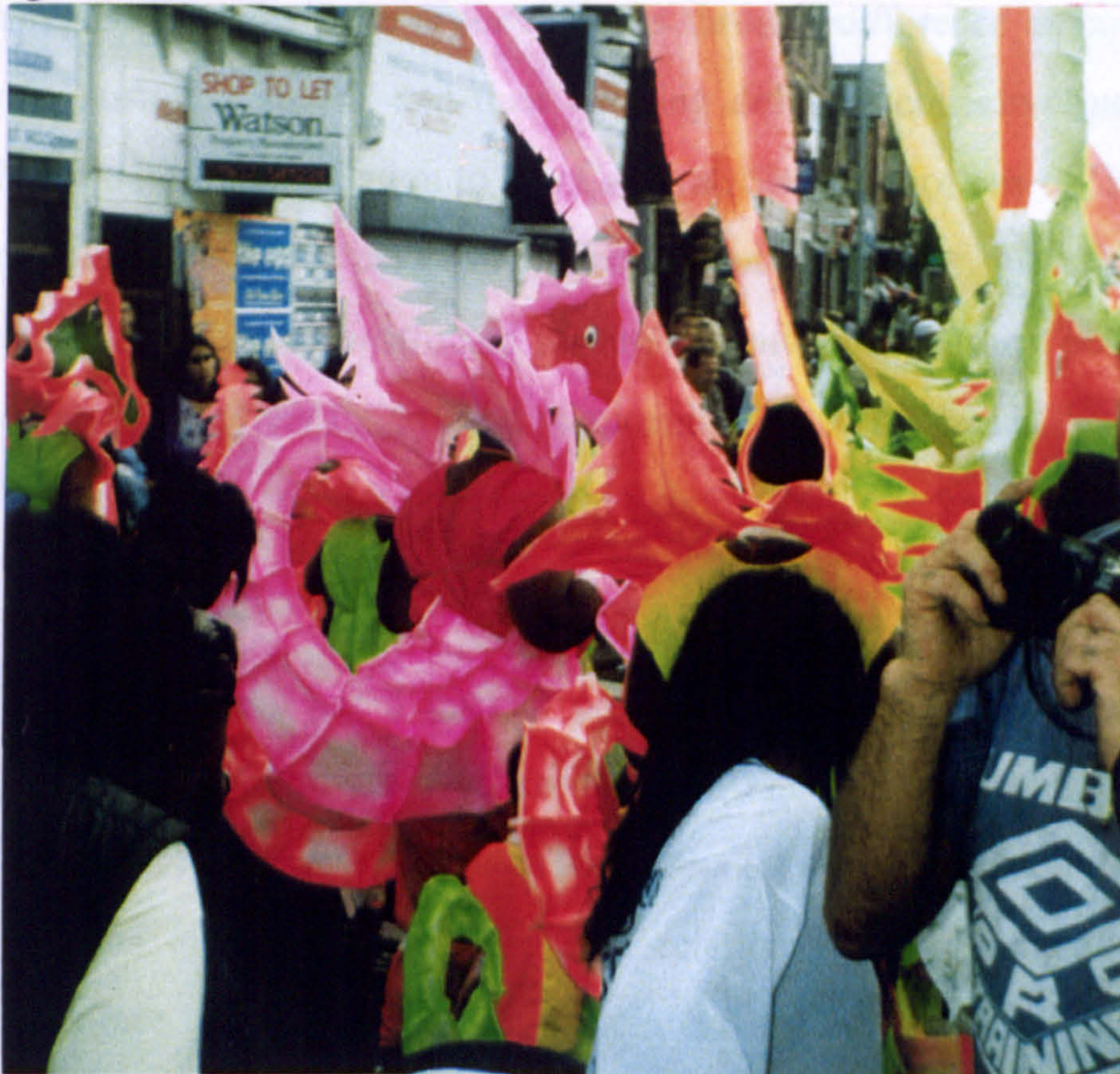
Figure 4.1: Magical Fantasies on the road in Chapeltown, August 1997.

flexibly correlative with a dancing body (see Figure 4.1 ) On the surface - as text - this costume represents - stages - the hybrid (or even mutant) fusion of different ideas from different group members: it is syncretic, a bricolage 41 of images, multiply spatialized and 'routed' to represent something new, original, reconfigured through the de-centred subjectivities of the inimitable dynamics of a 'third space' (see Bhabha 1994). Hybridity and provisionality are extended yet further through contextual contact - by the use of materials bought from 'Asian' fabric shops and through 'interracial' friendship, marriage, emulation and abjection; and contextual discourses - through the prevalence of White European histories on school syllabuses and the elision of 'positive' images of 'Blackness' in the mainstream media. These are the localized processes of 'cultural/'racial' recombination and power distribution that (re)constitute contemporary Chapeltown. The costume represents, stages , inscribes collective memories of 'Afrika', the Caribbean, Chapeltown, and it transcends them, creating something new through the distinctive localness of their intermixture.