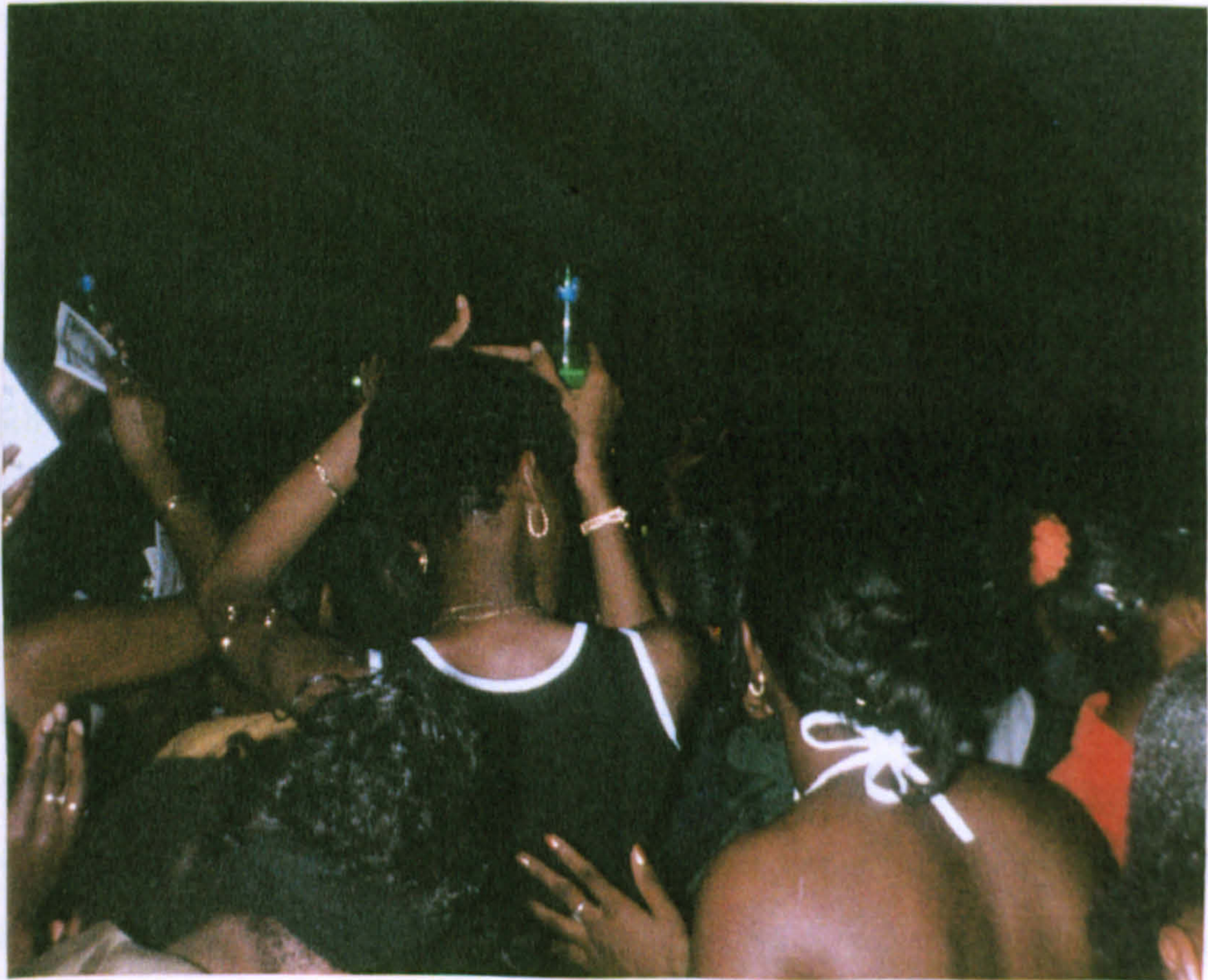
Figure 6.4: Embodying collective memories of 'Blackness'...Brighton Street at night, St. Paul's Carnival 1997.