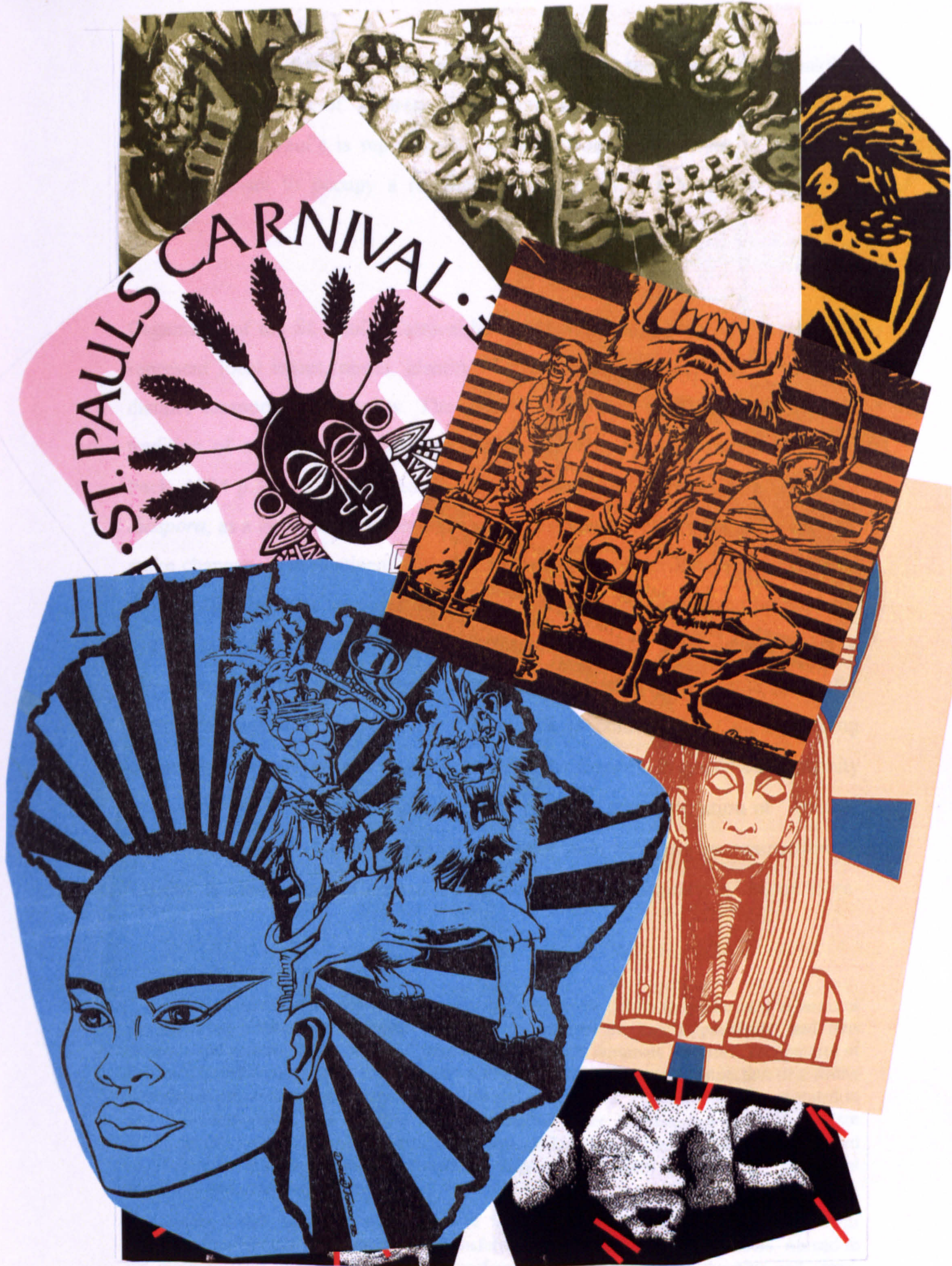
Figure 4.2: The Afrikanized iconography of St. Paul's Carnival programmes - 1987, 1988, 1993, 1994, 1995, 1996 and 1997.