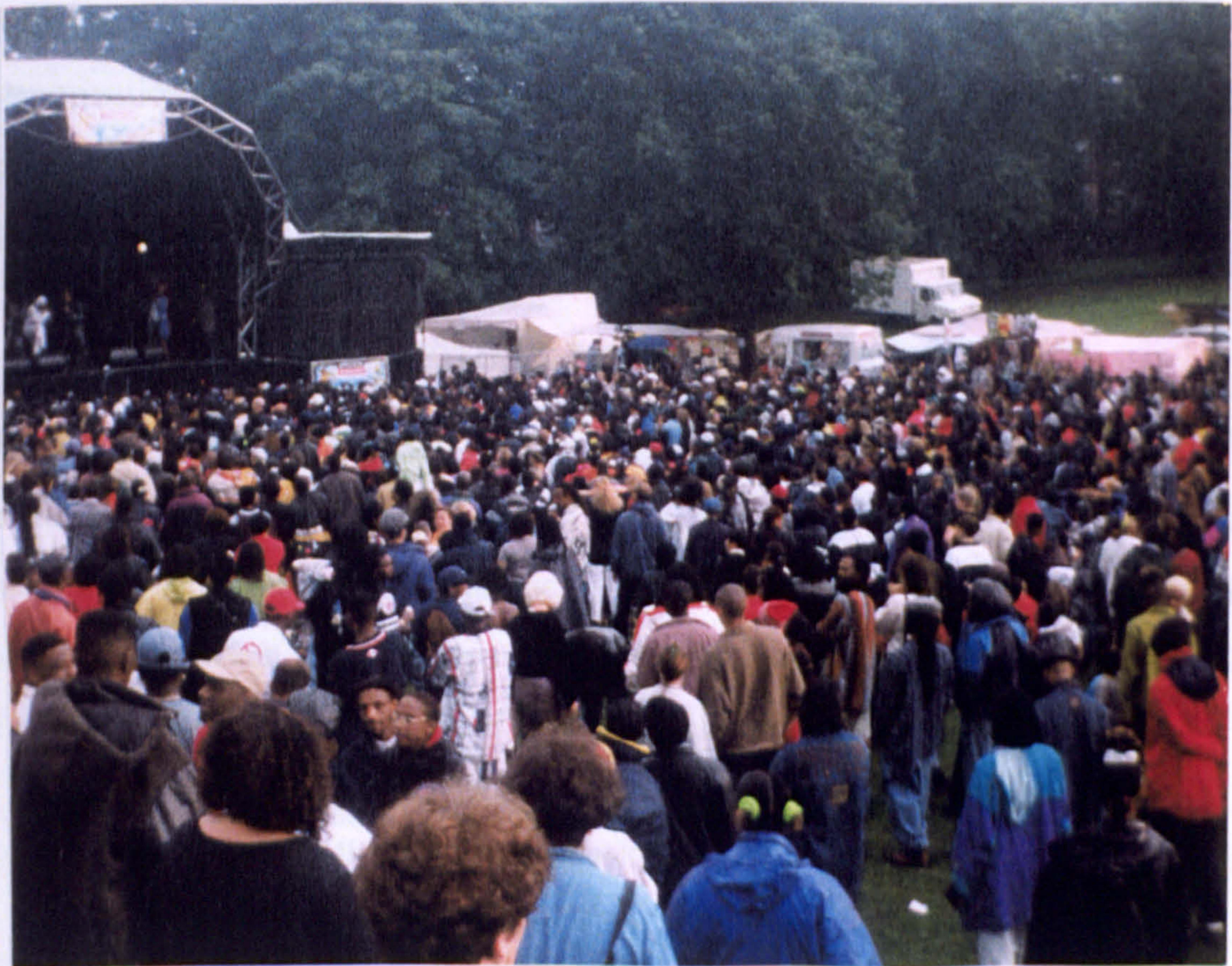
Figure 5.2: ...and the 1997 Reggae concert on the previous day.

oneself and defame others, because the performance is recognizable as a symbol of the fractured social relations of community and place.