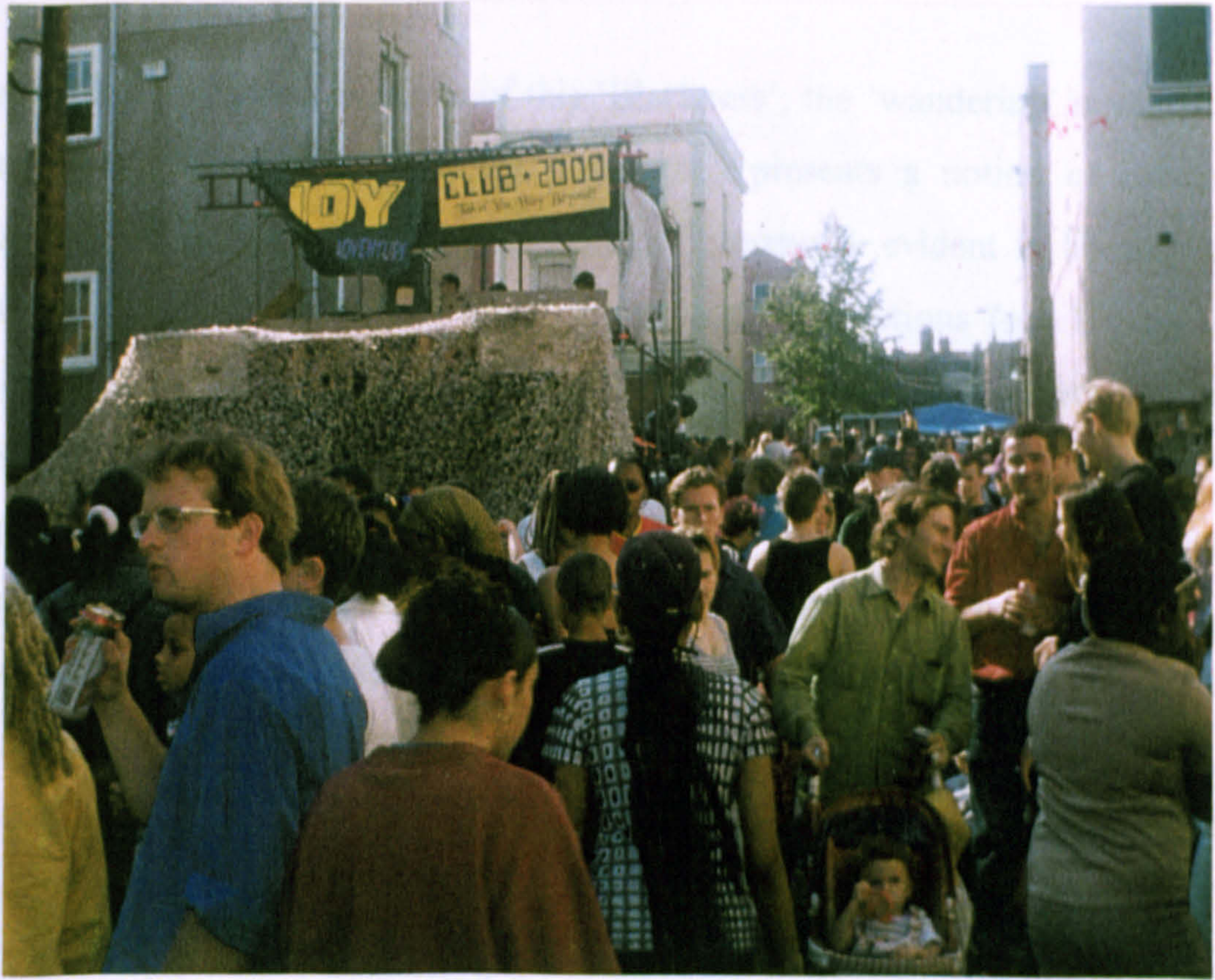
Figure 6.3: Black and White mingle under the break beats...Brighton Street in the afternoon, St. Paul's Carnival 1997.