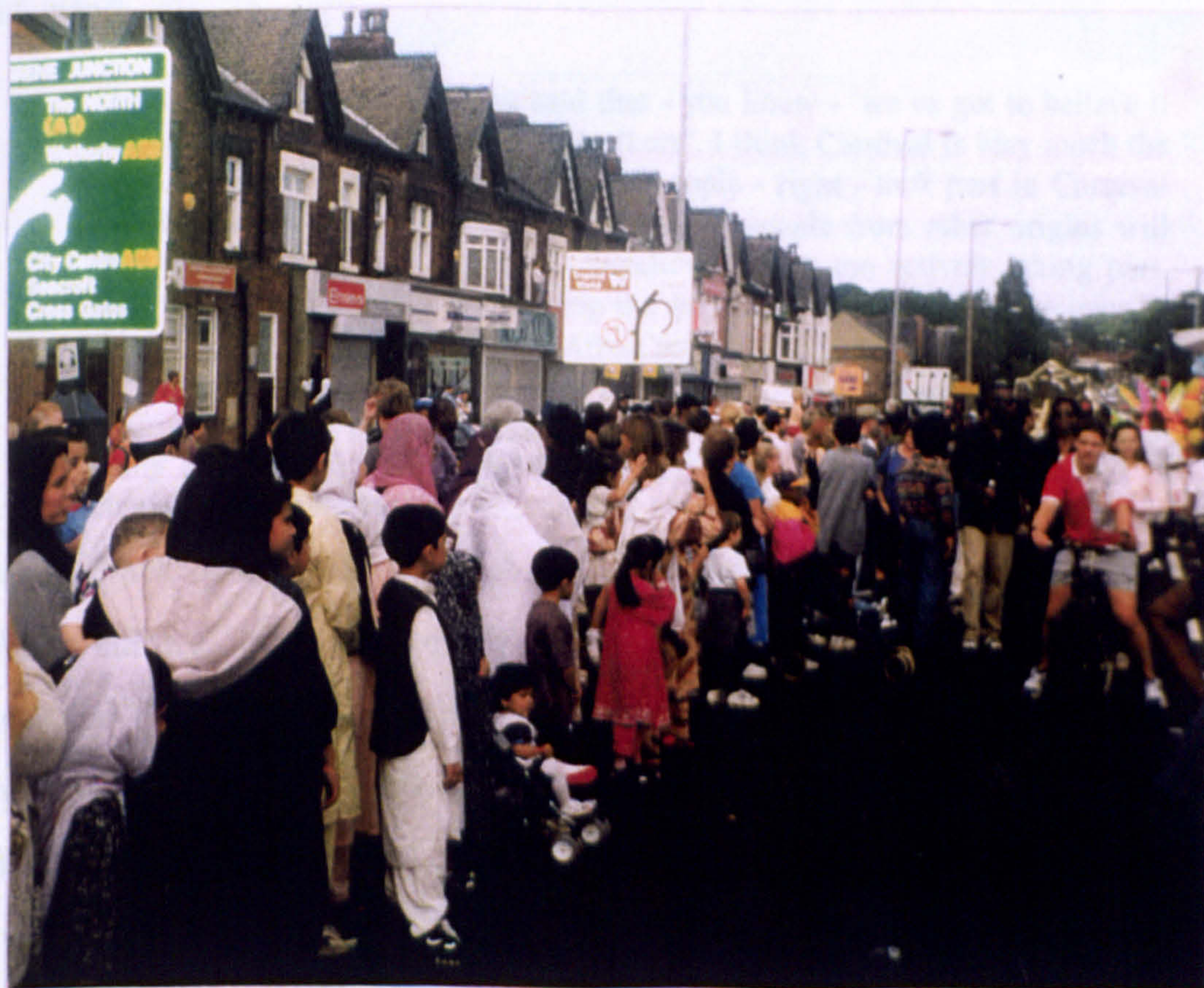
Figure 7.2: 'Mixing it' in Chapelton, August 1997.