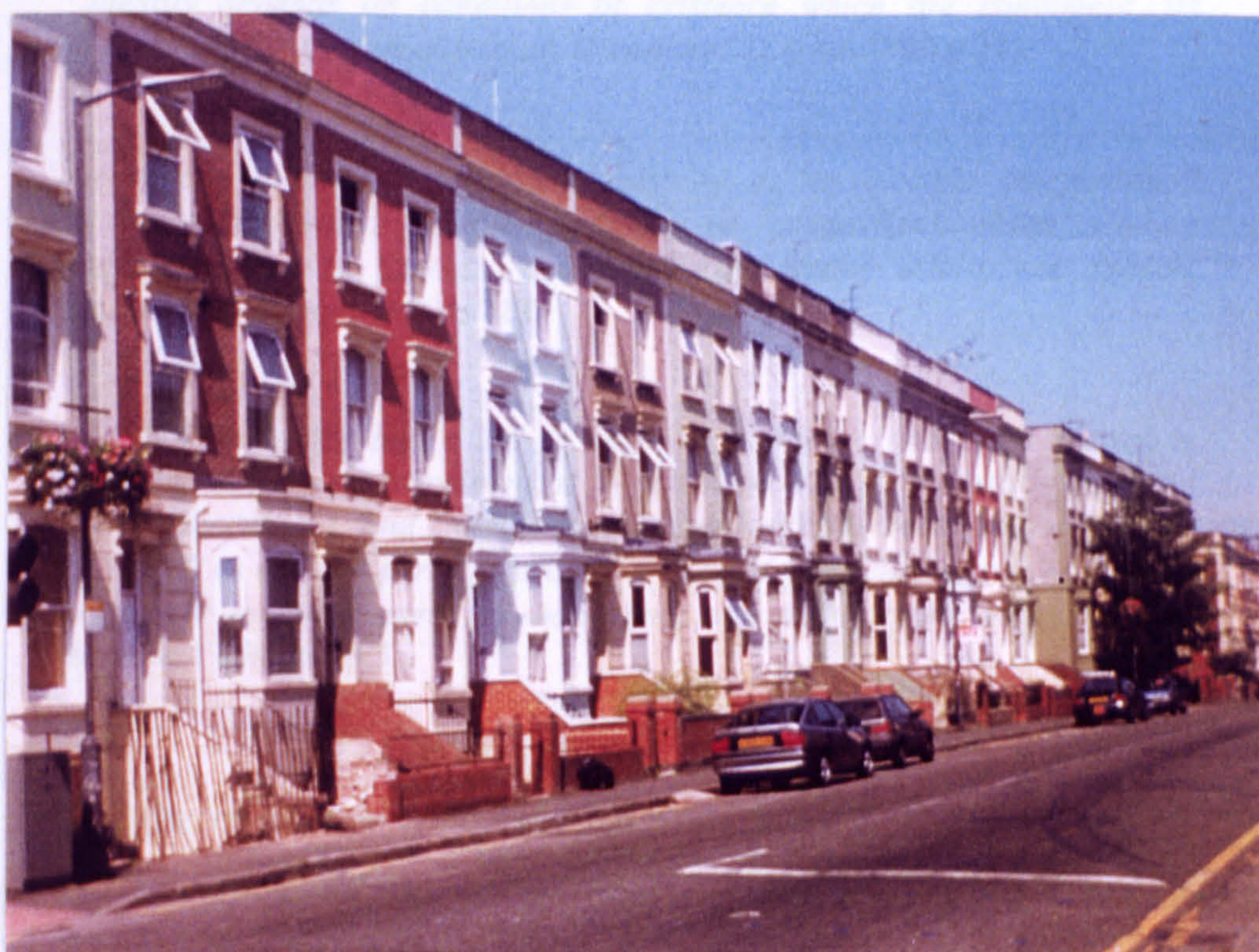
Figure 3.5: Faded glory? The grand terraces of City Road, St. Paul's, June 1997.

transforming structures for Carnival; and the St. Paul's Carnival contributes towards the re-construction of these divergent senses of place.