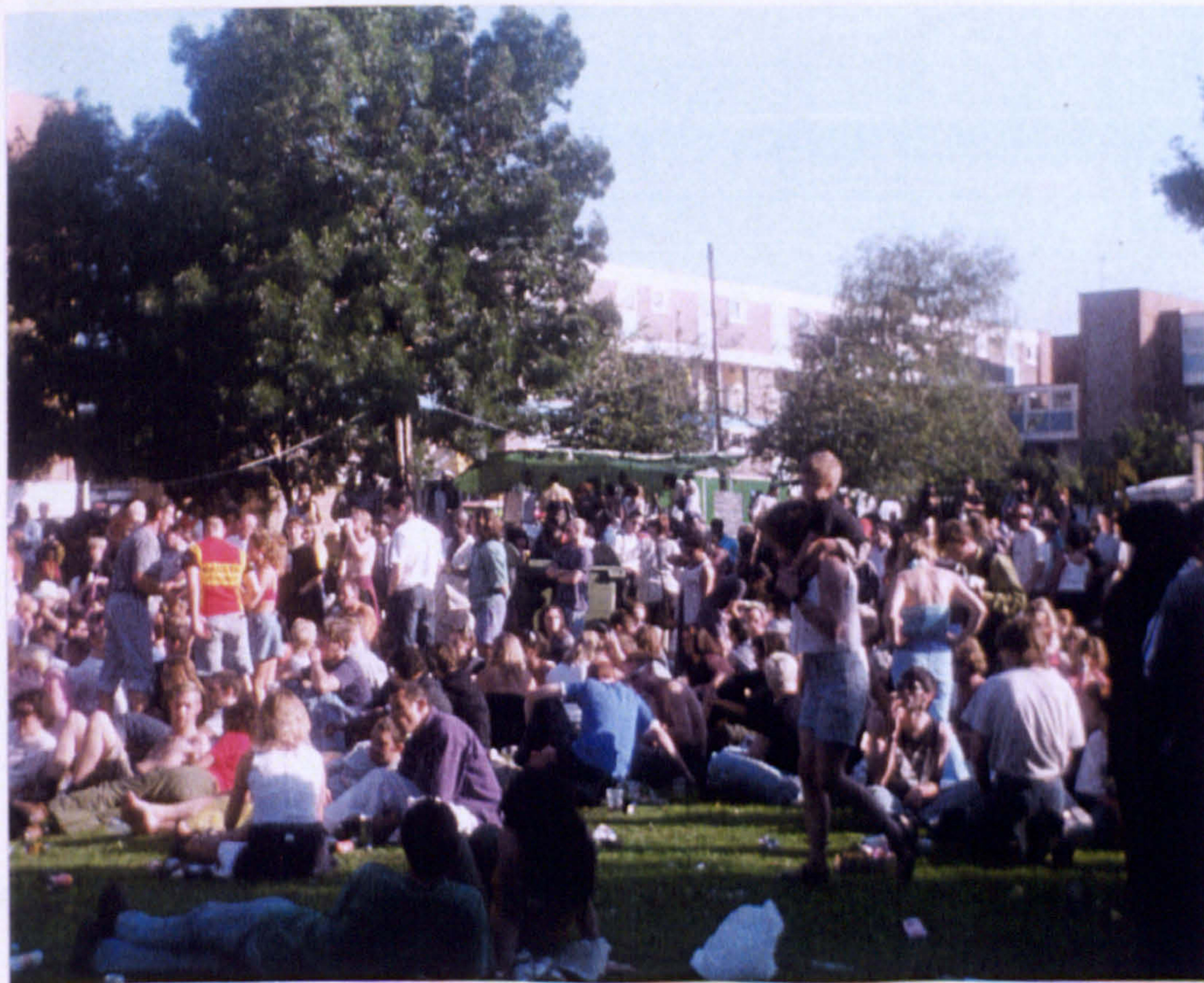
Figure 6.2: The crowd gathers at the main stage, St. Paul's Carnival 1997...a conspicuously White audience for King Masco and his 'Afrikan rhythms'.