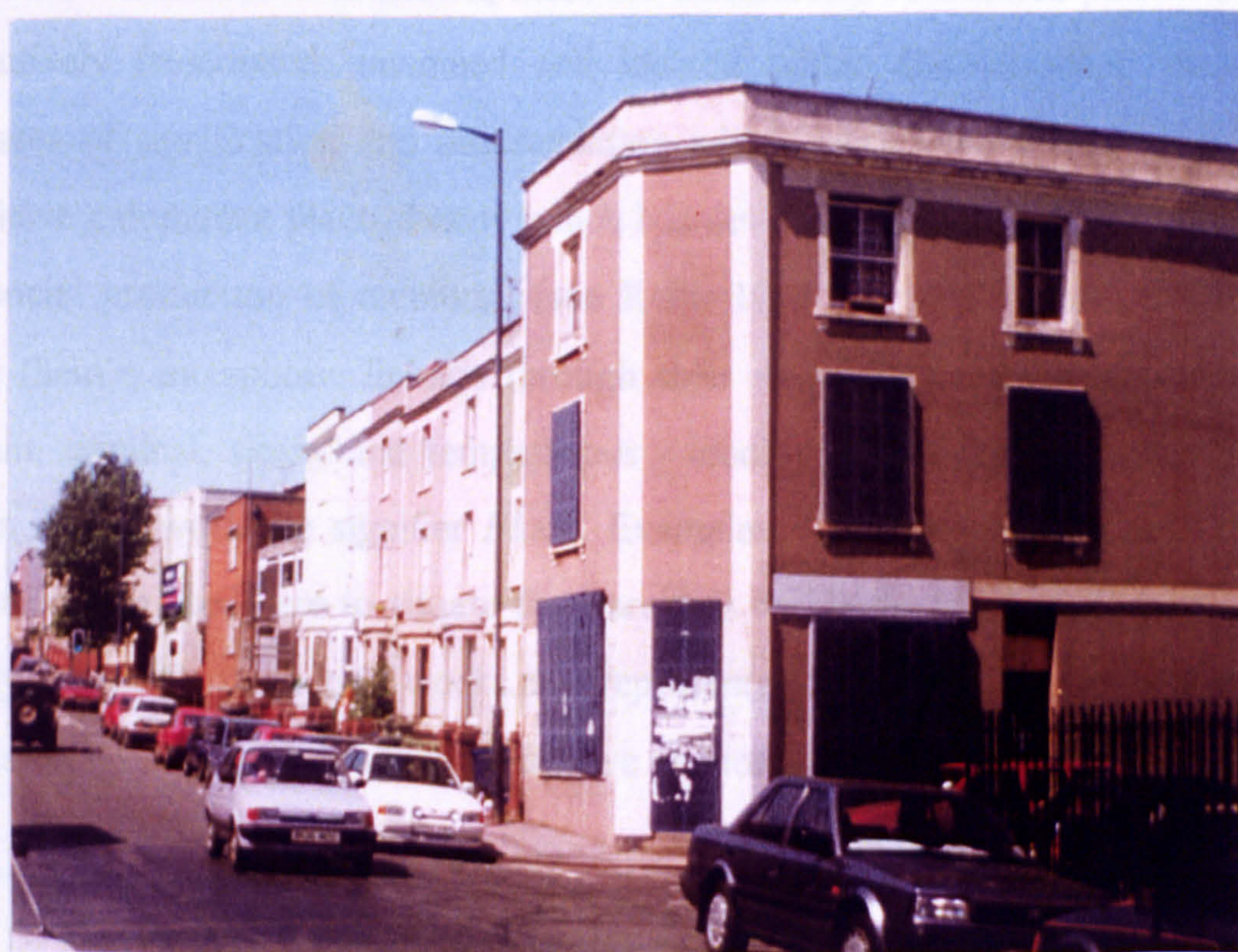
Figure 3.6: The Boarded-up 'glory' of Brigstocke Road, St. Paul's, June 1997.