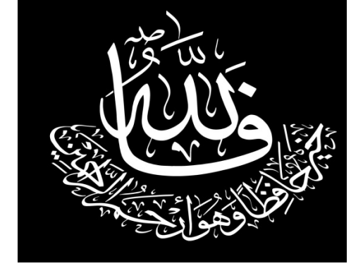
(Figure 2.1, Divine Names and Arabic Calligraphy)

Two works of Arabic Calligraphy of the same Qurānic Ayah, which speaks of two Divine Names. Translation : Allah is the Best Guardian, and He is the Most Merciful of the Merciful ( Q.12:64 ).