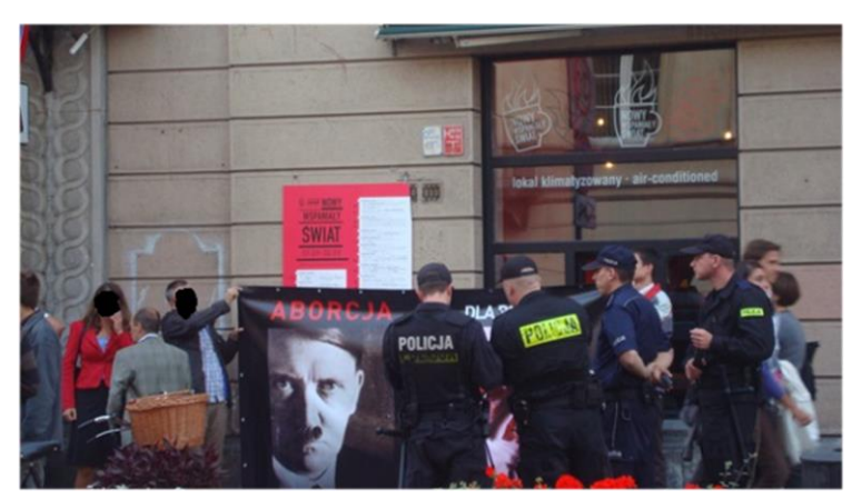
FIGURE E - 7.2 PRO-LIFE PROTEST OUTSIDE PRO-CHOICE EVENT, WARSAW