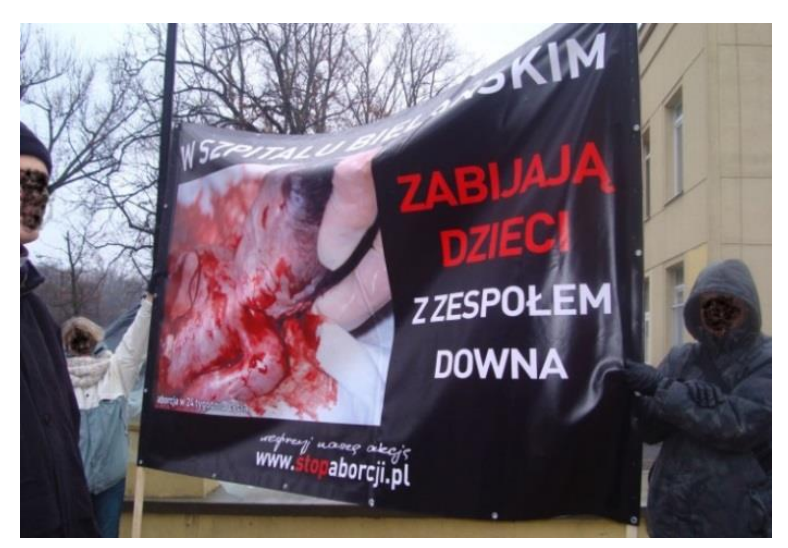
FIGURE D. 7.1 PRO-LIFE PROTEST OUTSIDE HOSPITAL, WARSAW

As I approached the hospital, I immediately saw the group that I was looking for, easily identified by the huge banner that they held up across the main pathway to the hospital. The banner pictured an image of a dead foetus covered in blood with the text 'In Hospital Bielański babies with Down's syndrome are killed'. Most passers-by were elderly women on their way to the hospital. When they were young abortion was legal. The demonstrators explained to me that typically passers-by look at the poster, sometimes stopping for a moment, and then continue without commenting or talking to the demonstrators. During my observation on only one occasion during the two hour long demonstration did someone stop and interact with the demonstrators. It was an older man who approached the demonstrators asking how often the group meets. He said he comes from another organisation (I assumed it was a religious one) and is a supporter of these kinds of actions.