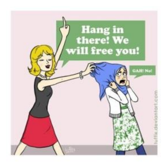
FIGURE C - 6.1 'WE WILL FREE YOU!'

Copyright: tuffix. Cartoon appeared on Facebook page of the women's group that were my participants)