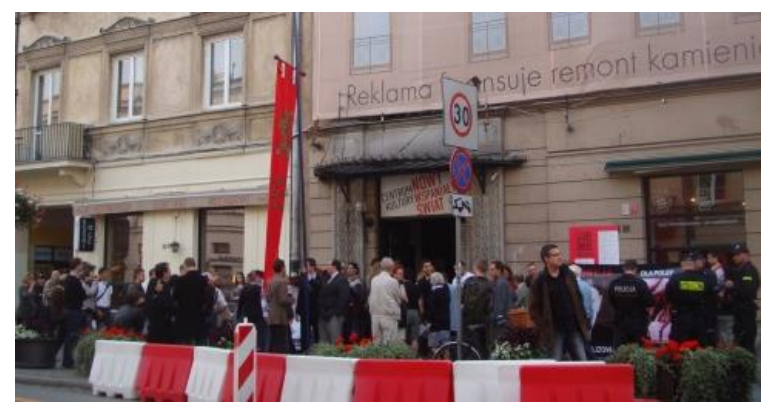
FIGURE F - 7.3 PRO-LIFE PROTEST OUTSIDE PRO-CHOICE EVENT, WARSAW

These examples show public space to be gendered and sexualised (Longhurst 1996; Bell and Valentine 1995). The scene paints an image of a group of people, mainly men, standing outside a venue where a group of people, mainly women, gathered to discuss abortion politics. With posters alluding to genocide (figure E) and flags with the words 'family' sewn into them (figure G), the male-dominated crowd (standing outside of the pro-choice venue) appeared to be guarding the morality of the women inside. Built into these spatial expressions are moral assumptions about the rightful claims to space of some groups over others (Smith 2000). Reminiscent of a