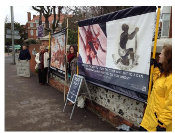
FIGURE G - 9.1 PRO-LIFE PROTEST, ANTI-SLAVERY THEME, UK