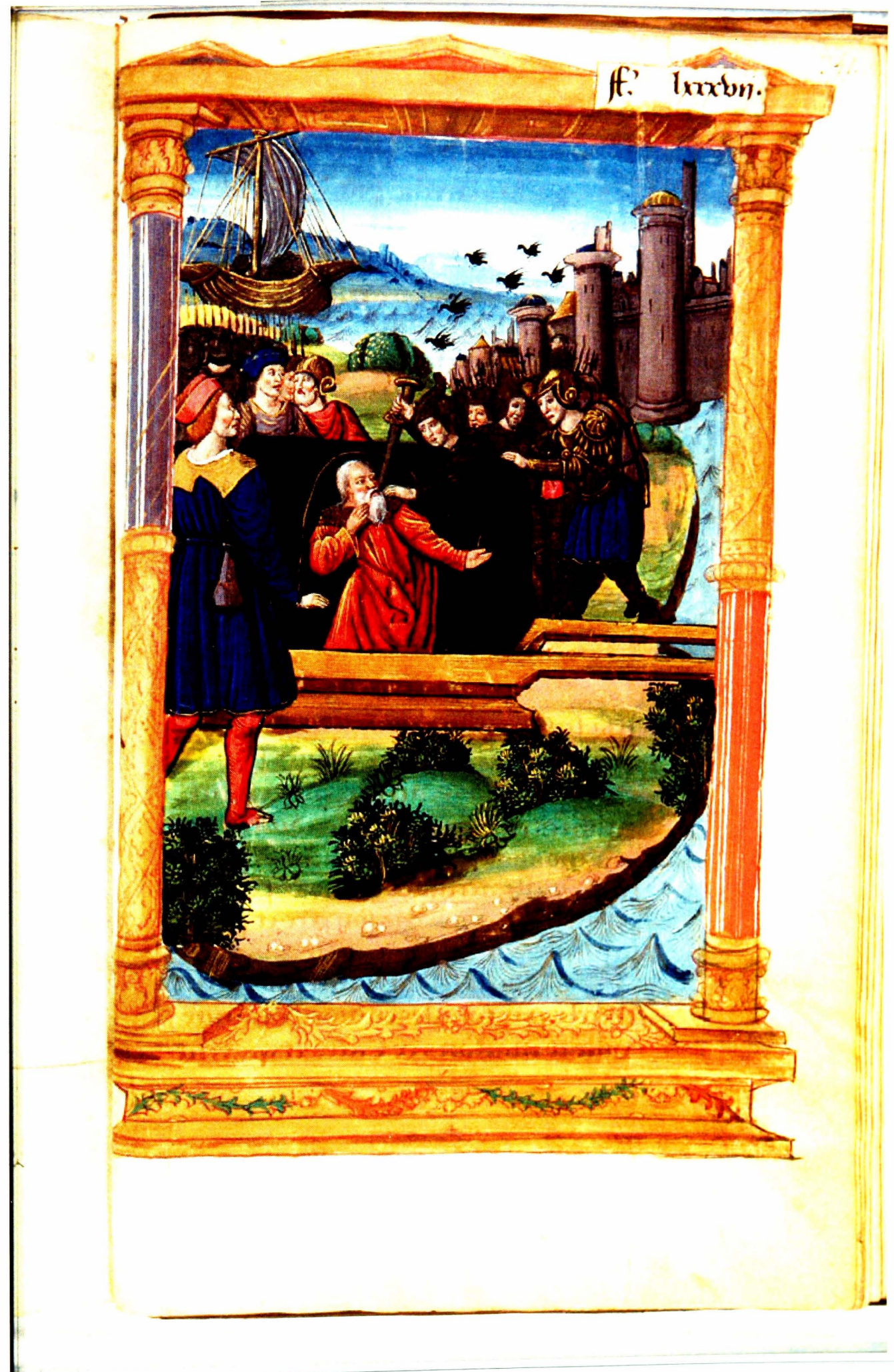
Figure I : Popillius Laenas kills Cicero from Leonardo Bruni Aretino Life of Cicero c. AD 1500 (Den Haag, KB, 134 C 19 341r)