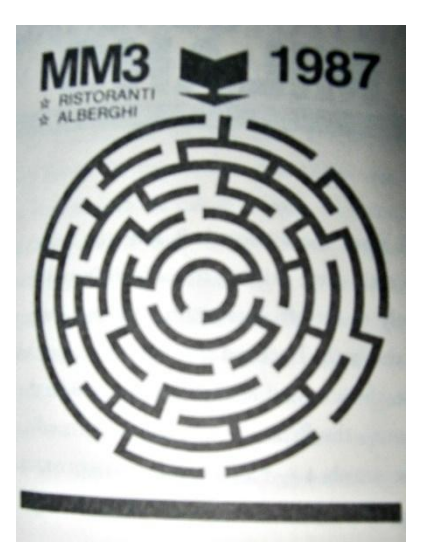
Vertigo, p. 107

An ironic commentary on the insufficiency of maps is also found in Sebald's Vertigo. The narrator finds in Milan a street map whose cover bears the image of a labyrinth, promising to be 'una guida sicura' for the traveller. 441