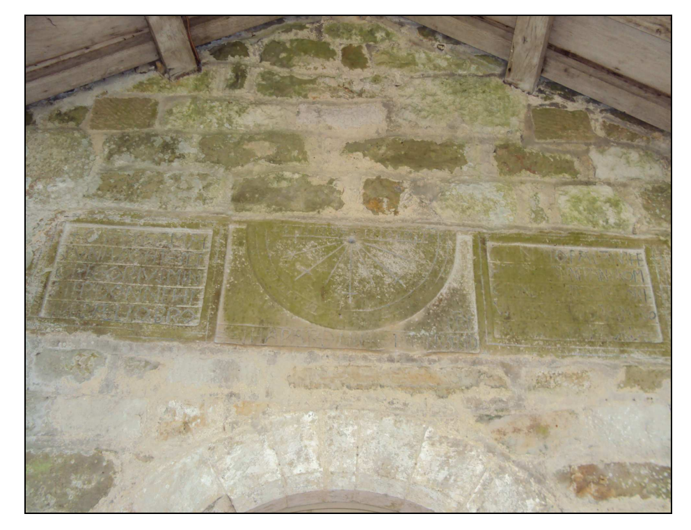
FIGURE VI.1 ORM GAMALSON'S SUNDIAL

As can be seen in the image above, the sundial has inscriptions to its left and to its right. Together they read: