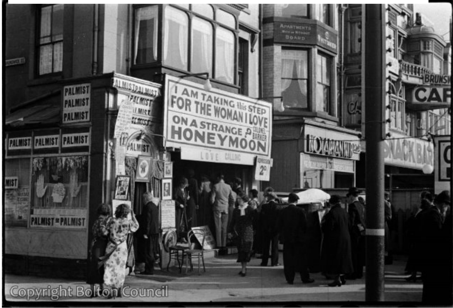
Figure 2: Visitors to Colonel Barker's 'strange honeymoon', Blackpool, from the Mass Observation 'Worktown' study (1937-40).