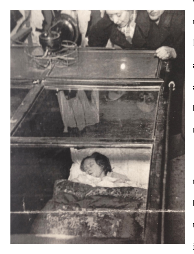
Figure 1: Photograph of the 'Starving Brides', Blackpool, The Blackpool History Centre, Cyril Critchlow Collection.

set back into the building of New Brunswick.