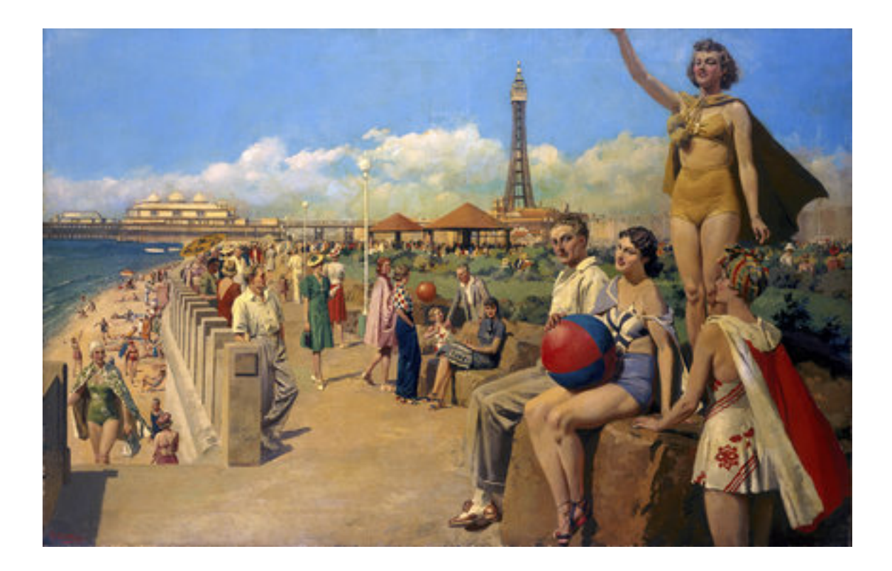
Figure 7: <u>Matania, Fortunino</u>, 'Blackpool', original oil painting for an LMS poster, c 1930s, NRM / Pictorial Collection / Science & Society Picture Library. Image Ref. 10282854

withstand condemnation whilst the titillating fan dances and tableaux vivants prevailed.