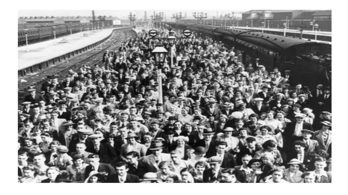
Figure 3: Reuben Saidman, 'A train load of visitors arriving at Blackpool railway station, Lancashire, 1937', Daily Herald Archive / National Science & Media Museum / Science & Society Picture Library, Image Ref 10324945.

The Lancashire mills presented Blackpool with a crowd unlike any other [Figure 3].<sup>245</sup> The textile industry provided income for most ages and both genders, as mill-work offered good wages from an early age as well as some of the highest wages for working women in the country.<sup>246</sup> This benefitted the Blackpool tourist industry as those who were married with children accumulated more income with each child who was able to start work early, and those who were single, even women, were financially stable enough to still participate in leisure activities.<sup>247</sup>