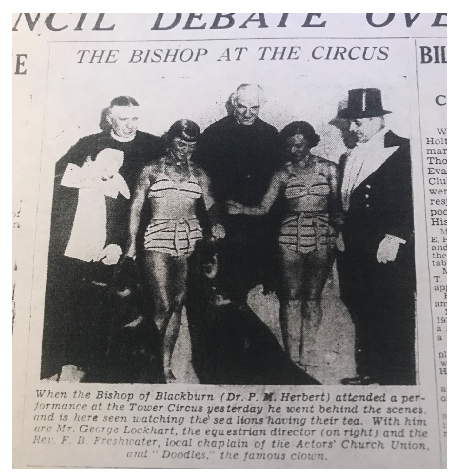
Figure 4: 'The Bishop at the Circus', West Lancshire Evening Gazette, 7 August 1935.

To elaborate on this therefore, where a general anxiety towards the working classes' new found sense of freedom caused authorities to review entertainment, this was particularly true when it came to female bodies, including the crowd and entertainers. This is because there can be distinctive freedoms or constraints when it comes to the female body as either occupying the private or the public sphere.<sup>300</sup> According to Grosz, the specificities of the female body as the site of reproduction sees the 'private' as a polarised sphere where the 'role of mother' restricts, whilst the public sphere is regarded as the only possible sphere of sexual equalisation.<sup>301</sup> Grosz's analysis can be related to the brides who, as identified in Chapter 1, created a paradoxical presentation of the female body as they asserted themselves into the