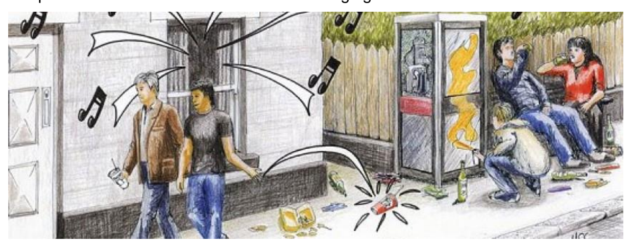
Illustration 1 This illustration from Abertay Housing Association<sup>117</sup> shows some of the forms of ASB: litter, noise nuisance, street drinking and graffiti

Thus, legislation permits civil law to control not only nuisance, but criminal behaviour. Consequently, ASB may be described as ill-defined as it blurs the boundaries<sup>112</sup> of this fundamental divide substituting rules (legislative provisions) so vague (broad) that, as the examples in policy documents<sup>113</sup> and case-law<sup>114</sup> show, almost any behaviour could break them.<sup>115</sup> Additionally, policy documents<sup>116</sup> and law reports demonstrate this point with non-exhaustive lists of wide-ranging behaviour.