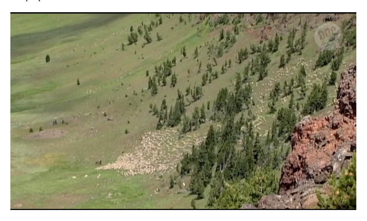
Sweetgrass (1h16) 4

avalanche, pushing the herder—who then must drive them back up the impossibly steep slope—to the edges of endurance and sanity. That neither camera nor rancher caught the sheep before they went over the mountain-side, but would only witness the aftermath of this, indicates that within the slow temporal rhythms of the mountaintop, even movement at a sheep's pace can be as uncontrollable as the fastest of swarms.