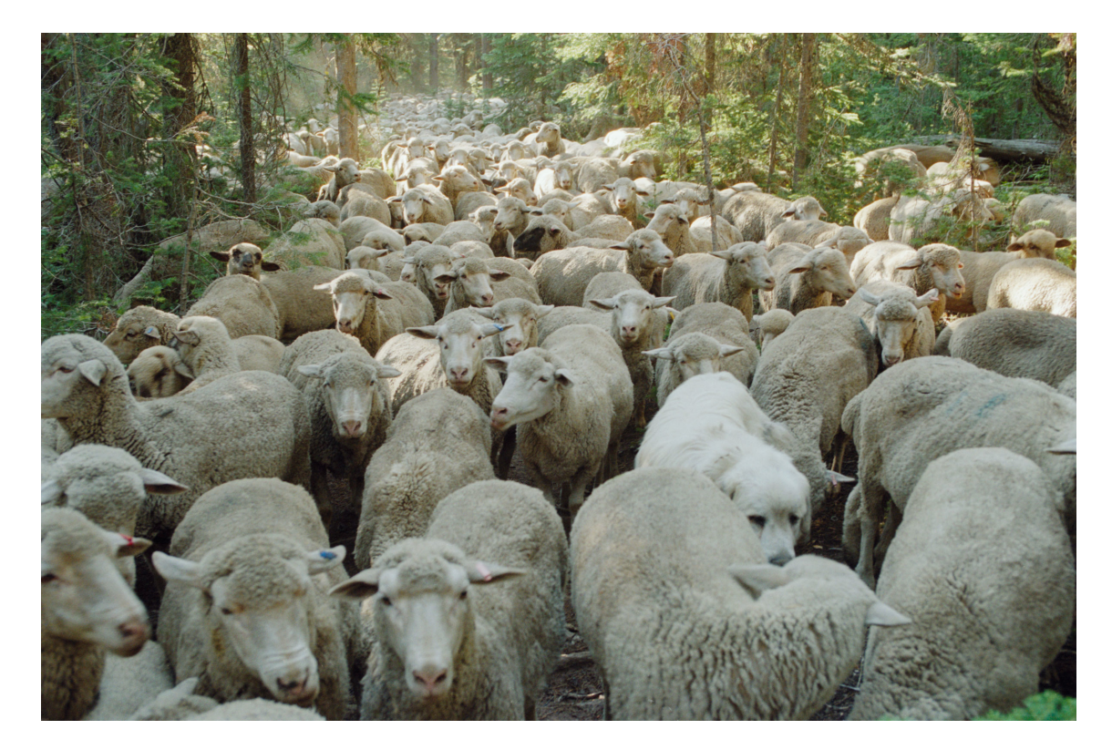
Sweetgrass. 3

Throughout this sequence, the sheep fill the screen and, when watched on the silver screen, dwarf the human viewer: placing the viewer within the herd in this way creates an uncomfortable and somewhat claustrophobic experience. As Grimshaw notes, the sheep remain 'mysterious and resistant to the human gaze' (2011, p.250). The defamiliarised perspective of the sequence simultaneously gestures towards a cross-species encounter and reaffirms the alterity of the sheep, thereby highlighting the human viewer's alienation from them. As such, the film reveals the 'polarization of immersion and alienation as separate reactions'—as a false binary (Hughes, 2014, p.81).