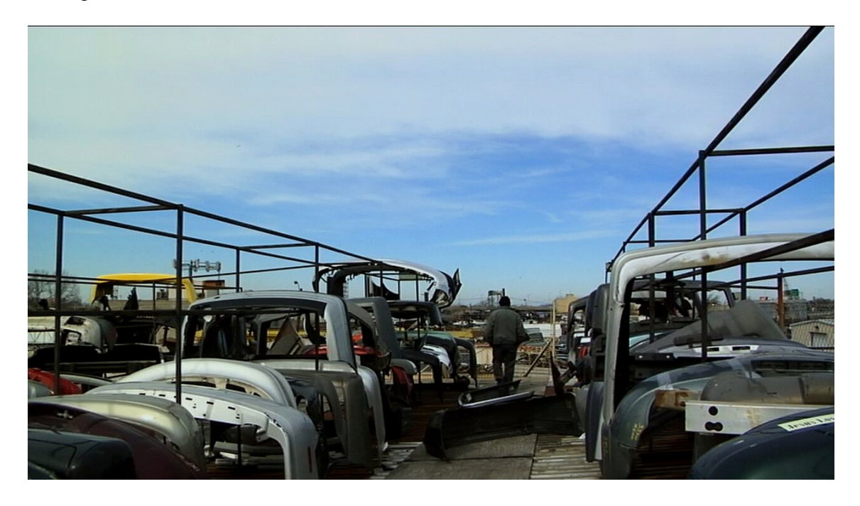
Foreign Parts. 6

Here, the emphasis is even more strongly weighted towards the situation's humanist pathos rather than its posthumanist possibilities. As the junkyard's oldest resident, who has, we later hear, lived at Willets Point all his life, this walk seems to be not only a farewell to a trade but a lifelong home.