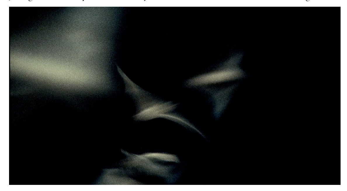
El Mar La Mar. 9

free and uncontrollable. At first, the bats are seen as disconcertingly large shapes against a black background. Their movement makes them so abstracted that they are perceived as blurred, as can be seen in the lack of clarity in the official still below. Only in the second shot is the viewer granted the context of the mouth of the cave and the comfort of seeing the bats at a distance more familiar to observers both on screen and in life. The third and final shot offers an archetypal image of the colony of bats flying out into the sunset: bats stream over the camera, joining the distant shapes that continually form and dissolve like murmurations of starlings.<sup>202</sup>