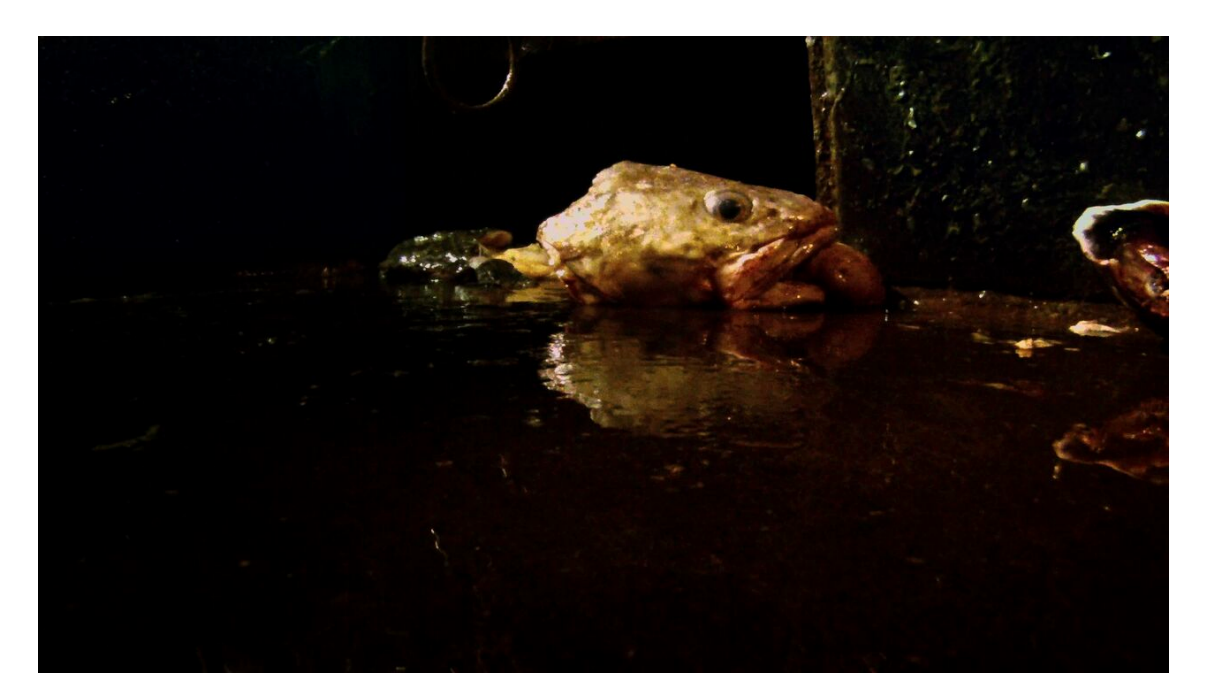
Leviathan. 1

head rolling on deck before finally returning to the ocean through the gunwale at the side of the ship. After being confronted with the mass of dying fish, the focus on this single fish head—removed from its sea, shoal and body—is perceived as uncannily anthropomorphic (see Introduction). The dismembered head's disturbingly life-like movements, the insistence of its gaze, and its repeated 'fail[ure] to leave the stage' (Thain, 2015, p.44) combine to render it an object of combined comedy and pity.