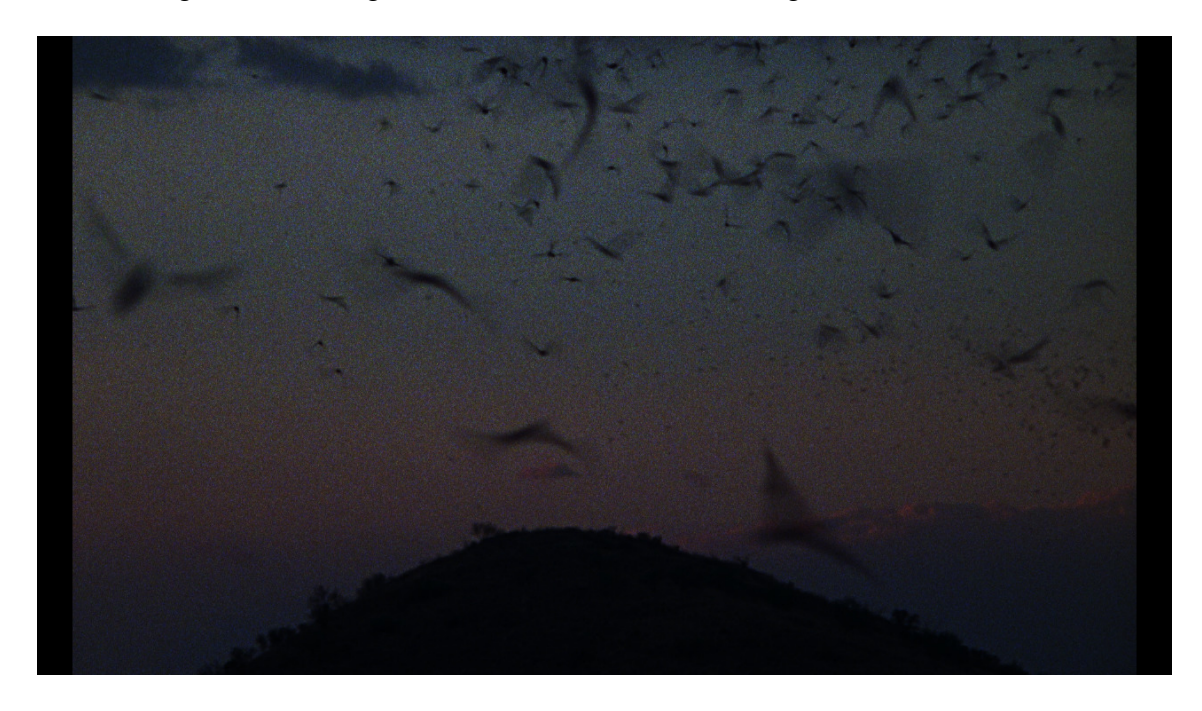
El Mar La Mar. 10

swarm's habitat. The swarmic attribute of dissolution is heightened in this alien enclosure of hollowed rock, challenging the viewer's own sense of boundedness, unity and protection. As the bats leave the cave and fly out into the expanse of the sky, in the second and third shots the camera frames the bats as a singular entity within the screen. This greater distance enables the viewer to regain their bearings and, as such, their sense of ontological control.