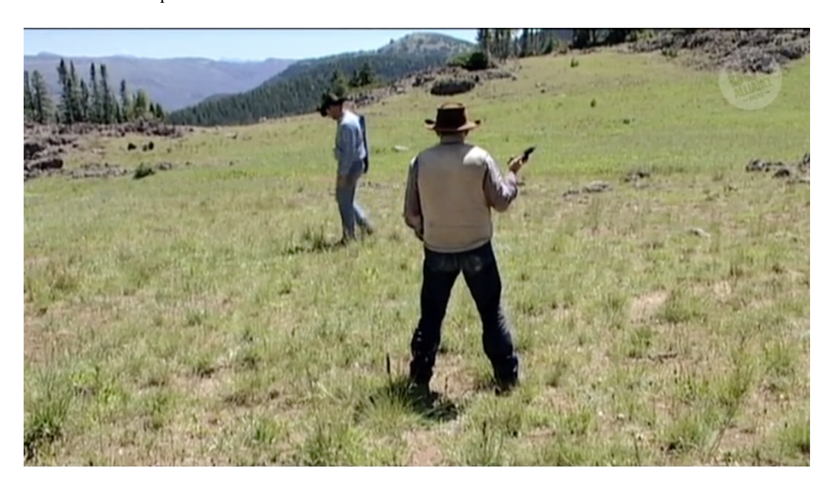
Sweetgrass (1h12) 5

by the film's portrayal) means that the humorous portrayal of the older man's gesture is counterpointed with a recognition of their real concern and the awareness that they are facing real danger. The Western is both invoked and undercut here: the ranchers are closer here to stereotypes of simple shepherds than the heroes of Hollywood's Westerns, and of course they are herders in reality, not actors playing idealised fictional characters. As in Brokeback Mountain , the film uses the pastoral to undercut the Western.