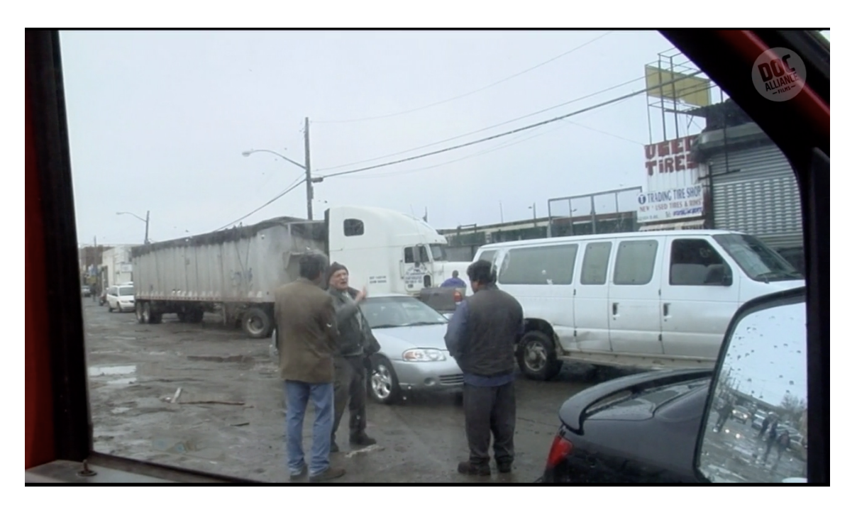
Foreign Parts (46m). 7

Whilst the film in general is edited with hard cuts, these two scenes of desperation are bridged by an unusual continuity cut: before cutting to the outdoor shot of Joe, the camera captures a hazy image of Joe in the van's passenger window and the microphone picks up his muffled voice.