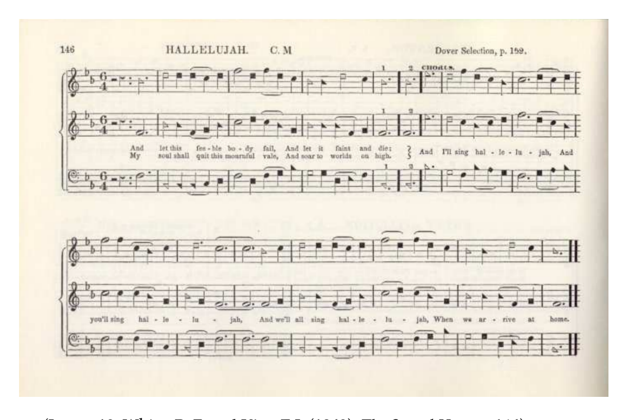
(Image 10: White, B. F. and King E.J. (1860). The Sacred Harp, p.146)

'giving the lesson' — initiates the singing of a particular melody by first instructing the group to turn to the relevant page and then intoning the tonic or 'fa'. Each of the other singers gradually find this unison, and then a first reading of the melody follows, with the singers using sol-fa syllables rather than words. The tempo is set by use of a tactus: members swing their arms in imitation of the leader.