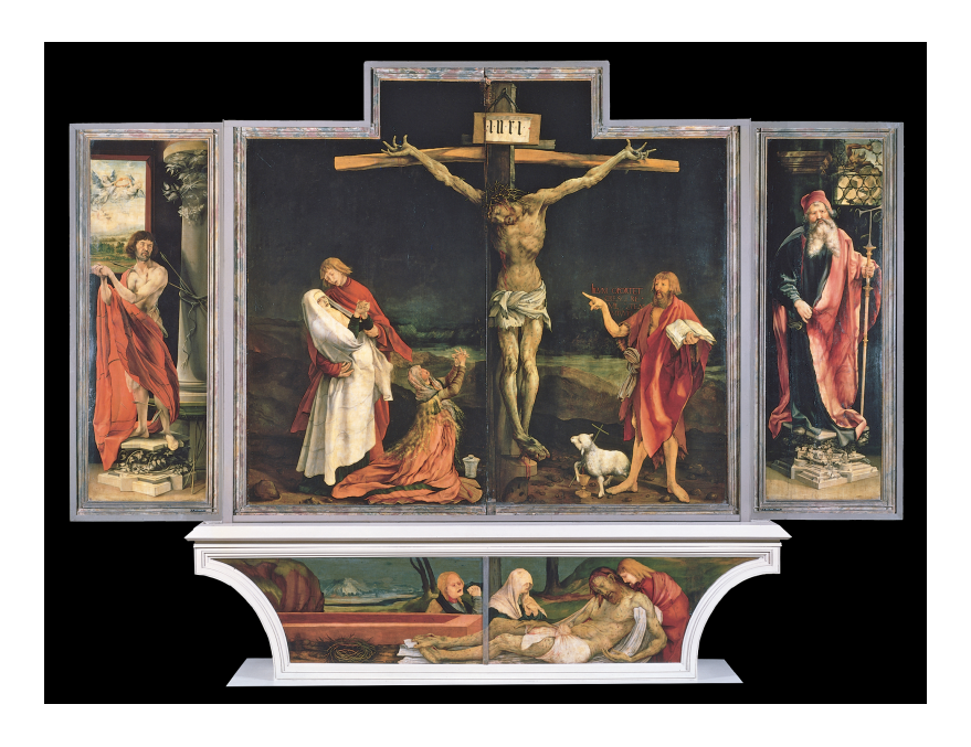
(Image 17: Grünewald, M. (1516). Isenheim Altarpiece . [Altarpiece]. Colmar: Unterlinden Museum)

An example of my attempt to echo Grünewald's practice can be heard at the start of the work. Material associated with the phrase 'Ave Maria, gratia plena, Dominus tecum' is heard at the start of the work in A Major; initially the material is presented by sopranos alone, joined in bars 5 to 8 by altos and basses. At bar 9, a variation on this material is presented, this time in B Phrygian and set for altos, divided tenors and basses. By giving this material to lower voices alone, and by setting it in the Phrygian mode, with its distinctive semitone movement to the second degree of scale, I wanted to give the opening material a much more plangent character, whilst retaining a clear connection to the opening bars through use of the same text and similar gestures. (In the scoring of work from its opening to bar 16 there is an oblique allusion to a work frequently performed at York Minster on Christmas Day, Giovanni Pierluigi da Palestrina's Missa Hodie Christus Natus Est. Palestrina's work is scored for double choir, divided SSAB-ATTB; throughout the work, he contrasts antiphonal writing, making use of the