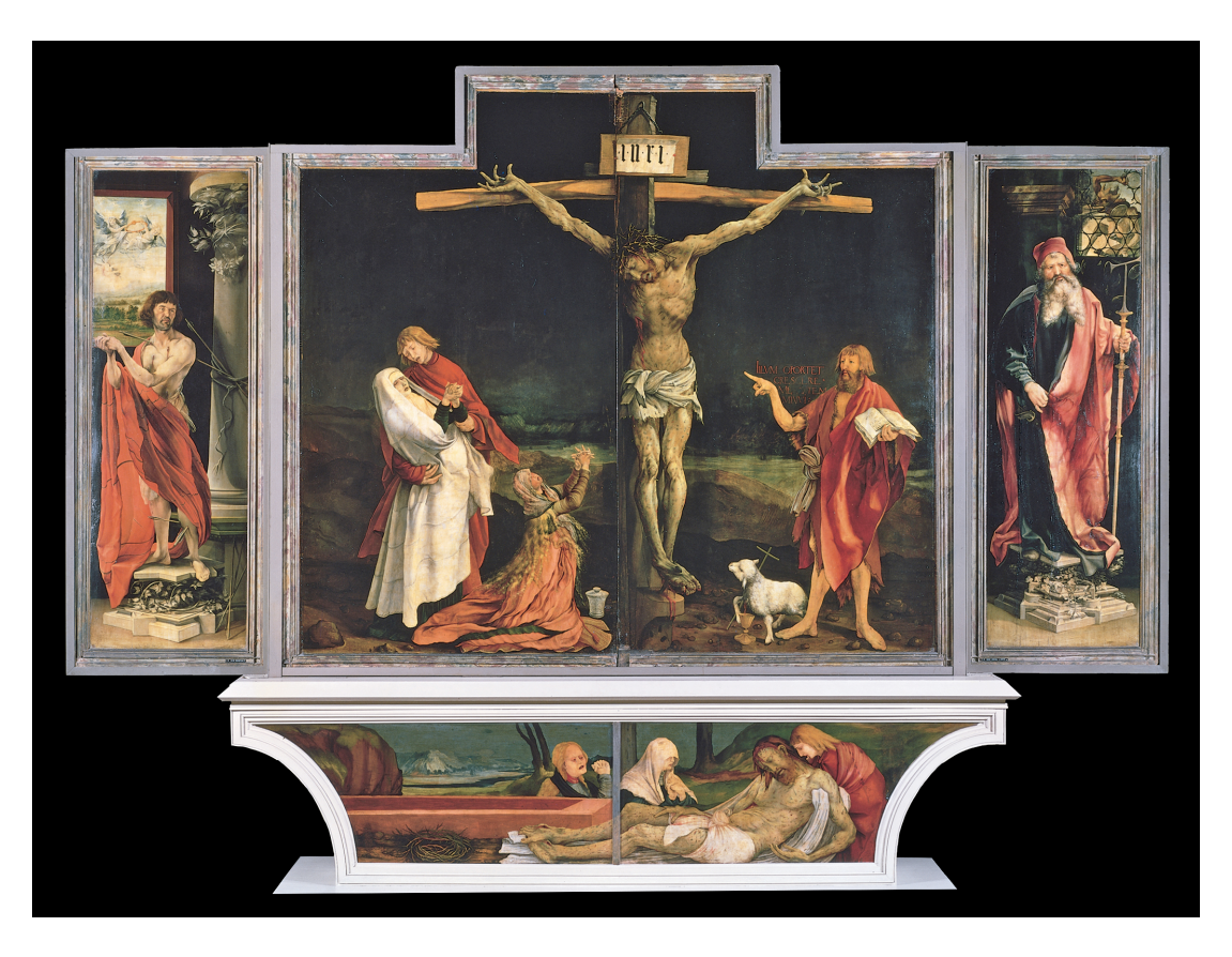
(Image 2: Grünewald, M. (1516). Isenheim Altarpiece . [Altarpiece]. Colmar: Unterlinden Museum)

battle reenactment society the Sealed Knot to recreate a violent clash between miners and police from the 1984 miner's strike (Deller, 2001).