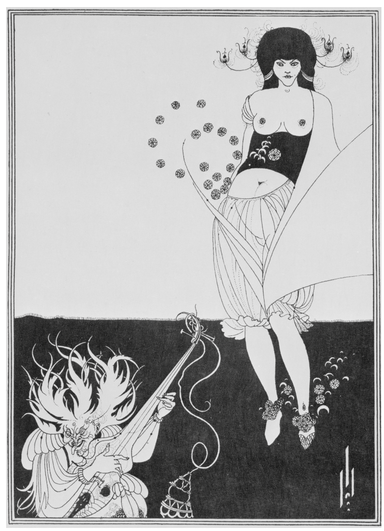
"The Stomach Dance." A Portfolio of Aubrey Beardsley's Drawings illustrating Salomé by Oscar Wilde.