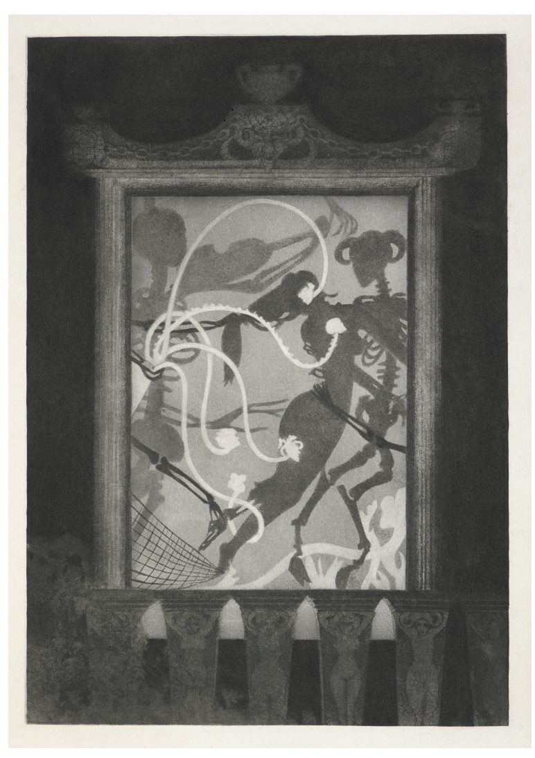
The Harlot's House: A Poem by Oscar Wilde; with Five Illustrations by Althea Gyles. London: Mathurin Press, 1904.