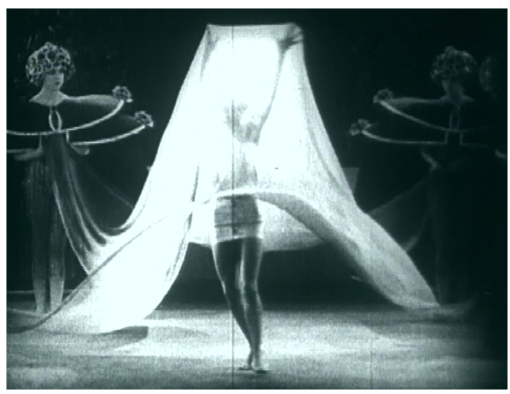
The Dance of the Seven Veils. Salomé. 1923.