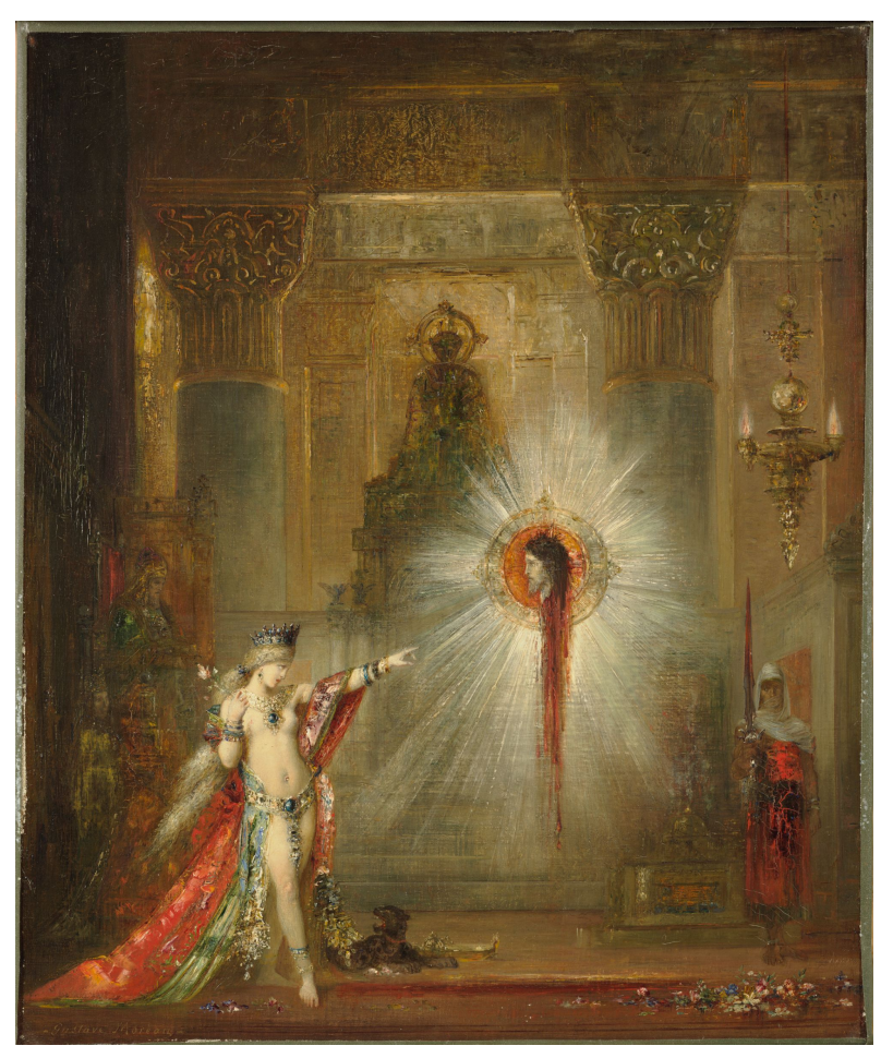
Gustave Moreau, The Apparition (1876-77). Harvard Art Museums/Fogg Museum, Bequest of Grenville L. Winthrop.