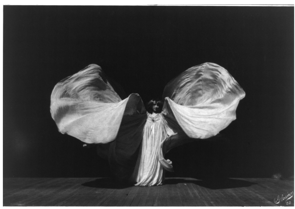
"Loïe Fuller, full-length portrait, standing, facing front; raising her very long gown in shape of a butterfly." ca. 1902. Library of Congress: Prints and Photographs Division. LC-USZ62-90931.