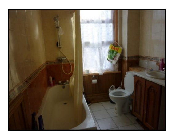
Photo 4: A bathroom in a family's NASS accommodation. Her favourite room, as all the others felt bare and 'dirty'.