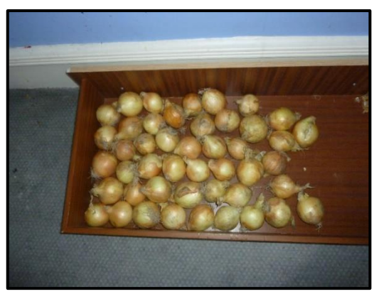
Photo 7: Food from food parcel stored in a bedroom. In the shared house she has to keep her food in her room as she has no cupboard space.

This may, of course, be in part because of the financial limitations of the asylum system (see Chapter 7); however, it is worth considering more broadly why people may not have items in the house from, or which remind them of, their country of origin.