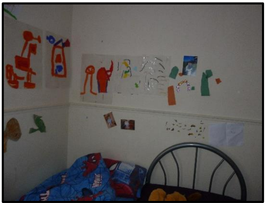
Photo 5: Mother and child shared room in NASS accommodation. She had added the child's pictures to the wall to try and make the room feel better for her child.