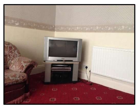
Photo 6: A living room in a family's NASS accommodation. The room has only a sofa and broken TV. The broken TV was in the house when she arrived, and it had made her children sad that it did not work.