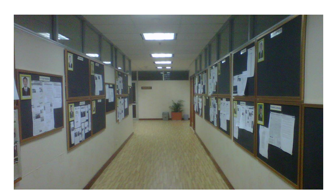
Figure 2 Posters at the PKS office in Parliament House (DPR), Jakarta

held by other dakwah institutions (such as the Muhammadiyah and the NU) to help me to understand the distinctive role that the Tarbiyah movement/PKS plays in the wider context of dakwah in Indonesia. Observations were also made during my visit to the headquarters of PKS (DPP-PKS) and at the PKS fraction office at Parliament House, for instance, checking their posters and flyers on upcoming events and the newspaper coverage of their previous dakwah activities. 92