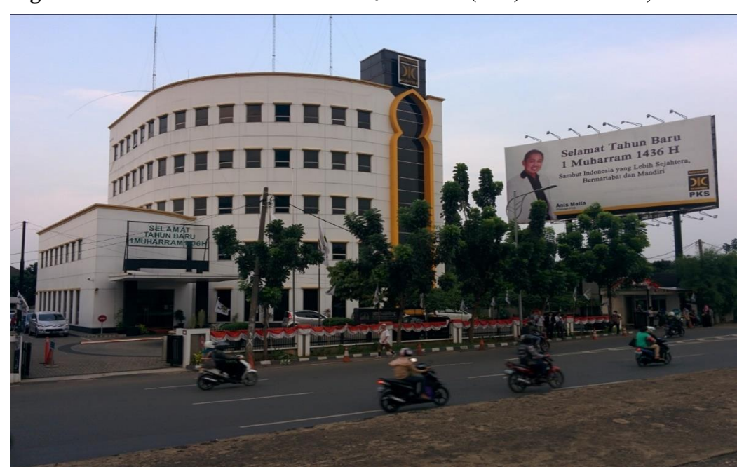
Figure 1 The dakwah centre or Markaz Dakwah (MD) of DPP-PKS, Jakarta

insights not only into my research themes but also into practical issues based on their research experience. It was easier to make appointments with scholars and exLiqo trainees as they responded positively after initial contact was made via email or Short Messages Services (SMS).