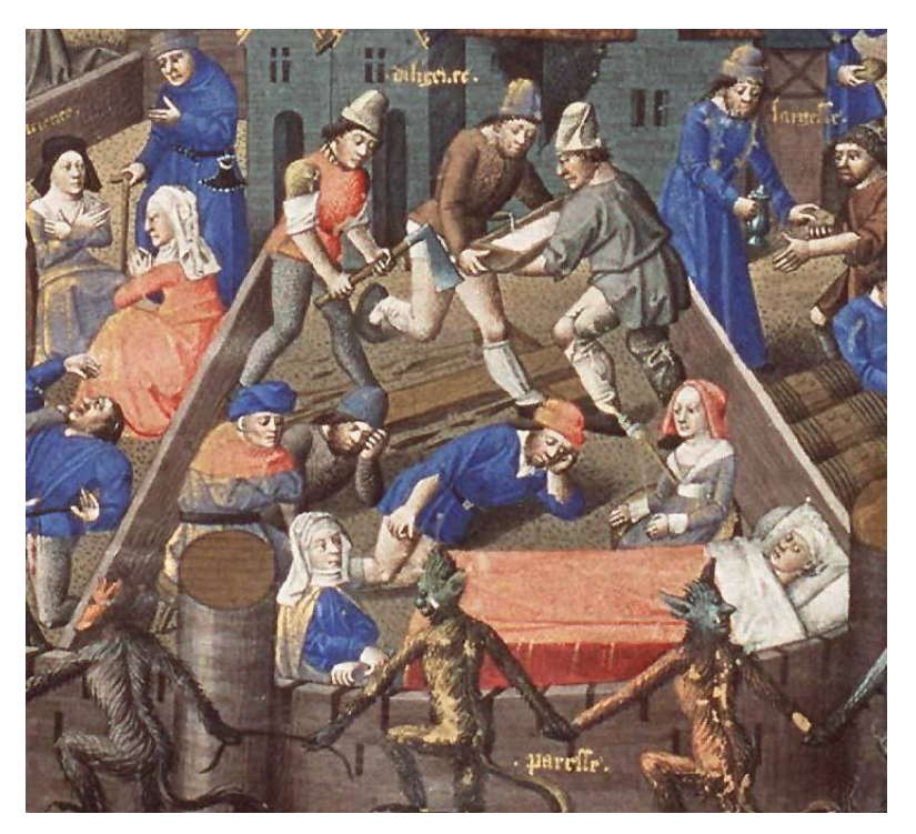
Figure 5: The Heavenly City and the Earthly City (c. 1475)<sup>89</sup>

Handlyng Synne includes 'Daunces, karolles, somur games' in its list of sinful, idle activities. These are also seen as leisure pursuits of both young men and women.