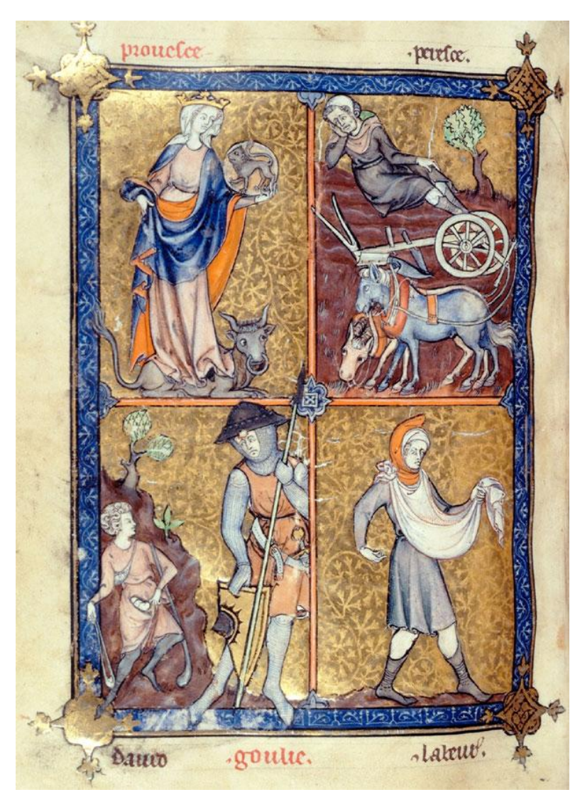
Figure 10: British Library, Add. 54180, f.121v

In this 1294 manuscript of the Somme le Roi , the above image appears opposite a discussion of the virtue prowess.<sup>4</sup> The page is separated into four compartments. The top right section is labelled prowess and contains a woman standing atop a bull and holding a medallion emblazoned with a lion. Below her we have an image of David armed with his slingshot against Goliath. However, what makes this image important to the current discussion are the compartments on the right-hand side. On the bottom right section, which is labelled ' labeur ', a worker spreads seeds on a golden rinceau, a pattern of intertwined foliate branches. The same pattern also adorns the other images of the folio. However, the top right compartment, labelled ' peresce ' or idleness, is dominated by the brown and comparatively unproductive earth. Here, a peasant has abandoned his plough, his