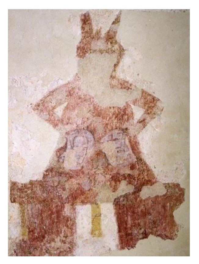
Figure 7: The Warning Against Idle Gossip, Slapton, Northants (Fourteenth Century)<sup>102</sup>