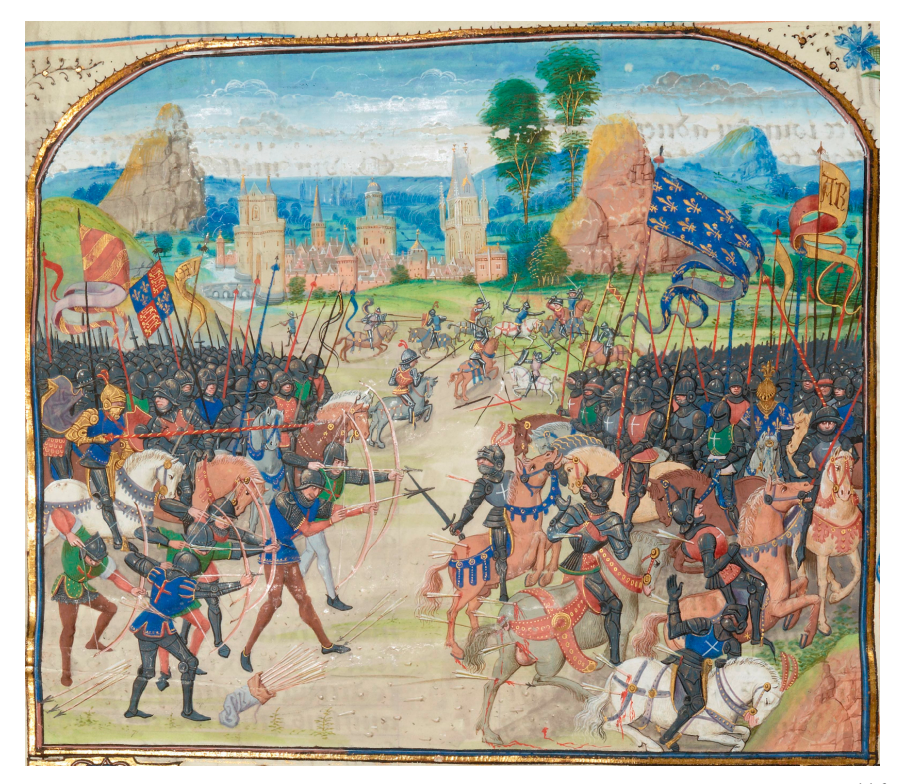
Figure 9: Battle of Poitiers from Froissart's Chronicle (c. 1470-5)<sup>116</sup>

Archers were of different ranks, some on foot while others were mounted and some wearing armour or even in possession of heraldry.<sup>117</sup> In 1363, King Edward III sent a letter to his sheriffs throughout England to encourage the pursuit of archery among all members of society 'nobles as well as commoners':