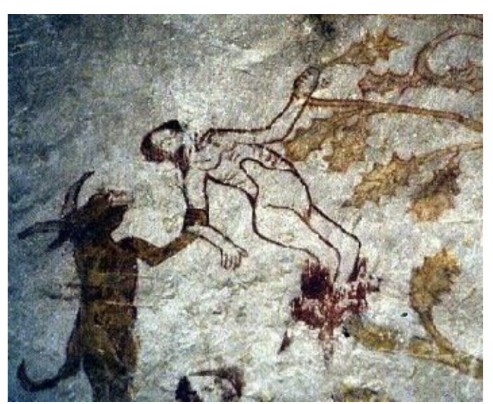
Figure 2: The Seven Deadly Sins, Cranborne, Dorset (c. 1400)<sup>56</sup>

slimed yes [eyes]<sup>2,52</sup> The 'byslobered' description of Sloth also reflects his having just awoken. This image of Sloth as a slumberer is reinforced, for if Sloth attempts to give confession standing up he falls back asleep and therefore needs to sit or kneel to do so.<sup>53</sup> John Mirc's Instructions for Parish Priests (early-fifteenth century) sheds some light on Sloth's standing position. 'No none in chyrche stonde schal, / Ne lene to pyler ny to wal, / But fayre on kneus þey schule hem sette, / Knelynge doun vp on the flette'.<sup>54</sup> When a person is standing they are not fully engaging and showing reverence to God. When Sloth is standing he is not engaged in devotion and falls asleep. Instructions for Parish Priests goes on to comment that men and women should kneel when making confession. However, the action of sleeping itself conflicts with the attention and engagement which should be aimed at God. Instructions for Parish Priests asks: 'Haste þow be slowe for to here / Goddes serues when tyme were? / Hast þou come to chyrche late / And spoken of synne by þe gate?<sup>55</sup>