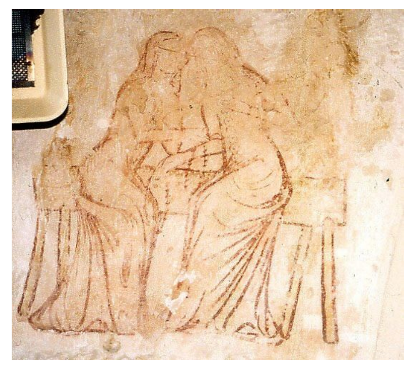
Figure 6: Warning Against Idle Gossip, Little Melton, Norfolk (Fourteenth Century)<sup>101</sup>

discredits female voices.<sup>99</sup> Sloth, represented as speaking out of turn in church, is also seen in one of the exempla of Jacob's Well. In the exemplum, a sculpture of Christ on a cross comes to life and covers his ears to block out the jangling of the parishioners during the mass.<sup>100</sup> This exemplum is followed by a story of a hermit whose steps in the desert are counted by an angel who explains that the idle words said in holy church are collected by the devil. This creates a sense of devotional capital where one must produce a higher number of good works in order to enter heaven. The bad deeds, such as idle words in church, will be subtracted from this amount and will have to be redeemed in purgatory or be punished in hell. The parishioner heard and saw these images within the context of the church space, highlighting the immediate and present danger to the soul.