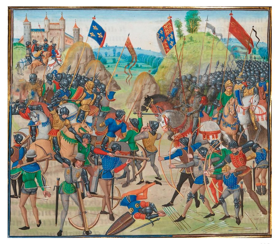
Figure 8: Battle of Crecy from Froissart's Chronicle (c. 1470-5)<sup>115</sup>

(1356) and Agincourt (1415). Figures 8 and 9 are late-fifteenth century depictions of the Battles of Crécy and Poitiers. Both show English longbowmen successfully overpowering both the French crossbowmen and the armed cavalry.