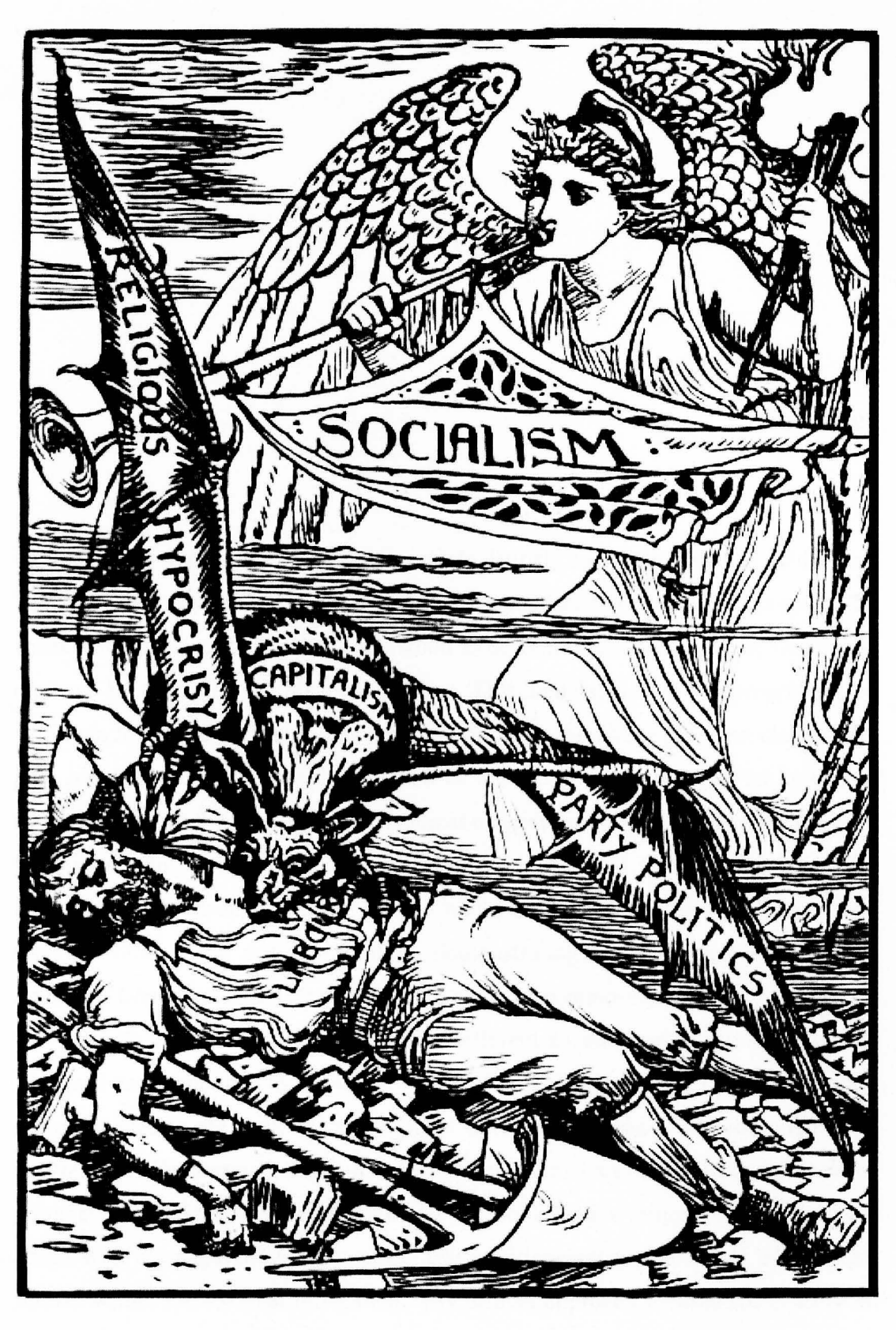
Walter Crane 'The Vampire' Supplement to Justice (22 August 1885)